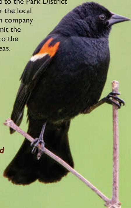
A male red-winged blackbird

When developers in the 1980s wanted to build homes in the area, the East Bay Regional Park District and surrounding communities advocated for the preservation of the scenic ridgelines and the rare endemic plant life. The unique natural area was donated to the Park District in 1985 after the local construction company agreed to limit the subdivision to the low-lying areas.