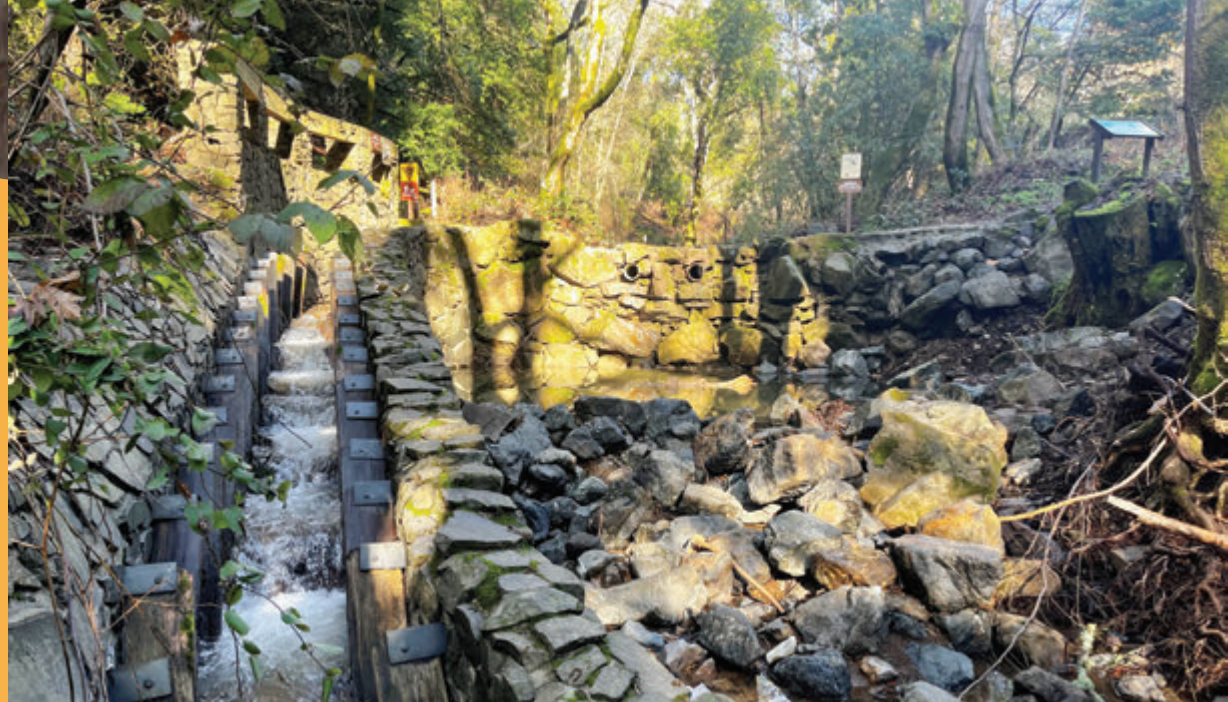
Native trout use a constructed fish ladder to seasonally migrate up Redwood Creek.

R einhardt Redwood Regional Park is one of the most majestic parks in the East Bay. Located just a few miles from downtown Oakland, it contains a stately redwood forest, the largest remaining natural grove of coast redwoods ( Sequoia sempervirens ) in the region.