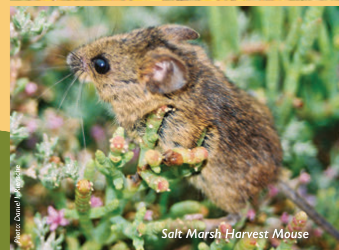
Salt Marsh Harvest Mouse