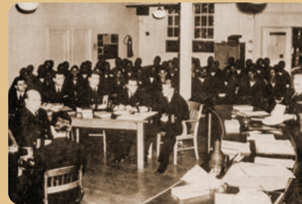
Port Chicago 50's court-martial, September 14, 1944.

Following the explosion, the surviving African American sailors did not receive any of the bereavement leave given to the white officers. Instead, within three weeks, they were ordered back to work loading munitions at the Mare Island Munitions Depot in Vallejo. There had been no change in work safety conditions or further training. Many of the sailors refused out of fear for their lives, creating a significant work stoppage at a critical time during the war. Ultimately, 50 sailors were charged with mutiny and court-martialed following their refusal to load munitions. The trial that followed brought to light the discriminatory Jim Crow practices and racial prejudice that existed within the Navy and across the entire Armed Services. These events are now recognized as an early battle in what would become the Civil Rights Movement.