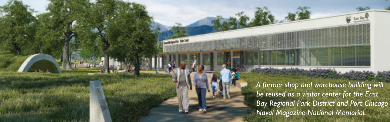
A former shop and warehouse building will be reused as a visitor center for the East Bay Regional Park District and Port Chicago Naval Magazine National Memorial.