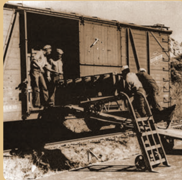
US Navy sailors loading munitions.

On July 17, 1944, 320 men lost their lives and 390 more were injured in an enormous munitions explosion at Port Chicago Naval Magazine during World War II. At Port Chicago, only African American sailors loaded munitions onto the ships;