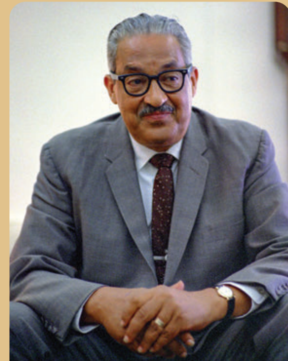
Thurgood Marshall (1908-1993)

NAACP civil rights lawyer Thurgood Marshall helped defend the 50 black sailors accused of mutiny in the aftermath of the devastating Port Chicago explosion. The military trial took place on Treasure Island in nearby San Francisco Bay from September 14 to October 24, 1944. Marshall made a point of holding press conferences outside of the courtroom to keep the American public updated about the trial and the miscarriage of justice occurring within. Although the 50 sailors were quickly found guilty and sentenced to 8-to-15-year prison terms, Marshall's subsequent high-profile appeal paved the way for the desegregation of the entire U.S. military. Marshall went on to argue the landmark case Brown v. Board of Education (1954), which led to school desegregation nationwide, and became the first black U.S. Supreme Court Justice in 1967.