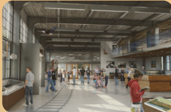
The visitor center and interpretive features throughout the park will tell the history of the site and the people who lived, worked, and were impacted by actions there.