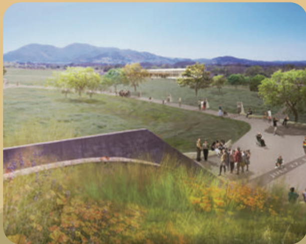
Some existing weapons magazines will be retained at the park for interpretive and recreational uses.