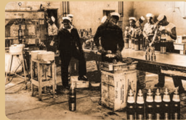
Sailors building munitions.

all facilities and duties were racially segregated, reflecting the Navy's discriminatory practices of the time. The men received little or no training in their duties, while their white officers pushed them to work at unreasonably fast rates. It was only a matter of time before the inevitable happened: that night, while two ships were being loaded simultaneously, an unknown event caused two explosions. Both ships were destroyed and many of the men were vaporized without a trace. It was the largest Home Front disaster of World War II.