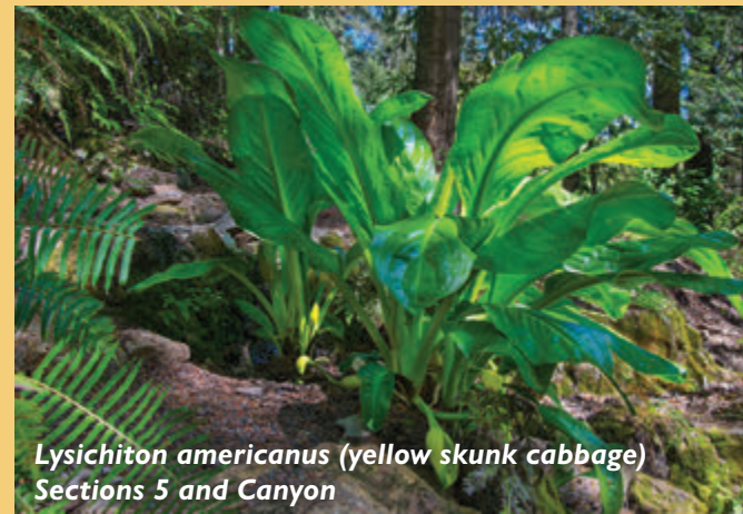
Lysichiton americanus (yellow skunk cabbage) Sections 5 and Canyon