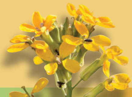
Erysimum capitatum (western wallflower)

For more information on the Botanic Garden, see nativeplants.org .