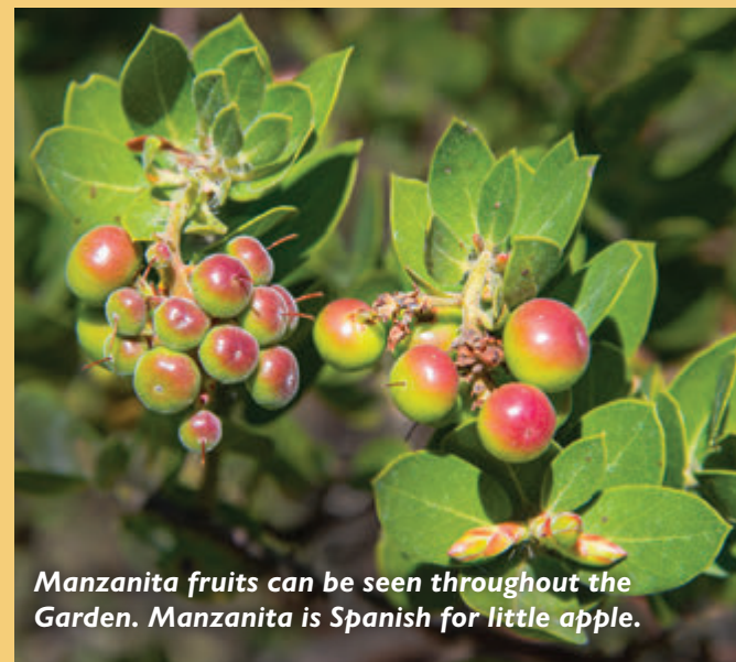
Manzanita fruits can be seen throughout the Garden. Manzanita is Spanish for little apple.