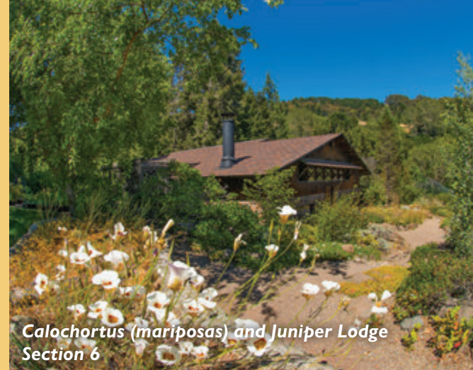
Calochortus (mariposas) and Juniper Lodge Section 6

Garden tours for groups are available by appointment. In addition, free tours start at the Visitor Center on most Saturdays at 2 p.m.; Sundays at 11 a.m. and 2 p.m. Please call 1-888-327-2757, option 3, ext. 4507, to confirm weekend tours and for group tour appointments.