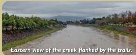
Eastern view of the creek flanked by the trails.

Please respect private property of households along the trail.