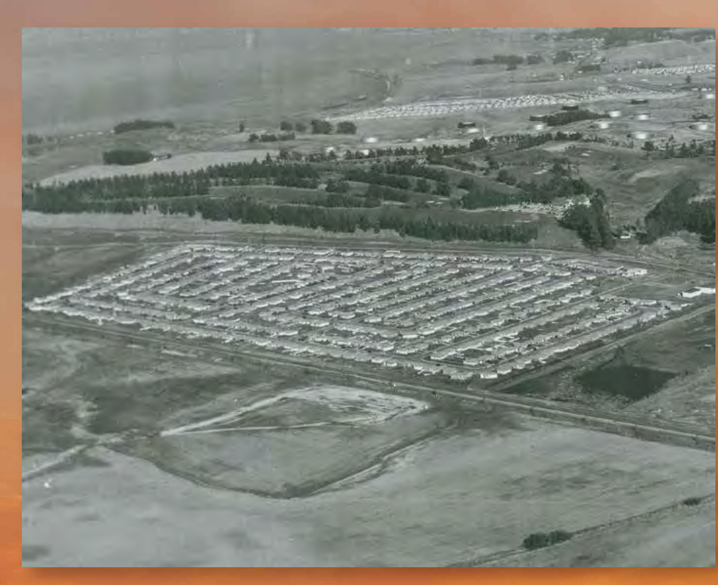
1950s aerial view of Parchester Village