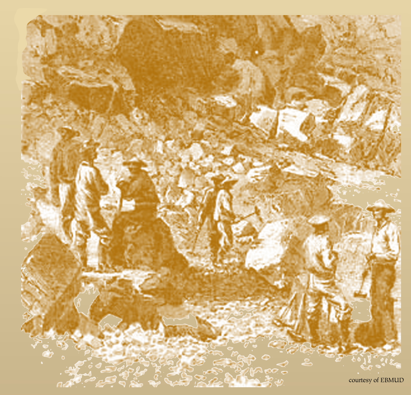
The Chinese laborers employed techniques similar to those used in building the Transcontinental railroads.