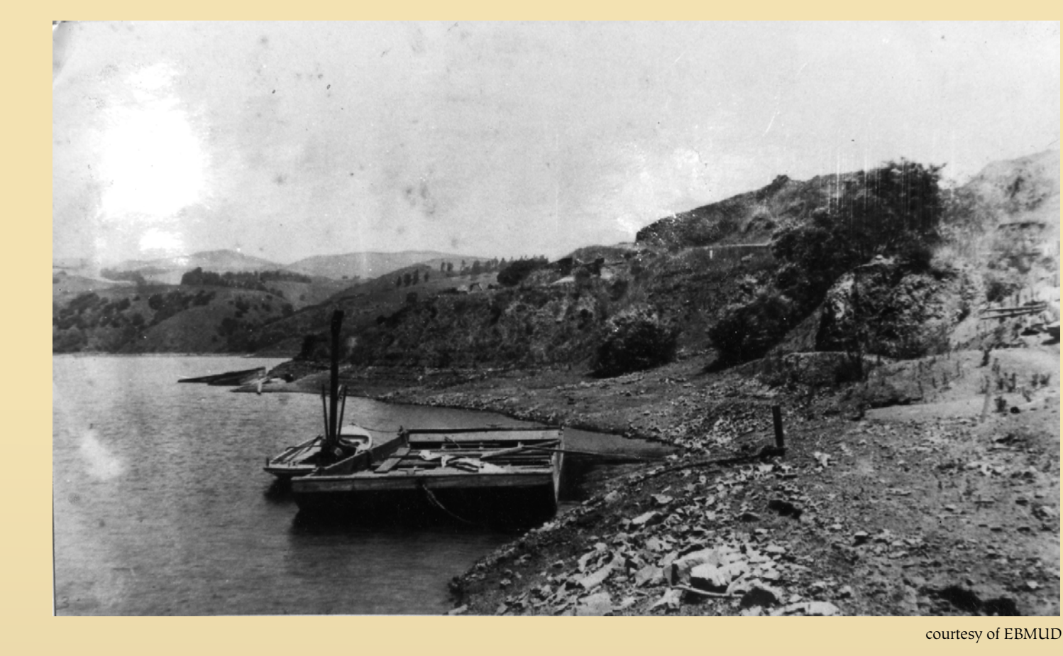
The hand cut stone used for the tunnel was quarried from creeks nearby and pulled by steamboat on a barge like the one above.

Chinese laborers built Lake Chabot with back-breaking labor. Belatedly, we honor their significant contributions to the historic legacy of California.