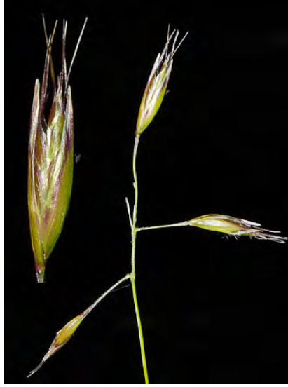
CALIFORNIA OAT GRASS (Danthonia californica) Native Perennial - Grass Family - (Apr–Aug) - Gen moist meadows, open woodland - Stem 12-52" tall. Flower cluster 0.8-2.4" long. Spikelets 3-6, 0.5-1" long, awn 0.16-0.5" long.