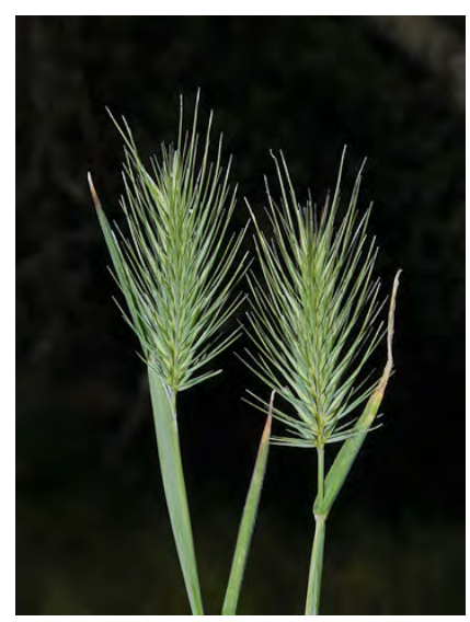
MEDITERRANEAN BARLEY (Hordeum marinum subsp. gussoneanum) Naturalized Annual - Grass Family - (Apr-Jun) - Dry to moist, disturbed sites - Stem 4-20". Leaf blades to 32" long, auricles < 0.08". Central lemma awn 0.25-0.7" long. INVASIVE weed.