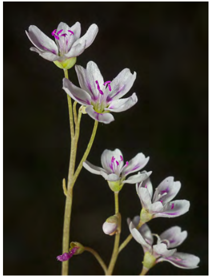
SANTA LUCIA CLAYTONIA (Claytonia gypsophiloides) Native Annual - Miner's Lettuce Family - (Mar–May) - Moist, bare, often stony sites, in sun or shade, often serpentine - Stem 1-10". Leaf linear. Flowers 3-30. Petals 0.2-0.3", white to pink. Seeds dull.