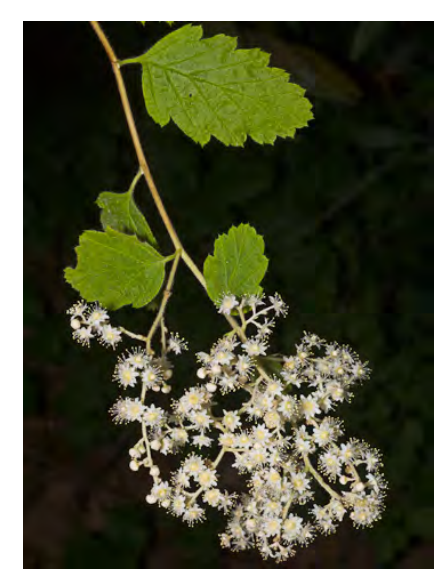
OCEANSPRAY (Holodiscus discolor var. discolor) Native Perennial - Rose Family - (May-Aug) - Moist woodland edges, rocky slopes - Shrub 5-20' tall. Leaf blade 0.6-3.1" long, toothed at end. Flower cluster 0.8-10" long. Petals white, ~0.07" long.