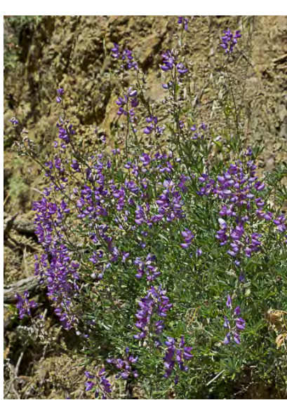
BAY AREA SILVER LUPINE (Lupinus albifrons var. collinus) Native Perennial - Pea Family - (Mar–Jun) - Cliffs, forest openings - Subshrub 8-16" tall, woody only at base, silvery. Flowers 0.35-0.6" long, violet to lavender.