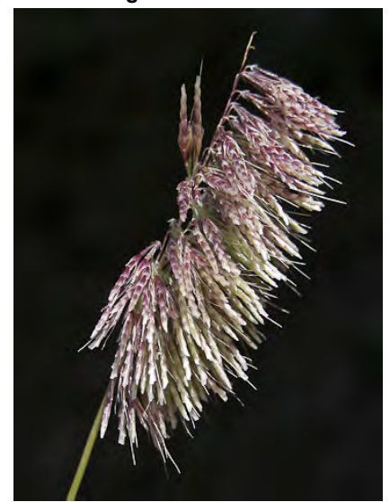
GOLDENTOP (Lamarckia aurea) Naturalized Annual - Grass Family - (Feb-May) - Open ground, moist seeps, rocky hillsides, sandy soil - Stem 2.8-16" long. Flower cluster golden-yellow to purple, dense, 1-sided, 0.8-3.1" long. Fertile flower awns ~0.25" long.