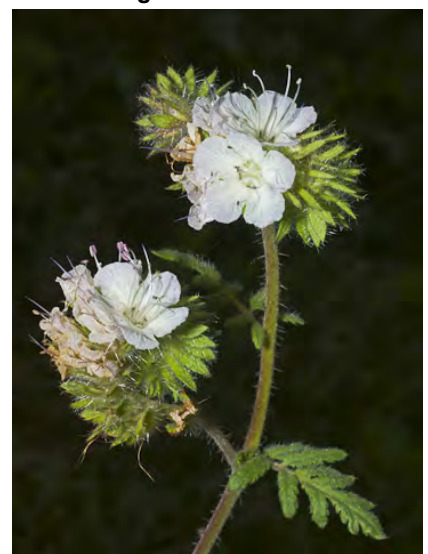
BRANCHED PHACELIA (Phacelia ramosissima) Native Perennial - Borage Family - (Apr-Oct) -Diverse habitats incl salt marshes, canyons -Plant 1-5' tall. Leaves divided. Flowers 0.2-0.3" long, white to lavender. Seeds 2-4.