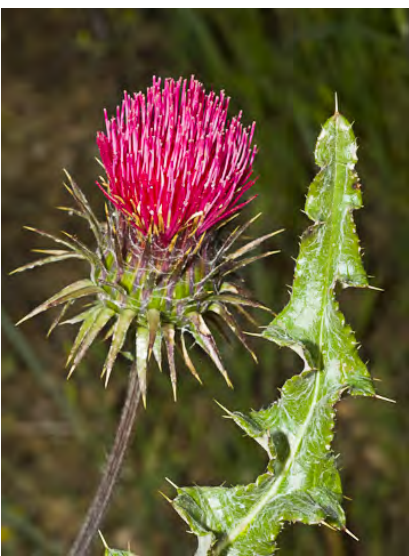
VENUS THISTLE (Cirsium occidentale var. venustum) Native Biennial - Sunflower Family - (May-Jul) - Disturbed areas, grassland, woodland - Plant 1.6-9.8' tall. Head bract cluster 0.6-2" tall, 0.6-3" diam. Flowers gen bright red-pink to red, 0.9-1.4" long.