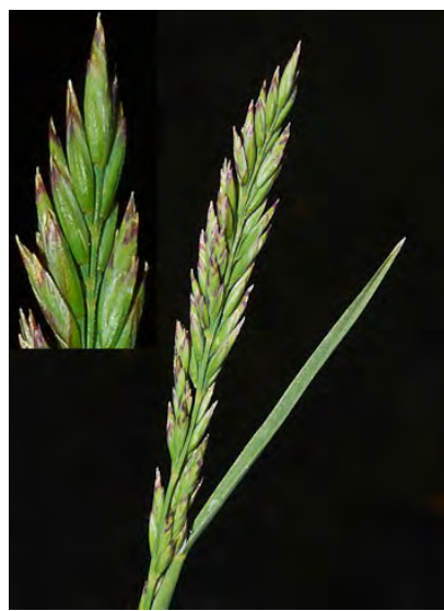
JUNE GRASS (Koeleria macrantha) Native Perennial - Grass Family - (May–Jul) - Dry, open sites, clay to rocky soils, shrubland, woodland, conifer forest - Stem 8-32" long. Flower cluster condensed, shiny, branches short-hairy. Spikelet ~0.2" long, no awns.