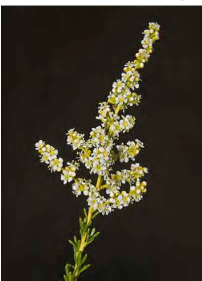
CHAMISE (Adenostoma fasciculatum var. fasciculatum) Native Perennial - Rose Family - (May-Jun) - Dry slopes, ridges, chaparral - Shrub or small tree < 13' tall. Flowers cream to white. Leaves narrow, shiny with flammable oils in warm weather.