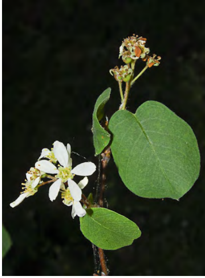
SIERRA PLUM (Prunus subcordata) Native Perennial - Rose Family - (Mar–May) - Mixed-evergreen or conifer forest - Shrub < 10'. Leaf: stem 0.16-0.6", blade 1-2", elliptic to wide egg-shaped, base round heart-shaped, tip round. Petals 0.2-0.4" long, white.