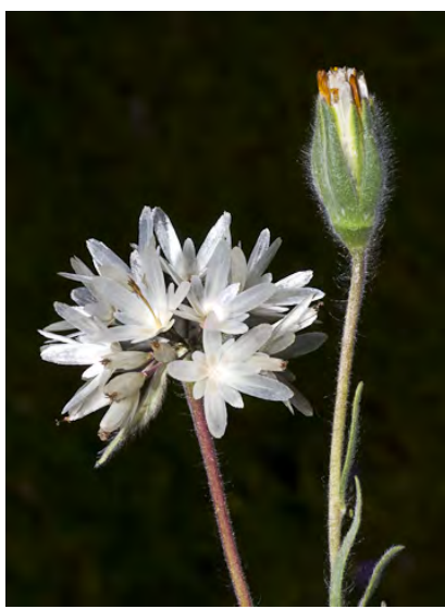
BLOW WIVES (Achyrachaena mollis) Native Annual - Sunflower Family - (Mar–Jun) - Common. Grassy sites, often clay soils - Plant 2-24" tall, soft-hairy. Flowers yellow turning red, 0.1-0.5" wide, extend < 0.1" beyond green bracts. Showy, flat scales attached to seeds.