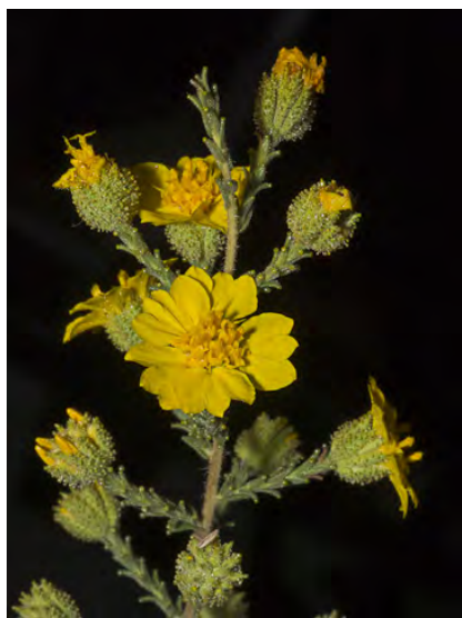
HEERMANN TARPLANT (Holocarpha heermannii) Native Annual - Sunflower Family - (May-Nov) - Grassland - Plant 0.2-1.2 m tall, densely very-short-hairy, glandular. Ray flowers 3-13, yellow. Disk flowers yellow to brown. Yellow