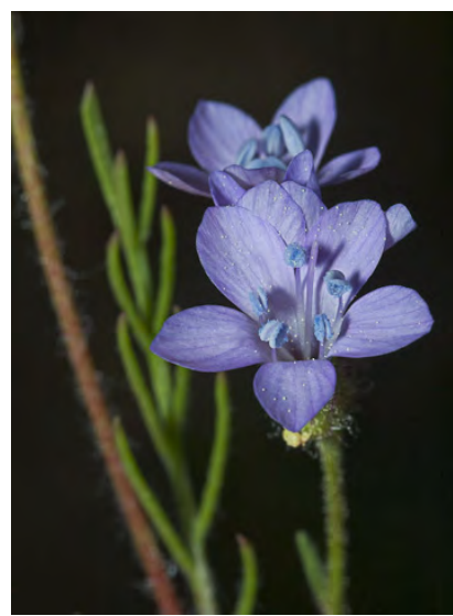
MANY-STEM CALIFORNIA GILIA (Gilia achilleifolia subsp. multicaulis) Native Annual - Phlox Family - (Feb–Jun) - Open or shaded, gen grassy places, sandy or rocky soil - Leaves linear-lobed. Flowers white to lavender, 0.2-0.4" long, not in heads.