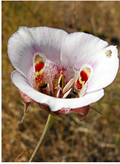
WHITE BUTTERFLY MARIPOSA LILY (Calochortus venustus) Native Perennial - Lily Family - (May-Jul) - Sandy (often granitic) soil in grassland, woodland, yellow-pine forest - Flowers white w/square yellow nectary; 2 red patches above. Petals 1.2-2" long.