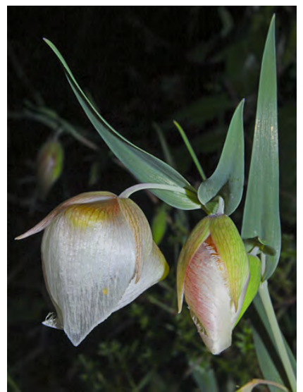
WHITE GLOBE LILY (Calochortus albus) Native Perennial - Lily Family - (Apr-Jun) - Common. Shady to open woodland, scrub - Stem 2-8 dm. Leaves grasslike. Flowers 2-many, hanging, closed at tip. Sepals 10-15 mm. Petals white to pink, 20-25 mm long.