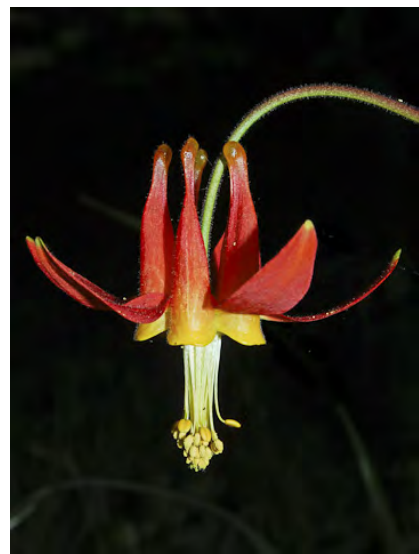
CRIMSON COLUMBINE (Aquilegia formosa) Native Perennial - Buttercup Family - (Apr—Sep) - Streambanks, seeps, moist places, chaparral, oak woodland, mixed-evergreen or conifer forests - Flowers about 2" long, yellow with red sepals &