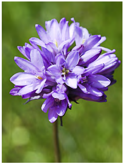
FORK-TOOTHED OOKOW (Dichelostemma congestum) Native Perennial - Brodiaea Family - (Apr-Jun) - Open woodland, grassland - Plant 12-35" tall. Flowers blue-purple, narrowed above ovary. Stamens 3. Late spring bloomer.