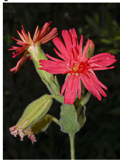
CALIFORNIA PINK (Silene laciniata subsp. californica) Native Perennial - Pink Family - (Spring-summer) - Chaparral, oak woodland, conifer forest, serpentine or not - Plant 8-28" tall. Petals 0.5-1" long, bright red.