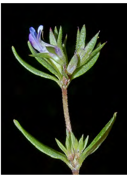
BLUE-EYED MARY (Collinsia parviflora) Native Annual - Plantain Family - (Mar–Jul) - Common. Moist, ± shady places, montane - Plant 1-16" tall. Flowers 0.16-0.3" long; tube, throat and upper lip white; lobes gen blue; hidden in upper leaves.