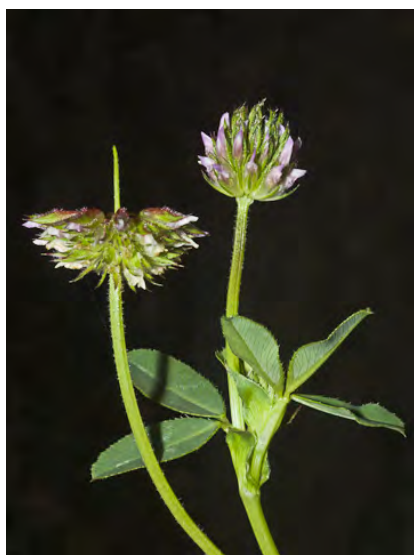
PINPOINT CLOVER (Trifolium gracilentum) Native Annual - Pea Family - (Mar—Jun) - Open, disturbed places, occas serpentine - Leaflet tips not deep-notched. Reflexed pink-purple flowers w/point. Flower bracts completely smooth.