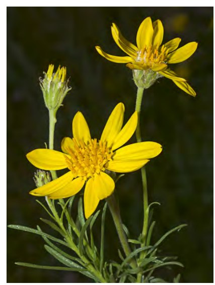
INTERIOR GOLDENBUSH (Ericameria linearifolia) Native Perennial - Sunflower Family - (Mar–May) - Dry slopes, valleys, foothill and desert woodland, saltbush and creosote-bush scrub - Shrub/subshrub, 16-60". Heads large, yellow, solitary; rays 0.3-0.8" long.