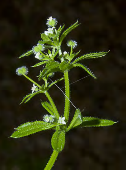
GOOSE GRASS (Galium aparine) Native Annual - Madder Family - (Apr-Jun) - Grassy, ± shady places - Stem 12-35" long, weak, brittle. Leaves 0.5-1.6" long, in whorls of 6-8. Flowers white, 4-lobed. Fruits covered w/short, hooked hairs.