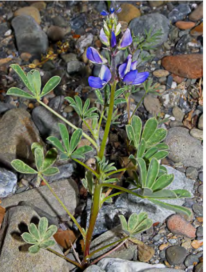
ARROYO LUPINE (Lupinus succulentus) Native Annual - Pea Family - (Feb-May) - Abundant. Open or disturbed areas, often seeded on roadbanks - Plant 8-40" tall, fleshy, sparsely hairy. Flowers 0.5-0.7" long, whorled, gen blue-purple, petal claws short-hairy.