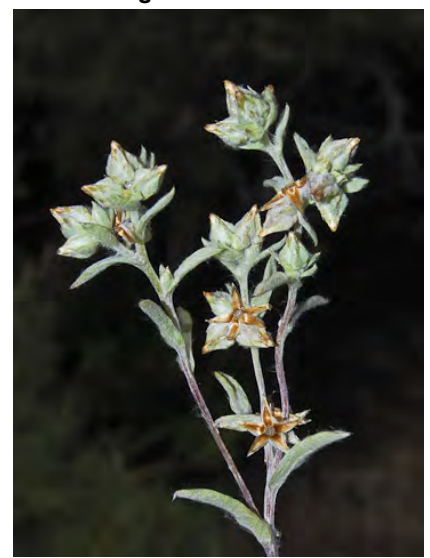
DAGGERLEAF COTTONROSE (Logfia gallica) Naturalized Annual - Sunflower Family - (Mar-Jul) - Bare or grassy openings, burns - Plant 1-20" tall, gen cobwebby. Leaves awl-shaped, stiff, > flower heads. Flowers brown to yellow.