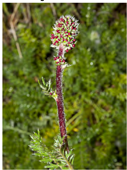
CALIFORNIA ACAENA (Acaena pinnatifida var. californica) Native Perennial - Rose Family - (Mar–May) - Coastal grassland, open, rocky slopes - Stem 4-24" long. Flowers with no petals and purple-black stamens. Leaves finely divided.