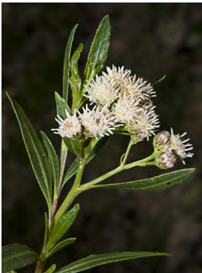
MULE FAT (Baccharis salicifolia subsp. salicifolia) Native Perennial - Sunflower Family - (All year) - Riparian woodland, canyon bottoms, disturbed sites, often forming thickets - Shrub < 13' tall, often sticky. Leaves to 6" long, with 1-3 main veins.