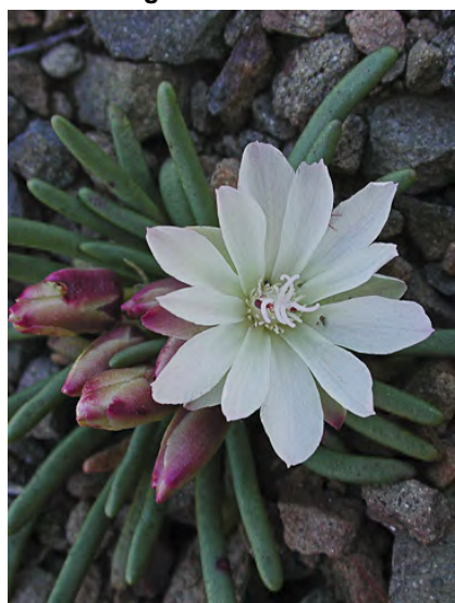
BITTER ROOT (Lewisia rediviva var. rediviva) Native Perennial - Miner's Lettuce Family - (Mar–Jun) - Rocky, sandy ground, open conifer woodland, scrub - Flower stalks 0.4-0.6" long. Leaves linear. Petals gen white to pink, 10-19, 0.7-1.4" long. Bracts 0.6-1" long.