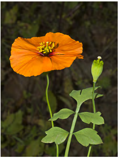
WIND POPPY (Papaver heterophyllum) Native Annual - Poppy Family - (Apr–May) - Grassy areas, openings in chaparral - Plant 1-2', yellow sap. Petals orange-red, 0.4-0.8" long. Stigma spherical on slender style.