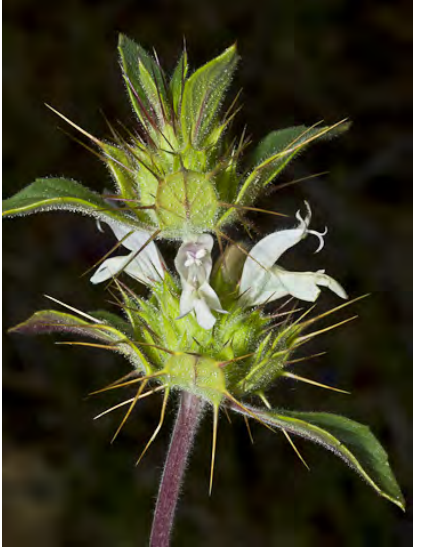
SANTA CLARA THORNMINT (Acanthomintha lanceolata) Native Perennial - Mint Family - (Mar–Jun) - Arid, rocky slopes, openings in scrub or woodland, gen on serpentine - Plant 4-12" tall, soft hairy, ill-smelling, spiny. CNPS: WATCH LIST.