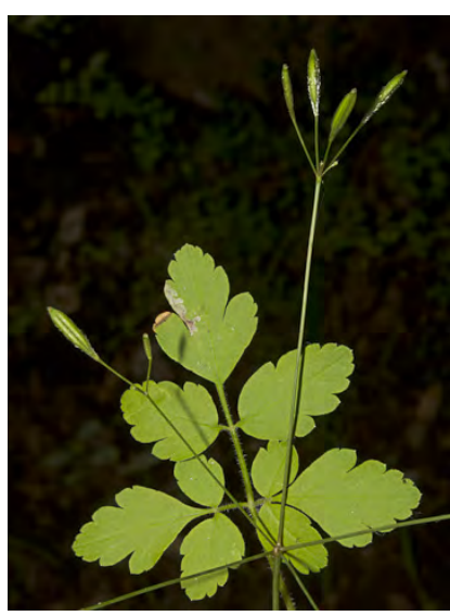
SWEET-CICELY (Osmorhiza berteroi) Native Perennial - Carrot Family - (Apr-Jul) - Conifer forest, woodland, disturbed areas - Plant 12-47". Leaflets in 3s, serrate to irreg lobed. Flower white. Fruit 0.5-1", upward pointing barbs, splitting apart below.