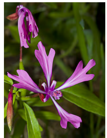
SANTA CLARA RED RIBBONS (Clarkia concinna subsp. automixa) Native Annual - Evening Primrose Family - (Apr–Jun) - Woodland - Stem < 16". Petals bright pink, 0.4-0.8" long, ~2x width, w/prominent lobes. Stigma = anthers. CNPS: WATCH LIST.