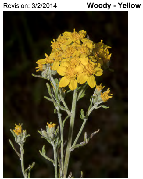
GOLDEN-YARROW (Eriophyllum confertiflorum var. confertiflorum) Native Perennial - Sunflower Family - (Apr-Aug) - Many dry habitats - Shrubby, 8-28" tall. Leaves 0.4-2" long, deeply 3-5 lobed. Flowers yellow; rays 4-6, 0.08-0.2" long; head bracts 4-7.