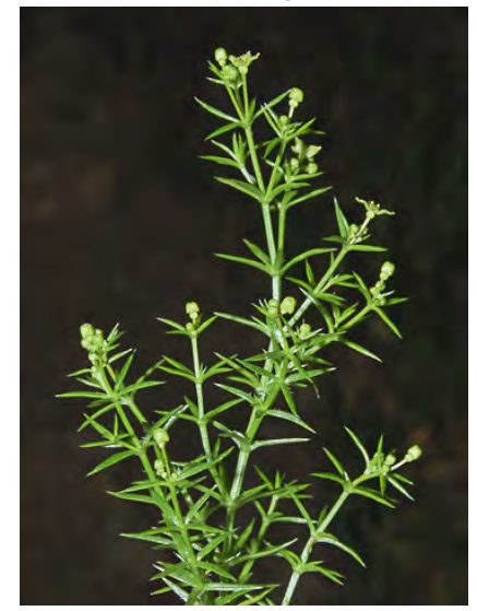
PHLOX-LEAF SERPENTINE BEDSTRAW (Galium andrewsii subsp. gatense) Native Perennial - Madder Family - (Apr-Jun) - Dry, rocky places in serpentine soil, chaparral or open oak/pine woodland - Plant open. Stem 2-9". Leaf gen flat, > internode. Phlox-like.