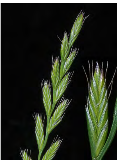
RYE GRASS (Festuca perennis) Naturalized Perennial - Grass Family - (May-Sep) - Dry to moist disturbed sites, abandoned fields - Stem 20-40" tall. Spikelet 0.2-0.9" long, > glume, awned or awnless. Sterile shoots at base. INVASIVE weed.