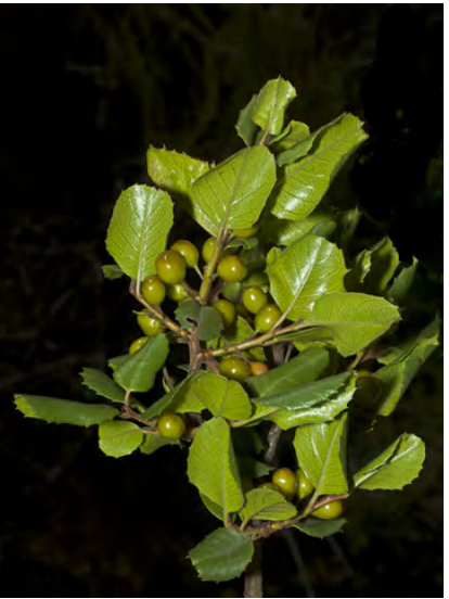
HOLLYLEAF REDBERRY (Rhamnus ilicifolia) Native Perennial - Buckthorn Family - (Mar–Jun) - Chaparral, montane forest - Shrub < 13' tall, evergreen w/stiff branches. Leaf blades 0.8-1.6" long, toothed. Fruits 0.2-0.3" wide, red.