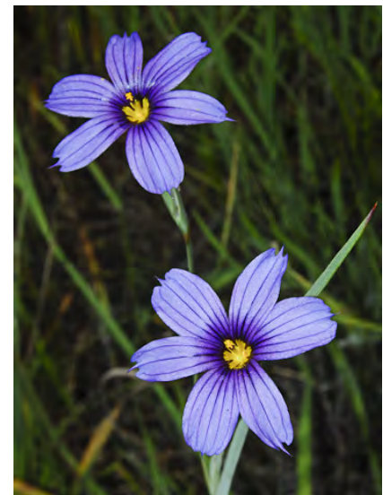
WESTERN BLUE-EYED-GRASS (Sisyrinchium bellum) Native Perennial - Iris Family -(Mar–May) - Common. Open, gen moist, grassy areas, woodland - Stem < 25" tall. Leaves iris-like. Petals 6, blue-purple with dark veins, 0.4-0.7" long.