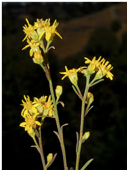
CALIFORNIA MATCHWEED (Gutierrezia californica) Native Perennial - Sunflower Family - (Jul-Nov) - Grassland, arid woodland and shrubland, serpentine - Stem 8-40" long, woody base. Leaf narrow, flat, <= 2" long. Ray flowers 4-13, 0.1-0.3" long.