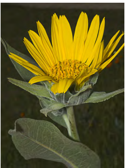
GRAY MULE'S EARS (Wyethia helenioides) Native Perennial - Sunflower Family (Mar-May(Aug)) - Open grassland, woodland, scrub - Plant 8-28" tall, densely woolly, often becoming smooth. Some woolly hairs remain on leaf stalks and floral bracts.