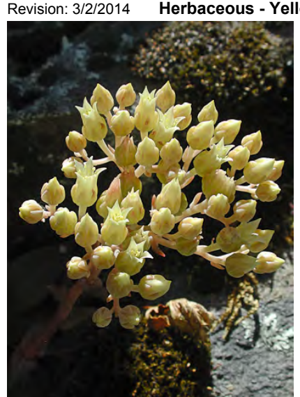
COMMON / HOT ROCK DUDLEYA (Dudleya cymosa subsp. paniculata) Native Perennial -Stonecrop Family - (May–Jun) - Uncommon. Rocky outcrops, canyons - Leaf rosettes 1-few, 1.6-4.3" wide. Petals <= 0.1" wide, pale yellow-white.