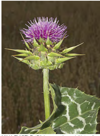
MILK THISTLE (Silybum marianum) Naturalized Annual-Biennial - Sunflower Family - (Feb–Jun) - Roadsides, pastures, disturbed areas - Stem 1-10, stout. Leaves spiny, shiny green w/white veins and spots. Flowers red-purple. INVASIVE weed