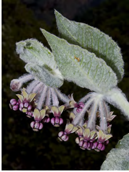
CALIFORNIA MILKWEED (Asclepias californica) Native Perennial - Dogbane Family - (Apr-Jul) - Flats, grassy or brushy hillsides - Plant densly white-woolly. Leaves oval. Flowers dark purple, ~ 0.5" long, petals bent back. Food plant for Monarch butterflies.