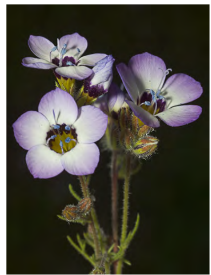
BIRD'S-EYE GILIA (Gilia tricolor subsp. tricolor) Native Annual - Phlox Family - (Mar–May) - Open, grassland, hills, valleys - Stem 3-15" tall, many branched. Flowers not in heads. Petals 0.4-0.75" long, throat yellow w/purple spots merged into ring.