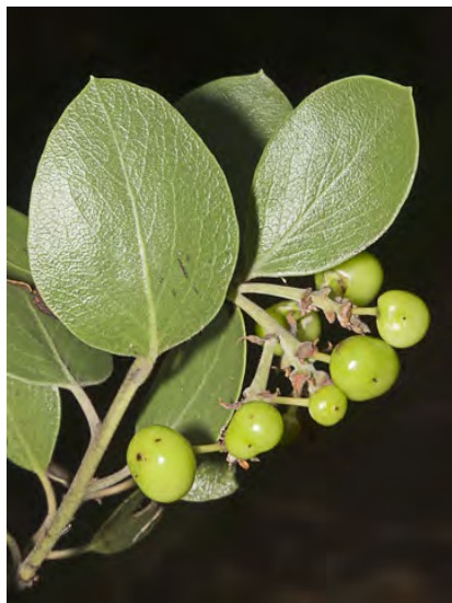
BIG-BERRY MANZANITA (Arctostaphylos glauca) Native Perennial - Heath Family - (Dec-Mar) - Rocky slopes, chaparral, woodland - Shrub-small tree, 3-26' tall. Twigs glabrous. Leaves smooth, waxy-white. Flower stalk 0.3-0.4" long, sticky-hairy.