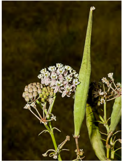
NARROW-LEAF MILKWEED (Asclepias fascicularis) Native Perennial - Dogbane Family - (May-Oct) - Dry ground, valleys, foothills - Plant gen hairless. Stem leaves narrow, 3-5 in whorls. Flowers green-white to purple-tinged, ~0.25" long.