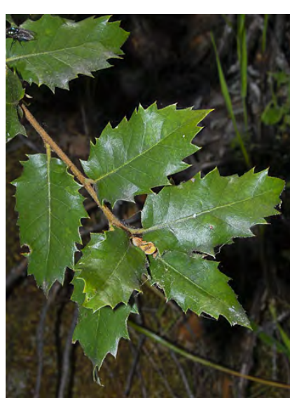
INTERIOR LIVE OAK (Quercus wislizeni var. wislizeni) Native Perennial - Oak Family - (Mar-May) - Interior canyons, slopes, pine/oak woodland - Tree < 75'. Leaf blades 0.8-2" long, hairless, flat. Acorns on 2nd year twigs, shell woolly inside.