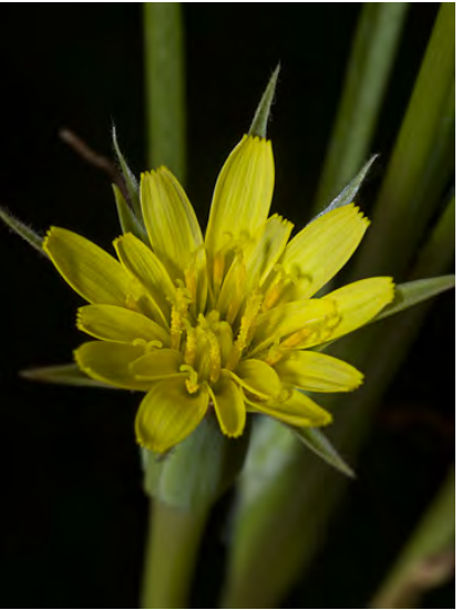
SILVERPUFFS (Uropappus lindleyi) Native Annual - Sunflower Family - (Mar–May) - Common. Open grassland, woodland, chaparral, deserts, gen in loose soils - Heads pale yellow, never nod. Outer head bracts always > 1/4 inner length. Pappus scale notched.