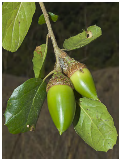
COAST LIVE OAK (Quercus agrifolia var. agrifolia) Native Perennial - Oak Family - (Mar-Apr) - Valleys, slopes, mixed-evergreen forest, woodland - Tree 30-80'. Leaves convex, hair-tuft below in vein axils. Acorns on 1st year twigs, shell glabrous inside.