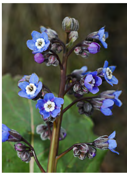
GRAND HOUND'S TONGUE (Cynoglossum grande) Native Perennial - Borage Family - (Feb-May) - Chaparral, woodland - Stem 1-3'. Leaf stalk 3-6". Leaf blade 3-6" cm long, broadly oval. Flowers bright blue winner white teeth.