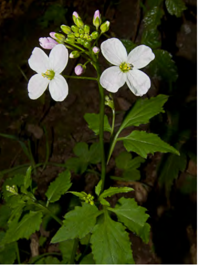
MILK MAIDS (Cardamine californica) Native Perennial - Mustard Family - (Jan-May) - Gen shaded sites, canyons, woodland. One of first spring flowers - Stem 10-24" long. Leaves lobed to compound w/sharp teeth. Petals white or pale rose, 0.3-0.5" long.