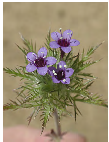
DOWNY NAVARRETIA (Navarretia pubescens) Native Annual - Phlox Family - (May—Jul) - Open, slopes, gravel, clay - Stem 5.5-13", tan to red-brown. Bracts irregularly toothed. Calyx lobes often toothed. Flowers 0.4-0.6" long, bright blue-purple.