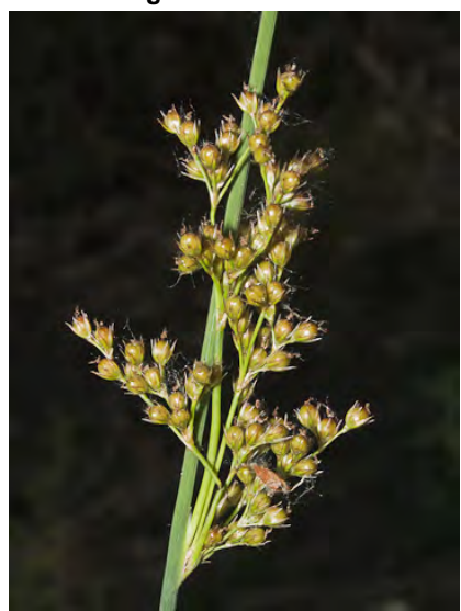
SPREADING RUSH (Juncus patens) Native Perennial - Rush Family - (Jun-Oct) - Marshy places, creeks, seeps - Plant 12-41" tall, densely tufted. Stems blue-gray-green & distinctly grooved when fresh. Stamens 6.