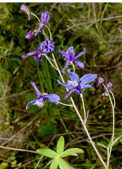
COAST LARKSPUR (Delphinium decorum subsp. decorum) Native Perennial - Buttercup Family - (Mar–May) - Open coastal grassland, chaparral - Stems 3-14" tall. Leaves short-hairy under, with few-toothed lobes. Flowers few, dark blue-purple.