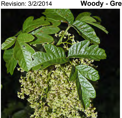
WESTERN POISON OAK (Toxicodendron diversilobum) Native Perennial - Sumac Family -(Apr–Jun) - Canyons, slopes, chaparral, coastal scrub, oak woodland - Shrub or vine. Leaflets 3, red in fall, mid leaflet stalked. Flowers green. Fruits white. TOXIC.