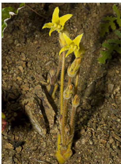
CLUSTERED BROOMRAPE (Orobanche fasciculata) Native Perennial - Broom-rape Family - (Apr–Jul) - Dry, gen bare places. Root parasite on various shrubs - Plant 2-8" tall. Flowers pink or yellow, 5-20 on long stems.