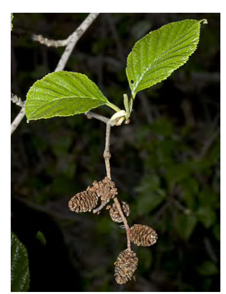
WHITE ALDER (Alnus rhombifolia) Native Perennial - Birch Family - (Apr–Jun) - Along permanent streams - Tree. Leaves flat, not rusty underneath, margins serrate, not rolled under. Female flowers cone-like. Wood used for furniture and for smoking meats.