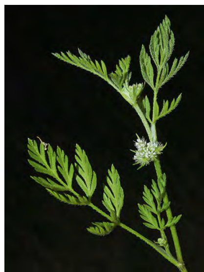
SHORT SOCK-DESTROYER (Torilis nodosa) Naturalized Annual - Carrot Family - (Apr–Jun) - Disturbed places - Plant spreading, 4-20" tall. Flowers white to red, clusters dense, < leaf. Fruit ~ 0.1" long, uncurved bristles on outer surface, bumps inside.