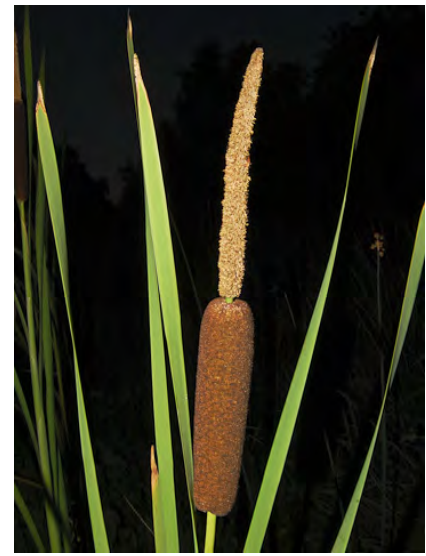
NARROW-LEAVED CATTAIL (Typha angustifolia) Native Perennial - Cattail Family -(May–Aug) - Nutrient-rich freshwater to brackish marshes, wet disturbed places - Plant 4.9-9.8' tall. Leaves gen < 0.4" wide. Flower cluster gap >