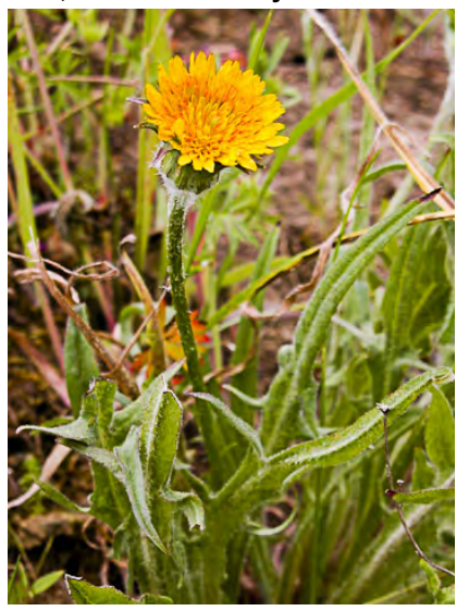
GIANT NATIVE DANDELION (Agoseris grandiflora var. grandiflora) Native Perennial - Sunflower Family - (Apr-Jul) - Grassland, scrub, woodland - Plant 10-40". Leaf lobes point up. Flower rosy-purple, variable-sized bracts. Seed tapers to beak > 2x body length. Leaf lobes point upward.