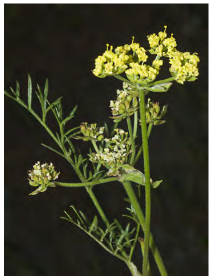
BLADDER PARSNIP (Lomatium utriculatum) Native Perennial - Carrot Family - (Feb-May) -Open grassy slopes, meadows, woodland - Plant 4-20" tall, leafy stem. Leaf lobes linear, bases broad. Flowers bright yellow above unfused, round bractlets. Fruit winged.