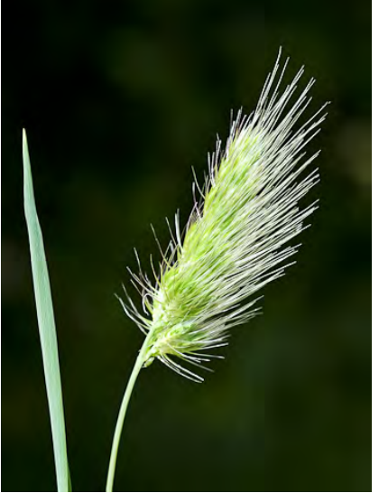
BRISTLY DOGTAIL GRASS (Cynosurus echinatus) Naturalized Annual - Grass Family - (May-Jul) - Open, disturbed sites - Tufted. Stem 4-28" long. Leaf blade 0.1-0.6" wide. Flower cluster 0.4-1.6" long, 1-sided. Fertile and sterile spikelets. INVASIVE weed.