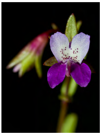
FEW-FLOWERED COLLINSIA (Collinsia sparsiflora var. collina) Native Annual - Plantain Family - (Mar–Apr) - Disturbed grassy fields, roadbanks, open chaparral, open oak and dry mixed woodland - Flowers 0.2-0.3" long, purple, pouch hidden by calyx.