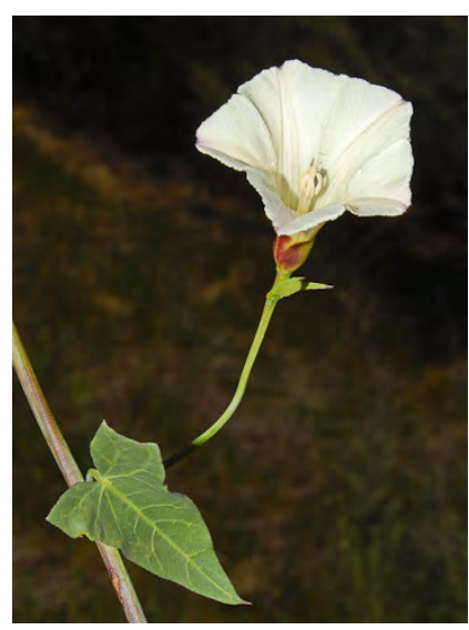
CLIMBING MORNING-GLORY (Calystegia purpurata subsp. purpurata) Native Perennial - Morning-glory Family - (May–Jun) - Chaparral, coastal scrub - Stem strongly climbing. Leaf triangular, lobes strongly angled. Bractlets smooth, small, distant.