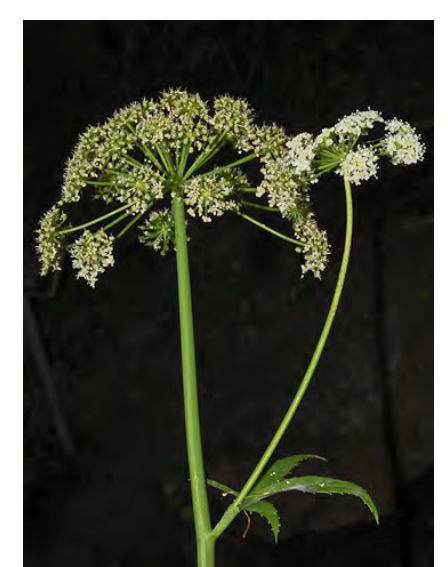
WESTERN WATER-HEMLOCK (Cicuta douglasii) Native Perennial - Carrot Family -(Jun-Sep) - Wet places, gen aquatic - Plants 5-10' tall. Leaves 1-3x divided, leaflets 1-10, serrate edges. Flowers white. Fruits round. The most lethally TOXIC native plant.