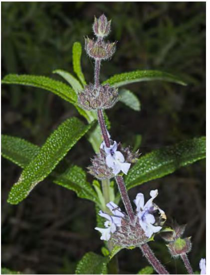
BLACK SAGE (Salvia mellifera) Native Perennial - Mint Family - (Mar–Jun) - Coastal-sage scrub, lower chaparral - Shrub 3.3-6' tall. Leaf 1-2.8" long, toothed, hairy underneath. Flowers blue, white or lavender, tube 0.2-0.4" long, in clusters 0.6-1.6" wide.