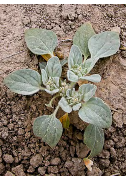
TURKEY-MULLEIN (Croton setigerus) Native Annual - Spurge Family - (May-Oct) - Dry, open, often disturbed areas - Plant < 8" tall, moundlike, covered w/long stiff hairs. Leaf blade 0.4-2" long, oval. TOXIC to livestock.