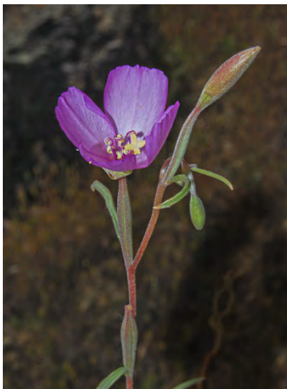
HERALD-OF-SUMMER (Clarkia gracilis subsp. gracilis) Native Annual - Evening Primrose Family - (Apr-Jul) - Common. Openings in woodland, forest - Plant < 35". Buds nodding. Petals 0.2-0.9" long, pink. Stigma = anthers. Ovary 4-grooved. Sepals united.