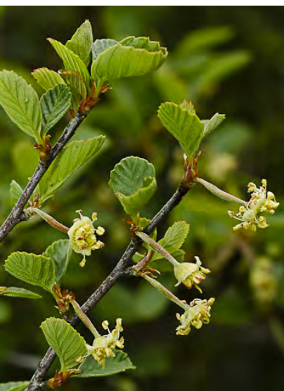
BIRCH-LEAF MOUNTAIN-MAHOGANY (Cercocarpus betuloides var. betuloides) Native Perennial - Rose Family - (Mar–May) - Dry, rocky slopes, chaparral - Shrub 3-10'. Leaf 0.4-1" long, end toothed. Flower 0.16-0.3" wide. Hairy fruit styles 2-3.5" long.