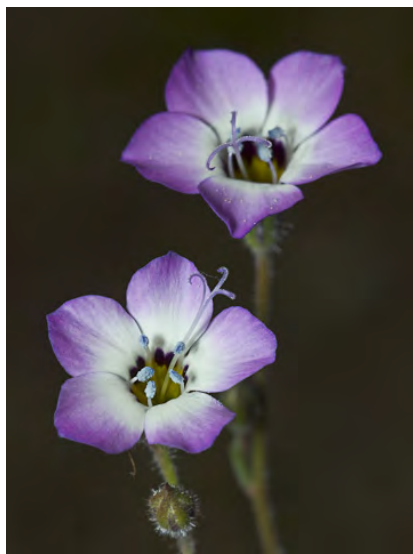
DIFFUSE BIRD'S-EYE GILIA (Gilia tricolor subsp. diffusa) Native Annual - Phlox Family - (Mar–Jul) - Open grassland, hills, valleys - Stem 3-15" tall, many branched. Flowers diffuse. Petals 0.3-0.75" long, purple-tipped, throat w/paired purple spots.