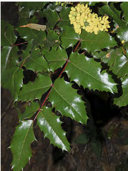
SHINYLEAF OREGON-GRAPE (Berberis pinnata subsp. pinnata) Native Perennial - Barberry Family - (Feb-May) - Rocky slopes, conifer forest, oak woodland, chaparral - Shrub gen < 7'. Leaflets w/15-23 spiny teeth, spines < 0.1" long. Flowers yellow.