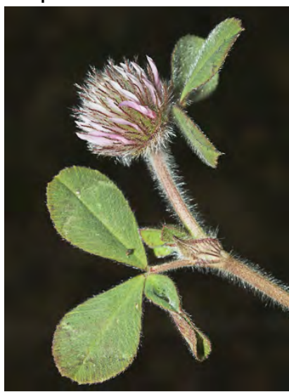
ROSE CLOVER (Trifolium hirtum) Naturalized Annual - Pea Family - (Apr-May) - Disturbed areas, roadsides - Head with 1-2 bract-like leaves immed below. Flowers pink, 0.4-0.6" long, densely-bristly in fruit. INVASIVE weed.