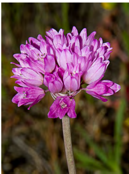
JEWELED ONION (Allium serra) Native Perennial - Onion or Garlic Family - (Apr–May) - Common. Grassy slopes - Flowers pink to rose, crowded, 10-40. "Petals" about 0.2" long, ± erect, ± lance-shaped, papery and folded over fruit when in fruit.