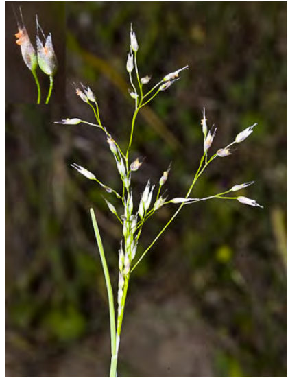
SILVER HAIR GRASS (Aira caryophyllea) Naturalized Annual - Grass Family - (Apr-Jun) -Sandy soils, open or disturbed sites - Flower cluster > 0.6" wide, diffuse with long slender branches. Spikelets about 0.1" long with 2 extended awns.