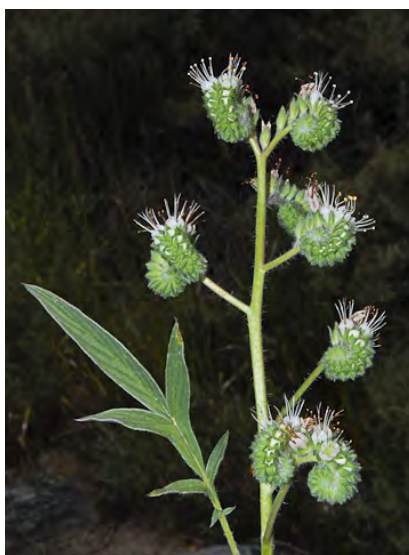
ROCK PHACELIA (Phacelia imbricata subsp. imbricata) Native Perennial - Borage Family - (Apr-Jul) - Slopes, roadsides, flats, canyons, chaparral, woodland - Plant 8-47", tufted. Leaf segments 7-15. Flowers 0.2-0.3", white. Flower bracts often sticky.