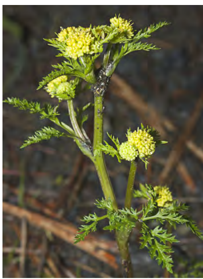
TURKEY PEA SANICLE (Sanicula tuberosa) Native Perennial - Carrot Family - (Mar–Jul) -Open gravelly meadows, chaparral, woodland, pine forest - Plant 2-32" tall, slender. Leaves finely dissected. Flowers bright yellow, male flower stalks > bumpy fruit.