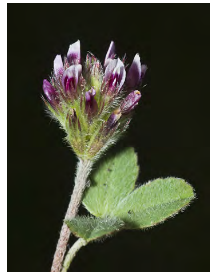
RANCHERIA CLOVER (Trifolium albopurpureum) Native Annual - Pea Family - (Mar–Jun) - Abundant. Dunes, grassland, wet meadows, slopes, disturbed areas, etc - No head bract. Flowers purple + white, 0.2-0.3", no stalk. Flower bracts hairy, teeth linear, = flowers.