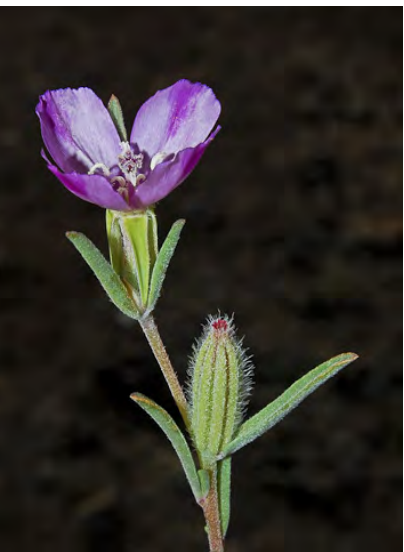
FOUR-SPOT (Clarkia purpurea subsp. quadrivulnera) Native Annual - Evening Primrose Family - (Apr–Aug) - Common. Open, grassy or shrubby places - Buds erect. Petals < 0.6", lavender to dark red. Ovary 8-grooved. Sepals 1's or 2's.