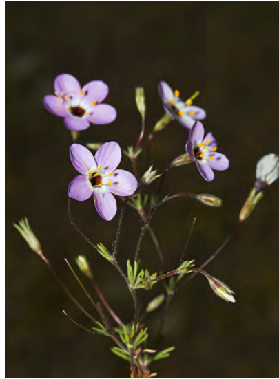
SERPENTINE LEPTOSIPHON (Leptosiphon ambiguus) Native Annual - Phlox Family - (Apr-May) - Grassy areas gen serpentine - Stem 0.4-0.8", thread-like. Diffuse. Corolla throat widely-widened. CNPS: FAIRLY ENDANGERED.