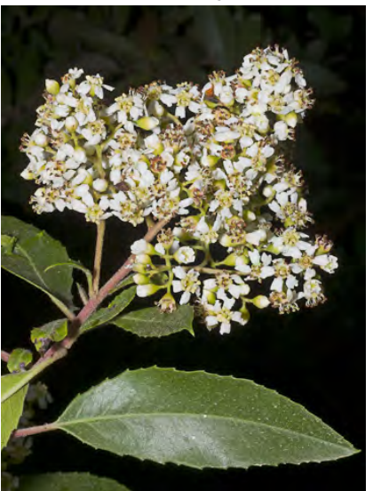
CHRISTMAS BERRY / TOYON (Heteromeles arbutifolia) Native Perennial - Rose Family - ((May)Jun-Aug) - Chaparral, oak woodland, mixed-evergreen forest - Shrub-tree < 33' tall, evergreen. Leaf 2-4" long. Petals white, < 0.16" long. Fruit bright red.