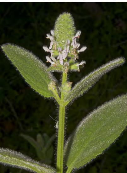
SHORT-SPIKED HEDGE-NETTLE (Stachys pycnantha) Native Perennial - Mint Family - (Jun-Oct) - Streambanks, springs, pine/oak forest - Plant 12-39", densely glandular, aromatic. Flower cluster < 2", no spaces. Petals white to pink. ~0.3" long.