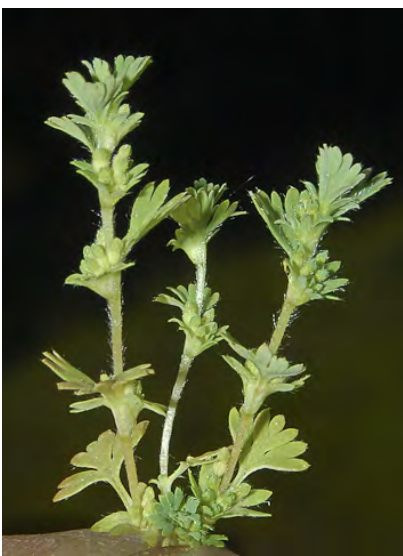
LADY'S MANTLE (Aphanes occidentalis) Native Annual - Rose Family - (Mar–May) - Seasonally moist grassland, chaparral, woodland - Plant inconspicuous, soft hairy, < 4" tall. Leaves 0.1-0.5" long, deeply lobed. Flowers yellow-green, < 0.1" long.