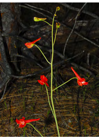
RED OR ORANGE LARKSPUR (Delphinium nudicaule) Native Perennial - Buttercup Family - (Mar–Jun) - Moist talus, wooded, rocky slopes - Stem gen 6-20" tall, usually hairless. Flowers scarlet to orange-red. Hummingbird pollinated.