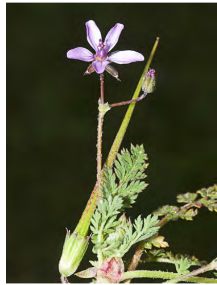
REDSTEM FILAREE (Erodium cicutarium) Naturalized Annual - Geranium Family -(Feb-Sep) - Open, disturbed sites, grassland, scrub - Stem 4-20". Leaves compound, leaflets dissected. Sepal tip bristly. Petal pink to purple. Fruit beak 0.8-2". INVASIVE.