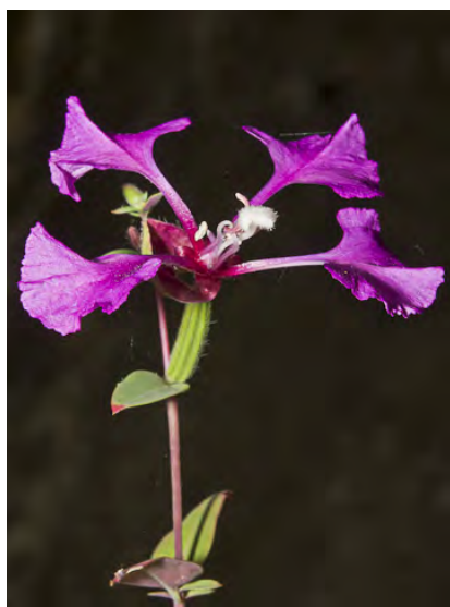
ELEGANT CLARKIA (Clarkia unguiculata) Native Annual - Evening Primrose Family - (Apr–Sep) - Common. Woodland - Buds nodding. Axis erect. Petals 0.4-1" long, pink to dark-red, clawed. Sepals united; sepals & ovary w/spreading hairs