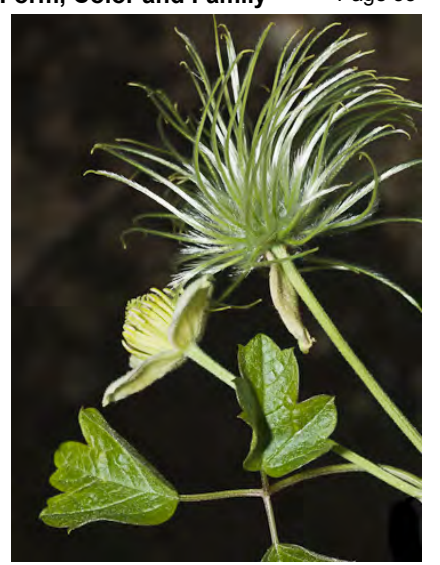
CHAPARRAL CLEMATIS (Clematis lasiantha) Native Perennial - Buttercup Family - (Jan-Jun) -Hillsides, chaparral, open woodland - Woody vine. Leaflets 3-5, +-3-lobed. Flowers gen 1, in spring; sepals white to cream, 0.4-0.8" long.