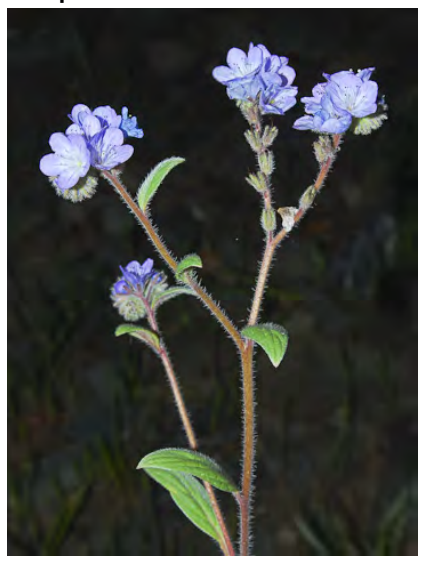
DIVARICATE PHACELIA (Phacelia divaricata) Native Annual - Borage Family - (Apr-Jun) - Open areas, chaparral, woodland, grassland - Plant 3.5-16" tall. Leaves with 0-few lobes. Flowers 0.4-0.6" long, lavender to violet. Seeds 8-16.