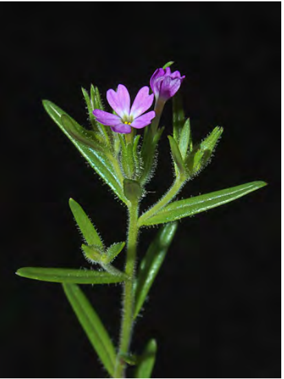
SLENDER ANNUAL PHLOX (Microsteris gracilis) Native Annual - Phlox Family - (Mar–Aug) - Dry to moist areas - Plant < 8" tall, glandualr-hairy. Leaves 0.4-1.2" long. Flowers 0.3-0.5" long, tubes yellow, lobes bright pink to white.