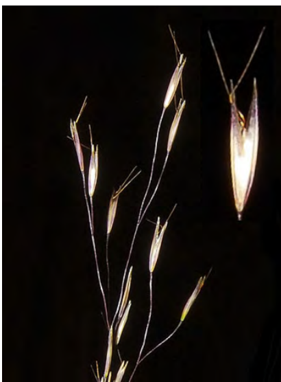
ANNUAL HAIR GRASS (Deschampsia danthonioides) Native Annual - Grass Family - (Mar-Aug) - Moist to drying, open sites, meadows, streambanks, vernal pools, occ alkali soil - Stem 4.5-24" long. Lemmas 2, ~0.1", awns from below middle 0.1-0.4" & bent.