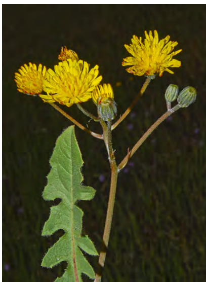
DANDELION-LEAF HAWKSBEARD (Crepis vesicaria subsp. taraxacifolia) Naturalized Annual-Biennial - Sunflower Family - (Feb-Oct) -Sandy clearings, hillsides, disturbed places -Plant 1-47" tall. Leaves dandelion-like. Fruit beak 0.1-0.2" long.