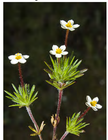
BICOLOR LEPTOSIPHON (Leptosiphon bicolor) Native Annual - Phlox Family - (Mar–Jun) - Common. Open, grassy areas, chaparral, woodland - Plant 0.8-8.3" tall, hairy. Flower lobes ~0.1" long, pink or white; tube red; stigma <=0.02" long.