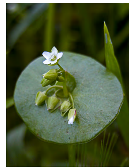
COMMON MINER'S LETTUCE (Claytonia perfoliata subsp. perfoliata) Native Annual - Miner's Lettuce Family - (Jan-May) - Vernally moist, often shady or disturbed sites - Basal leaf length <3x width. Stem leaf gen not angled. Seeds shiny w/large appendage.