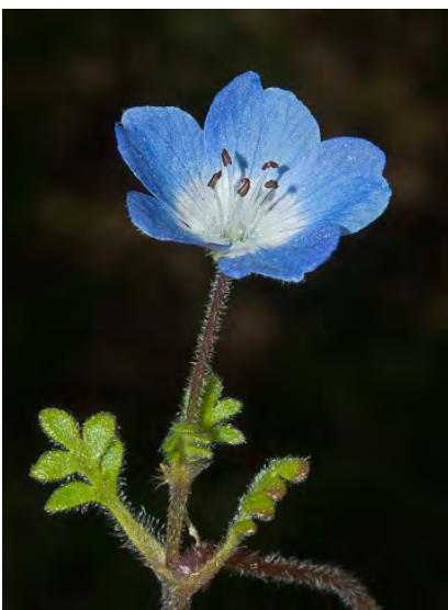
BABY BLUE-EYES (Nemophila menziesii var. menziesii) Native Annual - Borage Family - (Feb-May) - Meadows, grassland, chaparral, woodland, slopes - Plant 4-12". Lower leaves w/6-13 lobes. Flowers bright blue w/white center, 0.2-1.6" wide.