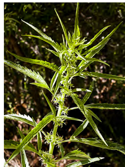
DURANGO ROOT (Datisca glomerata) Native Perennial - Datisca Family - (May–Jul) - Dry streambeds or washes - Stem 3.3-6.6' tall. Leaves ~ 6" long, lance-shaped, alternate above, opposite/whorled below. Flowers small with no petals.