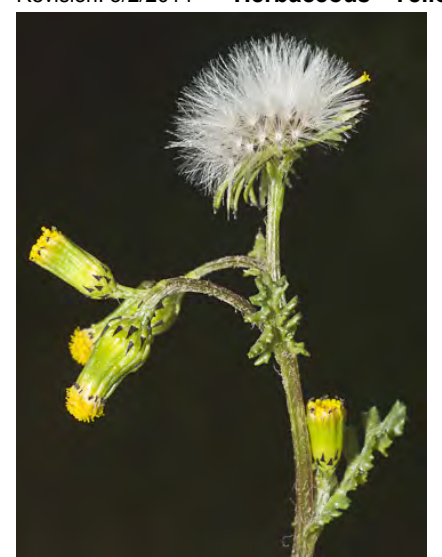
COMMON GROUNDSEL (Senecio vulgaris) Naturalized Annual - Sunflower Family -(Feb-Jul) - Common. Disturbed areas - Plant 4-24" tall, not hairy, w/1-10+ stems. Flower head bracts with black-tips. Milky sap.