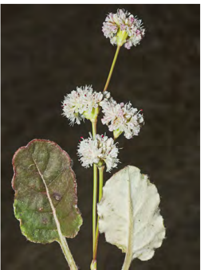
EAR-SHAPED WILD BUCKWHEAT (Eriogonum nudum var. auriculatum) Native Perennial - Buckwheat Family - (May-Oct) - Common. Sand or gravel - Plant 5-15 dm. Leaves on stem, curled. Inflor smooth. Flowers white to pink, smooth.