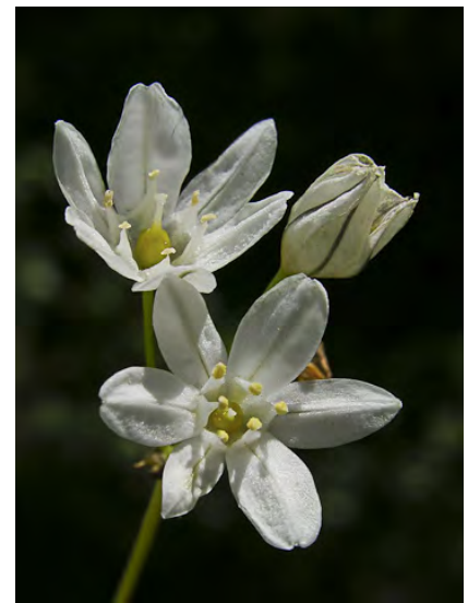
FOOL'S ONION (Triteleia hyacinthina) Native Perennial - Brodiaea Family - (Mar–Jul) - Grassland, vernally wet meadows, occ drier slopes - Flowering stem 1-2' tall. Leaves 4-16", 0.16-0.9" wide. Flower stalks 0.2-0.6" long. Flowers white, 0.35-0.6" long.