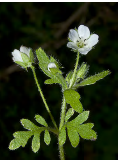
VARIABLE-LEAF NEMOPHILA (Nemophila heterophylla) Native Annual - Borage Family - (Feb-Jun) - Common. Forest, chaparral, roadsides, streambanks - Flower 0.1-0.4" long, unspotted, bract appendages < 0.04" long in fruit.