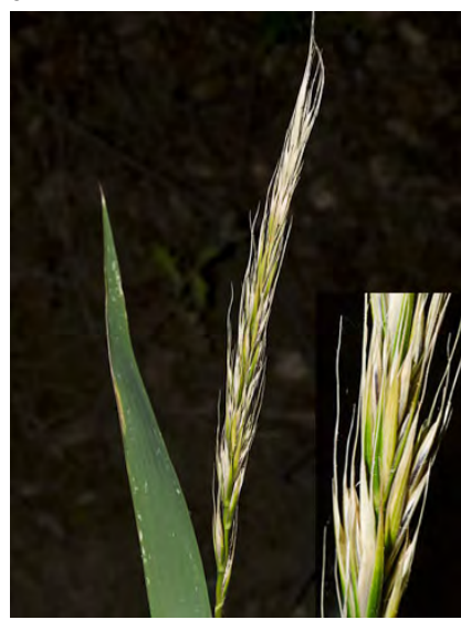
BEARDLESS WILD RYE (Elymus triticoides) Native Perennial - Grass Family - (Jun-Jul) - Dry to moist, often saline, meadows - Plant 18-50" tall, from rhizomes. Flower cluster 2-8" long. Spikelets generally 2/node. Lemmas 3-7, 0.2-0.5" long, awn to 0.12" long.