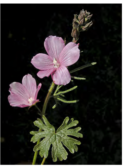
GERANIUM-LEAVED CHECKERBLOOM (Sidalcea malviflora subsp. laciniata) Native Perennial - Mallow Family - (Mar–Jun) - Grassland, open woodland - Plant 6-39" tall. Middle leaves linear-lobed. Petals 0.4-0.8" long, pink-lavender, gen white veined.