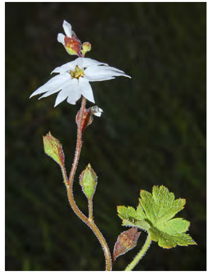
WOODLAND STAR (Lithophragma affine) Native Perennial - Saxifrage Family - (Mar–Apr) - Open, grassy slopes - Plant 4-24" tall. Leaves w/3-5 sharp-toothed shallow lobes, stem leaves alternate. Petals 0.2-0.5" long, white. Hypanthium funnel-shaped.