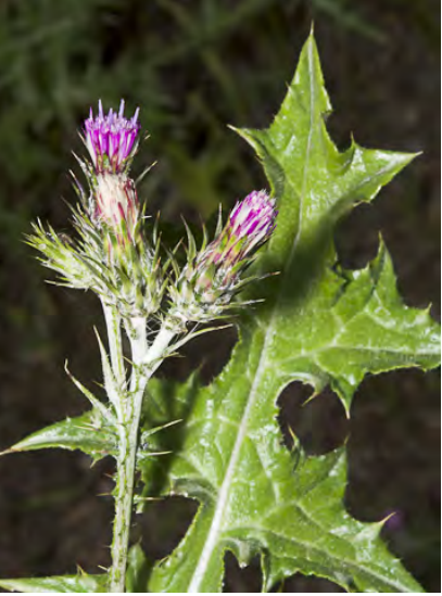
ITALIAN THISTLE (Carduus pycnocephalus subsp. pycnocephalus) Naturalized Annual -Sunflower Family - (Mar–Jul) - Roadsides, pastures, disturbed areas - Stems 8-79", narrow spiny-wings. Lower leaves 4-10 lobed, heads 2-5, flower bracts woolly. NOXIOUS.