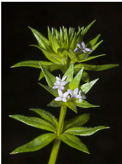
FIELD MADDER (Sherardia arvensis) Naturalized Annual - Madder Family - (Mar-Jul) -Pastures, disturbed areas, grassland, dry meadows, oak woodland - Stem 2.8-6.3" long. Leaves in whorls of 5-6, 0.2-0.5" long. Flowers pink or lavender, the 4 lobes < tube.