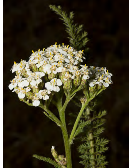
YARROW (Achillea millefolium) Native Perennial - Sunflower Family - (Apr-Sep) - Many habitats - Plant 4"-7' tall. Stem white-hairy. Leaves finely dissected. Flower cluster flat-topped. Flowers white to pink. Widely used in folk medicine.