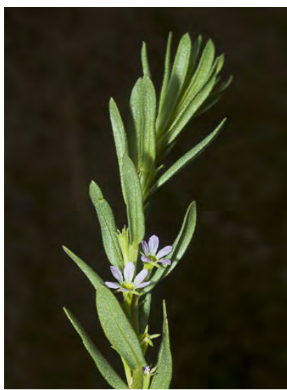
GRASS-POLY (Lythrum hyssopifolia) Naturalized Annual-Perennial - Loosestrife Family - (Apr–Oct) Affiliar-Peterina - Loosestile Parliny - (Api-Oct) - Marshes, drying pond margins, disturbed ground - Stem 4-24". Leaves 0.2-1.2" long, ~ elliptical. Petals pink, 0.1-0.2" long. 2 awl-like appendages. INVASIVE weed.