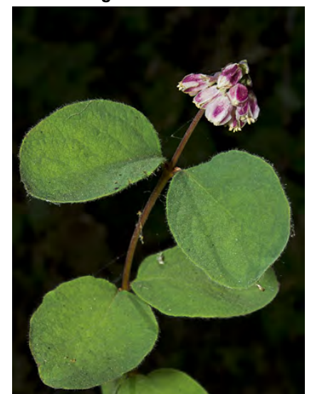
CREEPING SNOWBERRY (Symphoricarpos mollis) Native Perennial - Honeysuckle Family - (Apr–May) - Ridges, slopes, open places in woodland - Shrub 6-24" tall, sprawling. Flowers < 8/cluster, pink + often red outside, 0.16" long, bell-shaped, symetrical.