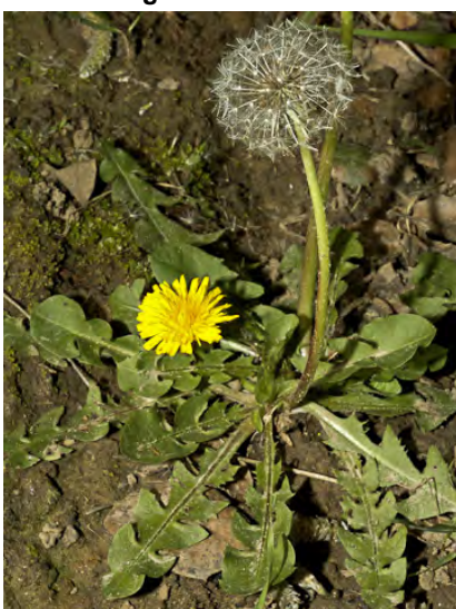
COMMON DANDELION (Taraxacum officinale) Naturalized Biennial-Perennial - Sunflower Family - (All year) - Abundant. Esp disturbed areas -Stem hollow. Leaves bright green with sharp down-pointing lobes. Outer head bracts reflexed. Fruit ~ brown.