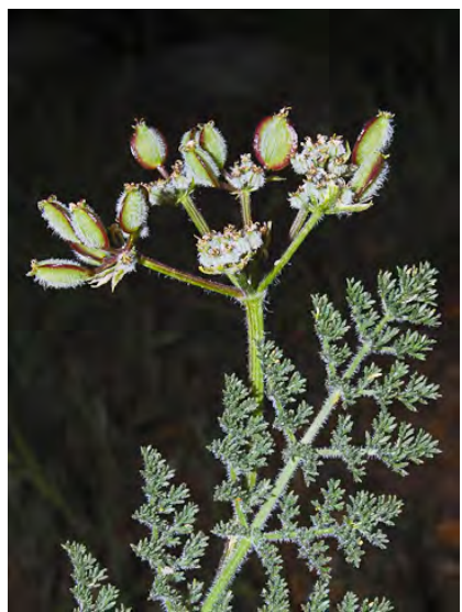
WOOLLY FRUITED DESERTPARSLEY (Lomatium dasycarpum subsp. dasycarpum) Native Perennial - Carrot Family - (Mar–Jun) - Rocky (gen serpentine), chaparral, woodland - Plant 4-20", short-hairy. Flowers greenish-white, petals and fruit hairy.