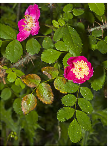
WOOD ROSE (Rosa gymnocarpa var. gymnocarpa) Native Perennial - Rose Family - ((Feb)Apr-Jul) - Common. Gen in shade of forest, scrub - Shrub w/straight thorns. Flowers gen solitary, stalks sticky, fruit smooth, sepals deciduous.