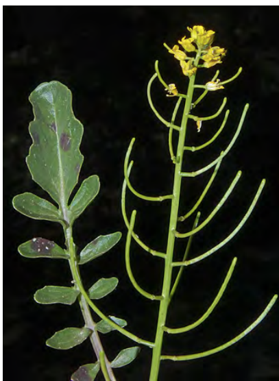
ERECT-POD WINTER CRESS (Barbarea orthoceras) Native Perennial - Mustard Family - (Mar–Jul) - Meadows, streambanks, moist woodland, grassland - Stem 8-24". Lower leaves wlarge terminal lobe, upper clasping stem. Petals bright yellow, 0.2-0.3" long.