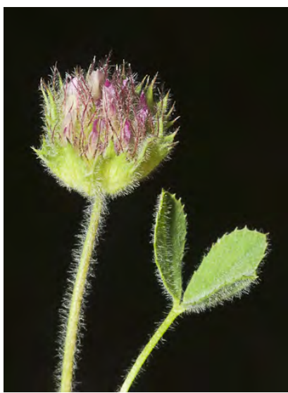
BEARDED CLOVER (Trifolium barbigerum) Native Perennial - Pea Family - (Apr-Jun) - Wet meadows, open, disturbed areas - Leaflets 0.6-1" long. Head 0.2-1" wide, gen bristly. Flowers pink-purple, 0.2-0.4" long.