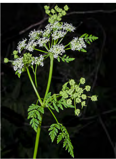
POISON HEMLOCK (Conium maculatum) Naturalized Biennial - Carrot Family - (Apr–Jul) -Common. Moist, esp disturbed places - Plants 2-10' tall. Stems purple-spotted. Leaves fern-like, gen 2x divided. Flowers white. TOXIC. INVASIVE