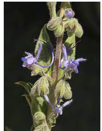
VINEGAR WEED (Trichostema lanceolatum) Native Annual - Mint Family - (Jun-Nov) - Dry, open, gen disturbed habitats - Plant < 39" tall. Leaf blades 0.8-2.8" long, leaf stalk, ~ stalkless. Flowers purple-blue, tube 0.2-0.4" long, curving up. Vinegar scent.