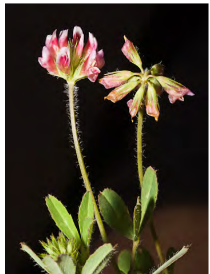
DECEIVING CLOVER (Trifolium bifidum var. decipiens) Native Annual - Pea Family - (Apr–Jun) - Open, grassy areas, forest - Leaflet tip square/notched. Flower small, yellow to pink-purple, soon reflex. Flower stalk top sparsely hairy.