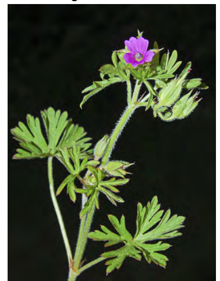
CUT-LEAVED GERANIUM dissectum) Naturalized Annual -(Geranium Geranium dissection Naturalized Affindal - Gerafildin Family - (Mar–Jul) - Open, disturbed sites - Stem 3-28" tall, rough-hairy. Leaf blades deeply divided. Petals violet-red, 0.1-0.25" long w/notched tips. Flower stalk sticky. INVASIVE.