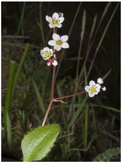
CALIFORNIA SAXIFRAGE (Micranthes californica) Native Perennial - Saxifrage Family - (Feb-May(Jun)) - Moist, shady places - Plant 6-14" tall. Leaves 1.6-4" long, at base, egg-shaped, >= 0.08" wide, toothed. Petals white, 0.1-0.18" long.