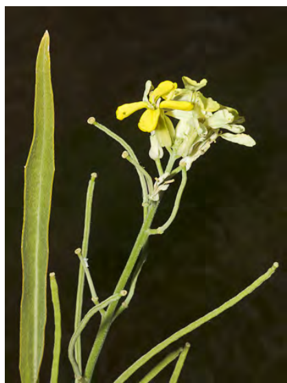
WESTERN WALLFLOWER (Erysimum capitatum var. capitatum) Native Biennial - Mustard Family - (Mar–Sep) - Common. Open areas, woodland, sandy areas, chaparral - Petals orange to yellow, fruit 1-4.3" long.