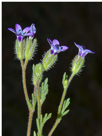
PURPLESPOT GILIA (Gilia clivorum) Native Annual - Phlox Family - (Feb–Jun) - Common. Open, grassy areas - Stem 2-12" tall, hairy, branched. Leaves narrowly linear-lobed. Flowers 0.25-0.3" long, tube yellow, purple-spotted. Flowering stem sticky.