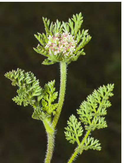
RATTLESNAKE WEED (Daucus pusillus) Native Annual - Carrot Family - (Apr-Jun) - Rocky or sandy places - Plant 1-35" tall, usually < 20". Flower clusters with < 13 flowers, all white. Young roots edible. Sap TOXIC to some people, causing dermititis.