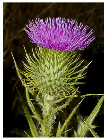
BULL THISTLE (Cirsium vulgare) Naturalized Biennial - Sunflower Family - (May-Oct) - Common. Disturbed areas - Plant 12-79" tall. Top of leaves bristly; leaf base forming decurrent wings on stem. Flowers purple, gen 1-2" wide. NOXIOUS weed.