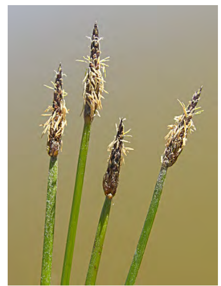
COMMON SPIKERUSH (Eleocharis macrostachya) Native Perennial - Sedge Family - (Spring—summer) - Common. Fresh to brackish wetland - Stem 8-39" tall, 0.06-0.1" wide. Spikelet 0.2-1.6" long, 0.08-0.2" wide, style 2-branched.