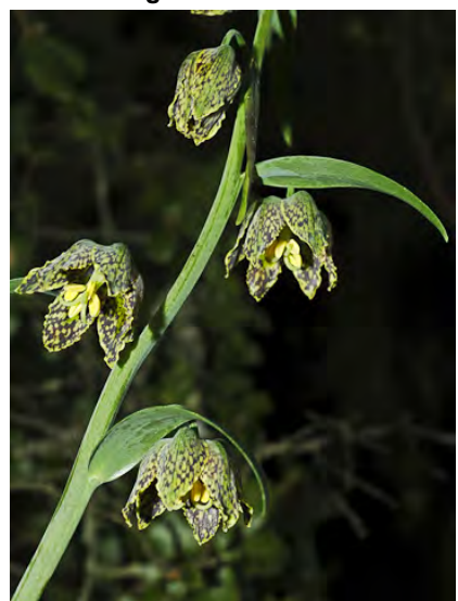
CHECKER LILY (Fritillaria affinis) Native Perennial - Lily Family - (Mar–Jun) - Common. Oak or pine scrub, grassland - Stem 4-47" tall. Leaves 1.6-6.3" long, whorled below. Petals mottled brown-purple and yellow-green, 0.4-1.6" long.