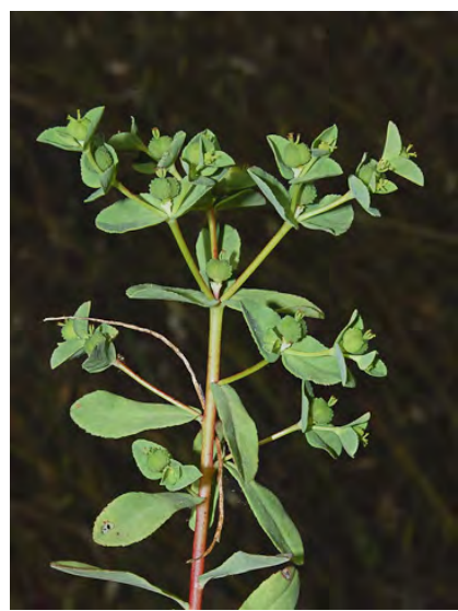
WART SPURGE (Euphorbia spathulata) Native Annual - Spurge Family - (Mar–Jun) - Open, gen disturbed places - Stem 6-17" tall, smooth. Leaves spoon-shaped, 0.4-1.2" long, finely toothed. Gland oblong.