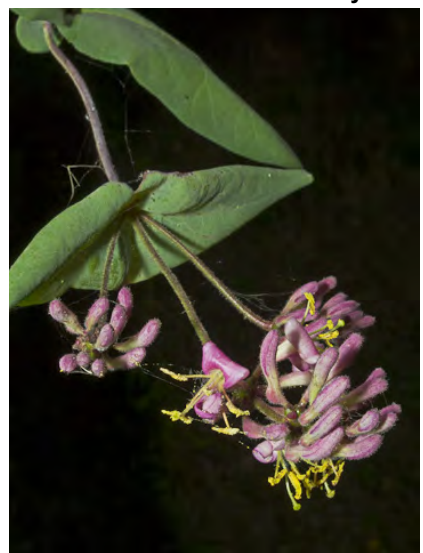
HAIRY VINE HONEYSUCKLE (Lonicera hispidula) Native Perennial - Honeysuckle Family - (May—Jun) - Canyons, streamsides, woodland - Shrub sprawling-climbing, 6-10' long, short-hairy. Flower cluster densely sticky. Flowers pink, 0.5-0.6" long, sticky-hairy.