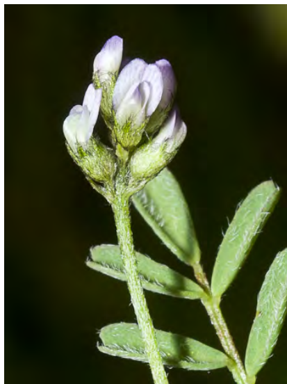
GAMBEL MILKVETCH (Astragalus gambelianus) Native Annual - Pea Family - (Mar–Jul) - Open, grassy areas, scrub - Plant 8-12" tall, slender. Leaflets square-tipped. Flowers 4-15/cluster, white w/purple-tinge, ~0.1" long. Fruits ~0.15" long, reflexed.