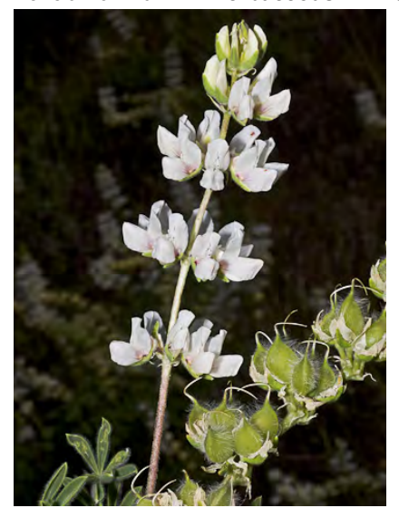
GULLY LUPINE (Lupinus microcarpus var. densiflorus) Native Annual - Pea Family - (Apr–Jun) - Abundant. Open or disturbed areas, occ seeded on roadbanks - Plant 4-32" tall, hairy. Flowers 0.3-0.7" long, white to yellow. Flower bract hairs few, short.