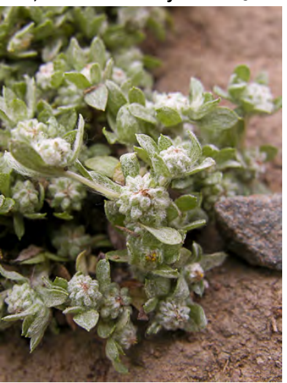
SLENDER WOOLLY-MARBLES (Psilocarphus tenellus) Native Annual - Sunflower Family - (Mar–Jul) - Common. Dry, seasonally moist slopes, flats, burns, trails, rarely vernal pools - Plant hairy. Leaves spoon-shaped. Disk flowers 4-lobed.