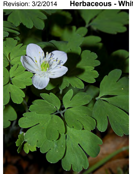
WESTERN RUE-ANEMONE (Enemion occidentale) Native Perennial - Buttercup Family -(Mar-May) - Shaded slopes, chaparral, oak woodland, conifer forest - Plant 3-13" tall. Sepals white, 0.3-0.4" long, filaments > 15, threadlike. Fruit not stalked.