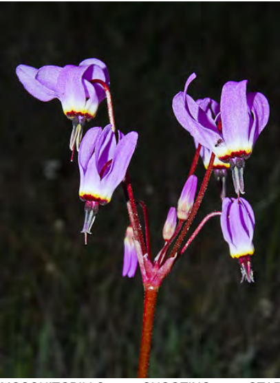
MOSQUITOBILLS SHOOTING STAR (Dodecatheon hendersonii) Native Perennial - Primrose Family - (Mar–Jul) - Gen in shady sites - Leaf blade length generally <2x width. Flower parts 4s or 5s. Filament tube solid black.