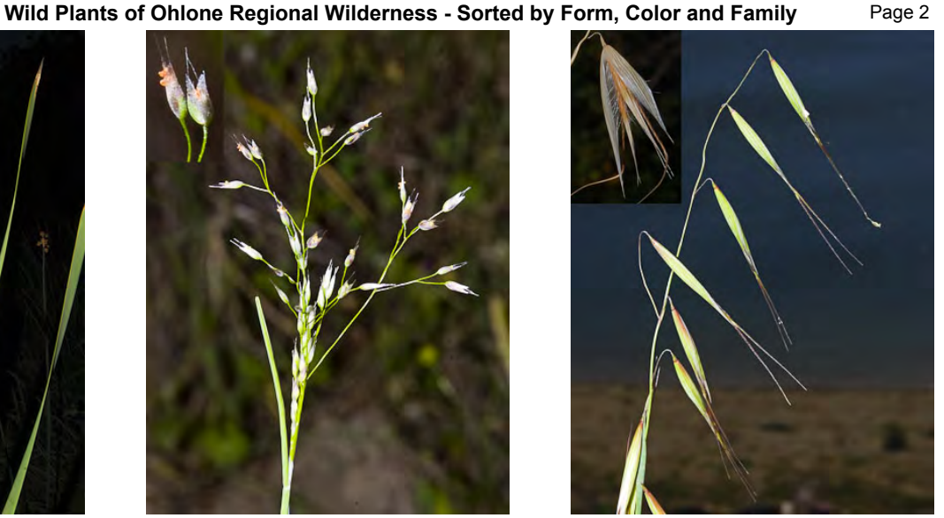
SLENDER WILD OAT (Avena barbata) Naturalized Annual - Grass Family - (Mar–Jun) -Disturbed sites - Plants gen 24-32". Spikelets 0.8-1.2" long. Awns 0.8-1.8" long. Lemma tip bristles >= 0.1" long. Seeds EDIBLE whole or ground for flour. INVASIVE weed.