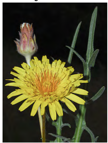
SEASIDE DANDELION (Agoseris apargioides var. apargioides) Native Perennial - Sunflower Family - (Apr–May) - Coastal dunes, sand hills -Plant 4-18". Leaf blades narrow, deeply lobed. Flowers extend well beyond bracts, seed beak < 2x body length.