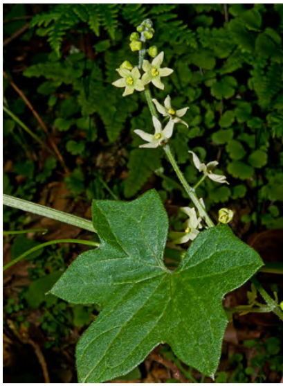
CALIFORNIA MAN-ROOT (Marah fabacea) Native Perennial - Gourd Family - (Feb-Apr) - Streamsides, washes, shrubby open areas - Vine 6-20' long. Leaves moderately lobed. Flowers cream or white, < 0.3" wide. Fruit spiny all over.