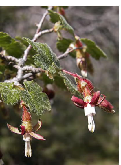
CANYON GOOSEBERRY (Ribes menziesii var. menziesii) Native Perennial - Gooseberry Family - (Feb-Apr) - Common. Forest openings, chaparral - Shrub < 10', prickly. Leaves sticky below. Styles glabrous, anthers exserted, sepals purplish.