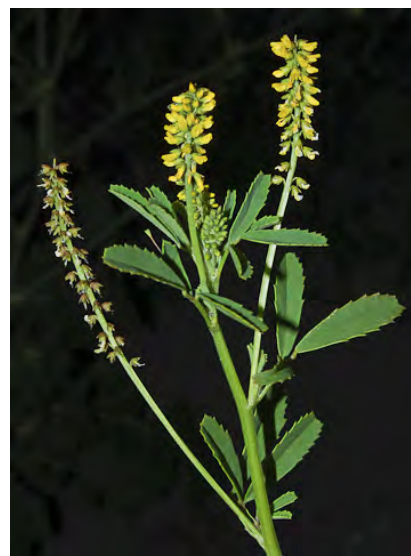
SOURCLOVER (Melilotus indicus) Naturalized Annual-Biennial - Pea Family - (Apr–Oct) - Open, disturbed areas - Stem 4-24" long. Leaflets 3, 0.4-1" long. Flowers yellow, ~0.1" long.