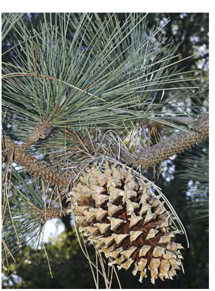
GRAY PINE (Pinus sabiniana) Native Perennial - Pine Family - - - Foothill woodland, n oak woodland, chaparral, infertile soils in mixed-conifer and hardwood forests - Tree < 125' tall. Needles in 3s, 3.5-15" long, gray-green. Cone brownish, seed > wing.