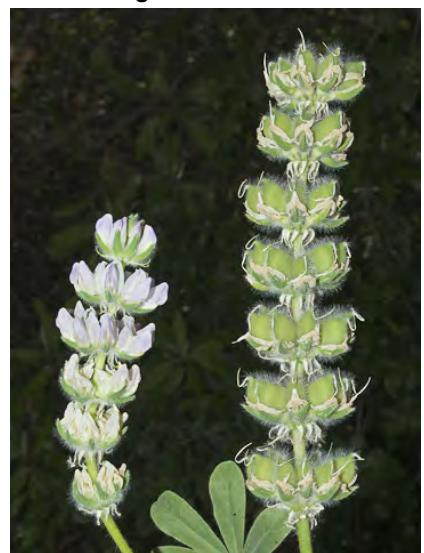
CHICK LUPINE (Lupinus microcarpus var. microcarpus) Native Annual - Pea Family - (Mar–Jun) - Abundant. Open or disturbed areas, occ seeded on roadbanks - Plant 4-32", hairy. Leaves smooth above. Flowers gen pink to purple. Flower bracts shaggy.