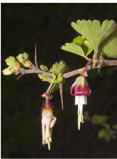
HILLSIDE GOOSEBERRY (Ribes californicum var. californicum) Native Perennial - Gooseberry Family - (Feb-Mar) - Forest openings, woodland - Shrub < 5' tall. Leaf blades 0.4-1.2" long, not sticky. Sepals greenish, petals 0.12" long, white.