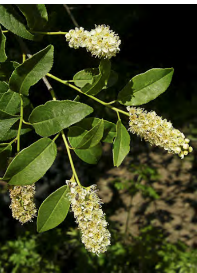
WESTERN CHOKE CHERRY (Prunus virginiana var. demissa) Native Perennial - Rose Family - (May—Jun) - Rocky slopes, canyons, scrubland, oak/pine woodland - Shrub/tree < 20'. Leaf blade 1.2-4" long. Flowers 18+, petals white, 0.16-0.3"