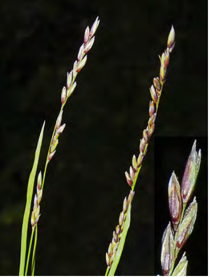
CALIFORNIA MELIC (Melica californica) Native Perennial - Grass Family - (Apr-May) - Open or rocky hillsides, oak woodland, conifer forest - Stem 16-55". Leaf 0.06-0.2" wide. Spiklet 0.2-0.6" long, w/3-7 fertile florets; sterile tip widest above middle, tip squared.