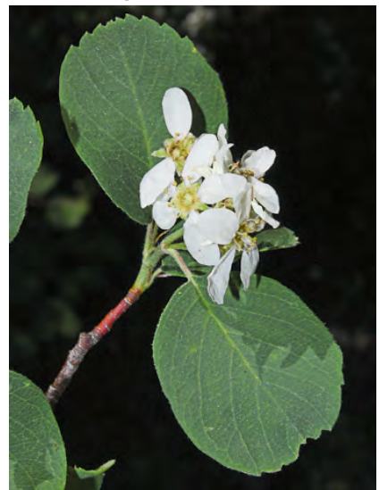
UTAH SERVICE-BERRY (Amelanchier utahensis) Native Perennial - Rose Family - (Apr–Jun) - Open, rocky slopes, canyons, banks of creeks, deserts, conifer forest - Shrub-small tree 2-16'. Leaves deciduous, toothed along outer half of blade.