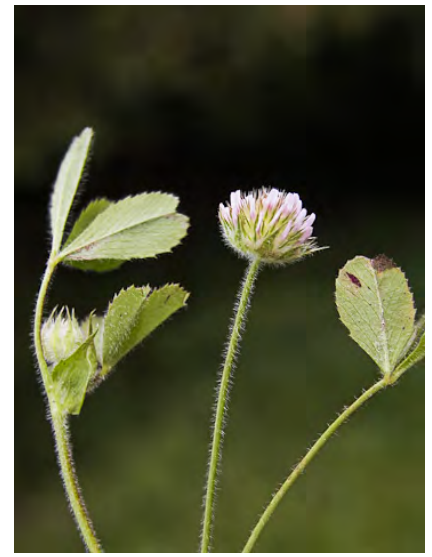
SMALL-HEAD CLOVER (Trifolium microcephalum) Native Annual - Pea Family - (Apr–Aug) - Streambanks, moist, disturbed areas, roadsides, serpentine, conifer forest - Hairy. Head bract cup-like. Flowers pink to lavender, calyx lobes smooth-edged, > flowers.