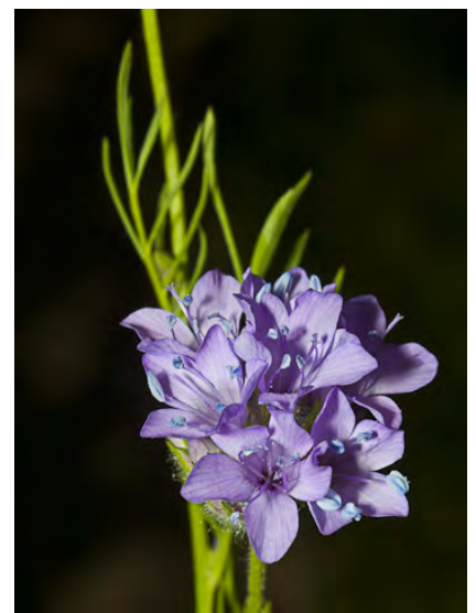
CALIFORNIA GILIA (Gilia achilleifolia subsp. achilleifolia) Native Annual - Phlox Family - (Mar–Jun) - Open or shaded, gen grassy places, sandy or rocky soil - Leaves linear-lobed. Flowers lavender, 0.4-0.8" long, throat > tube, 8-25 in hemispheric head.