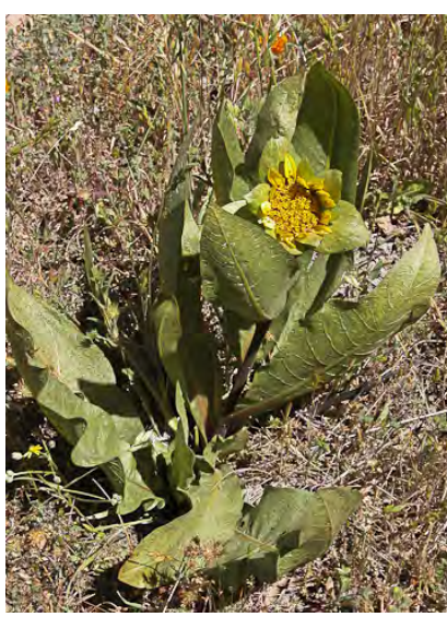
SMOOTH MULE'S EARS (Wyethia glabra) Native Perennial - Sunflower Family - (Mar–Jun) - Gen shady sites - Plant 4-16" tall, shiny green, no woolly hairs. Leaf basal blades 10-18" long, lance-shaped to oval, shiny. Ray flowers 1-2"