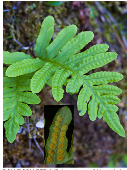
POLYPODY FERN (Polypodium calirhiza) Native Perennial - Polypody Family - - - On plants, rocky cliffs or outcrops, roadcuts, often granitic or volcanic, rarely dunes - Leaf blades 4-8" long, often widest above base, deeply lobed.