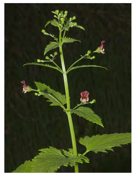
CALIFORNIA FIGWORT (Scrophularia californica) Native Perennial - Snapdragon Family - (Mar–Jul) - Common; damp places, chaparral, roadsides - Stem 2.6-4' tall, square x-section. Leaves opposite, to 7" long, triangular, toothed. Flowers 0.3-0.5" long, upper lips red to maroon, lower paler or yellowish.