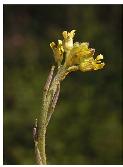
SHORTPOD MUSTARD (Hirschfeldia incana) Naturalized Biennial-Perennial - Mustard Family - (Apr-Oct) - Disturbed areas - Stem 16-60". Longest leaves 1.6-4" long, dense-hairy. Petals pale yellow, ~0.2" long. Fruit appressed. Fall-blooming. INVASIVE.