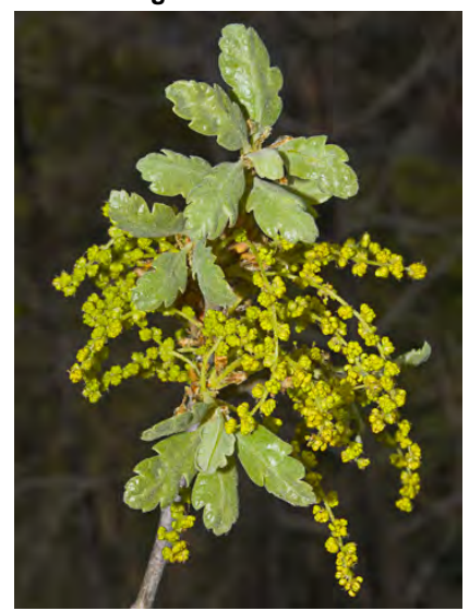
BLUE OAK (Quercus douglasii) Native Perennial - Oak Family - (Apr-May) - Dry slopes, interior foothills, woodland - Tree 20-66', deciduous. Bark checkered into scales. Leaves 1.2-2.4" long, bluish green, unlobed to shallowly lobed, lacking bristles