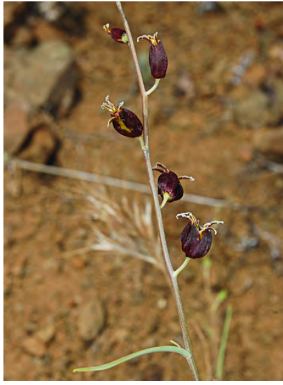
BRISTLY JEWEL FLOWER (Streptanthus glandulosus subsp. glandulosus) Native Annual - Mustard Family - (Apr–Jul) - Serpentine, bare slopes, chaparral & woodland openings - Flower lavender or purple-brown.