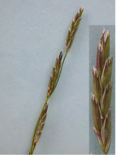
WESTERN MANNA GRASS (Glyceria occidentalis) Native Perennial - Grass Family - (Jun–Aug) - Freshwater marshes, ponds and steams - Stem 28-60" long, often forming floating mats. Leaf blade 8-12" long, 0.16-0.5" wide. Spikelet 0.6-0.8" long.