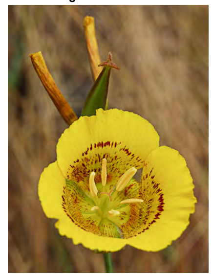
YELLOW MARIPOSA LILY (Calochortus luteus) Native Perennial - Lily Family - (Apr—Jun) - Heavy soils in grassland, woodland, mixed-evergreen forest - Stem 8-20" long. Flowers bell-shaped, deep yellow, 0.8-1.6" long, gen w/inner central red-brown spot.