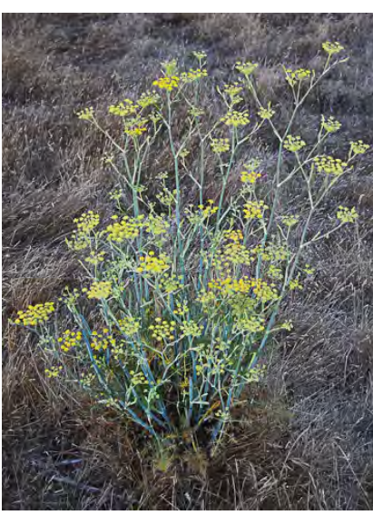
FENNEL (Foeniculum vulgare) Naturalized Perennial - Carrot Family - (May–Sep) - Roadsides, disturbed sites - Plants 3-6.5' tall, anise-scented. Stems waxy-blue, canelike. Flowers yellow. Leaf segments thread-like, edible when young. INVASIVE weed.