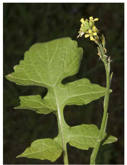
HEDGE MUSTARD (Sisymbrium officinale) Naturalized Annual - Mustard Family - (Apr-Sep) - Disturbed areas, fields, pastures - Stem 10-22" tall, thin, wiry. Petals 0.1-0.16" long, pale yellow. Fruit 0.4-0.55" long, awl-shaped, appressed.