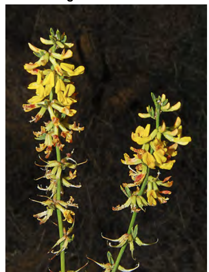
DEERWEED (Acmispon glaber var. glaber) Native Perennial - Pea Family - (Mar–Aug) -Chaparral, roadsides, coastal sands; common -Often shrubby, leaflets 3-6, many clusters of 3-7 stemless flowers, yellow fading to orange-red, 0.3-0.5" long.