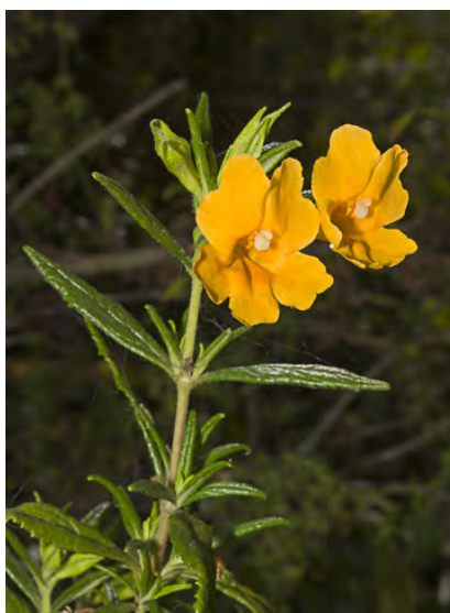
BUSH MONKEYFLOWER (Mimulus aurantiacus var. aurantiacus) Native Perennial - Lopseed Family - (Mar–Jun) - Disturbed areas, coastal cliffs, canyon sides - Shrub 4-60". Flowers yellow, orange or red; 1-2.3" long; bract tube glabrous.