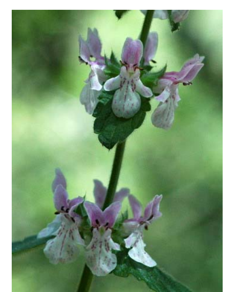
Common Rigid Hedge Nettle Stachys ajugoides var. rigida Native Perennial Mint Family