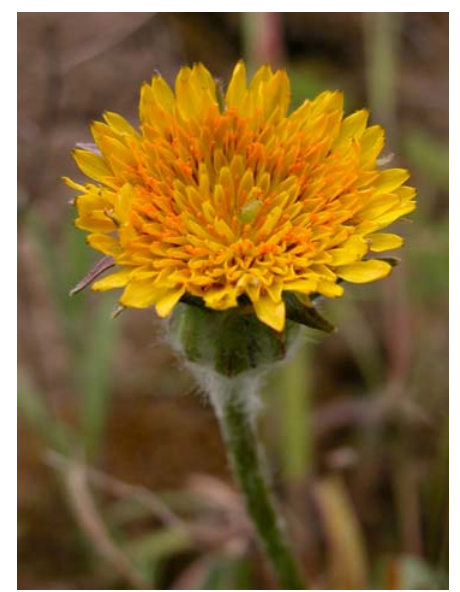
Large-flower Native Dandelion Agoseris grandiflora Native Perennial Sunflower Family