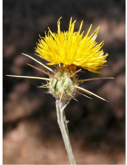
Yellow Star Thistle Centaurea solstitialis Introduced Annual Sunflower Family