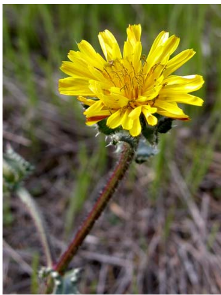
Bristly Ox-tongue Picris echioides Introduced Annual-Biennial Sunflower Family