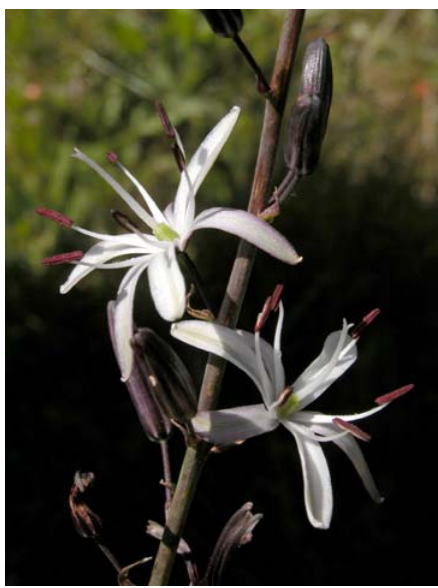
Common Soap Plant Chlorogalum pomeridianum var. pomeridianum Native Perennial Lily Family