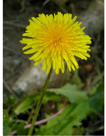
Common Dandelion Taraxacum officinale Introduced Biennial-Perennial Sunflower Family