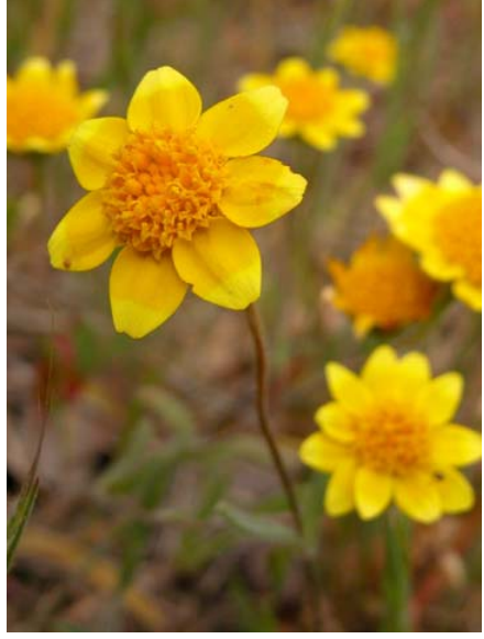
Goldfields Lasthenia californica Native Annual Sunflower Family