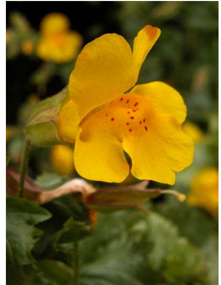
Golden Monkey Flower Minulus guttatus Native Perennial Snapdragon Family