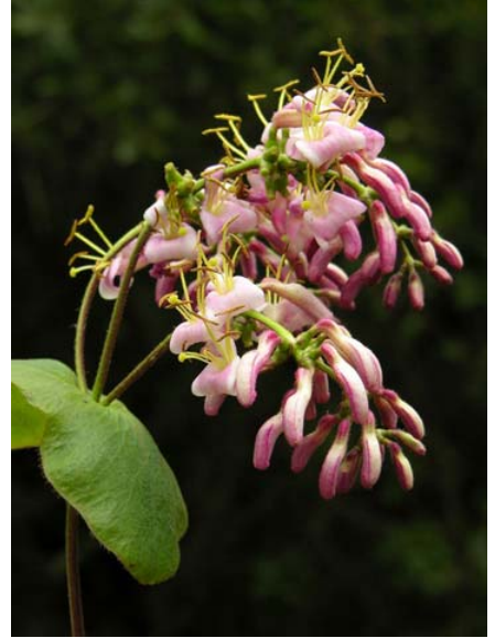
Hairy Vine Honeysuckle Lonicera hispidula var. vacillans Native Perennial Honeysuckle Family