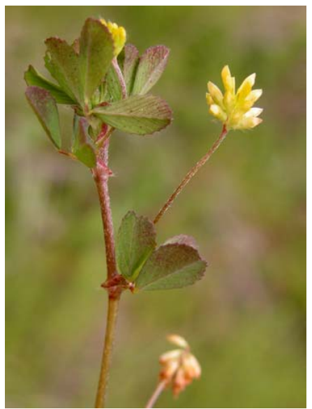
Shamrock Clover Trifolium dubium Introduced Annual Pea Family