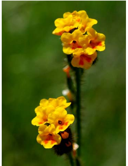
Bentflower Fiddleneck Amsinckia lunaris Native Annual Borage Family