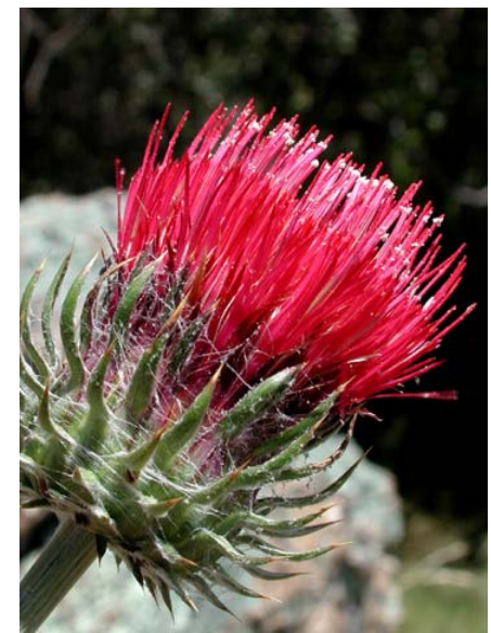
Venus / Cobweb Thistle Cirsium occidentale var. venustum Native Biennial Sunflower Family