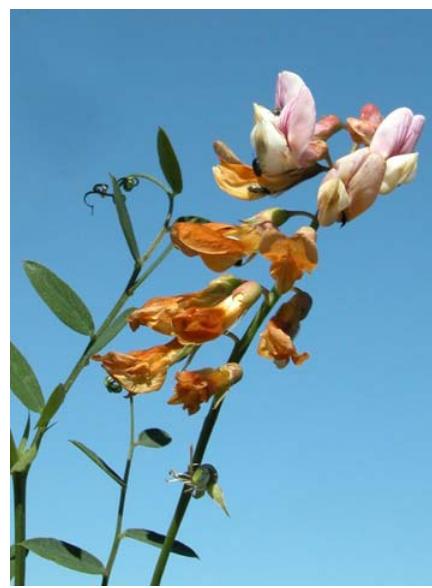
Pale Purple Pacific Pea Lathyrus vestitus var. vestitus Native Perennial Pea Family