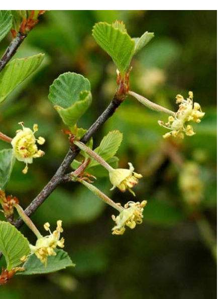
Birch-leaf Mt. Mahogany Cercocarpus betuloides var. betuloides Native Perennial Rose Family