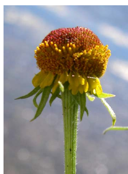
Rosilla Helenium puberulum Native Biennial Sunflower Family