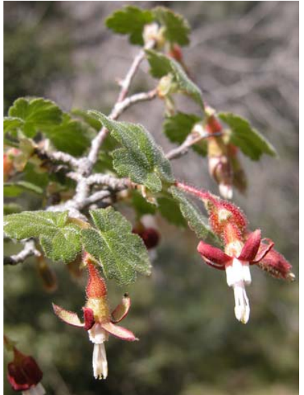
Canyon Gooseberry Ribes menziesii Native Perennial Gooseberry Family