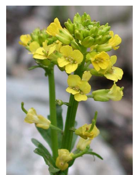
Erect-pod Winter Cress Barbarea orthoceras Native Perennial Mustard Family