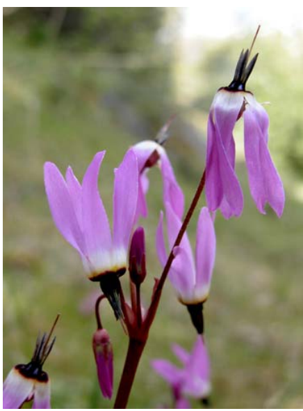
Mosquitobills Shooting Star Dodecatheon hendersonii Native Perennial Primrose Family