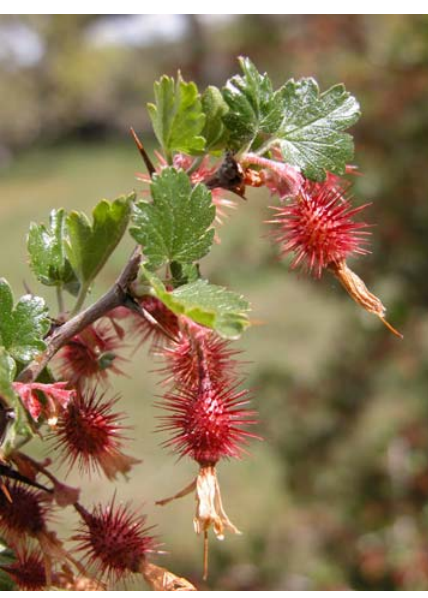
Hillside Gooseberry Ribes californicum var. californicum Native Perennial Gooseberry Family