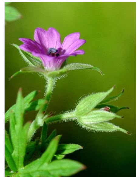
Purpletip Cut-leaf Geranium Geranium dissectum Introduced Annual Geranium Family