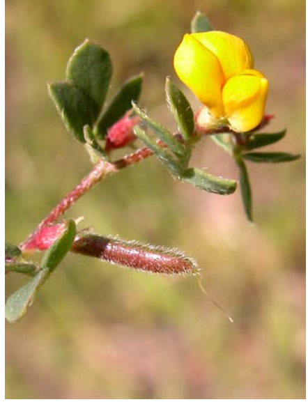
California Lotus Lotus wrangelianus Native Annual Pea Family