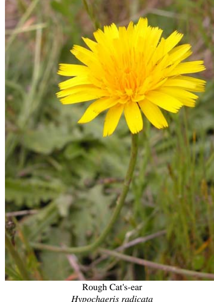
Rough Cat's-ear Hypochaeris radicata Introduced Perennial Sunflower Family