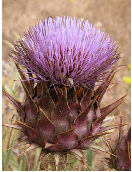
Cardoon / Artichoke Thistle Cynara cardunculus Introduced Perennial Sunflower Family