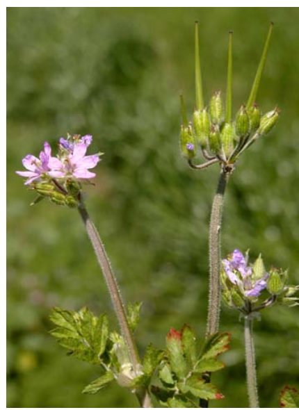
White-stem Filaree Erodium moschatum Introduced Annual Geranium Family