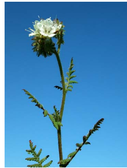
Wild Heliotrope Phacelia Phacelia distans Native Annual Waterleaf Family