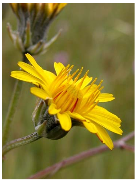
Dandelion-leaf Hawk's-beard Crepis vesicaria ssp. taraxifolia Introduced Annual-Biennial Sunflower Family