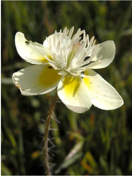
Cream Cups Platystemon californicus Native Annual Poppy Family