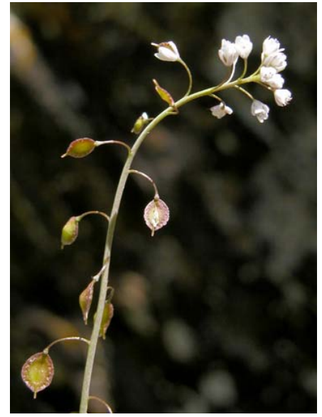
Hairy Fringepod Thysanocarpus curvipes Native Annual Mustard Family