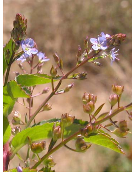
American Brooklime Speedwell Veronica americana Native Perennial Snapdragon Family