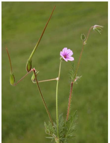
Long-beaked Filaree Erodium botrys Introduced Annual Geranium Family