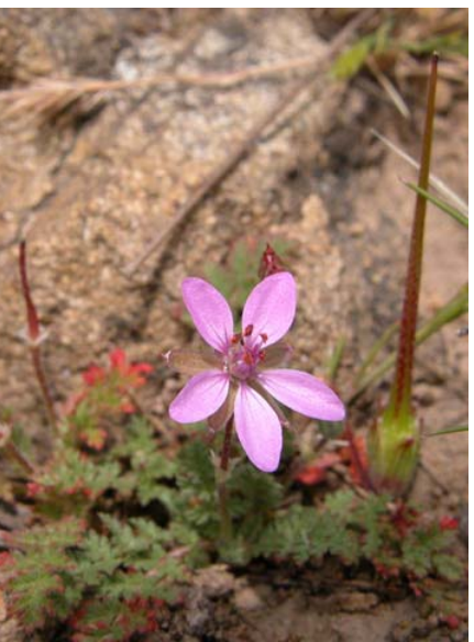
Red-stem Filaree Erodium cicutarium Introduced Annual Geranium Family