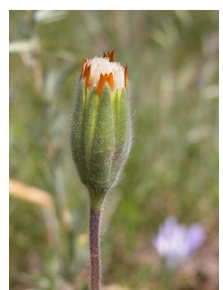
Blow Wives Achyrachaena mollis Native Annual Sunflower Family