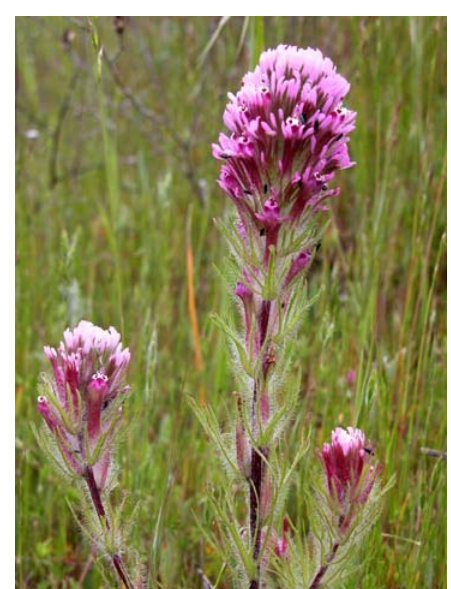
Purple Owl's Clover Castilleja exserta ssp. exserta Native Annual Snapdragon Family