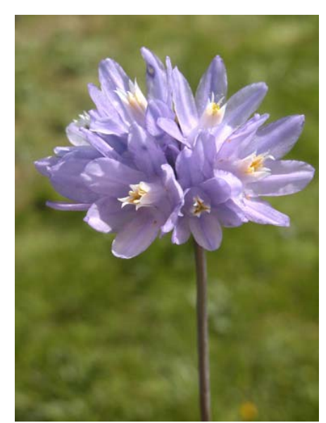
Blue Dicks Dichelostemma capitatum ssp. capitatum Native Perennial Lily Family