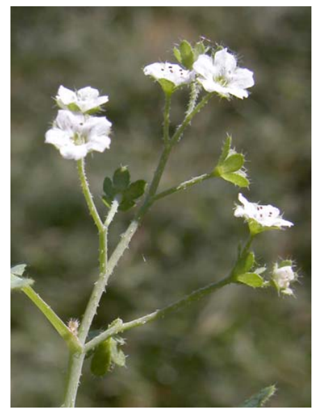
White Fiesta Flower Pholistoma membranaceum Native Annual Waterleaf Family