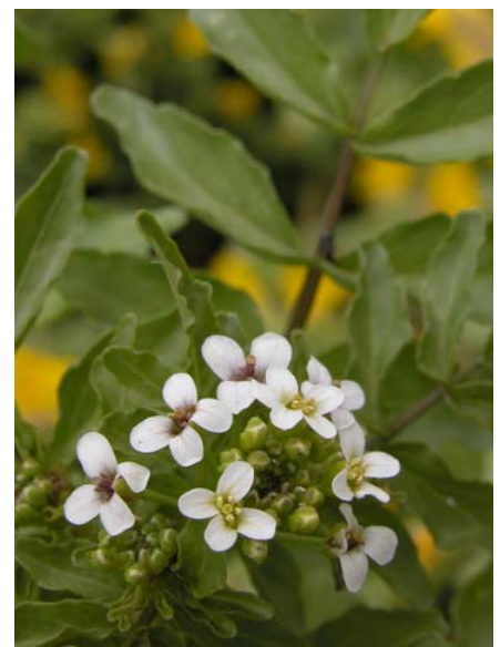
White Water Cress Rorippa nasturtium-aquaticum Native Perennial Mustard Family