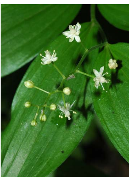
Starry False Solomon's Seal Smilacina stellata Native Perennial Lily Family