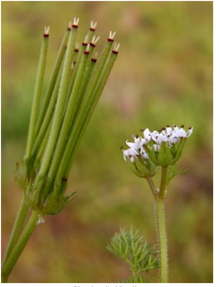
Shepherd's Needle Scandix pecten-veneris Introduced Annual Carrot Family