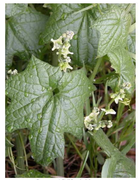
Common / California Manroot Marah fabaceus Native Perennial Gourd Family