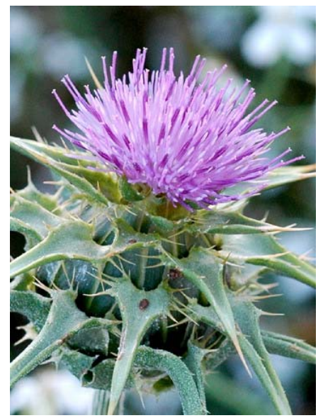
Milk Thistle Silybum marianum Introduced Annual-Biennial Sunflower Family