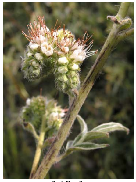
Rock Phacelia Phacelia imbricata ssp. imbricata Native Perennial Waterleaf Family