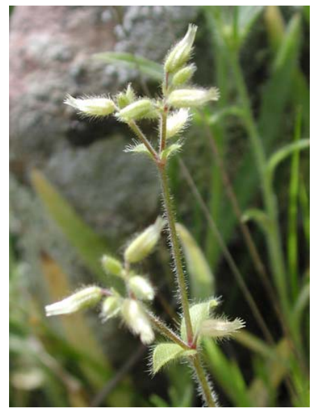
Mouse-ear Chickweed Cerastium glomeratum Introduced Annual Pink Family