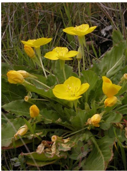
Golden Eggs Suncup Camissonia ovata Native Perennial Evening Primrose Family