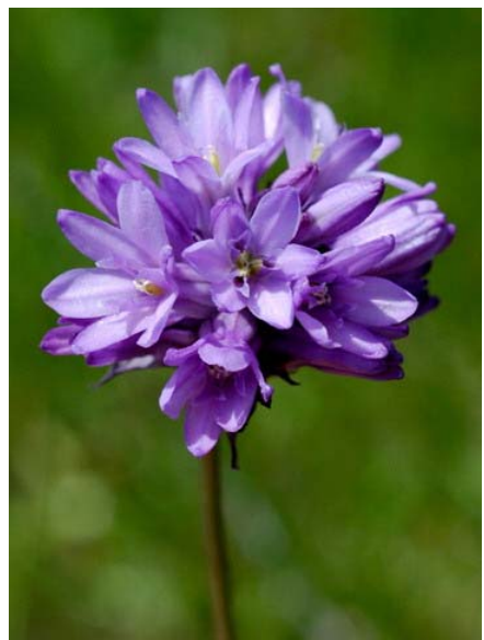
Ookow Dichelostemma congestum Native Perennial Lily Family