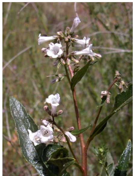
Yerba Santa Eriodictyon californicum Native Perennial Waterleaf Family