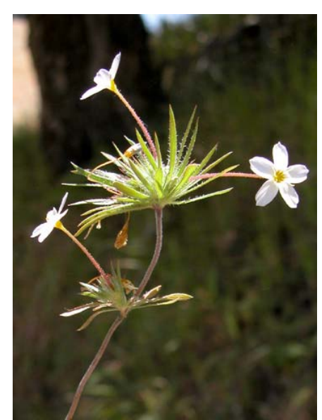
Pinklobe Linanthus Linanthus androsaceus Native Annual Phlox Family