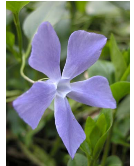
Greater Periwinkle Vinca major Introduced Perennial Dogbane Family