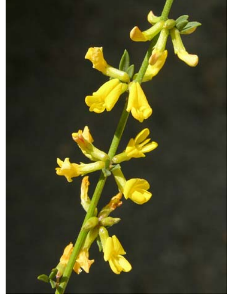
Deerweed Lotus scoparius var. scoparius Native Perennial Pea Family