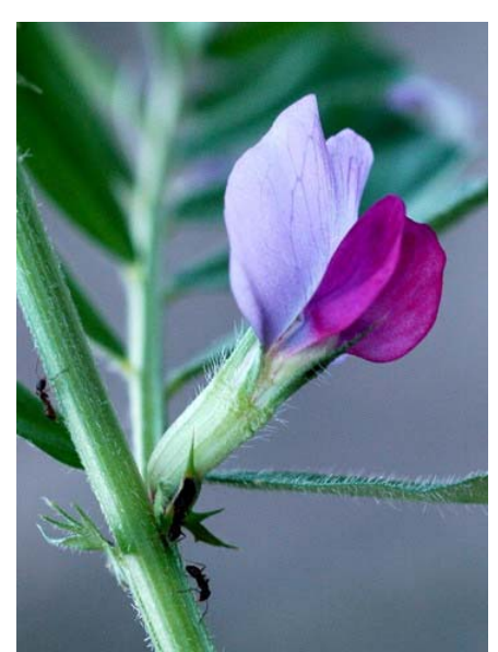
Spring Vetch Vicia sativa ssp. sativa Introduced Annual Pea Family