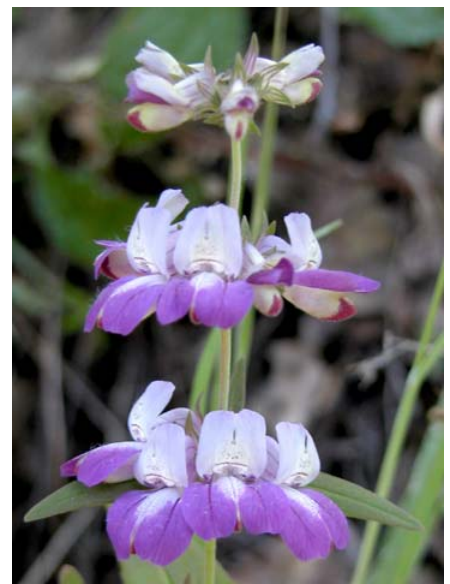
Chinese Houses Collinsia heterophylla Native Annual Snapdragon Family