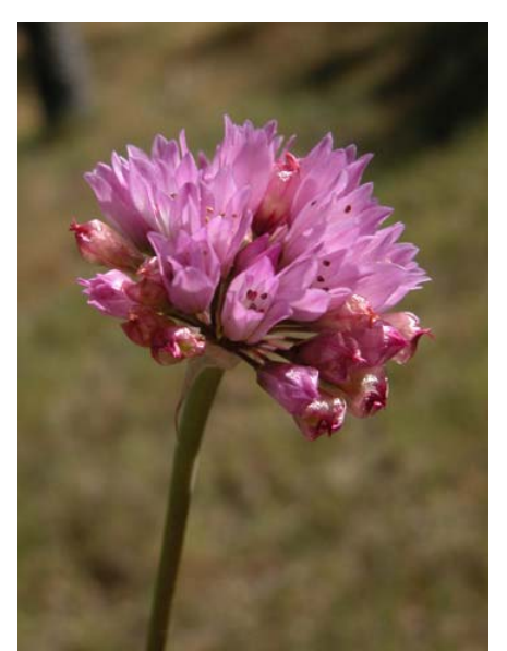
Pink / Serrated Onion Allium serra Native Perennial Lily Family