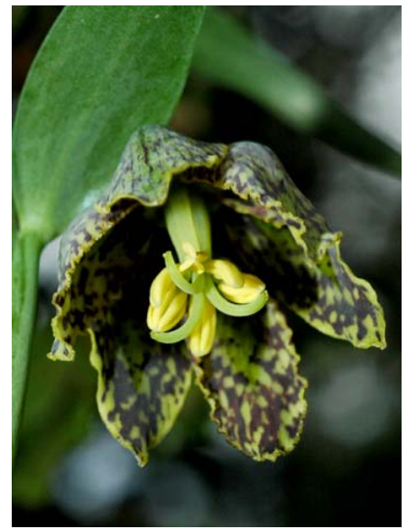
Checker Lily Fritillaria affinis var. affinis Native Perennial Lily Family