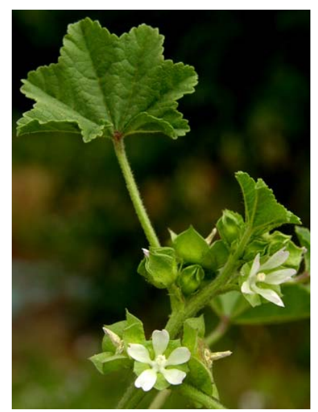
Hidden-flower Cheeseweed Malva parviflora Introduced Annual Mallow Family