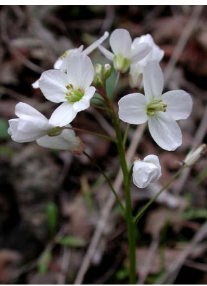
Milkmaids Cardamine californica Native Perennial Mustard Family