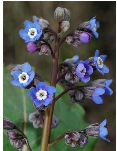
Large Hound's Tongue Cynoglossum grande Native Perennial Borage Family