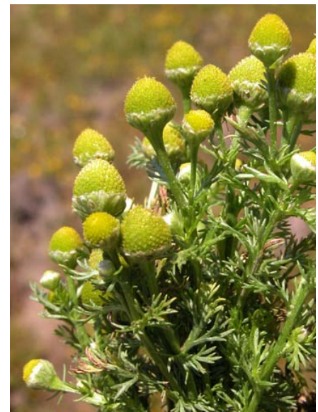
Pineapple Weed Chamomilla suaveolens Introduced Annual Sunflower Family