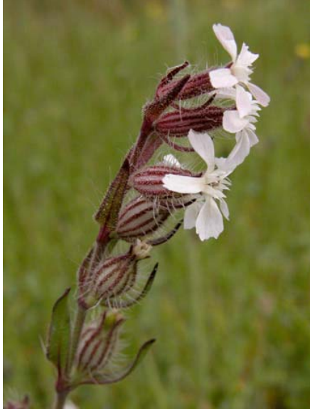
Windmill Pink Silene gallica Introduced Annual Pink Family