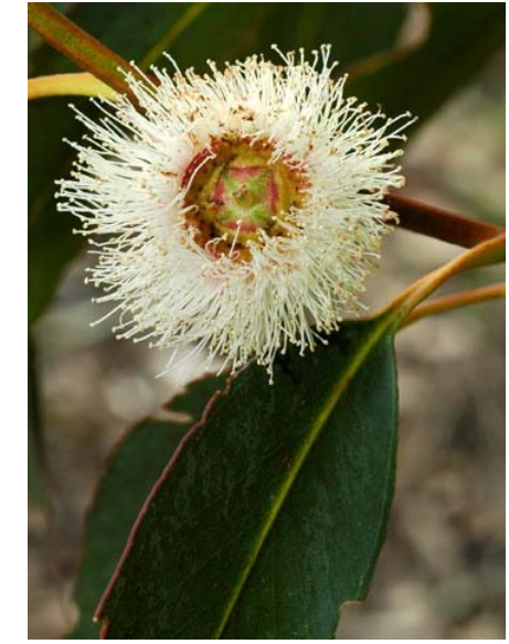
Blue Gum Eucalyptus globulus Introduced Perennial Myrtle Family