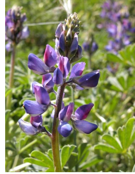
Arroyo Lupine Lupinus succulentus Native Annual Pea Family