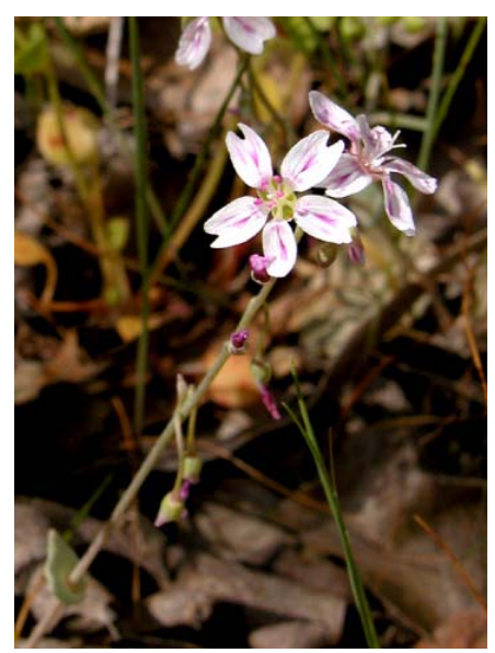
Common Pale Claytonia Claytonia exigua ssp. exigua Native Annual Purslane Family