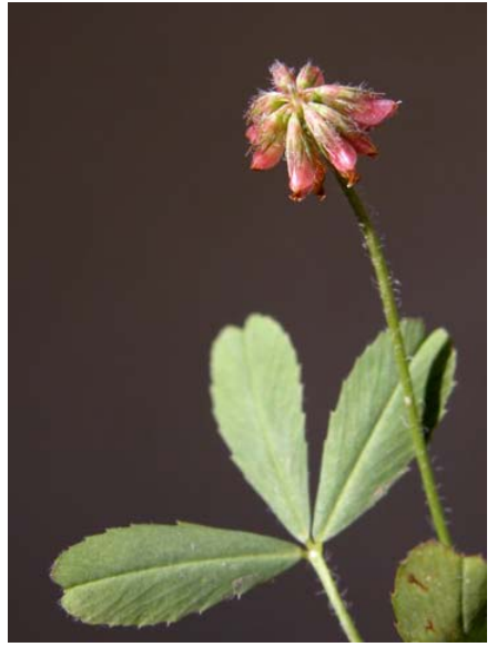
Tree Clover Trifolium ciliolatum Native Annual Pea Family