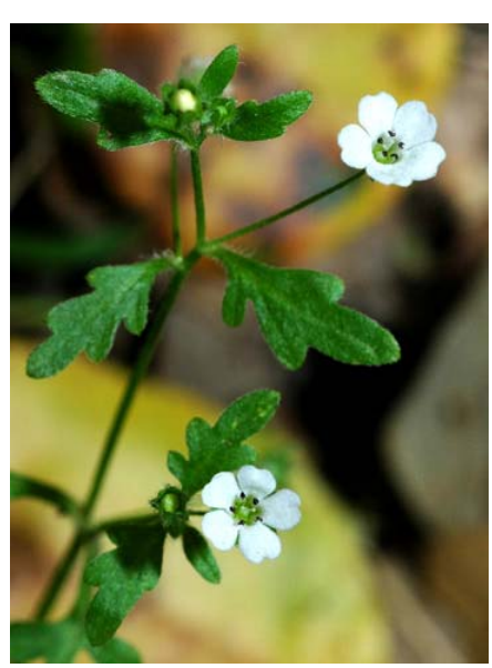
Variable-leaf Nemophila Nemophila heterophylla Native Annual Waterleaf Family