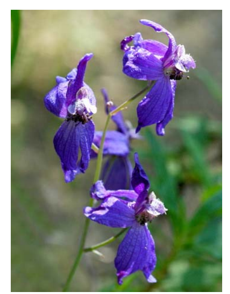
Royal Larkspur Delphinium variegatum ssp. variegatum Native Perennial Buttercup Family