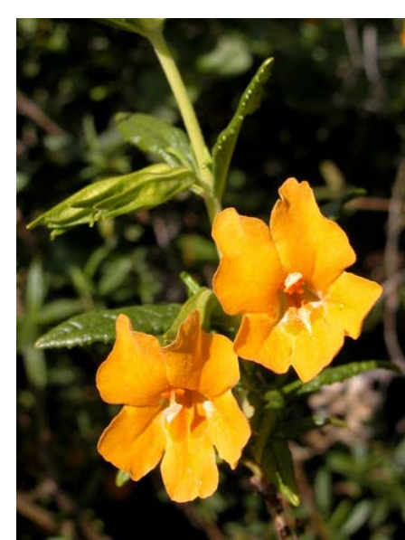
Bush Monkey Flower Mimulus aurantiacus Native Perennial Snapdragon Family