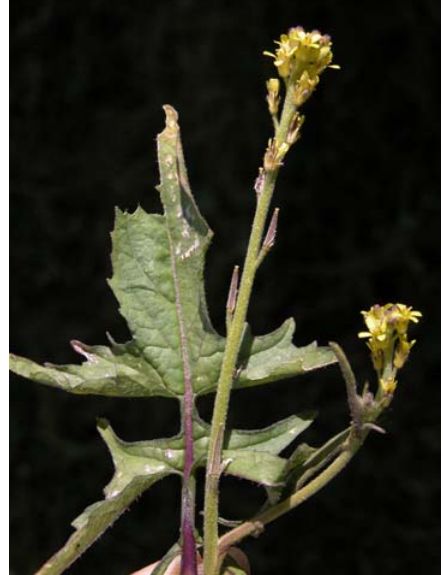
Black Mustard Brassica nigra Introduced Annual Mustard Family