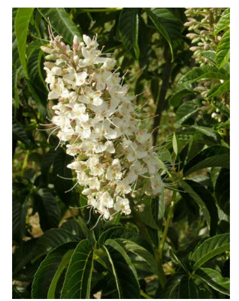
California Buckeye Aesculus californica Native Perennial Buckeye Family