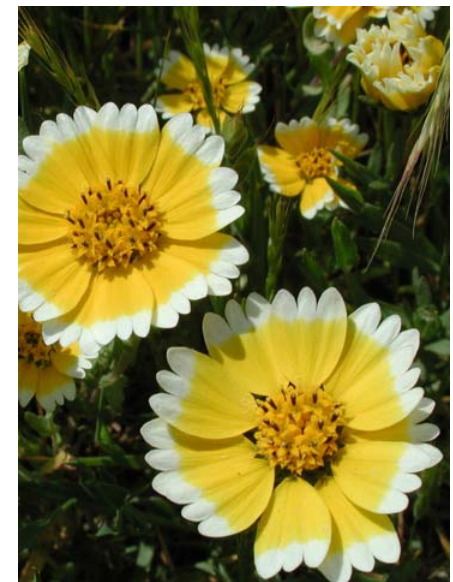
Common Tidytips Layia platyglossa Native Annual Sunflower Family