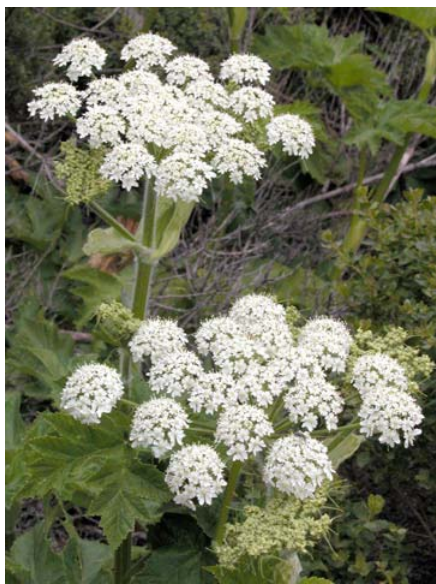
Cow Parsnip Heracleum lanatum Native Perennial Carrot Family