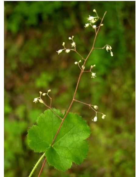
Small-flower Alumroot Heuchera micrantha Native Perennial Saxifrage Family