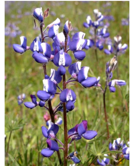
Miniature Dove Lupine Lupinus bicolor Native Annual Pea Family