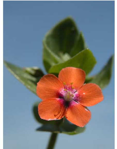
Scarlet Pimpernel Anagallis arvensis Introduced Annual Primrose Family