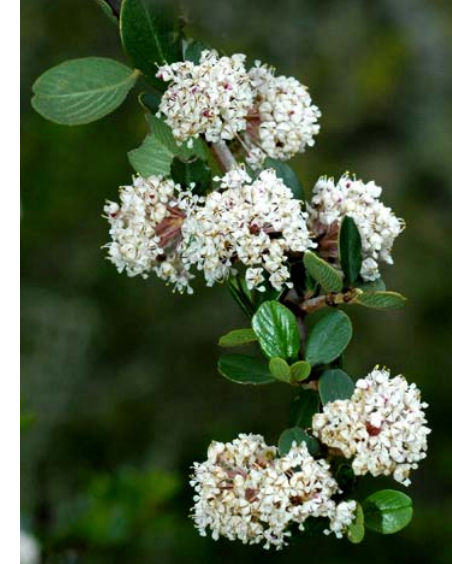
Buckbrush Ceanothus cuneatus var. cuneatus Native Perennial Buckthorn Family