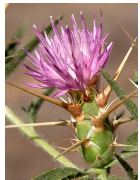
Purple Star Thistle Centaurea calcitrapa Introduced Annual-Biennial Sunflower Family