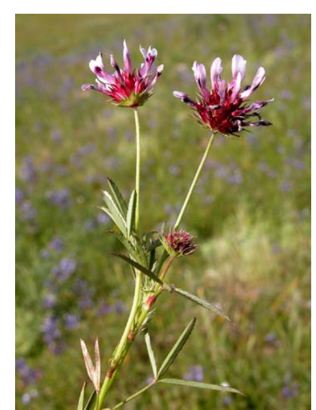
Tomcat Clover Trifolium willdenovii Native Annual Pea Family