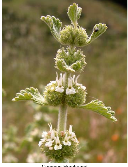
Common Horehound Marrubium vulgare Introduced Perennial Mint Family