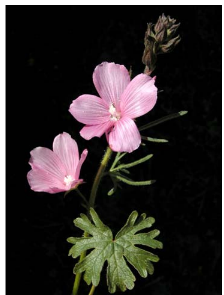
Common Checkerbloom Sidalcea malvaeflora ssp. malvaeflora Native Perennial Mallow Family