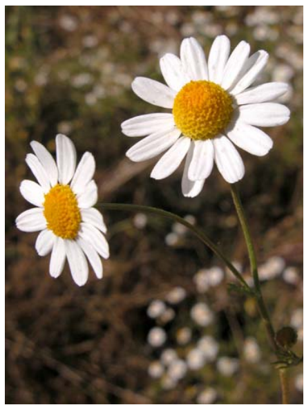
Mayweed Anthemis cotula Introduced Annual Sunflower Family