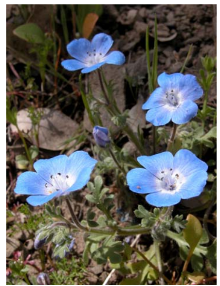
Baby Blue-eyes Nemophila menziesii var. menziesii Native Annual Waterleaf Family