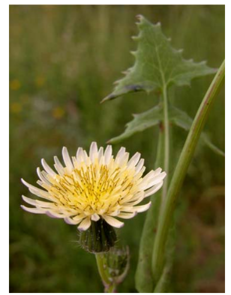
Common Sow Thistle Sonchus oleraceus Introduced Annual Sunflower Family