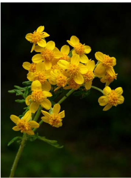
Golden Yarrow Eriophyllum confertiflorum var. confertiflorum Native Perennial Sunflower Family