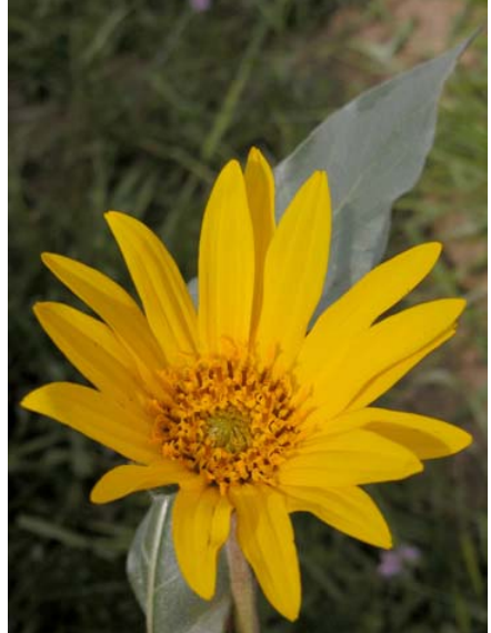
Narrow-leaf Mule's Ear Wyethia angustifolia Native Perennial Sunflower Family