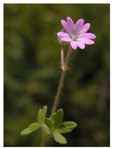
Hairy Dove's Foot Geranium Geranium molle Introduced Annual Geranium Family