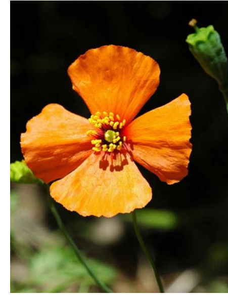
Wind Poppy Stylomecon heterophylla Native Annual Poppy Family