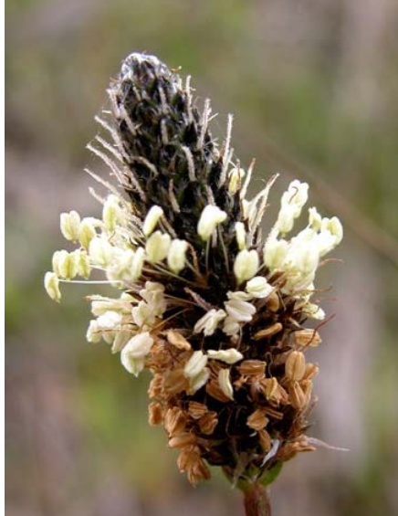
English Plantain Plantago lanceolata Introduced Annual Plantain Family