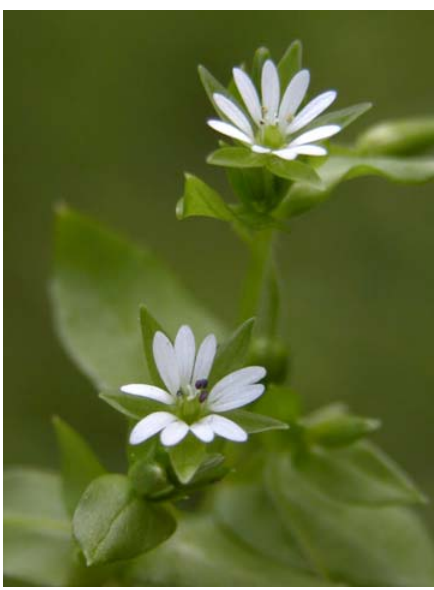
Common Chickweed Stellaria media Introduced Annual Pink Family