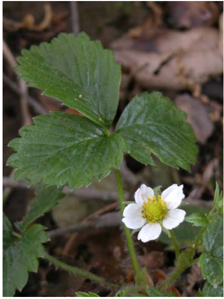
Woodland Strawberry Fragaria vesca Native Perennial Rose Family