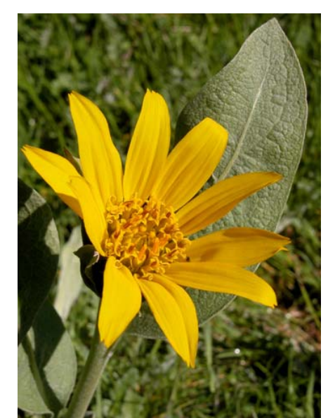
Gray Mule's Ear Wyethia helenioides Native Perennial Sunflower Family