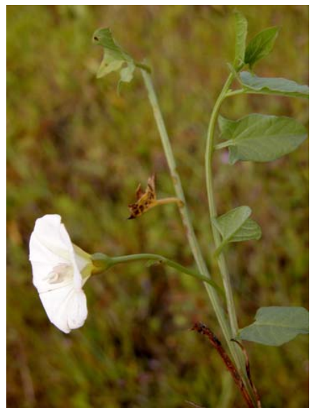
Field Bindweed Convolvulus arvensis Introduced Perennial Morning-Glory Family