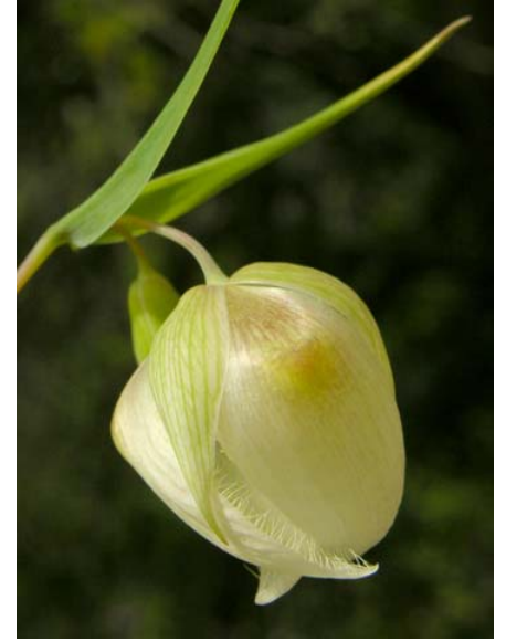
White Fairy Lantern Calochortus albus Native Perennial Lily Family