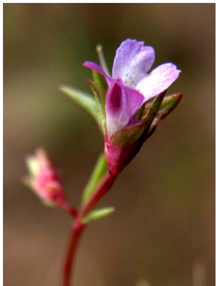
Few-flowered Collinsia Collinsia sparsiflora var. collina Native Annual Snapdragon Family