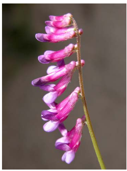
Winter Vetch Vicia villosa ssp. varia Introduced Annual-Biennial Pea Family