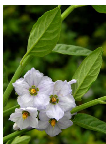
Blue Witch Solanum umbelliferum Native Perennial Nightshade Family