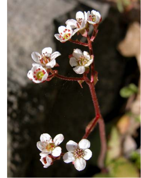
California Saxifrage Saxifraga californica Native Perennial Saxifrage Family