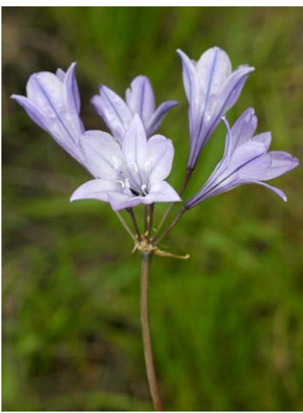
Ithuriel's Spear Triteleia laxa Native Perennial Lily Family