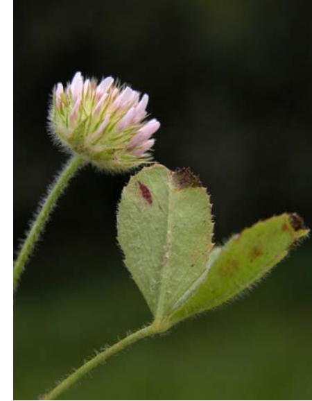
Small-head Clover Trifolium microcephalum Native Annual Pea Family