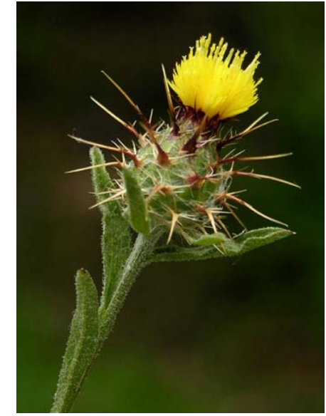
Tocalote Centaurea melitensis Introduced Annual Sunflower Family