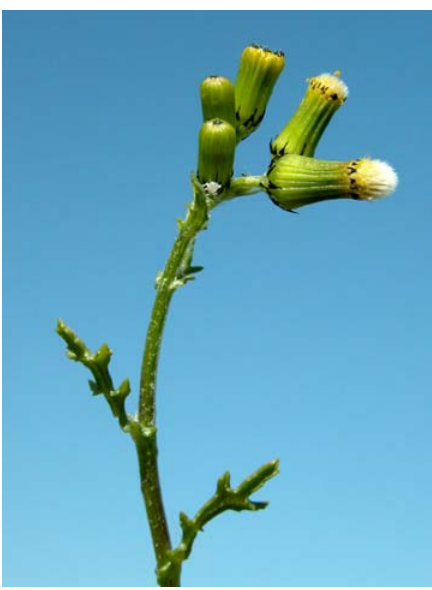
Common Groundsel Senecio vulgaris Introduced Annual Sunflower Family