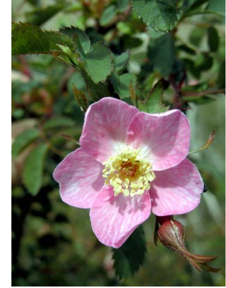
California Wild Rose Rosa californica Native Perennial Rose Family