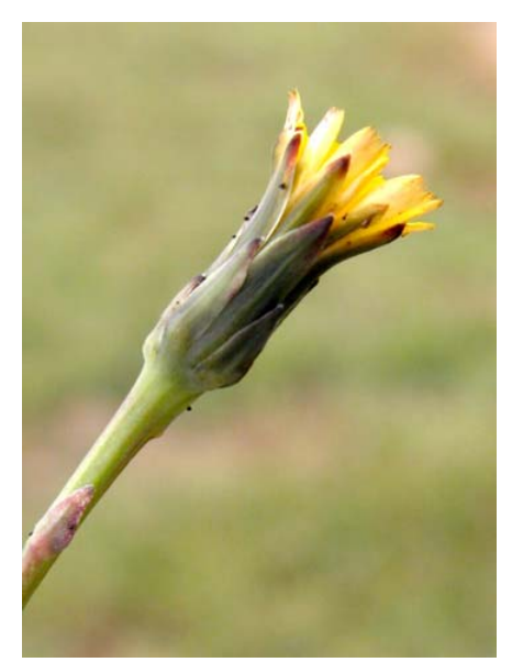
Smooth Cat's-ear Hypochaeris glabra Introduced Annual Sunflower Family