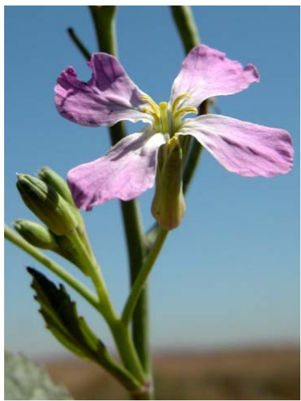
Wild Radish Raphanus sativus Introduced Annual Mustard Family