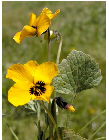
Johnny-Jump-Up / Wild Pansy Viola pedunculata Native Perennial Violet Family