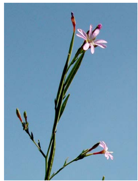
Panicled / Weedy Willowherb Epilobium brachycarpum Native Annual Evening Primrose Family