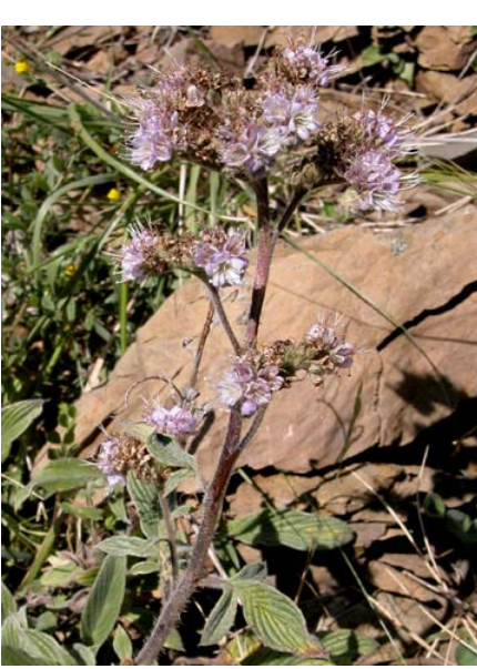
California / Rock Phacelia Phacelia californica Native Perennial Waterleaf Family