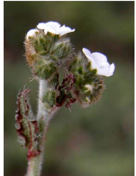
Nievitas Popcorn Flower Plagiobothrys nothofulvus Native Annual Borage Family