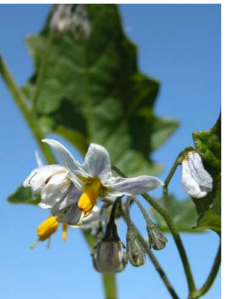
Black Nightshade Solanum nigrum Introduced Annual Nightshade Family