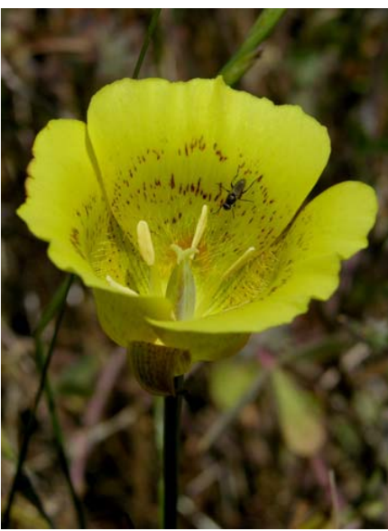
Yellow Mariposa Lily Calochortus luteus Native Perennial Lily Family