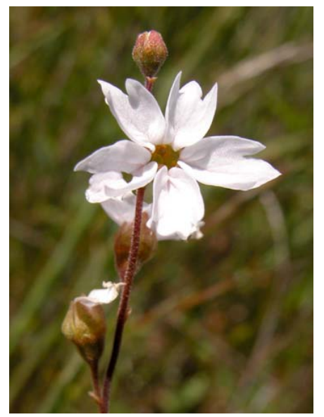
Woodland Star Lithophragma affine Native Perennial Saxifrage Family