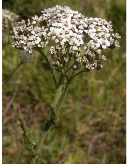
Yarrow Achillea millefolium Native Perennial Sunflower Family