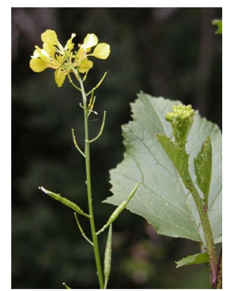
Yellow Charlock Sinapis arvensis Introduced Annual Mustard Family