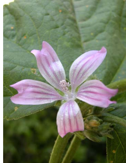
Bull Mallow Malva nicaeensis Introduced Annual Mallow Family