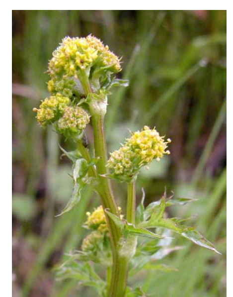
Pacific Woodland Sanicle Sanicula crassicaulis Native Perennial Carrot Family