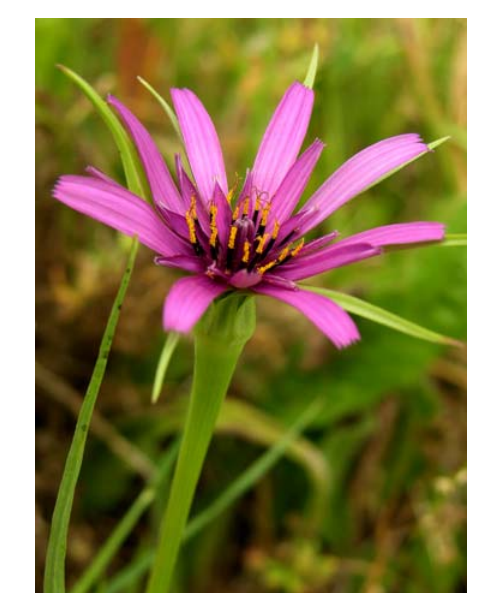
Purple Salsify Tragopogon porrifolius Introduced Biennial-Perennial Sunflower Family