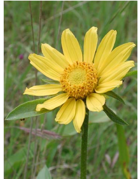
Mt. Diablo Helianthella Helianthella castanea Native Perennial Sunflower Family