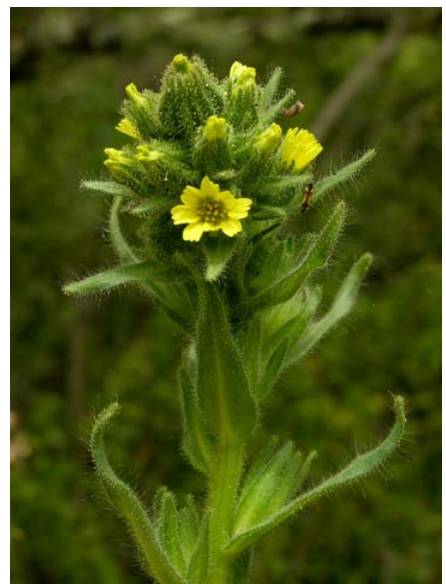
Common / Coast Tarweed Madia sativa Native Annual Sunflower Family