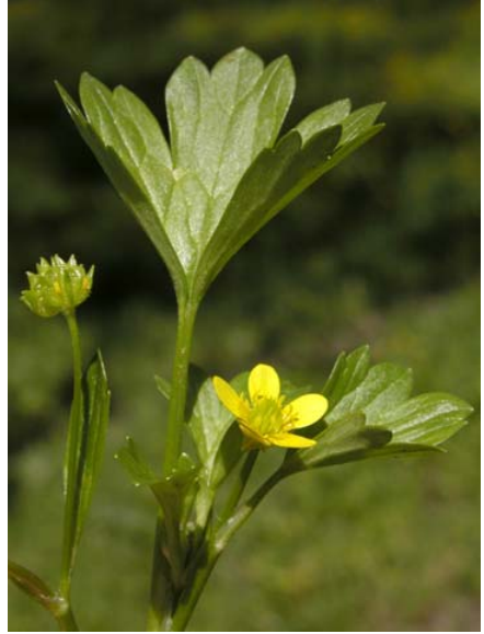
Prickleseed Buttercup Ranunculus muricatus Introduced Annual Buttercup Family