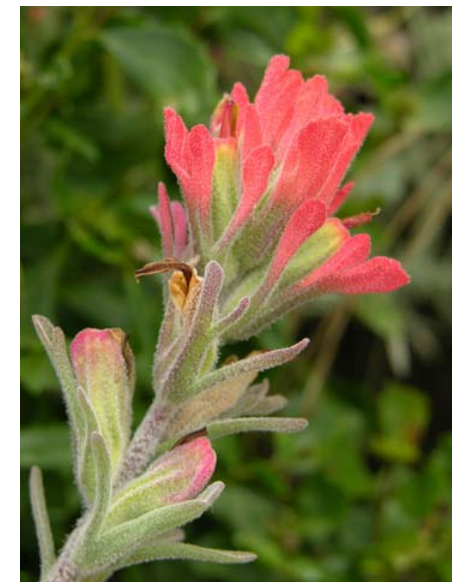
Woolly Paintbrush Castilleja foliolosa Native Perennial Snapdragon Family