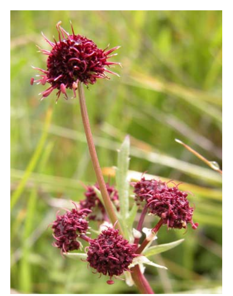
Purple Sanicle Sanicula bipinnatifida Native Perennial Carrot Family