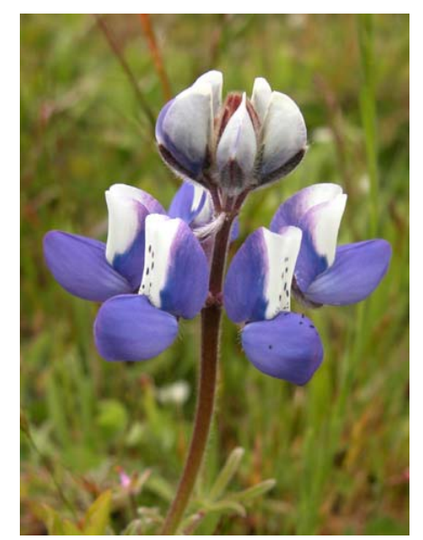
Douglas Sky Lupine Lupinus nanus Native Annual Pea Family