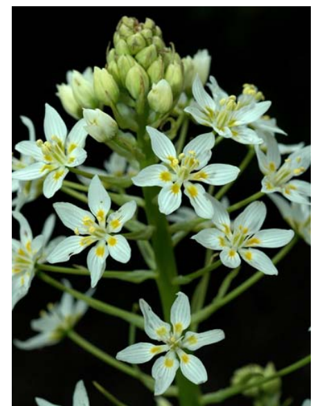
Common Star Lily Zigadenus fremontii Native Perennial Lily Family