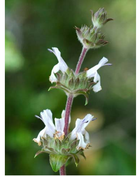
Black Sage Salvia mellifera Native Perennial Mint Family