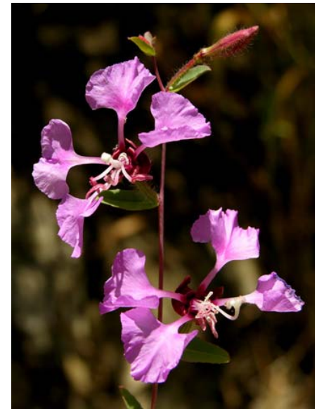
Elegant Clarkia Clarkia unguiculata Native Annual Evening Primrose Family