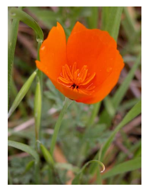
California Poppy Eschscholzia californica Native Perennial Poppy Family