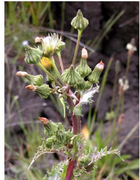
Prickly Sow Thistle Sonchus asper ssp. asper Introduced Annual Sunflower Family