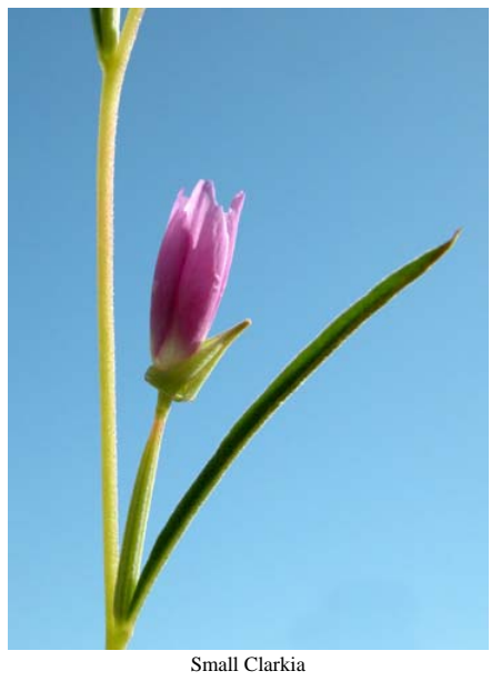
Small Clarkia Clarkia affinis Native Annual Evening Primrose Family