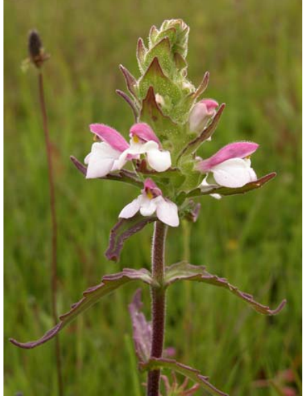
Bellardia Bellardia trixago Introduced Annual Snapdragon Family