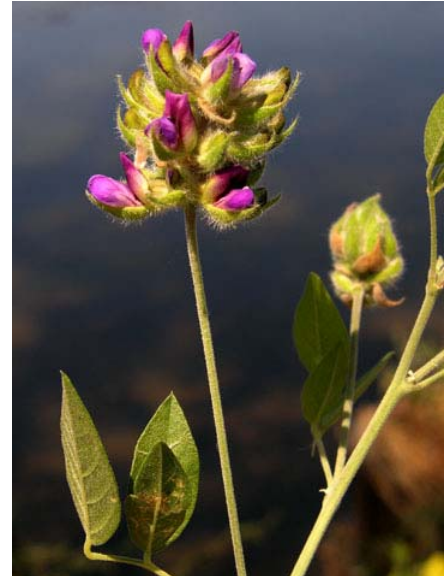
California Tea Rupertia physodes Native Perennial Pea Family