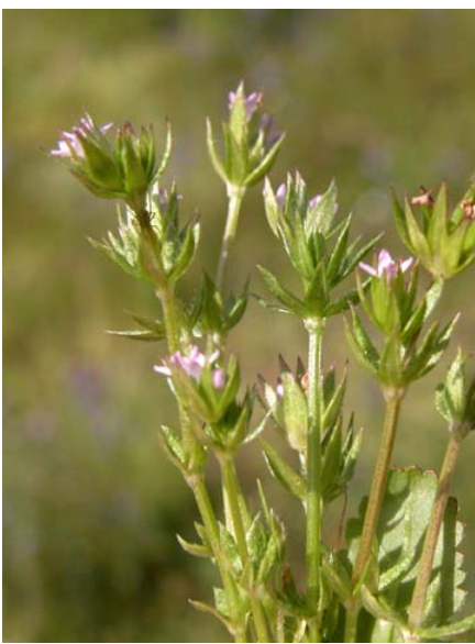
Blue Field Madder Sherardia arvensis Introduced Annual Madder Family