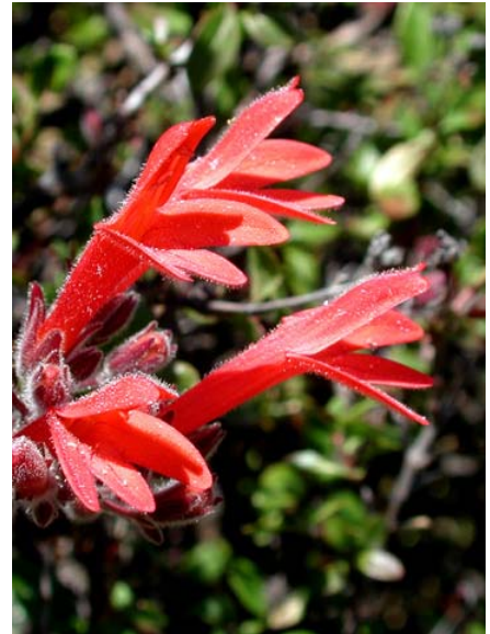
California Fuchsia Epilobium canum ssp. canum Native Perennial Evening Primrose Family