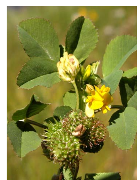
California Bur Clover Medicago polymorpha Introduced Annual Pea Family