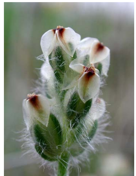
California Dwarf Plantain Plantago erecta Native Annual Plantain Family