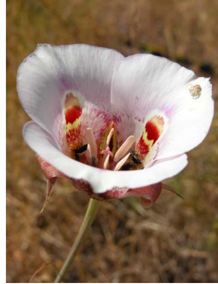
White Butterfly Mariposa Lily Calochortus venustus Native Perennial Lily Family