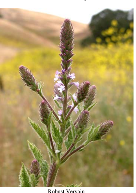
Robust Vervain Verbena lasiostachys var. scabrida Native Perennial Vervain Family