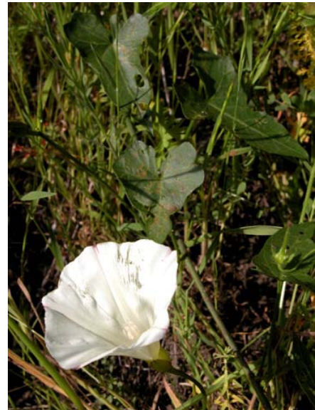
Climbing Morning Glory Calystegia purpurata ssp. purpurata Native Perennial Morning-Glory Family