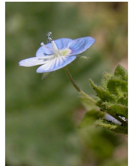
Persian Speedwell Veronica persica Introduced Annual Snapdragon Family