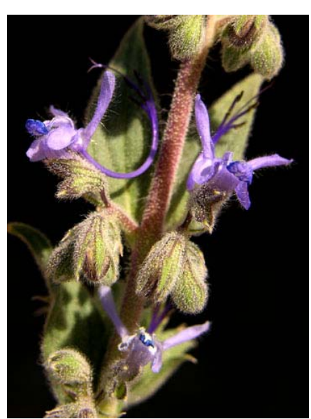
Vinegar Weed Trichostema lanceolatum Native Annual Mint Family