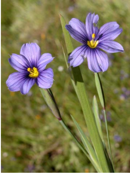
Blue-eyed Grass Sisyrinchium bellum Native Perennial Iris Family