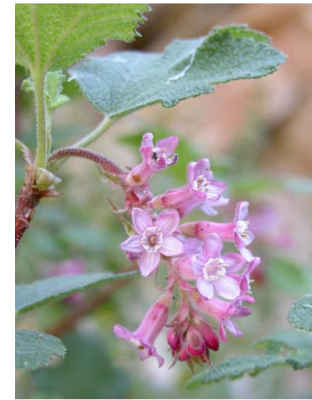
Chaparral Currant Ribes malvaceum var. malvaceum Native Perennial Gooseberry Family