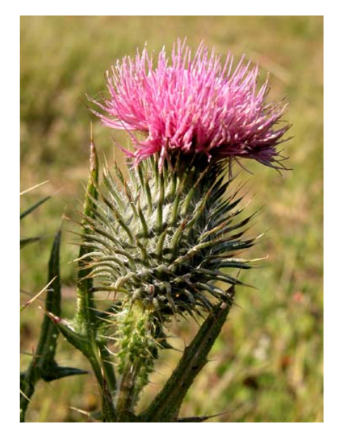
Bull Thistle Cirsium vulgare Introduced Biennial Sunflower Family