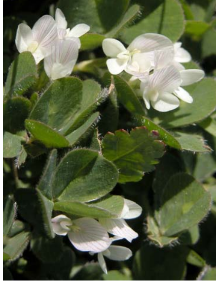
Subterranean Clover Trifolium subterraneum Introduced Annual Pea Family