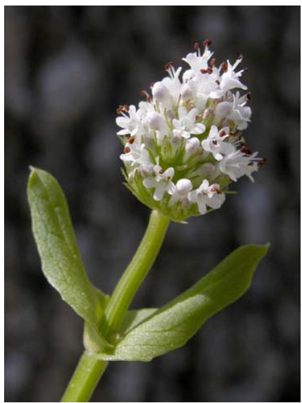
Longhorn Plectritis Plectritis macrocera Native Annual Valerian Family