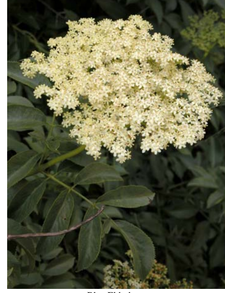
Blue Elderberry Sambucus mexicana Native Perennial Honeysuckle Family