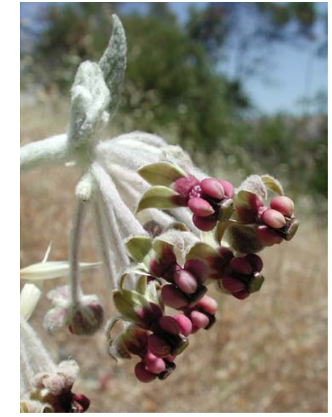
California Milkweed Asclepias californica Native Perennial Milkweed Family