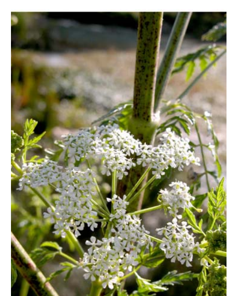
Poison Hemlock Conium maculatum Introduced Biennial Carrot Family