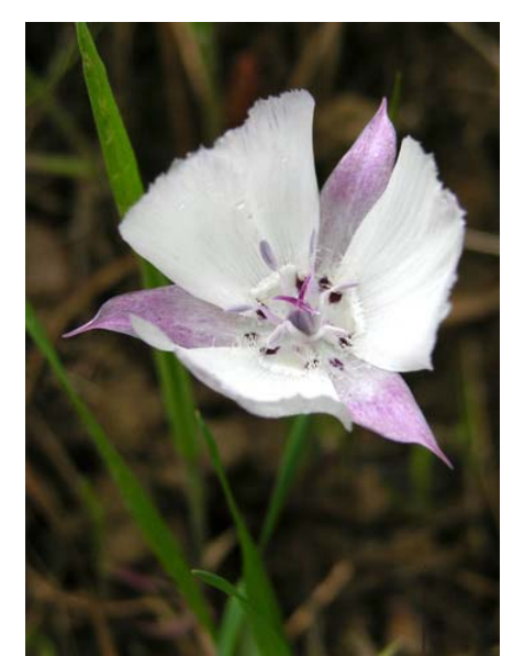
Oakland Star Tulip Calochortus umbellatus Native Perennial Lily Family