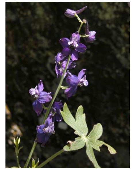
Coast Larkspur Delphinium decorum ssp. decorum Native Perennial Buttercup Family