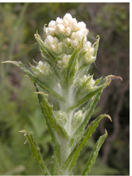
California Everlasting Gnaphalium californicum Native Biennial Sunflower Family