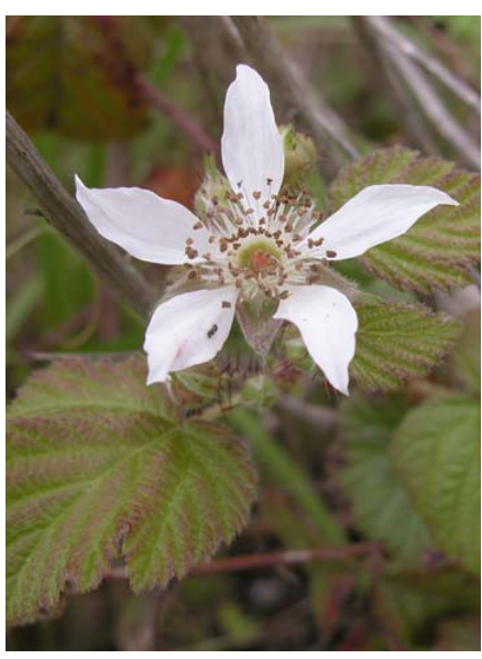
Native California Blackberry Rubus ursinus Native Perennial Rose Family