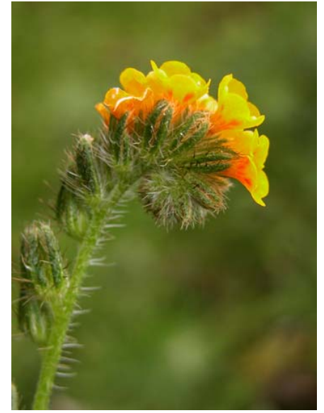
Common Fiddleneck Amsinckia menziesii var. intermedia Native Annual Borage Family