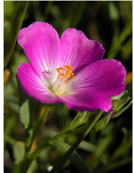
Magenta Red Maids Calandrinia ciliata Native Annual Purslane Family