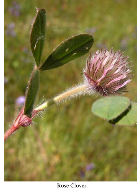
Rose Clover Trifolium hirtum Introduced Annual Pea Family