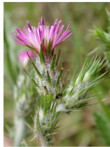
Italian Thistle Carduus pycnocephalus Introduced Annual Sunflower Family