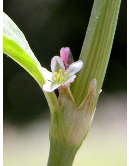
Common Yard Knotweed Polygonum arenastrum Introduced Annual Buckwheat Family