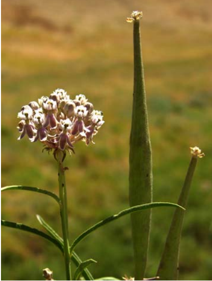
Whorled/Narrow-leaf Milkweed Asclepias fascicularis Native Perennial Milkweed Family