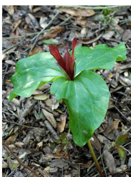
Giant Trillium Trillium chloropetalum Native Perennial Lily Family