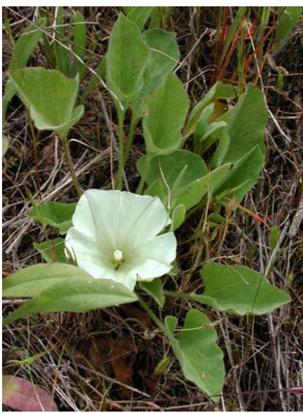
Shortstem Morning Glory Calystegia subacaulis ssp. subacaulis Native Perennial Morning-Glory Family