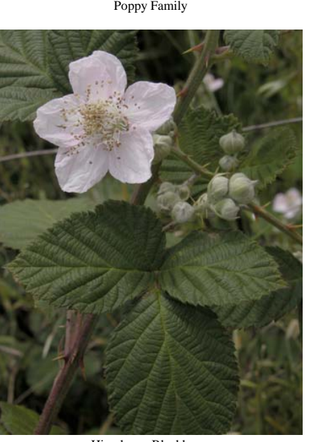
Himalayan Blackberry Rubus discolor Introduced Perennial Rose Family