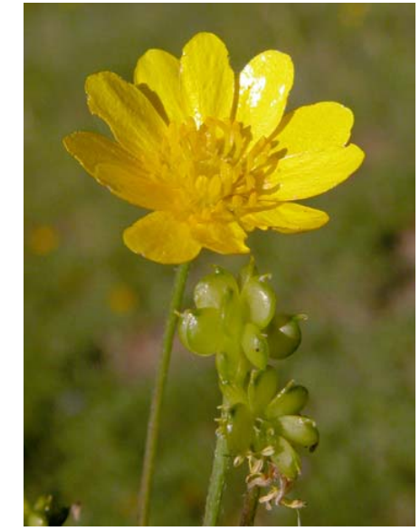
California Buttercup Ranunculus californicus Native Perennial Buttercup Family