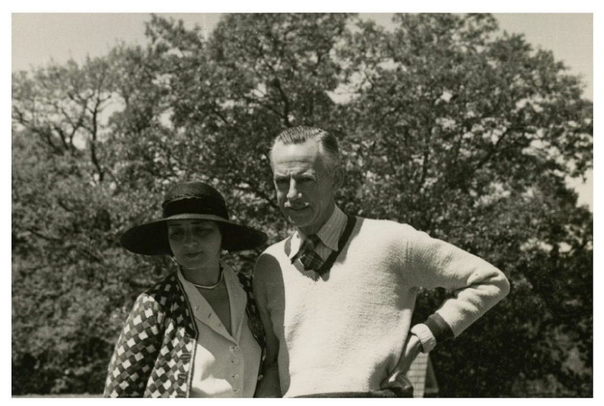
I mag e Courtesy of Eugene O'Neill N H S, EUON 210 3