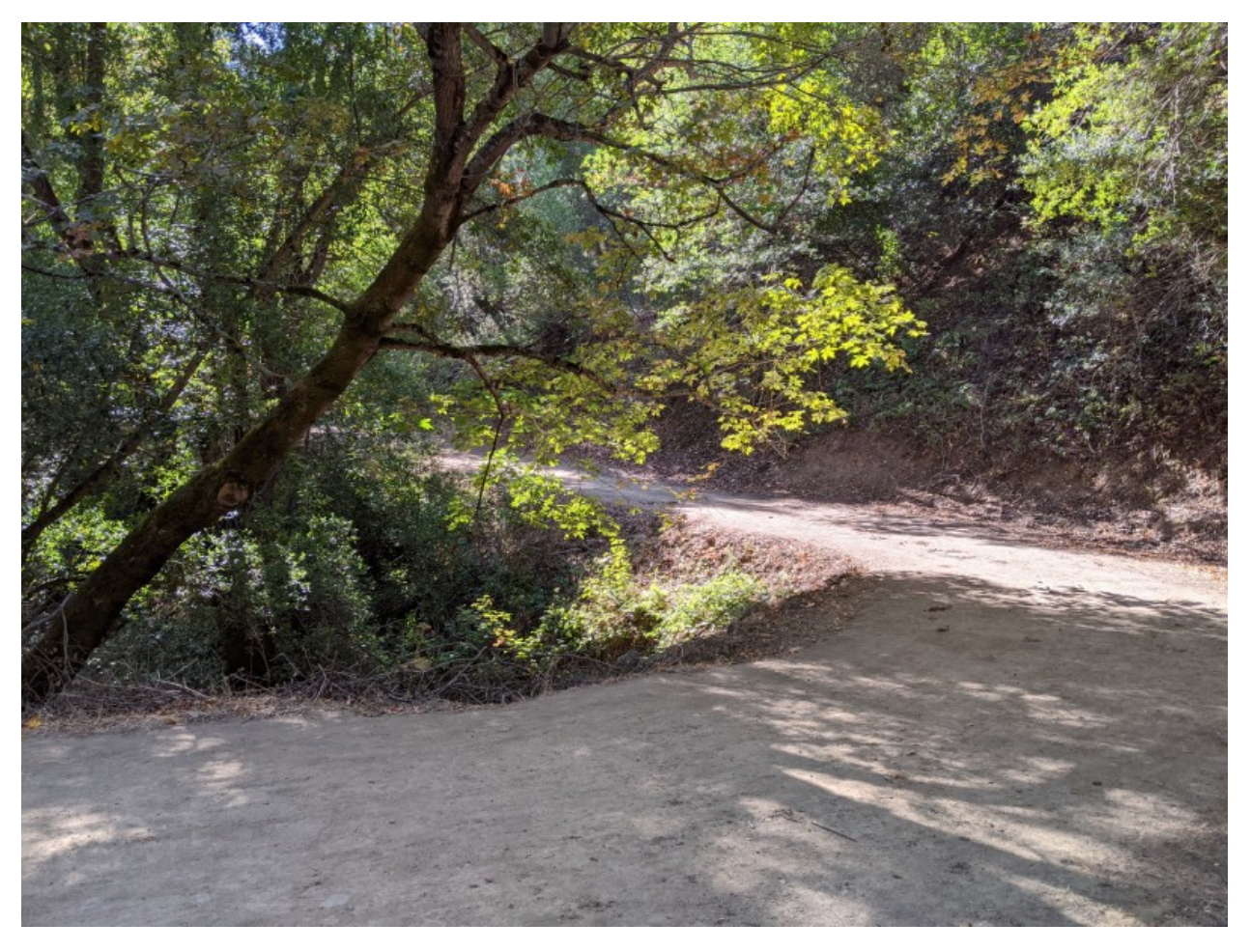
Photo 8b: An historic photo of the swimming pool at Tao House with Mt. Diablo in the distance.

Photo 8a: A dirt trail curving around a creek bed filled with wild plants and trees.