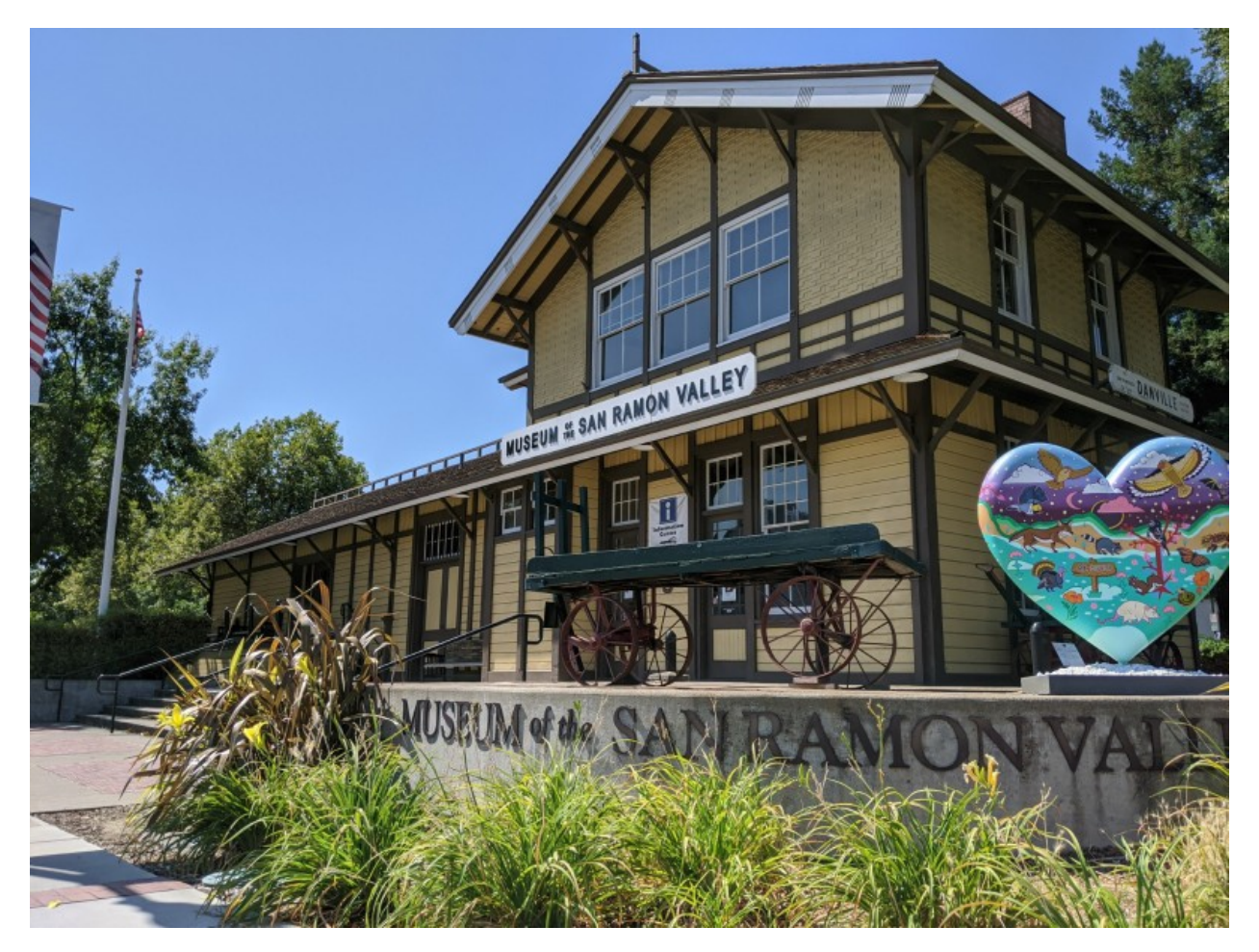
Photo 2: The historic yellow railroad depot which houses the Museum of the San Ramon Valley.

Cross Prospect Street and turn right to get on the Iron Horse Regional Trail. Continue for approximately 1 mile and then pause at the bench near stop #3 and take a break.