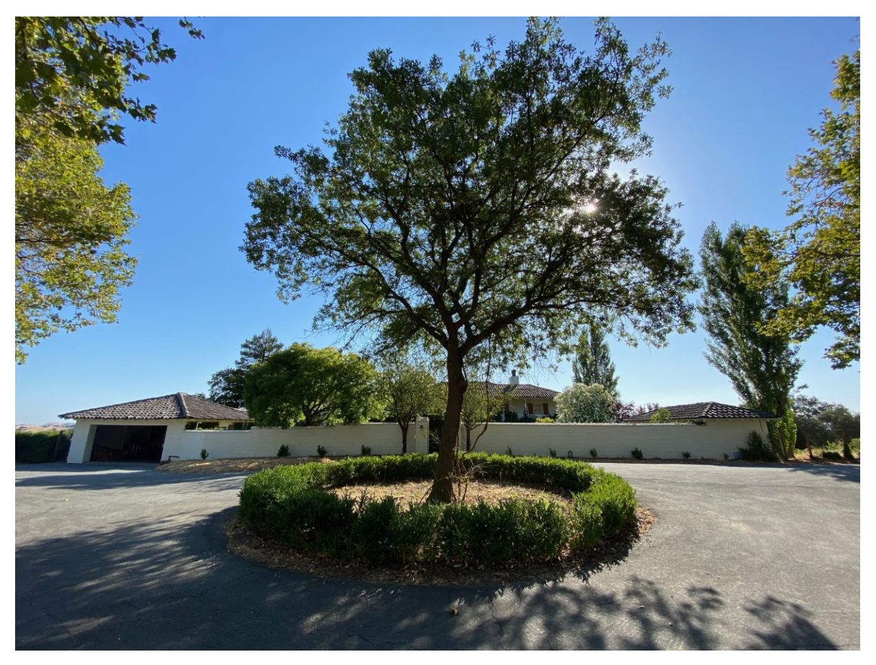
Photo 10b: An historic photo of Eugene and Carlotta (Monterey) O'Neill at Tao House in 1937 with trees behind them.

Photo 10a: The white wall which surrounds the courtyard of Tao House with a valley oak in the foreground.