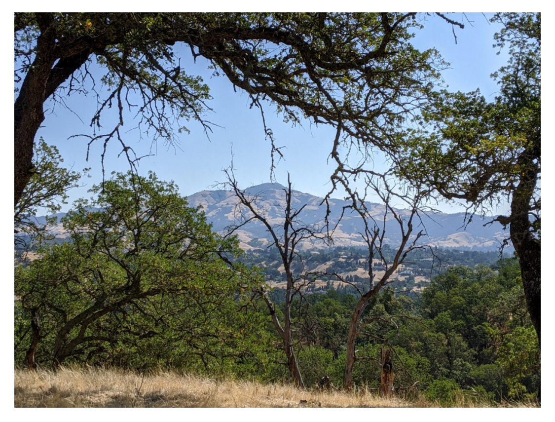
Photo 7: Trees and a blue sky frame a distant view of Mt. Diablo.

Continue on the Madrone Trail for approximately .3 miles to reach stop 8.