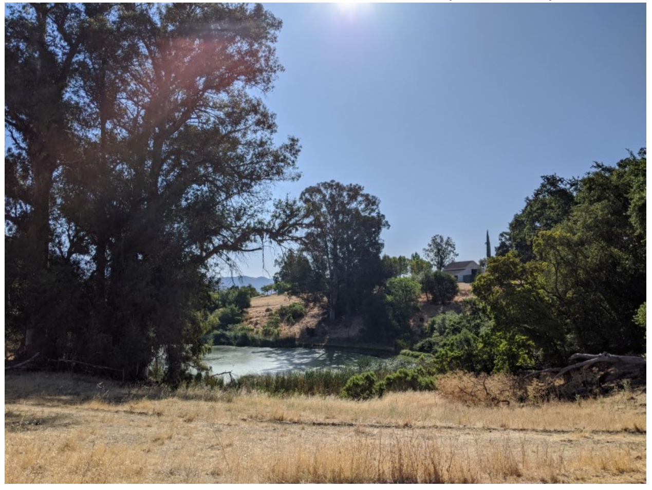
Photo 9b: Electrical Pole covered in holes filled with acorns.

Photo 9a: An historic pond for watering cows surrounded by trees and dark yellow grass with a barn in the distance.