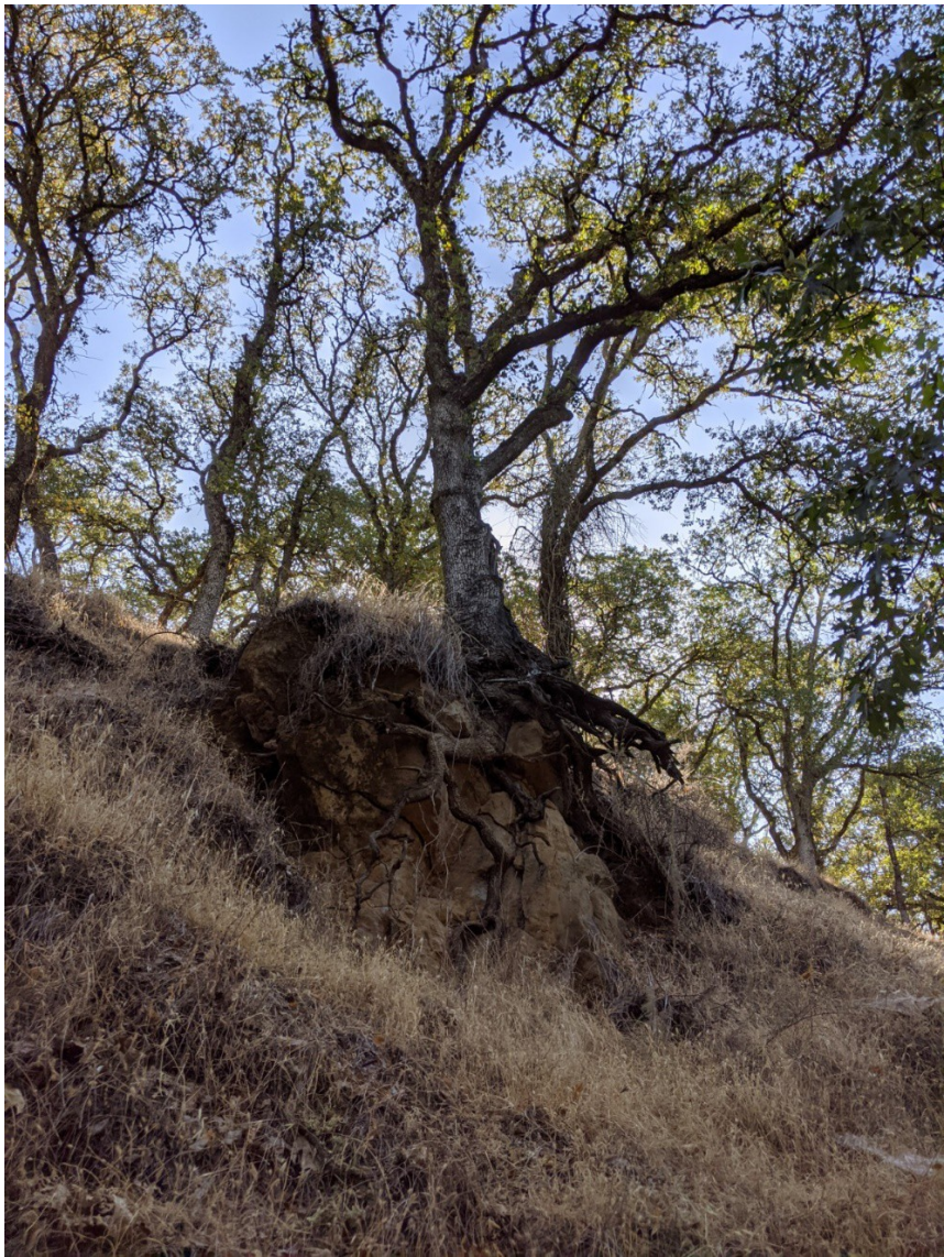
Photo 5d: Cream cups (Platystemon californicus) wildflowers.

Photo 5c: California newt (Taricha torosa).