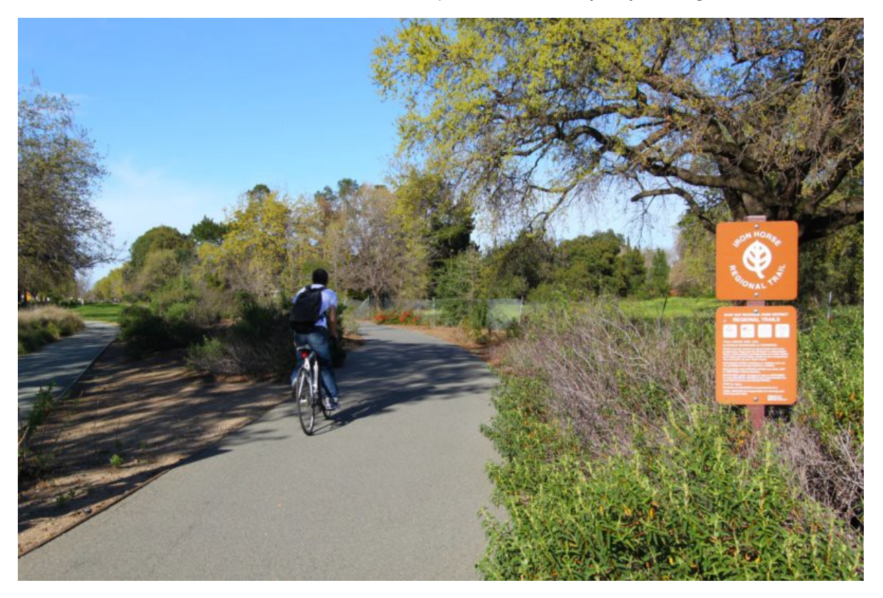
Photo 3c: Turn from Camille Ave. and follow the dirt path.

Photo 3b: Reddish wooden bench along the Iron Horse Trail Plaque reads " GIVE ME BIRDS, FLOWERS, AND A FINE DAY FOR WALKING. THAT'S MUSIC OUT OF DOORS! -HLH."