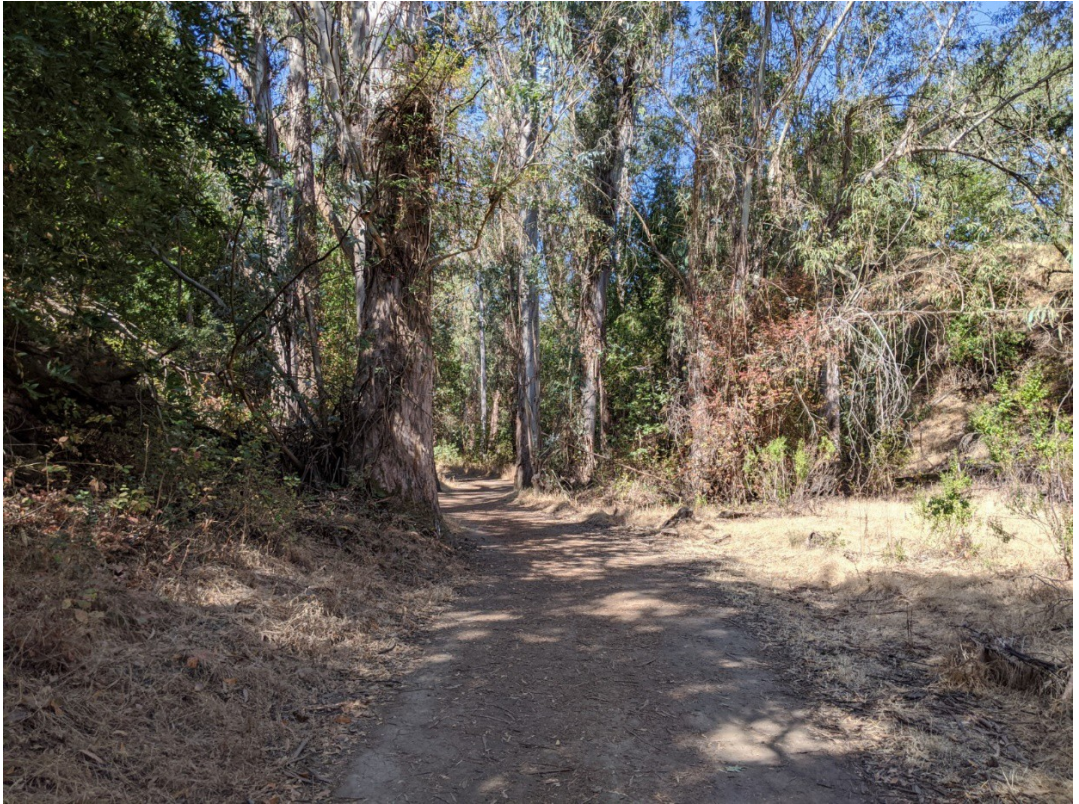
Photo 4d: Hikers with two dogs walking on a trail through the green hills of Las Trampas Wilderness.

Photo 4c: Looking east from Rocky Ridge across Bollinger Canyon to Las Trampas Ridge and Mt. Diablo.