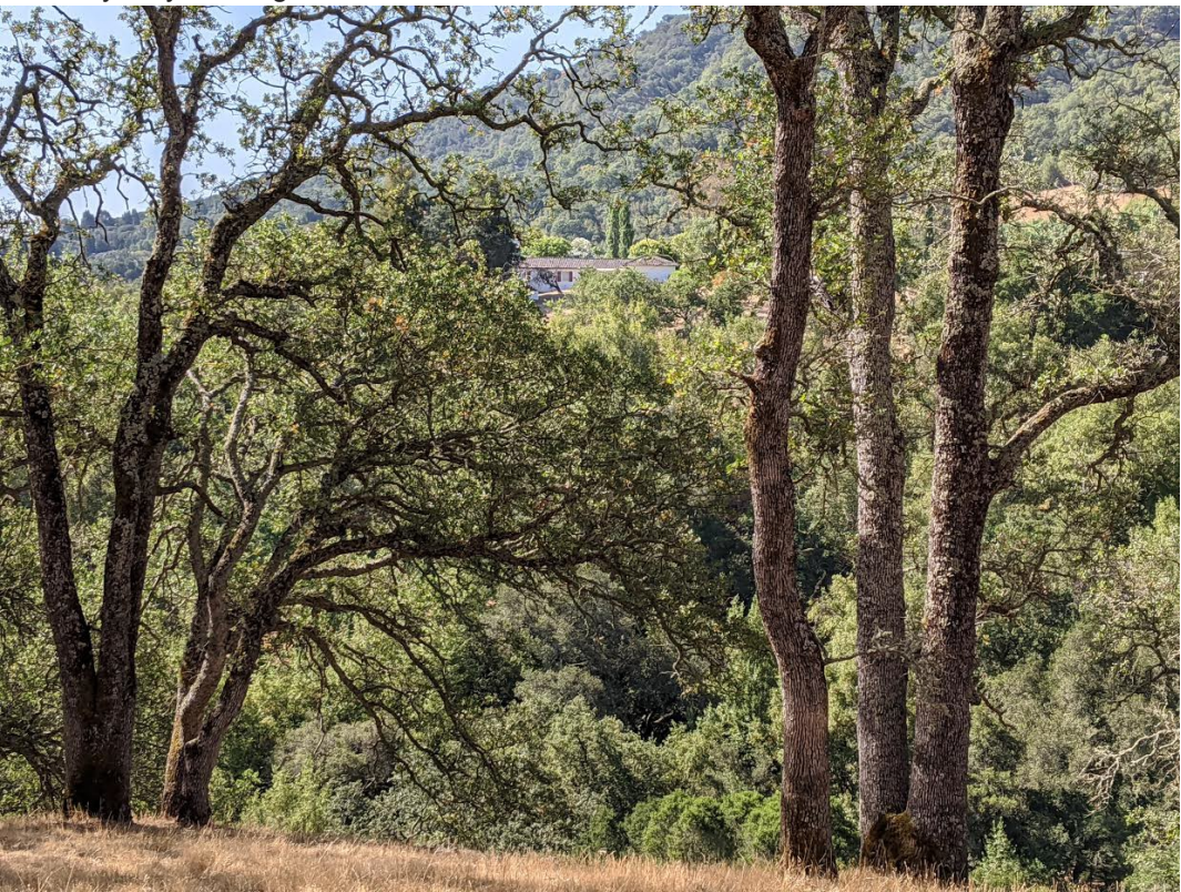
Photo 6: Trees frame a distant view of Tao House, a white brick building with terra cotta roof tiles.

Continue along the trail for about 150 feet to get a great view of Mt. Diablo at stop 7.