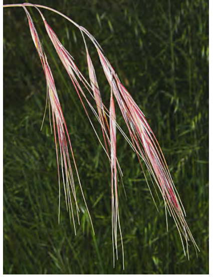
RIPGUT GRASS (Bromus diandrus) Naturalized Annual - Grass Family - (Apr–Jul) - Open, gen disturbed areas - Plant 6-40" tall. Spikelet 1-2.8" long. Lemma body 0.8-1.2" long, awn > 1.2" long. Babbed seeds can stick in flesh of animals. INVASIVE weed.