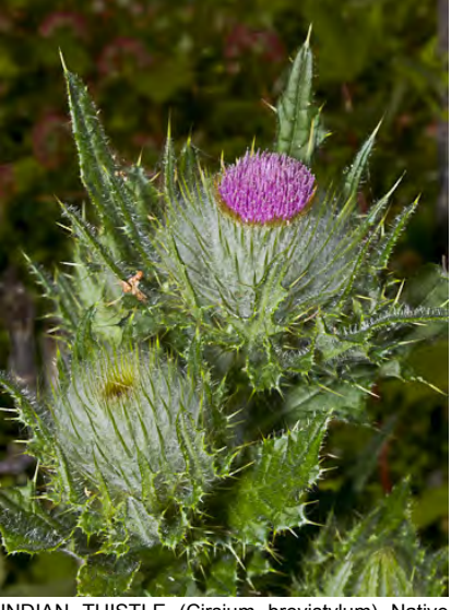
INDIAN THISTLE (Cirsium brevistylum) Native Annual-Biennial - Sunflower Family - (Mar–Aug) -Moist places - Plant 1-11'. Heads 1-1.6" wide, 1-1.4" long, 1-several clustered at stem tips, below leaf tips. Flowers white to purple, 0.8-1" long.