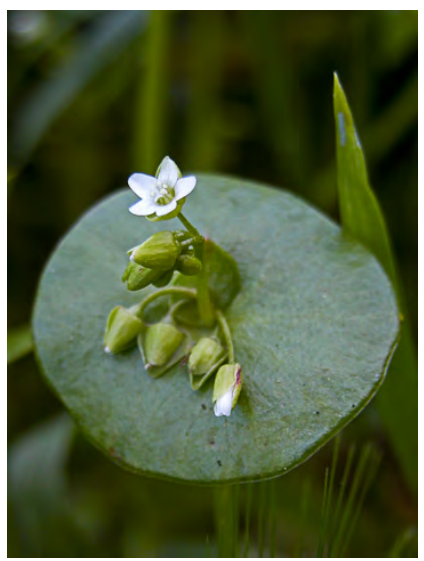
COMMON MINER'S LETTUCE (Claytonia perfoliata subsp. perfoliata) Native Annual -Miner's Lettuce Family - (Jan-May) - Vernally moist, often shady or disturbed sites - Basal leaf length <3x width. Stem leaf gen not angled. Seeds shiny w/large appendage.