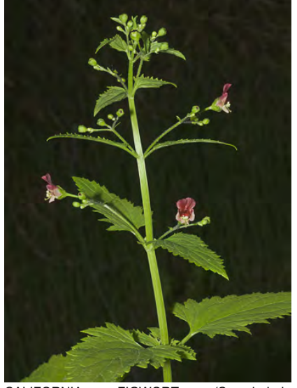
CALIFORNIA FIGWORT (Scrophularia californica) Native Perennial - Snapdragon Family - (Mar-Jul) - Common; damp places, chaparral, roadsides - Stem 2.6-4' tall, square x-section. Leaves opposite, to 7" long, triangular, toothed. Flowers 0.3-0.5" long, upper lips red to maroon, lower paler or yellowish.