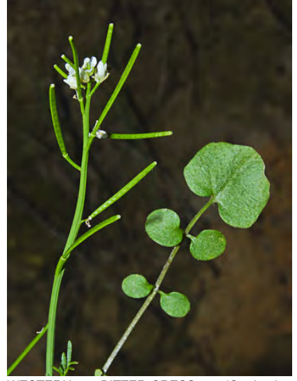
WESTERN BITTER-CRESS (Cardamine oligosperma) Native Annual - Mustard Family - (Mar-Jul) - Wet meadows, shady banks, damp areas - Plants < 16". Leaves divided into 5-9 leaflets. Flowers white, 0.1-0.2" long. Fruit < 0.1" wide.