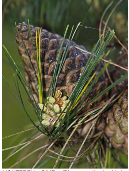
MONTEREY PINE (Pinus radiata) Native Perennial - Pine Family - - - Closed-cone-pine forest, oak woodland - Tree < 125' tall. Mature bark black, deep-grooved. Needles 3 per bundle, 2.4-5.9" long. Seed cone 2.4-6" long, asymmetric, opening 2nd year.