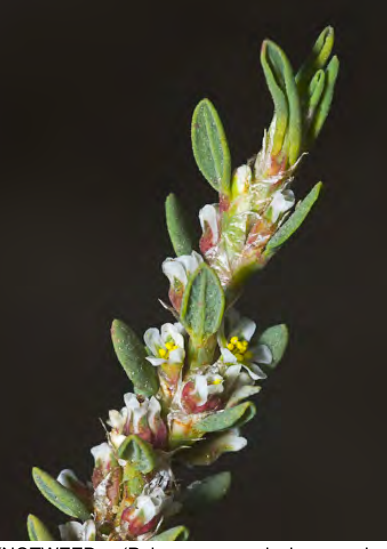
KNOTWEED (Polygonum aviculare subsp. depressum) Naturalized Annual - Buckwheat Family - (May–Nov) - Disturbed places - Stem 4-20", mat-forming. Flowers 2-8/leaf axil, ~0.1" long, fused 1/2 length, w/white or pink margins.