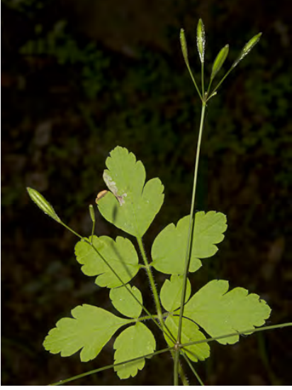
SWEET-CICELY (Osmorhiza berteroi) Native Perennial - Carrot Family - (Apr–Jul) - Conifer forest, woodland, disturbed areas - Plant 12-47". Leaflets in 3s, serrate to irreg lobed. Flower white. Fruit 0.5-1", upward pointing barbs, splitting apart below.