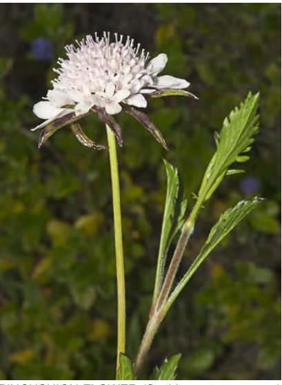
PINCUSHION FLOWER (Scabiosa atropurpurea) Naturalized Annual - Teasel Family - (Mar-Nov) -Disturbed areas - Stem < 2' tall. Leaves opposite, pinnately dissected. Flower clusters < 1.2" wide, flowers gen blue, pink, purple or white. Ornamental.