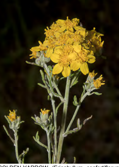
GOLDEN-YARROW (Eriophyllum confertiflorum var. confertiflorum) Native Perennial - Sunflower Family - (Apr-Aug) - Many dry habitats -Shrubby, 8-28" tall. Leaves 0.4-2" long, deeply 3-5 lobed. Flowers yellow; rays 4-6, 0.08-0.2" long; head bracts 4-7.