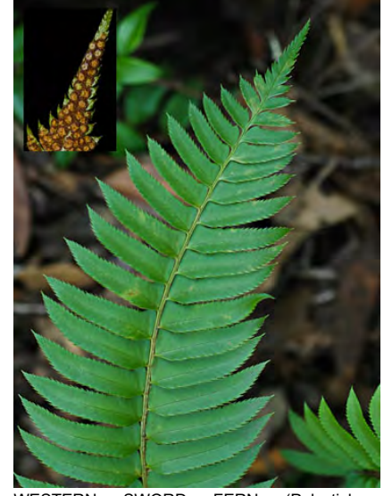
WESTERN SWORD FERN (Polystichum munitum) Native Perennial - Wood Fern Family -- Common. Wooded hillsides, shaded slopes, rarely cliffs, outcrops - Fronds gen 20-48" long, divided once. Segments usually separate, teeth point to tips, scaly rachis.