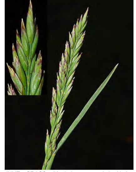
JUNE GRASS (Koeleria macrantha) Native Perennial - Grass Family - (May–Jul) - Dry, open sites, clay to rocky soils, shrubland, woodland, conifer forest - Stem 8-32" long. Flower cluster condensed, shiny, branches short-hairy. Spikelet ~0.2" long, no awns.