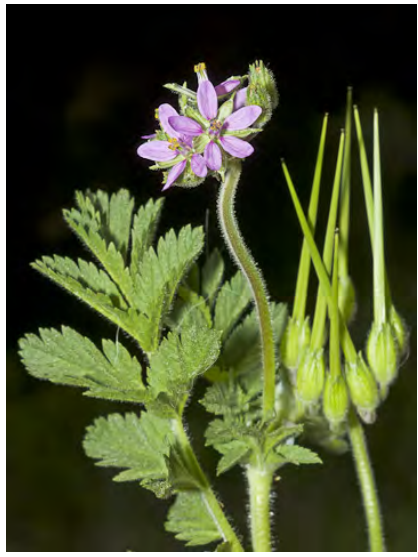
GREENSTEM FILAREE (Erodium moschatum) Naturalized Annual - Geranium Family -(Feb-Sep) - Open, disturbed sites - Stem 4-24", short-hairy. Leaves compound, leaflets toothed. Sepal tip glabrous. Petals 0.4-0.6" long, pink. Fruit beak 0.8-1.6" long.