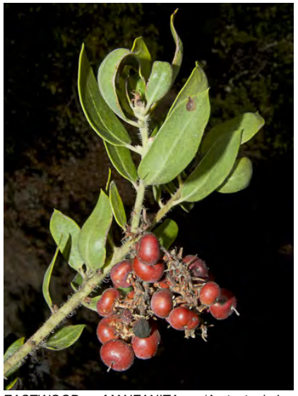
EASTWOOD MANZANITA (Arctostaphylos glandulosa subsp. glandulosa) Native Perennial - Heath Family - (Jan-Apr) - Chaparral, conifer forest - Shrub 3-13' tall. Twigs w/gland-tipped hairs, leafy bracts, 0.1-0.2" leaf stalk, burl. Upper leaf surface not shiny.