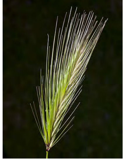
WALL BARLEY (Hordeum murinum subsp. murinum) Naturalized Annual - Grass Family -(Feb-May) - Moist, gen disturbed sites - Stem 1-2'. Leaf auricles notable. Central spikelet stalk 0-0.02". Central floret gen = lateral florets. INVASIVE weed.