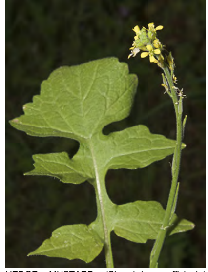
HEDGE MUSTARD (Sisymbrium officinale) Naturalized Annual - Mustard Family - (Apr-Sep) - Disturbed areas, fields, pastures - Stem 10-22" tall, thin, wiry. Petals 0.1-0.16" long, pale yellow. Fruit 0.4-0.55" long, awl-shaped, appressed.