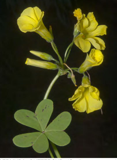
BERMUDA BUTTERCUP (Oxalis pes-caprae) Naturalized Perennial - Oxalis Family -(Jan-May) - Disturbed areas, roadsides, grassland, dunes - Flowering stem < 12" tall. Leaflets in 3s, < 1.4" long. Petals yellow, < 1" long. Ornamental. INVASIVE weed.