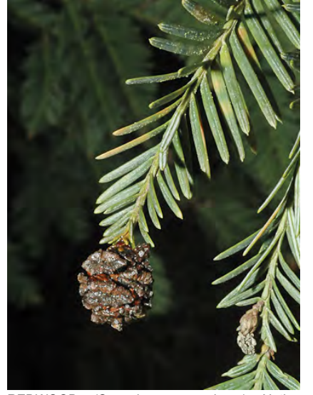
REDWOOD (Sequoia sempervirens) Native Perennial - Cypress Family - - - Redwood forest -Tree to 380' tall, evergreen. Leaves alternate: on rapidly growing stems awl-like, < 0.3" long; others flat, 0.2-1" long. Seed cone 0.5-1.4" diam, woody.