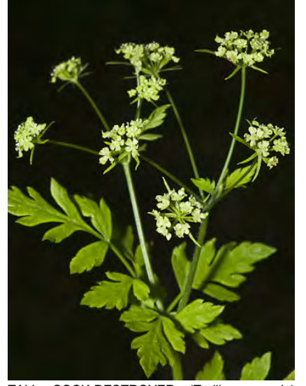
TALL SOCK-DESTROYER (Torilis arvensis) Naturalized Annual - Carrot Family - (Apr–Jul) -Disturbed places - Plant erect, 12-40". Flower clusters open, > leaf. Fruits 0.1-0.2" long, covered with uncurved bristles. Flowers white or pinkish. INVASIVE weed.