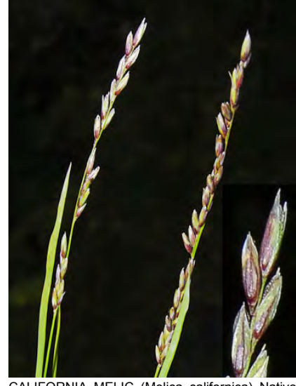
CALIFORNIA MELIC (Melica californica) Native Perennial - Grass Family - (Apr–May) - Open or rocky hillsides, oak woodland, conifer forest -Stem 16-55". Leaf 0.06-0.2" wide. Spiklet 0.2-0.6" long, w/3-7 fertile florets; sterile tip widest above middle, tip squared.