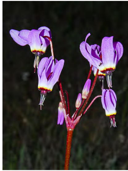
MOSQUITOBILLS SHOOTING STAR (Dodecatheon hendersonii) Native Perennial -Primrose Family - (Mar–Jul) - Gen in shady sites - Leaf blade length generally <2x width. Flower parts 4s or 5s. Filament tube solid black.