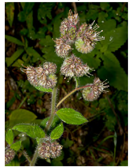
BRISTLY PHACELIA (Phacelia nemoralis subsp. nemoralis) Native Biennial-Perennial - Borage Family - (Apr–Jul) - Moist slopes, streambanks, mixed-evergreen forest - Short-lived. Upper leaves egg-shaped, lower divided. Flowers green-white, 0.16-0.2".