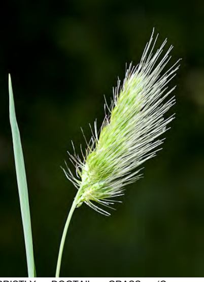
BRISTLY DOGTAIL GRASS (Cynosurus echinatus) Naturalized Annual - Grass Family - (May–Jul) - Open, disturbed sites - Tufted. Stem 4-28" long. Leaf blade 0.1-0.6" wide. Flower cluster 0.4-1.6" long, 1-sided. Fertile and sterile spikelets. INVASIVE weed.