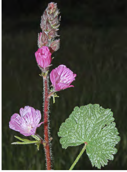
COMMON CHECKERBLOOM (Sidalcea malviflora subsp. malviflora) Native Perennial -Mallow Family - (Mar-Jul) - Coastal prairie, scrub, open forest - Plant 6-24" tall. Middle leaves not linear-lobed. Petals 0.4-1" long, pink to rose, gen white veined.