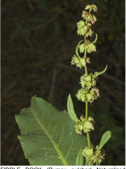
FIDDLE DOCK (Rumex pulcher) Naturalized Perennial - Buckwheat Family - (May–Sep) -Disturbed places, meadows, moist or dry habitats - Stem 8-24" long, branches widely spreading. Leaf blades 1.6-4" long, 1.2-2" wide. Valves w/2-5 teeth.