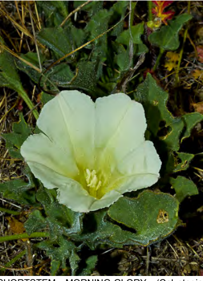
SHORTSTEM MORNING-GLORY (Calystegia subacaulis subsp. subacaulis) Native Perennial - Morning-glory Family - (Apr–Jun) - Dry, open scrub or woodland - Stem gen ~0.8" long. Flowers 1.3-2.4" long, white or cream. Bractlets concealing flower bracts.