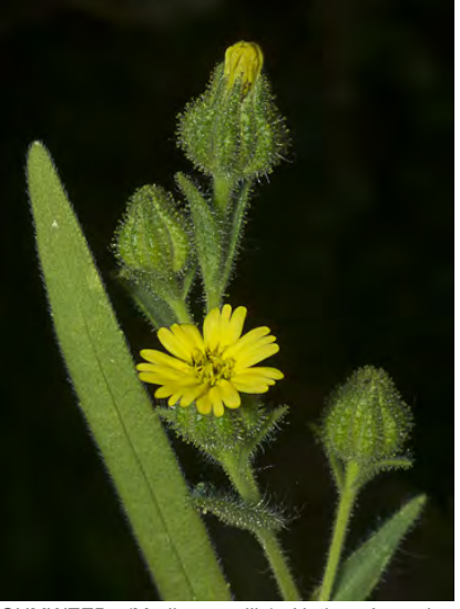
GUMWEED (Madia gracilis) Native Annual -Sunflower Family - (Apr-Aug) - Open, semi-shaded or disturbed sites, many habitats, incl serpentine - Plant 2.4-40" tall, hairy, upper half sticky. Leaf 0.4-4" long. Rays yellow, 3-10, 0.06-0.3" long. Bracts 6-10 mm tall.