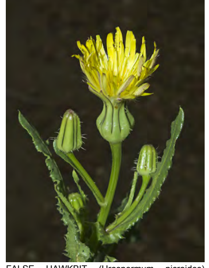
FALSE HAWKBIT (Urospermum picroides) Naturalized Annual-Perennial - Sunflower Family - (Apr-Jul) - Uncommon. Disturbed places - Stem 4-16"+ tall, long-hairy. Leaves clasping the stem. Flowers yellow. Style base swollen as thick as the seed.