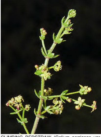
CLIMBING BEDSTRAW (Galium porrigens var. porrigens) Native Perennial - Madder Family -(May-Aug) - Among shrubs in chaparral, forest -Stem 4-59" long. Leaves 0.1-0.7" long, oval to egg-shaped, in whorls of 4. Flowers yellow to red, 4-lobed.