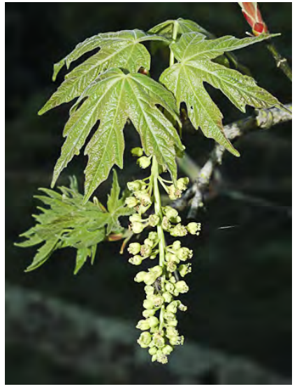
BIG-LEAF MAPLE (Acer macrophyllum) Native Perennial - Soapberry Family - (Mar–Jun) -Common. Streambanks, canyons - Tree < 100'. Leaves 5-lobed, 3-6" long, 4-10" wide. Group of 20-90 hanging flowers appear after leaves. Winged seeds.