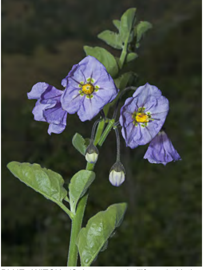
BLUE WITCH (Solanum umbelliferum) Native Perennial - Nightshade Family - (All year) -Shrubland, mixed-evergreen forest, woodland -Plant gen < 39", upper stem hairs branched, dense. Flowers 0.6-1" wide, purple, with green spots at the base.