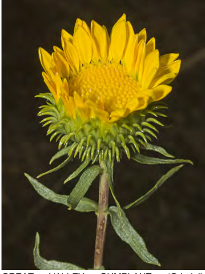
GREAT VALLEY GUMPLANT (Grindelia camporum) Native Perennial - Sunflower Family - (May–Nov) - Sandy or saline bottomland, roadsides - Stem non-woody, 2-8' tall, whitish. Leaves gen resinous. Head to 1.2" wide, bracts bend downward.