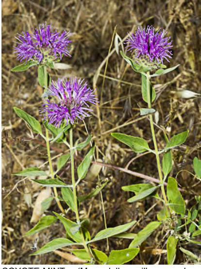
COYOTE-MINT (Monardella villosa subsp. villosa) Native Perennial - Mint Family -(May-Aug) - Dry rocky slopes, oak woods, chaparral - Plant < 20" tall. Leaves ovate, 0.4-0.9" mm long. Flower head 0.4-1.2" wide. Flowers pink to purple.