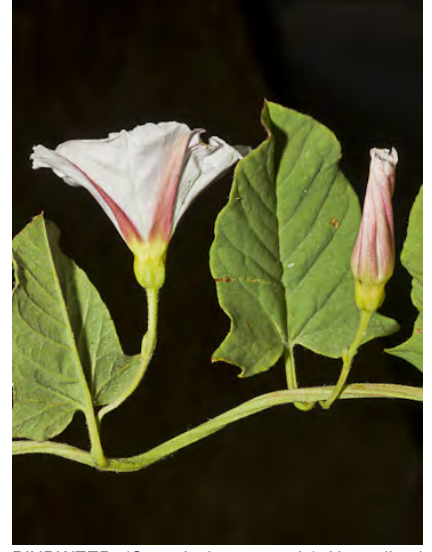
BINDWEED (Convolvulus arvensis) Naturalized Perennial - Morning-glory Family - (Mar–Oct) -Roadsides, open areas in many pl communities -Trailing. Leaf 0.8-1.2" long, w/round tip, pointed lobes. Flowers white to pink, 0.8-1" long. NOXIOUS.