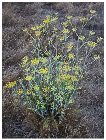
FENNEL (Foeniculum vulgare) Naturalized Perennial - Carrot Family - (May–Sep) -Roadsides, disturbed sites - Plants 3-6.5' tall, anise-scented. Stems waxy-blue, canelike. Flowers yellow. Leaf segments thread-like, edible when young. INVASIVE weed.