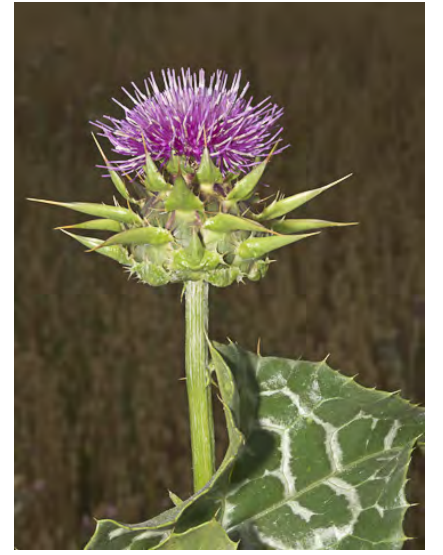
MILK THISTLE (Silybum marianum) Naturalized Annual-Biennial - Sunflower Family - (Feb–Jun) -Roadsides, pastures, disturbed areas - Stem 1-10', stout. Leaves spiny, shiny green w/white veins and spots. Flowers red-purple. INVASIVE weed.