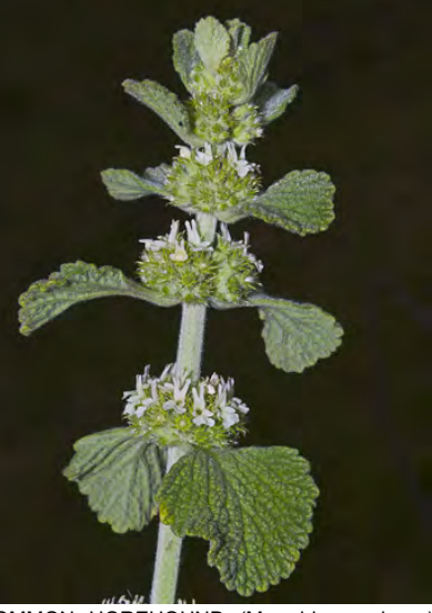
COMMON HOREHOUND (Marrubium vulgare) Naturalized Perennial - Mint Family - (Mar-Nov) -Disturbed sites, gen overgrazed pastures - Stem 4-24" long. Leaf blades 0.6-2.2" long. Flower bract w/10 hook-tipped teeth. Flowers white, ~0.2" long. INVASIVE.