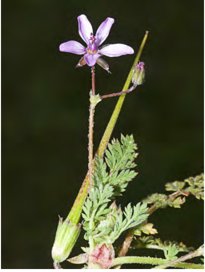
REDSTEM FILAREE (Erodium cicutarium) Naturalized Annual - Geranium Family -(Feb-Sep) - Open, disturbed sites, grassland, scrub - Stem 4-20". Leaves compound, leaflets dissected. Sepal tip bristly. Petal pink to purple. Fruit beak 0.8-2". INVASIVE.