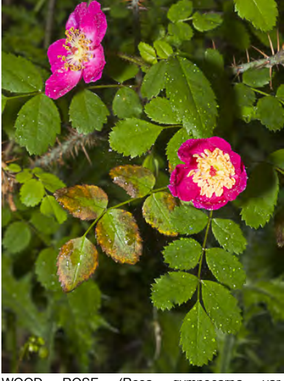
WOOD ROSE (Rosa gymnocarpa var. gymnocarpa) Native Perennial - Rose Family -((Feb)Apr–Jul) - Common. Gen in shade of forest, scrub - Shrub w/straight thorns. Flowers gen solitary, stalks sticky, fruit smooth, sepals deciduous.