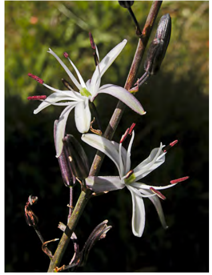
WAVYLEAF SOAP PLANT (Chlorogalum pomeridianum var. pomeridianum) Native Perennial - Century Plant Family - (May–Aug) -Common. Open grassland, chaparral, woodland -Plant 1-8' tall, flowers at night. Bulb juices lather in water.