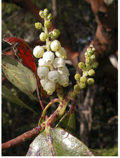
PACIFIC MADRONE (Arbutus menziesii) Native Perennial - Heath Family - (Mar–May) - Conifer, oak forests - Tree < 130' tall, evergreen, peeling red bark. Leaf blades < 5" long. Flowers yellow-white or pink, < 3.1" long. Berries red, < 0.5" diam, round.