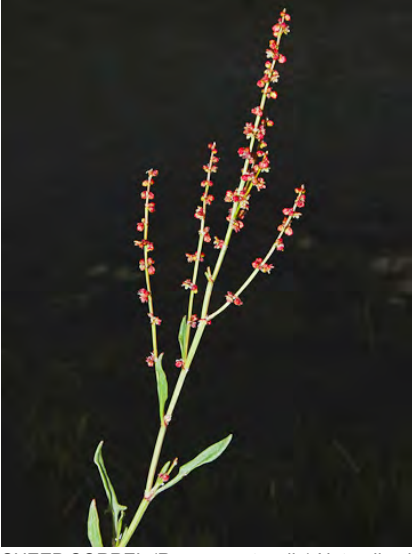
SHEEP SORREL (Rumex acetosella) Naturalized Perennial - Buckwheat Family - (Apr–Jul) - ± Disturbed, often acidic places - Stem < 16". Leaf gen basal, blade 0.8-2.4" long, lower arrowhead-shaped w/2 lobes. Flowers yellowish, turn reddish. INVASIVE.