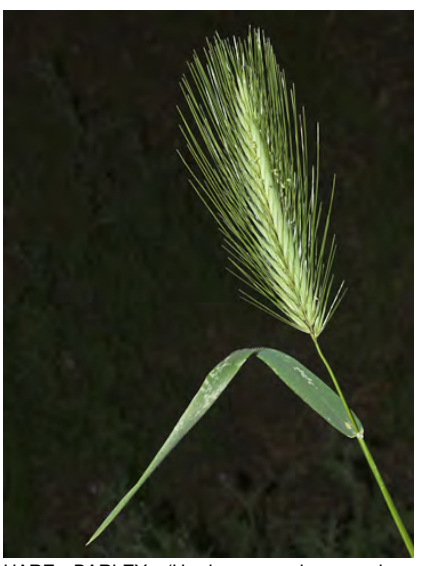
HARE BARLEY (Hordeum murinum subsp. leporinum) Naturalized Annual - Grass Family - (Feb-May) - Moist, gen disturbed sites. Common - Stem 12-43" tall. Central spikelet stalk ~0.06" long. Central floret << lateral florets. INVASIVE weed.