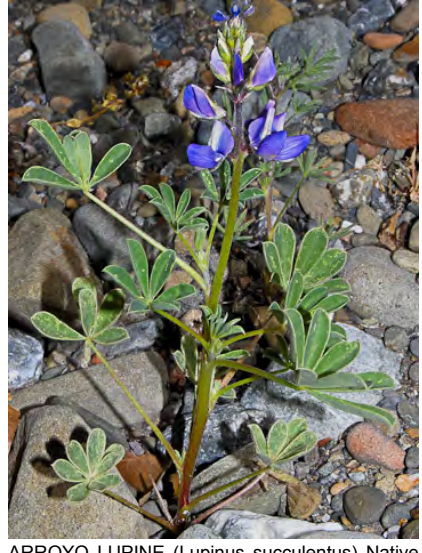
ARROYO LUPINE (Lupinus succulentus) Native Annual - Pea Family - (Feb–May) - Abundant. Open or disturbed areas, often seeded on roadbanks - Plant 8-40" tall, fleshy, sparsely hairy. Flowers 0.5-0.7" long, whorled, gen blue-purple, petal claws short-hairy.