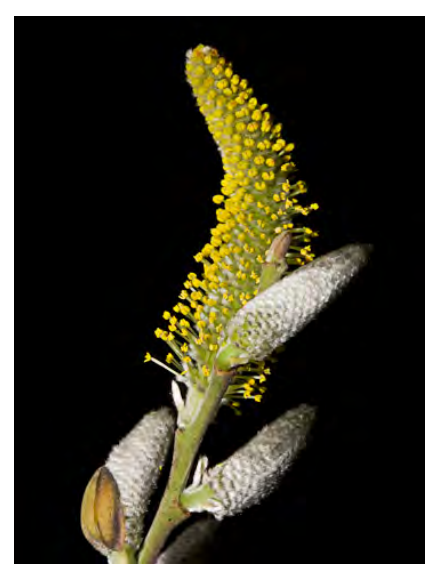
ARROYO WILLOW (Salix lasiolepis) Native Perennial - Willow Family - (Jan–Jun) - Common. Shores, marshes, meadows, etc - Shrub-tree, bark smooth. Leaf-like stipules. Leaf egg-shaped, waxy below. Fruit smooth, bract persistent, dark, stamens 2.