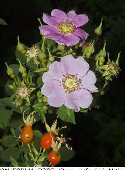
CALIFORNIA ROSE (Rosa californica) Native Perennial - Rose Family - (Feb–Nov) - Gen ± moist areas in sun, esp streambanks - Shrub 2.6-8.2' tall w/thick curved spines, forming thickets. Petals pink, 0.6-1" long; sepals unlobed.