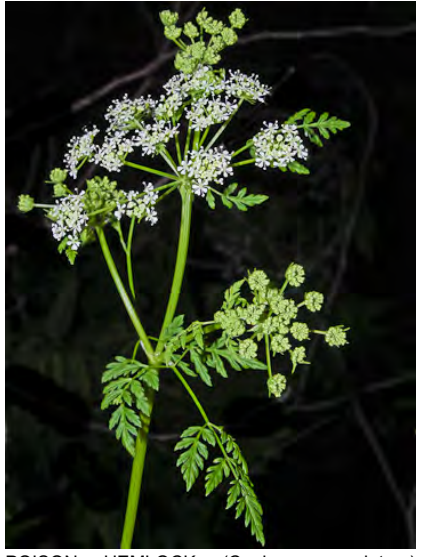
POISON HEMLOCK (Conium maculatum) Naturalized Biennial - Carrot Family - (Apr–Jul) -Common. Moist, esp disturbed places - Plants 2-10' tall. Stems purple-spotted. Leaves fern-like, gen 2x divided. Flowers white. TOXIC. INVASIVE weed.