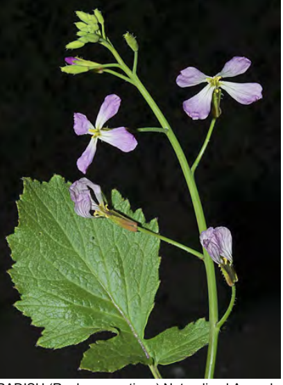
RADISH (Raphanus sativus) Naturalized Annual -Mustard Family - (May–Jul) - Disturbed areas, fields - Stem 16-51" long. Petals 0.6-1" long, white to purple. Fruit a fat cylinder w/constrictions between seeds. INVASIVE weed.