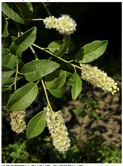
WESTERN CHOKE CHERRY (Prunus virginiana var. demissa) Native Perennial - Rose Family -(May–Jun) - Rocky slopes, canyons, scrubland, oak/pine woodland - Shrub/tree < 20'. Leaf blade 1.2-4" long. Flowers 18+, petals white, 0.16-0.3" long.