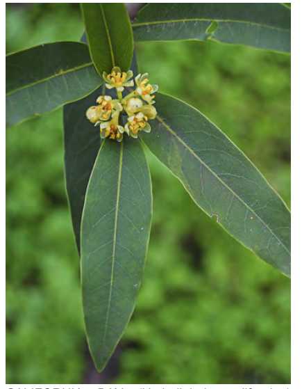
CALIFORNIA BAY (Umbellularia californica) Native Perennial - Laurel Family - (Nov–May) -Common. Canyons, valleys, chaparral - Tree < 150' tall. Leaf 1.2-4", 0.6-1.2" wide, aromatic. Cluster of 5-10 small, yellow or yellow-green flowers. Fruit 0.8-1" diam.