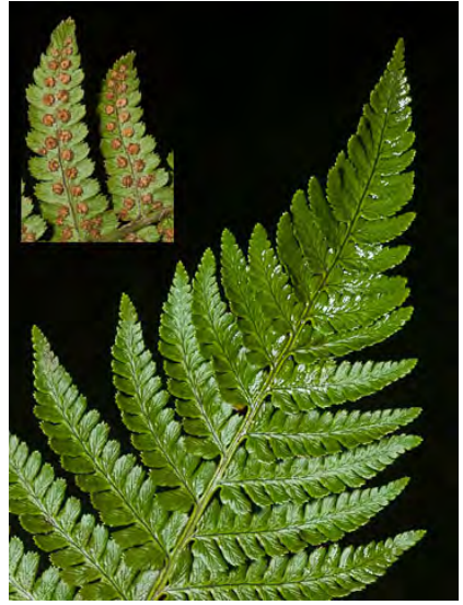
COASTAL WOOD FERN (Dryopteris arguta) Native Perennial - Wood Fern Family - - - Locally common. Open, wooded slopes, caves - Leaf 12-24" long.5-12" wide, divided 1-2 times. Segments generally with spine-tipped teeth.