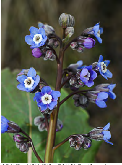
GRAND HOUND'S TONGUE (Cynoglossum grande) Native Perennial - Borage Family -(Feb–May) - Chaparral, woodland - Stem 1-3'. Leaf stalk 3-6". Leaf blade 3-6" cm long, broadly oval. Flowers bright blue winner white teeth.