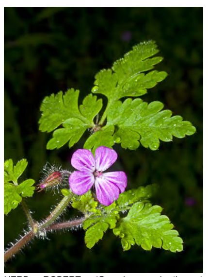
HERB ROBERT (Geranium robertianum) Naturalized Annual-Biennial - Geranium Family -(Apr-Sep) - Open to shaded sites - Stem 4-20" long. Leaflets in 3s, deeply lobed. Petals pink to red-purple, 0.4-0.55" long.