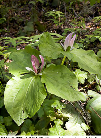
GIANT TRILLIUM (Trillium chloropetalum) Native Perennial - Bunchflower Family - (Apr–May) -Edges of redwood forest, chaparral, gen moist slopes, canyon banks in alluvial soils - Flowers dark purple to white, sessile. Petals 2.6-4" long, odor rose-like or spicy.