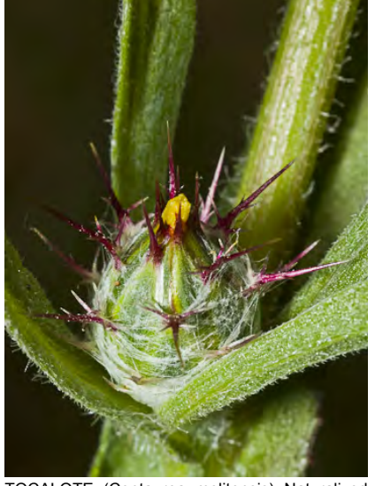
TOCALOTE (Centaurea melitensis) Naturalized Annual - Sunflower Family - (Apr-Jul) - Disturbed fields, open woodland - Plant 4-39", gray-hairy, resinous. Leaves 0.8-6" long. Flowers yellow, 0.4-0.8" long, bracts tipped w/purple spines. NOXIOUS weed.