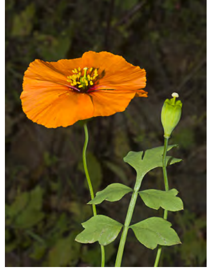
WIND POPPY (Papaver heterophyllum) Native Annual - Poppy Family - (Apr–May) - Grassy areas, openings in chaparral - Plant 1-2', yellow sap. Petals orange-red, 0.4-0.8" long. Stigma spherical on slender style.