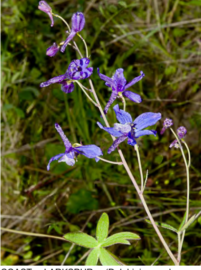
COAST LARKSPUR (Delphinium decorum subsp. decorum) Native Perennial - Buttercup Family - (Mar-May) - Open coastal grassland, chaparral - Stems 3-14" tall. Leaves short-hairy under, with few-toothed lobes. Flowers few, dark blue-purple.