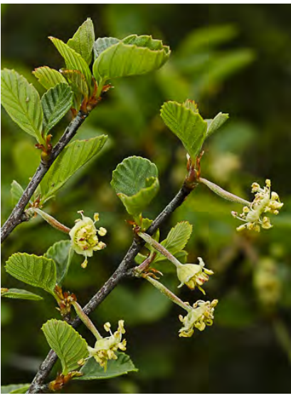
BIRCH-LEAF MOUNTAIN-MAHOGANY (Cercocarpus betuloides var. betuloides) Native Perennial - Rose Family - (Mar–May) - Dry, rocky slopes, chaparral - Shrub 3-10'. Leaf 0.4-1" long, end toothed. Flower 0.16-0.3" wide. Hairy fruit styles 2-3.5" long.