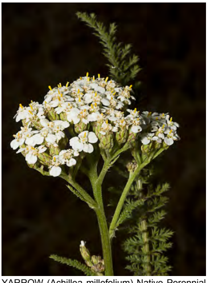
YARROW (Achillea millefolium) Native Perennial - Sunflower Family - (Apr–Sep) - Many habitats -Plant 4"-7' tall. Stem white-hairy. Leaves finely dissected. Flower cluster flat-topped. Flowers white to pink. Widely used in folk medicine.