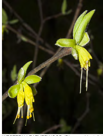
WESTERN LEATHERWOOD (Dirca occidentalis) Native Perennial - Daphne Family - (Nov-Mar) -Gen n facing slopes, mixed-evergreen forest to chaparral, gen fog belt - Shrub 3-10'. Flowers yellow, 1-4 per group, open before/with leaves. CNPS: Fairly ENDANGERED.