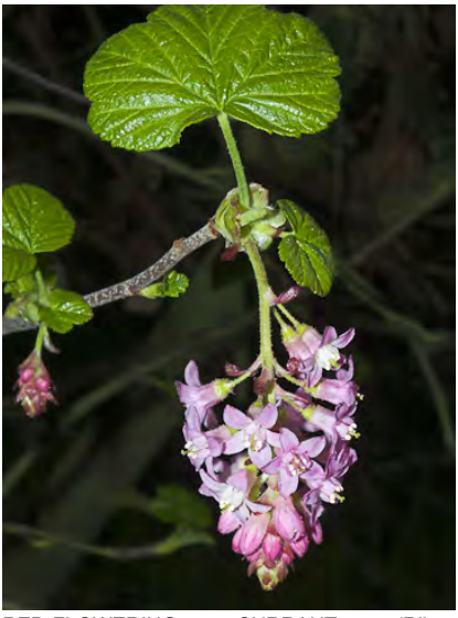
RED-FLOWERING CURRANT (Ribes sanguineum var. glutinosum) Native Perennial -Gooseberry Family - (Feb-Apr) - Many habitats Shrub < 13' tall, no prickles. Sepals pink to white. Petals white to red, ~0.1" long. Styles smooth.