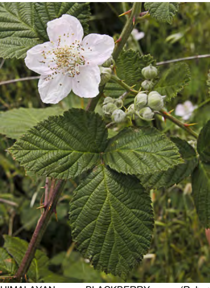
HIMALAYAN BLACKBERRY (Rubus armeniacus) Naturalized Perennial - Rose Family - (Mar–Jun) - Common. Disturbed areas, roadsides - Shrub w/thorny 5-angled stem. Leaflets 3-5, white-hairy beneath. Blackberry-type fruit. INVASIVE.