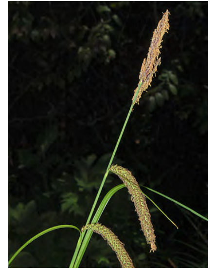
SANTA BARBARA SEDGE (Carex barbarae) -Native Perennial - Sedge Family - (May-Aug) -Seasonally wet places - Stem 6-36" tall, base brown to purple. Lowest flower cluster "leaves" < 4" long. Spikelets brown, 1-3" long, 0.2-0.3" wide.