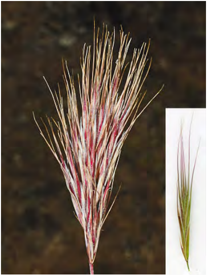
RED BROME (Bromus madritensis subsp. rubens) Naturalized Annual - Grass Family -(Mar–Jun) - Disturbed areas, roadsides - Plant 4-20". Flower cluster condensed, branches obscure, < spikelets. Stem & sheathes hairy. INVASIVE weed.