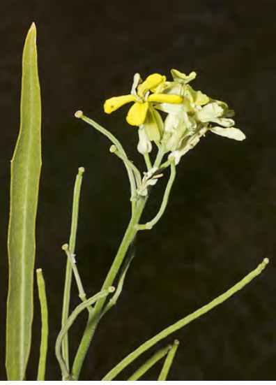
WESTERN WALLFLOWER (Erysimum capitatum var. capitatum) Native Biennial - Mustard Family - (Mar–Sep) - Common. Open areas, woodland, sandy areas, chaparral - Petals orange to yellow, fruit 1-4.3" long.