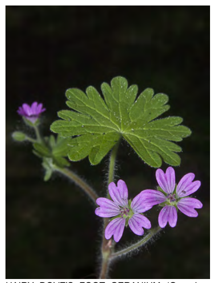
HAIRY DOVE'S FOOT GERANIUM (Geranium molle) Naturalized Annual - Geranium Family - (Feb-Aug) - Open to shaded sites, disturbed ground - Stem 4-17" tall. Petals red-purple, 0.1-0.4" long, notched. Sepals awnless. Fruit smooth, wrinkled.