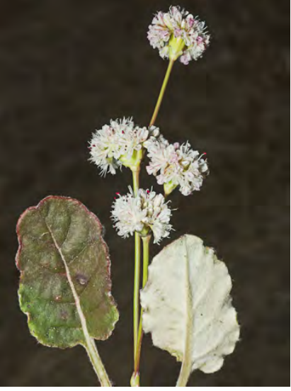
EAR-SHAPED WILD BUCKWHEAT (Eriogonum nudum var. auriculatum) Native Perennial -Buckwheat Family - (May–Oct) - Common. Sand or gravel - Plant 5-15 dm. Leaves on stem, curled. Inflor smooth. Flowers white to pink, smooth.