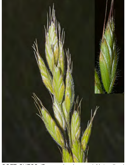
SOFT CHESS (Bromus hordeaceus) Naturalized Annual - Grass (Biofilus fioldeadeus) Naturalized disturbed areas - Plant 4-26" tall. Leaf hairy. Flower cluster 1-5" long, dense, some stalks > spikelet. Spikelet 0.5-0.9". Lemma 0.26-0.4", awn 0.16-0.4". INVASIVE weed.