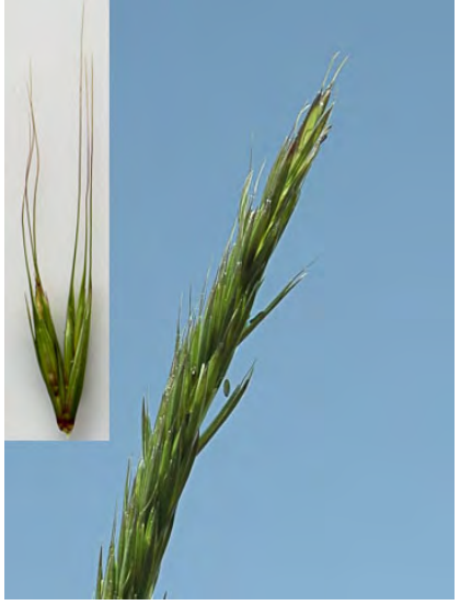
WESTERN WILD-RYE (Elymus glaucus subsp. glaucus) Native Perennial - Grass Family - (Jun-Aug) - Open areas, chaparral, woodland, forest - Tufted. Stem 12-55" tall. Leaf 0.2-0.5" wide, flat. Spikelets0.3-0.6" long, 2-4 per node. Lemma awn 0.4-1.2" long.