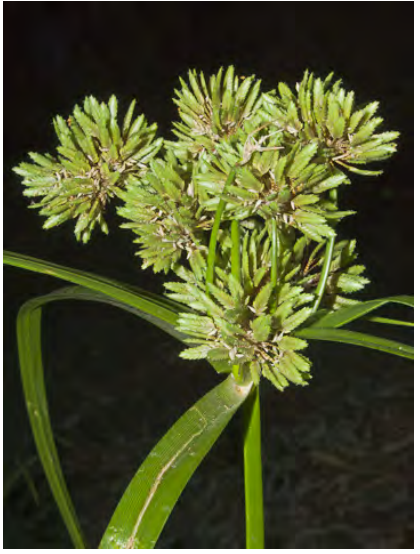
TALL NUTSEDGE (Cyperus eragrostis) Native Perennial - Sedge Family - (May–Nov) - Vernal pools, streambanks - Leaves basal. Flower cluster bracts 4-8. Spikelets 0.2-0.8" long, oblong, in heads to 1.6" wide. Seeds short-stalked.