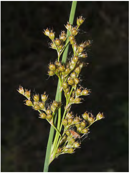
SPREADING RUSH (Juncus patens) Native Perennial - Rush Family - (Jun–Oct) - Marshy places, creeks, seeps - Plant 12-41" tall, densely tufted. Stems blue-gray-green & distinctly grooved when fresh. Stamens 6.