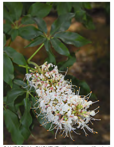
CALIFORNIA BUCKEYE (Aesculus californica) Native Perennial - Soapberry Family - (May–Jun) - Dry slopes, canyons, borders of streams - Large shrub or tree 13-39' tall. 5-7 leaflets. Flowers white to pale rose. Large seeds toxic but edible after leaching out saponins.