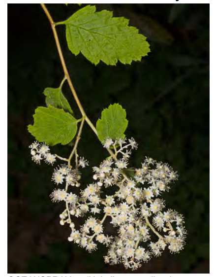
OCEANSPRAY (Holodiscus discolor var. discolor) Native Perennial - Rose Family -(May-Aug) - Moist woodland edges, rocky slopes - Shrub 5-20' tall. Leaf blade 0.6-3.1" long, toothed at end. Flower cluster 0.8-10" long. Petals white, ~0.07" long.