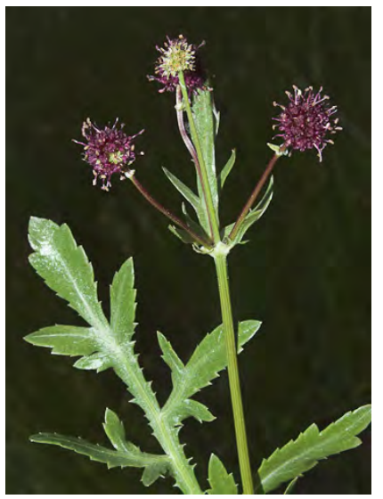
PURPLE SANICLE (Sanicula bipinnatifida) Native Perennial - Carrot Family - (Mar–May) -Open grassland, gen on serpentine, or pine/oak woodland - Plant 5-24" tall. Leaves 1.6-7.5" long, 1-2x divided on a winged central axis. Flowers dark purple. Fruits prickly.