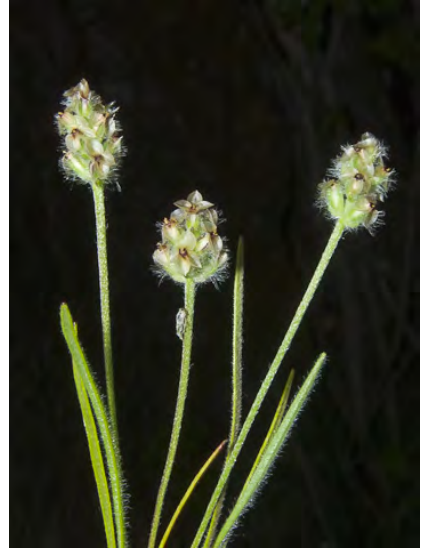
CALIFORNIA DWARF PLANTAIN (Plantago erecta) Native Annual - Plantain Family -(Mar-May) - Sandy, clay, serpentine soil; grassy slopes, flats, open woodland - Leaf 1.2-5" long, linear, hairy. Flowers + stem 1.2-12" tall, cluster 0.2-1.2" long.