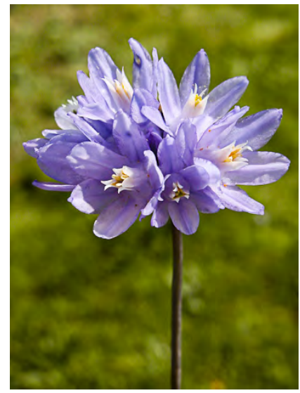
BLUE DICKS (Dichelostemma capitatum subsp. capitatum) Native Perennial - Brodiaea Family - (Mar-Jun) - Open woodland, scrub, desert, grassland - Plant 2-28" tall. Flowers blue-purple, not narrowed in the middle. Stamens 6. Early spring bloomer.