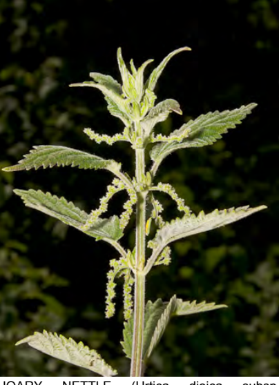
HOARY NETTLE (Urtica dioica subsp. holosericea) Native Perennial - Nettle Family -(Jun-Sep) - Meadows, seeps, springs, margins of marshes, streams, lakes, moist areas in chaparral, coastal scrub - Plant 3.3-9.8' tall, grayish, covered with stinging hairs.