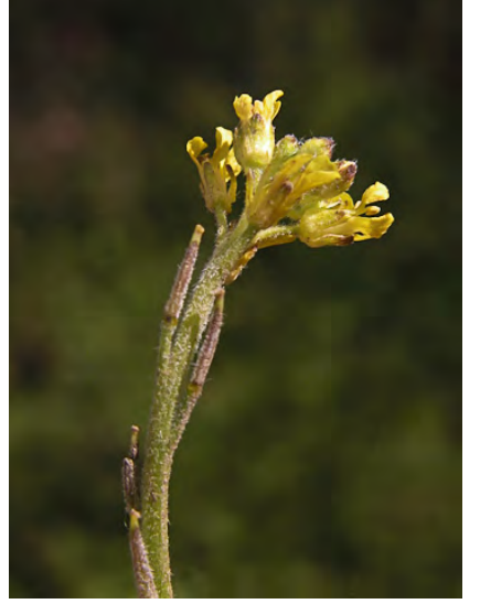
SHORTPOD MUSTARD (Hirschfeldia incana) Naturalized Biennial-Perennial - Mustard Family -(Apr-Oct) - Disturbed areas - Stem 16-60". Longest leaves 1.6-4" long, dense-hairy. Petals pale yellow, ~0.2" long. Fruit appressed. Fall-blooming. INVASIVE.