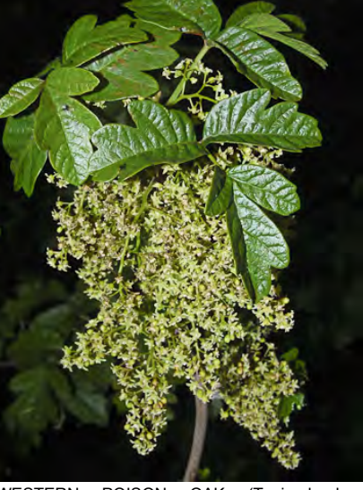
WESTERN POISON OAK (Toxicodendron diversilobum) Native Perennial - Sumac Family - (Apr-Jun) - Canyons, slopes, chaparral, coastal scrub, oak woodland - Shrub or vine. Leaflets 3, red in fall, mid leaflet stalked. Flowers green. Fruits white. TOXIC.