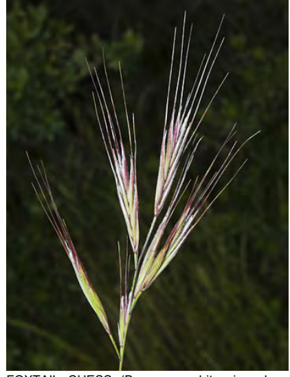
FOXTAIL CHESS (Bromus madritensis subsp. madritensis) Naturalized Annual - Grass Family -(Apr-Jan) - Disturbed areas, roadsides - Plants 4-20" tall. Stem and sheathes smooth. Flower cluster branches visible, lower spikelets erect, > stalk.