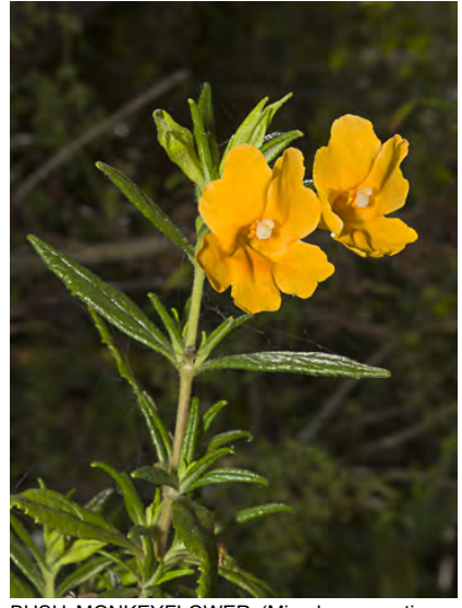
BUSH MONKEYFLOWER (Mimulus aurantiacus var. aurantiacus) Native Perennial - Lopseed Family - (Mar–Jun) - Disturbed areas, coastal cliffs, canyon sides - Shrub 4-60". Flowers yellow, orange or red; 1-2.3" long; bract tube glabrous.