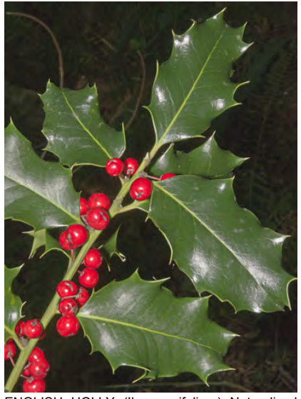
ENGLISH HOLLY (Ilex aquifolium) Naturalized Perennial - Holly Family - (May-Jun) - Cool, wooded areas - Shrub or tree < 66' tall. Leaves 1-2.4" long, edges smooth or w/spine-like teeth. Flower petals ~0.1" long, dull white. Fruits red, ~0.3" wide, smooth.