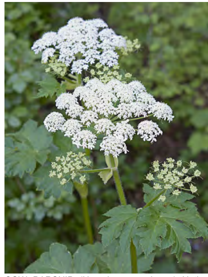
COW PARSNIP (Heracleum maximum) Native Perennial - Carrot Family - (Apr–Jul) - Moist places, wooded or open - Plants 1-3 m tall, woolly-hairy. Leaflets 3, maple-lobed, 4-16" wide. Petals white, outermost longest. Juice causes dermatitis.