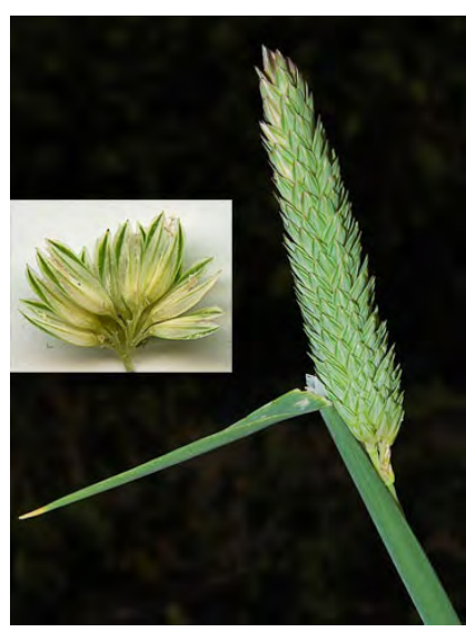
HARDING GRASS (Phalaris aquatica) Naturalized Perennial - Grass Family - (Apr-Aug) - Disturbed areas, roadsides - Plant 16-79" tall, tufted. Flower cluster 0.6-6" long, unbranched. Lower florets 1 or or unequal. Glume wing untoothed. INVASIVE weed.