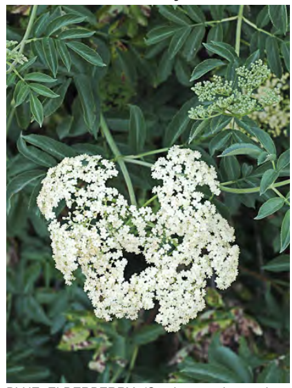
BLUE ELDERBERRY (Sambucus nigra subsp. caerulea) Native Perennial - Muskroot Family -(Mar–Sep) - Common. Streambanks, open places in forest - Shrub 7-26' tall. Flower cluster flat-topped, 1.6-13" diam, petals spreading. Fruits waxy blue-black.