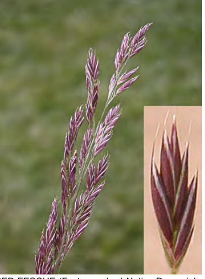
RED FESCUE (Festuca rubra) Native Perennial -Grass Family - (May–Jul) - Sand dunes, grassland, subalpine forest - Plant 12-32", hairy, clumped, w/closed sheath. Generally with rhizomes. Spikelets 0.4-0.5", florets 3-10, awns < 0.16" long.