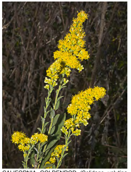
CALIFORNIA GOLDENROD (Solidago velutina subsp. californica) Native Perennial - Sunflower Family - (May–Nov) - Woodland margins, grassland, disturbed soils - Stem 8-60" tall. Gen densely short-soft-hairy. Flower cluster height 2-4x width.