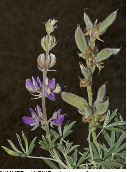
SUMMER LUPINE (Lupinus formosus var. formosus) Native Perennial - Pea Family -(Apr–Sep) - Dry clay soils, grassland, open areas under pines, gen in valleys - Plant 8-32", low growing. Leaves hairy. Flowers purple, hairless, summer/fall blooming.