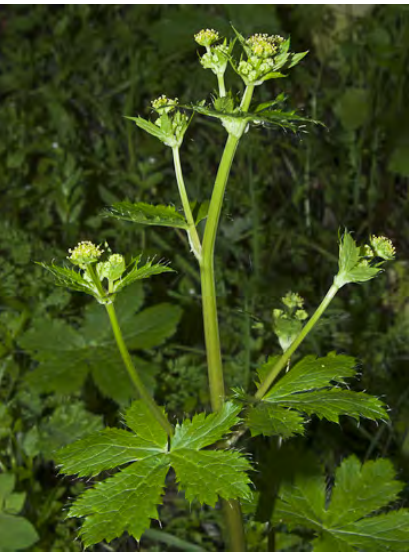
PACIFIC WOODLAND SANICLE (Sanicula crassicaulis) Native Perennial - Carrot Family - (Mar-May) - Open slopes, ravines, woodland - Plants stout, 9-47". Leaves 1-5" across with 3-5 deep, palmate lobes and serrate edges. Flowers yellow.