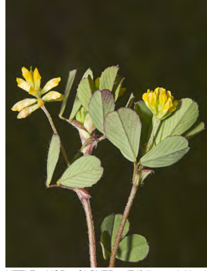
LITTLE HOP CLOVER (Trifolium dubium) Naturalized Annual - Pea Family - (Spring) -Agricultural, disturbed areas, lawns - Heads 0.16-0.3" wide. Flowers bright yellow, age brown, quickly reflex, smooth.