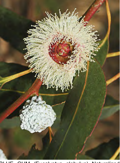
BLUE GUM (Eucalyptus globulus) Naturalized Perennial - Myrtle Family - (Oct–Jan) - Common. Disturbed areas - Tree < 200' tall. Flowers single, large, gen stemless. Leaves 4-12" long, 1-1.6" wide; used medicinally by Aboriginals. INVASIVE weed.