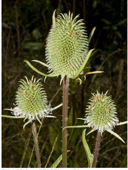
FULLER'S TEASEL (Dipsacus sativus) Naturalized Biennial - Teasel Family - (May–Jul) -Disturbed areas, fields, vacant lots, pastures -Plant gen < 6' tall. Leaf pairs fused around stem. Flower cluster lavender, 5-10 cm long, bracts spreading. INVASIVE weed.