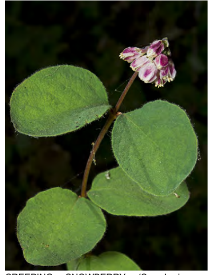
CREEPING SNOWBERRY (Symphoricarpos mollis) Native Perennial - Honeysuckle Family -(Apr-May) - Ridges, slopes, open places in woodland - Shrub 6-24" tall, sprawling. Flowers < 8/cluster, pink + often red outside, 0.16" long, bell-shaped, symetrical.