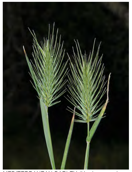
MEDITERRANEAN BARLEY (Hordeum marinum subsp. gussoneanum) Naturalized Annual - Grass Family - (Apr-Jun) - Dry to moist, disturbed sites - Stem 4-20". Leaf blades to 32" long, auricles < 0.08". Central lemma awn 0.25-0.7" long. INVASIVE weed.