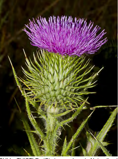
BULL THISTLE (Cirsium vulgare) Naturalized Biennial - Sunflower Family - (May–Oct) -Common. Disturbed areas - Plant 12-79<sup>4</sup> tall. Top of leaves bristly; leaf base forming decurrent wings on stem. Flowers purple, gen 1-2" wide. NOXIOUS weed.