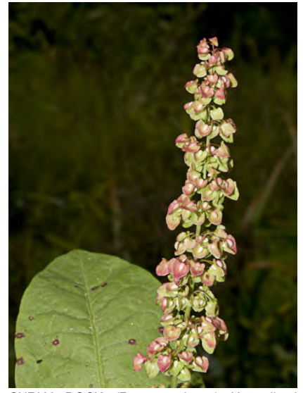
CURLY DOCK (Rumex crispus) Naturalized Perennial - Buckwheat Family - (All year) -Abundant. Disturbed places - Stem 16-39" tall. Flower cluster dense, valves 0.2-0.24", winged around tubercles, smooth edged. 1 tubercle enlarged. INVASIVE.