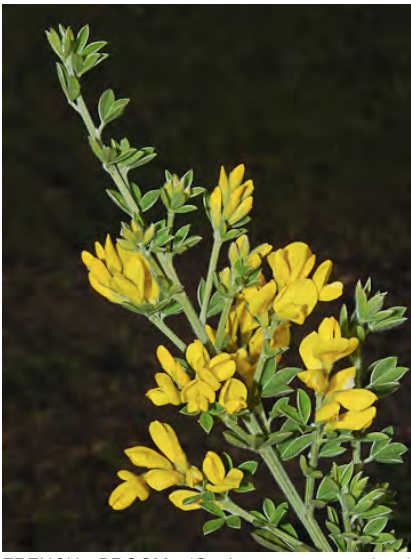
FRENCH BROOM (Genista monspessulana) Naturalized Perennial - Pea Family - (Mar–Jun) -Common. Disturbed places. - Shrub < 10' tall, evergreen. Stems 8-10 ridged, leafy. Flowers yellow, 4-10 at branch tips, banner 0.4-0.6" long. NOXIOUS.