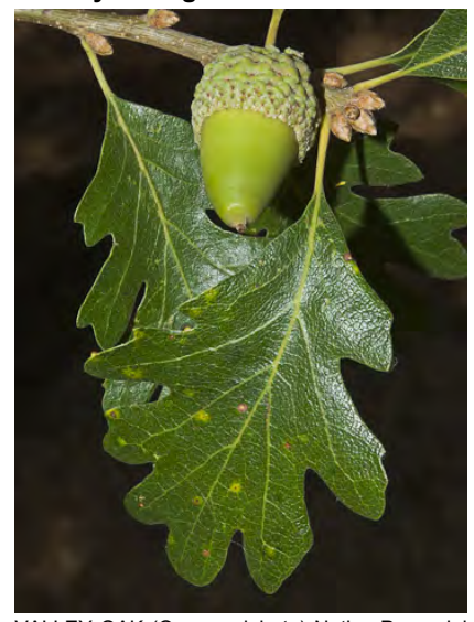
VALLEY OAK (Quercus lobata) Native Perennial - Oak Family - (Mar–Apr) - Slopes, valleys, savanna - Tree < 115' tall, deciduous. Leaves 2-5" long, not leathery, deeply lobed, lobes without bristles. Acorns 1.2-2" long, slender, cup 0.4-1.2" deep.