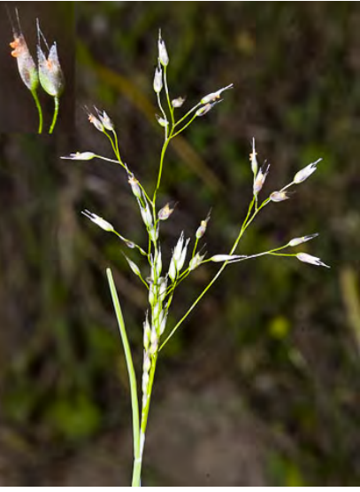
SILVER HAIR GRASS (Aira caryophyllea) Naturalized Annual - Grass Family - (Apr–Jun) -Sandy soils, open or disturbed sites - Flower cluster > 0.6" wide, diffuse with long slender branches. Spikelets about 0.1" long with 2 extended awns.