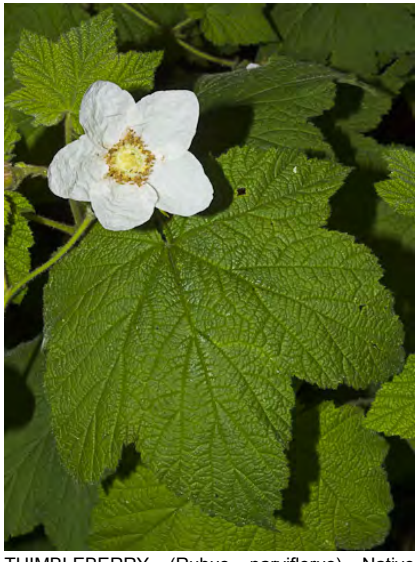
THIMBLEBERRY (Rubus parviflorus) Native Perennial - Rose Family - (Mar–Aug) - Common; moist semi-shaded areas, esp edges of woodland - Shrub 0.5-2 m tall, not prickly. Petals 0.5-0.9" long, white. Leaves simple, 3-5 lobed. Raspberry-type fruit.