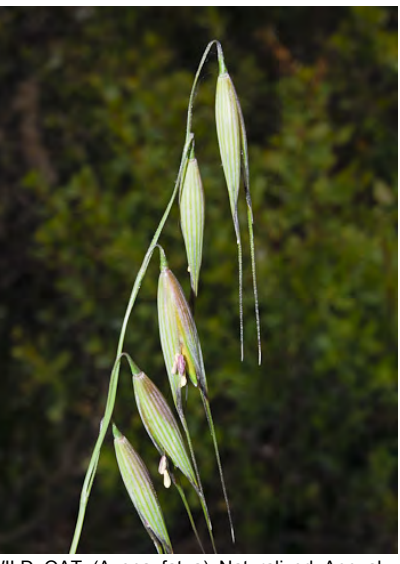
WILD OAT (Avena fatua) Naturalized Annual -Grass Family - (Apr–Jun) - Disturbed sites -Plants 1-5' tall. Spikelets 0.7-1.3" long. Low awn 1-1.6" long. Lemma tip bristles < 0.04" long. Seeds EDIBLE whole or ground for flour. INVASIVE weed.