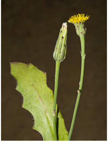
SMOOTH CAT'S-EAR (Hypochaeris glabra) Naturalized Annual - Sunflower Family -(Mar–Jun) - Common. Disturbed areas, grassland, open woodland - Plant 4-24" tall, smooth. Rays 0.2-0.3" long, barely > head bracts. Only inner fruit beaked. INVASIVE.