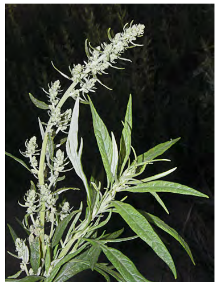
MUGWORT (Artemisia douglasiana) Native Perennial - Sunflower Family - (May–Nov) -Common. Open to shady areas, often in drainages - Plant 20-60" tall. Leaves gen 0.4-4" long, densely hairy below, some 3-5 lobed. Flower bracts hairy.