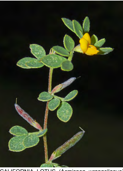
CALIFORNIA LOTUS (Acmispon wrangelianus) Native Annual - Pea Family - (Mar–Jun) -Abundant. Coastal bluffs, chaparral, disturbed areas - Low growing. Flowers yellow aging red, 0.2-0.4" long, almost stemless. Bract lobes same length as flower tube.