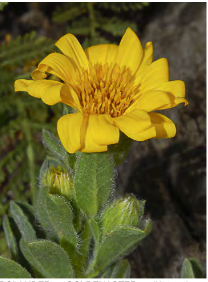
BOLANDER GOLDENASTER (Heterotheca sessiliflora subsp. bolanderi) Native Perennial -Sunflower Family - (Jun–Sep) - Dunes, headlands, grassy coastal slopes - Plant gen 8-28", unbranched. Leaves wide, soft-hairy. Heads clustered, rays 0.3-0.6".