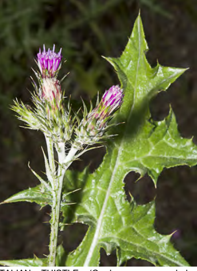
ITALIAN THISTLE (Carduus pycnocephalus subsp. pycnocephalus) Naturalized Annual -Sunflower Family - (Mar–Jul) - Roadsides, pastures, disturbed areas - Stems 8-79", narrow spiny-wings. Lower leaves 4-10 lobed, heads 2-5, flower bracts woolly. NOXIOUS.