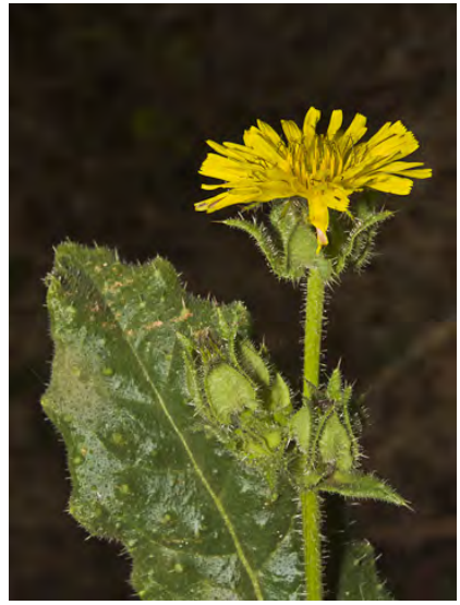
BRISTLY OX-TONGUE (Helminthotheca echioides) Naturalized Annual-Biennial -Sunflower Family - (All year) - Common. Disturbed areas - Stem 1-6.5' tall, bristly. Leaf 2-8" long, covered with prickly bumps. Flower heads 0.8-1.6" wide. INVASIVE weed.