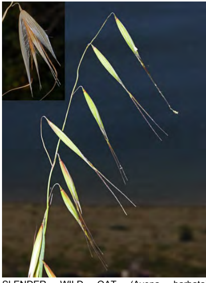
SLENDER WILD OAT (Avena barbata) Naturalized Annual - Grass Family - (Mar–Jun) -Disturbed sites - Plants gen 24-32". Spikelets 0.8-1.2" long. Awns 0.8-1.8" long. Lemma tip bristles >= 0.1" long. Seeds EDIBLE whole or ground for flour. INVASIVE weed.