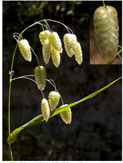
RATTLESNAKE GRASS (Briza maxima) Naturalized Annual - Grass Family - (Apr–Jul) -Shaded sites, roadsides, pastures, weedy on coastal dunes - Stem 8-35" tall. Spikelets 0.4-0.75" long, resemble rattlesnake rattles. INVASIVE weed.