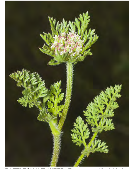
RATTLESNAKE WEED (Daucus pusillus) Native Annual - Carrot Family - (Apr–Jun) - Rocky or sandy places - Plant 1-35" tall, usually < 20". Flower clusters with < 13 flowers, all white. Young roots edible. Sap TOXIC to some people, causing dermititis.