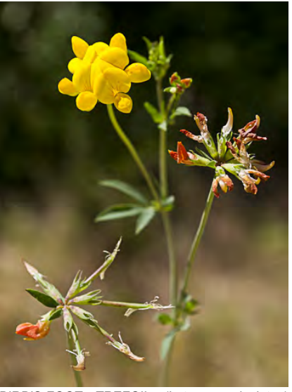
BIRD'S-FOOT TREFOIL (Lotus corniculatus) Naturalized Perennial - Pea Family - (Jun–Sep) -Open, disturbed areas - Leaflets 5, 0.16-0.9" long. Flower cluster 3-7 flowered on0.6-4.7" stalk. Flowers bright yellow, 0.4-0.55" long, banner often reddish.