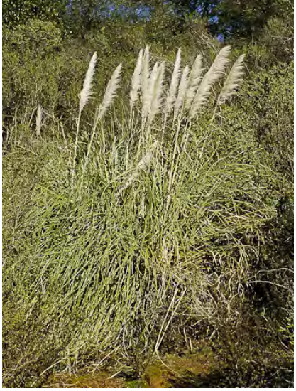
HAIRY PAMPAS GRASS (Cortaderia jubata) Naturalized Perennial - Grass Family - (Sep–Feb) - Disturbed sites, many habitats, esp coastal -Plant 6-23' tall. Leaf blades 0.1-0.5" wide, sheathes hairy. NOXIOUS weed.