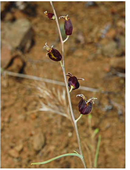
BRISTLY JEWEL FLOWER (Streptanthus glandulosus subsp. glandulosus) Native Annual - Mustard Family - (Apr-Jul) - Serpentine, bare slopes, chaparral & woodland openings - Flower lavender or purple-brown.