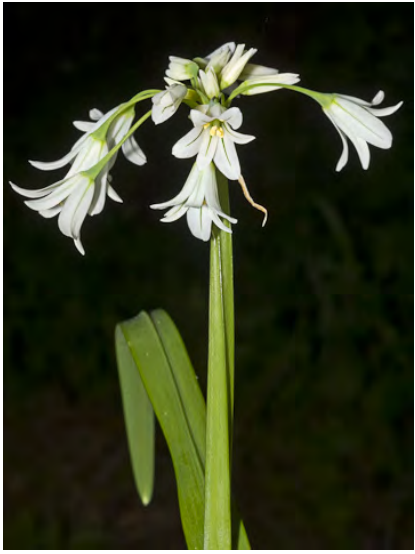
THREE CORNERED LEEK (Allium triquetrum) Naturalized Perennial - Onion or Garlic Family -(Mar-Apr) - Locally common. Shady ± disturbed places - Stem 4-16", sharply 3-angled. Flowers white, 3-15, 0.4-0.7" long, nodding. Escaped ornamentals.