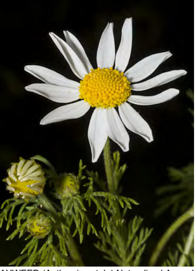
MAYWEED (Anthemis cotula) Naturalized Annual - Sunflower Family - (Apr–Aug) - Common. Disturbed areas, fields, coastal dunes, chaparral, oak woodland - Leaves finely divided into thread-like lobes. Flowers > 0.6" wide, many on top of a well-branched stem.