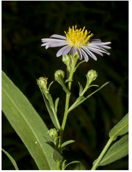
COMMON CALIFORNIA WILD ASTER (Symphyotrichum chilense) Native Perennial -Sunflower Family - (Jun-Oct) - Grassland, salt marshes, disturbed places - Plant 16-39", partly hairy. Leaf 1.6-6", 0.2-1.2" wide. Rays violet, 0.3-0.5" long.