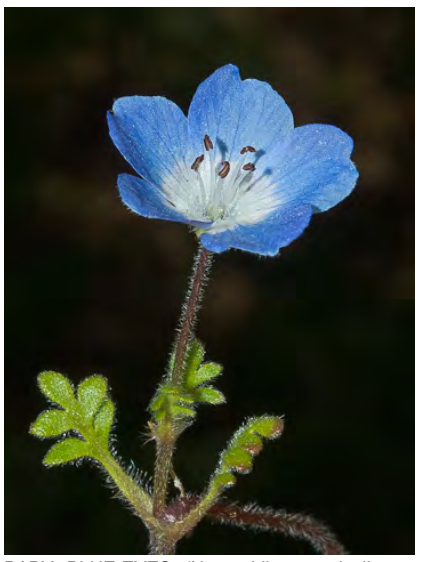
BABY BLUE-EYES (Nemophila menziesii var. menziesii) Native Annual - Borage Family -(Feb-May) - Meadows, grassland, chaparral, woodland, slopes - Plant 4-12". Lower leaves w/6-13 lobes. Flowers bright blue w/white center, 0.2-1.6" wide.