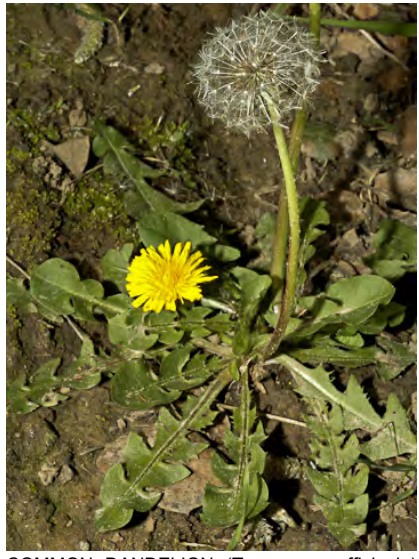
COMMON DANDELION (Taraxacum officinale) Naturalized Biennial-Perennial - Sunflower Family - (Al year) - Abundant. Esp disturbed areas -Stem hollow. Leaves bright green with sharp down-pointing lobes. Outer head bracts reflexed. Fruit ~ brown.