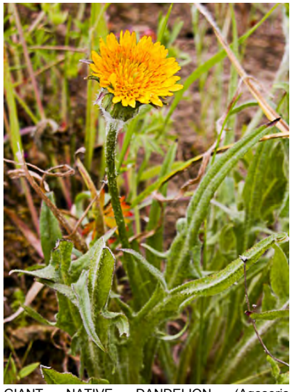
GIANT NATIVE DANDELION (Agoseris grandiflora var. grandiflora) Native Perennial -Sunflower Family - (Apr-Jul) - Grassland, scrub, woodland - Plant 10-40". Leaf lobes point up. Flower rosy-purple, variable-sized bracts. Seed tapers to beak > 2x body length. Leaf lobes point upward.