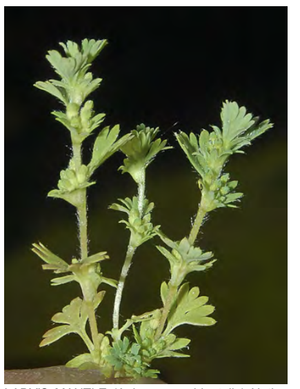
LADY'S MANTLE (Aphanes occidentalis) Native Annual - Rose Family - (Mar–May) - Seasonally moist grassland, chaparral, woodland - Plant inconspicuous, soft hairy, < 4" tall. Leaves 0.1-0.5" long, deeply lobed. Flowers yellow-green, < 0.1" long.