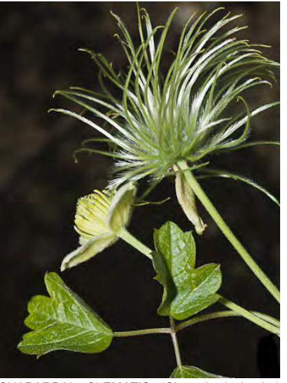
CHAPARRAL CLEMATIS (Clematis lasiantha) Native Perennial - Buttercup Family - (Jan–Jun) -Hillsides, chaparral, open woodland - Woody vine. Leaflets 3-5, +-3-lobed. Flowers gen 1, in spring; sepals white to cream, 0.4-0.8" long.