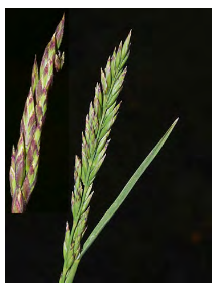
ONE-SIDED BLUE GRASS (Poa secunda subsp. secunda) Native Perennial - Grass Family -(Mar-Aug) - Common. Dry slopes to saline/alkaline meadows to alpine - Plant 6-40" tall, densely tufted. Flower clusters congested. Spikelets gen 0.3-0.4" long. Lemmas 0.16-0.2" long, backs rounded.