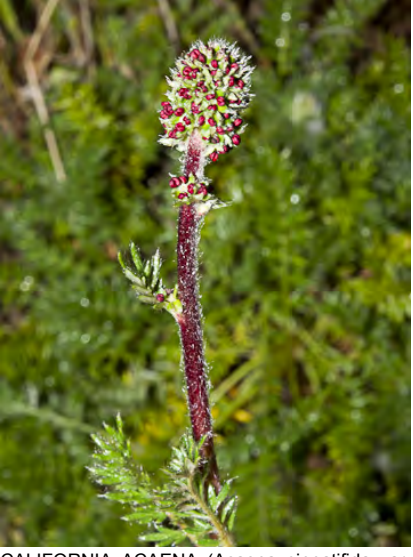
CALIFORNIA ACAENA (Acaena pinnatifida var. californica) Native Perennial - Rose Family -(Mar–May) - Coastal grassland, open, rocky slopes - Stem 4-24" long. Flowers with no petals and purple-black stamens. Leaves finely divided.