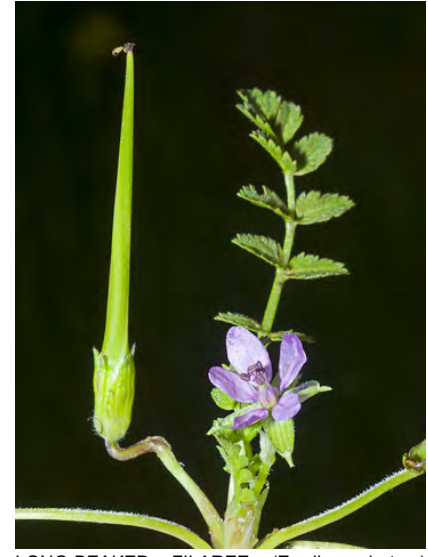
LONG-BEAKED FILAREE (Erodium botrys) Naturalized Annual - Geranium Family -(Mar-Jul) - Dry, open or disturbed sites - Stem 4-35" tall, coarse-hairy. Leaves lobed. Petals pink, 0.3-0.5" long. Sepals w/reddish tip. Fruit beak 2-4.7" long.