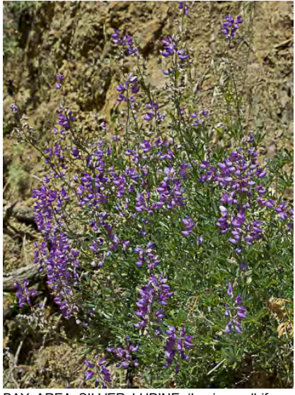
BAY AREA SILVER LUPINE (Lupinus albifrons var. collinus) Native Perennial - Pea Family - (Mar–Jun) - Cliffs, forest openings - Subshrub 8-16" tall, woody only at base, silvery. Flowers 0.35-0.6" long, violet to lavender.