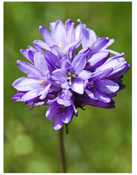
FORK-TOOTHED OOKOW (Dichelostemma congestum) Native Perennial - Brodiaea Family -(Apr–Jun) - Open woodland, grassland - Plant 12-35" tall. Flowers blue-purple, narrowed above ovary. Stamens 3. Late spring bloomer.