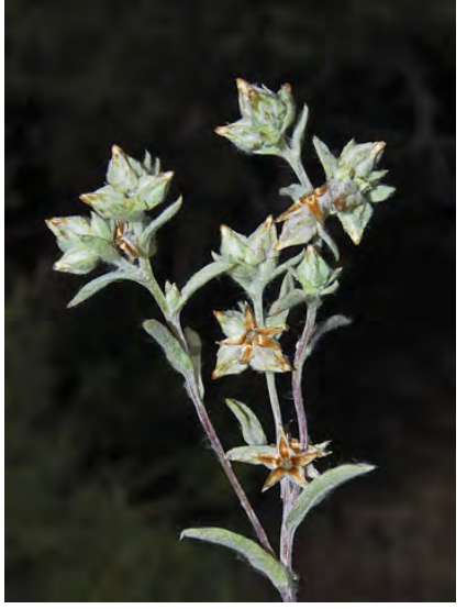
DAGGERLEAF COTTONROSE (Logfia gallica) Naturalized Annual - Sunflower Family -(Mar–Jul) - Bare or grassy openings, burns -Plant 1-20" tall, gen cobwebby. Leaves awl-shaped, stiff, > flower heads. Flowers brown to yellow.