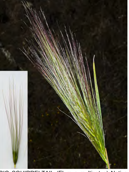
BIG SQUIRRELTAIL (Elymus multisetus) Native Perennial - Grass Family - (May–Jul) - Open, sandy to rocky areas - Tufted. Stem 6-24" tall. Leaf 0.06-0.2" wide. Spikelet 0.4-0.6" long. Glume divisions needle-shaped, lemma awn 1-4" long.