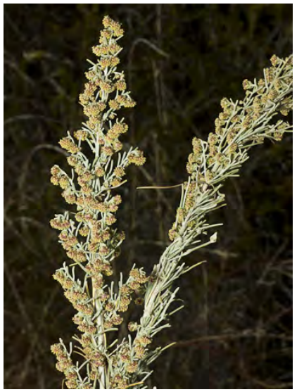
CALIFORNIA SAGEBRUSH (Artemisia californica) Native Perennial - Sunflower Family - (Aug–Nov) - Coastal scrub, chaparral, open woodland - Shrub 2-8.5' tall, rounded. Leaves 0.4-4", hairy, thread-like, It green to gray. Flower heads < 5 mm wide. Sage-scented.