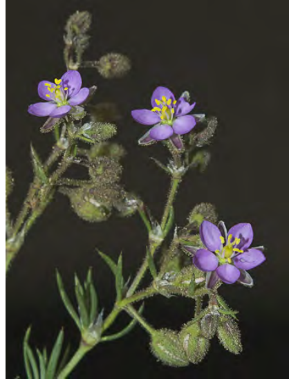
RED SAND-SPURRY (Spergularia rubra) Naturalized Annual-Perennial - Pink Family -(Spring-fall) - Forest, meadows, mud flats, disturbed - Plant 1.6-10". Leaf non-fleshy, whorls w/large white bracts. Petals pink. Stamens 6-10. Sepals < 0.16".