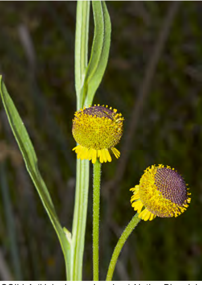
ROSILLA (Helenium puberulum) Native Biennial -Sunflower Family - (Jun-Aug) - Streambanks, seepage areas, lake margins - Plant 20-63". Flower head spherical, disk flowers ~0.1" long, yellow on sides, brown-purple on top; rays 0.15-0.4" long, point down.