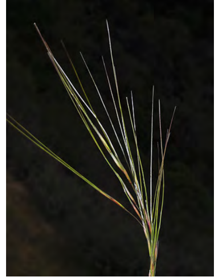
PURPLE NEEDLE GRASS (Stipa pulchra) Native Perennial - Grass Family - (Mar–Jun) - Oak woodland, chaparral, grassland - Stem 14-39" long. Leaf blade 4-8" long, Glumes 0.5-0.8" long, ~equal. Awn 1.6-4" long, last segment straight.