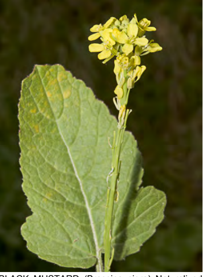
BLACK MUSTARD (Brassica nigra) Naturalized Annual - Mustard Family - (Apr-Sep) - Common. Disturbed areas, fields - Plant 1-6' tall. Petals bright yellow, 0.3-0.4" long. Fruit upright, pressed against stem. INVASIVE weed.