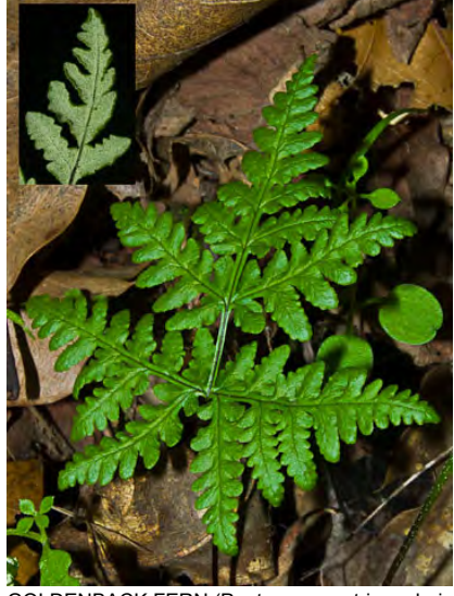
GOLDENBACK FERN (Pentagramma triangularis subsp. triangularis) Native Perennial - Brake Fern Family - - - Gen shaded, sometimes rocky or wooded areas - Leaves triangular, 1.2-4" long, undersides either granular green or powdery gold.