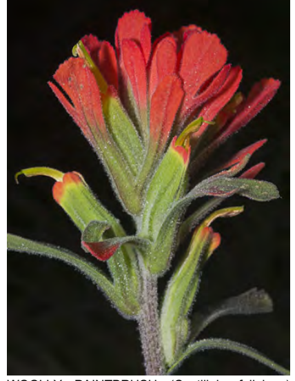
WOOLLY PAINTBRUSH (Castilleja foliolosa) Native Perennial - Broom-rape Family -(Mar–Jun) - Dry, open, rocky slopes, edges of chaparral - Plant 1-2' tall, base slightly woody, much branched, woolly. Flower cluster orange-red (occas. yellow-green).