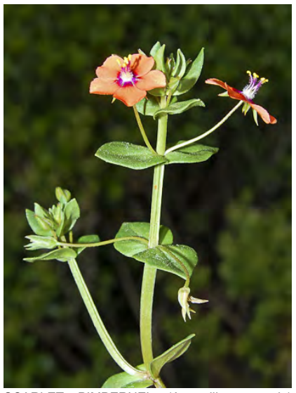
SCARLET PIMPERNEL (Anagallis arvensis) Naturalized Annual - Myrsine Family - (Mar-May) - Common. Disturbed places, ocean beaches -Plants 2-16" tall. Flowers 0.2-0.3" long, salmon or occasionally blue. Leaves TOXIC, can cause dermittis.