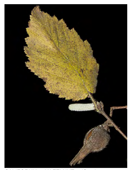
CALIFORNIA HAZELNUT (Corylus cornuta subsp. californica) Native Perennial - Birch Family - (Jan–Mar) - Common. Many habitats, esp moist, shady places - Shrub, small tree < 13' tall. Leaf velvetry-hairy. Fruits 0.8-1.2" long in papery bracts, 1-2/group.