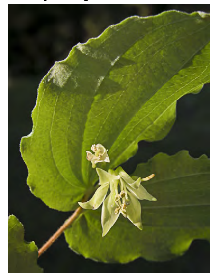
HOOKER FAIRY BELLS (Prosartes hookeri) Native Perennial - Lily Family - (Mar–Jun) -Montane conifer, mixed-evergreen forest, exposed roadside - Stem 12-32" tall. Leaf 1.2-6" long. Flower 0.3-0.6" long, white, hanging below the leaves, stamens > petals.