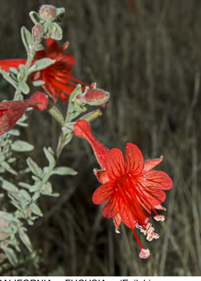
CALIFORNIA FUCHSIA (Epilobium canum subsp. canum) Native Perennial - Evening Primrose Family - (Jun-Dec) - Dry slopes, ridges - Plant hairy, gen sticky with a woody base. Leaf 0.3-2.8" long, gray to green. Flowers red-orange, floral tube 0.8-1.2" long.