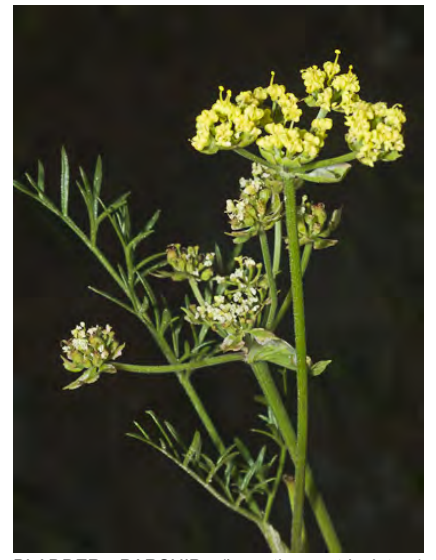
BLADDER PARSNIP (Lomatium utriculatum) Native Perennial - Carrot Family - (Feb-May) -Open grassy slopes, meadows, woodland - Plant 4-20" tall, leafy stem. Leaf lobes linear, bases broad. Flowers bright yellow above unfused, round bractlets. Fruit winged.