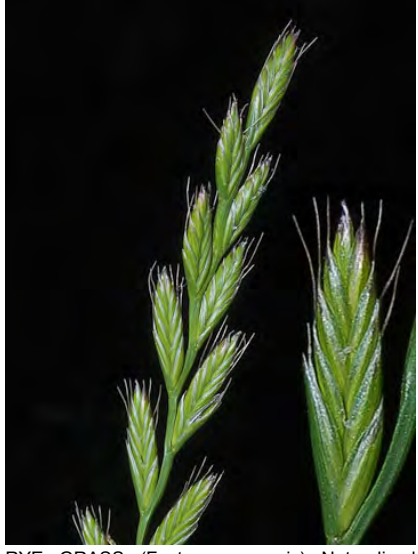
RYE GRASS (Festuca perennis) Naturalized Perennial - Grass Family - (May-Sep) - Dry to moist disturbed sites, abandoned fields - Stem 20-40" tall. Spikelet 0.2-0.9" long, > glume, awned or awnless. Sterile shoots at base. INVASIVE weed.