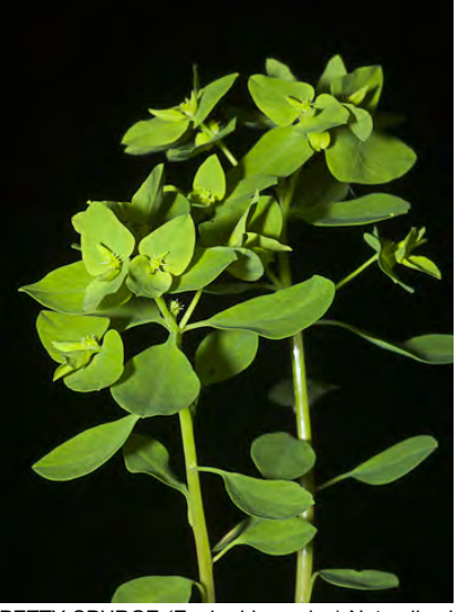
PETTY SPURGE (Euphorbia peplus) Naturalized Annual - Spurge Family - (Feb–Aug) - Common. Disturbed areas - Stem 4-18" cm tall, smooth. Leaves 0.4-1.4" long, entire. Gland crescent-shaped. Seeds dotted. Fruit 2-keeled on angles.