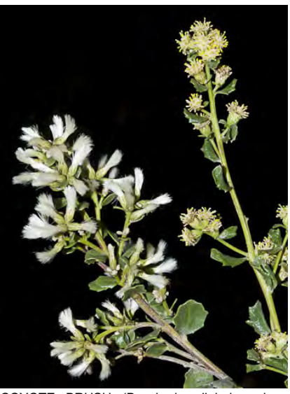
COYOTE BRUSH (Baccharis pilularis subsp. consanguinea) Native Perennial - Sunflower Family - (Jul-Dec) - Coastal bluffs, woodland, grassland, disturbed sites, occ on serpentine - Shrub < 15' tall, brittle, common. Leaves gen 0.6-1.6" long.