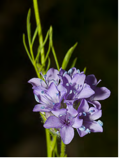
CALIFORNIA GILIA (Gilia achilleifolia subsp. achilleifolia) Native Annual - Phlox Family -(Mar–Jun) - Open or shaded, gen grassy places, sandy or rocky soil - Leaves linear-lobed. Flowers lavender, 0.4-0.8" long, throat > tube, 8-25 in hemispheric head.