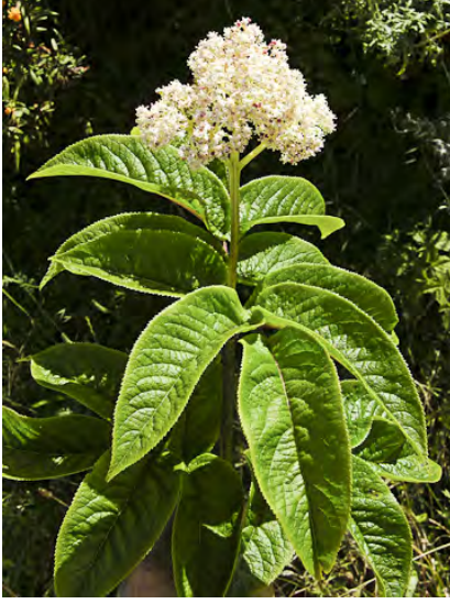
RED ELDERBERRY (Sambucus racemosa var. racemosa) Native Perennial - Muskroot Family -(May-Jul) - Moist places - Shrub/tree 3-20' tall. Leaflets 5-7, 1.6-6.3" long. Flower cluster dome-shaped, gen 6-12 cm diam, petals often reflexed. Fruits red.