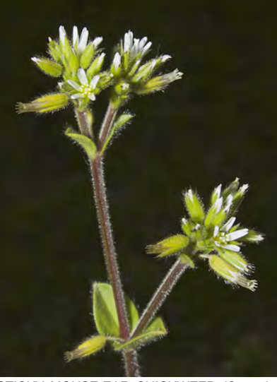
STICKY MOUSE-EAR CHICKWEED (Cerastium glomeratum) Naturalized Annual - Pink Family - (Spring) - Dry hillsides, grassland, chaparral, disturbed areas - Flowers 0.1-02" long, white, sticky-hairy. Flower bract hairs extend beyond tip; bracts herbaceous.