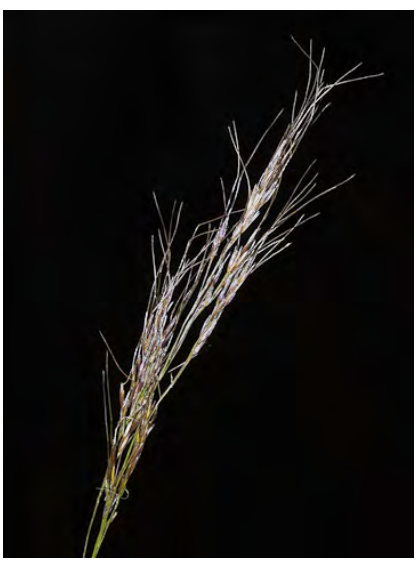
FOOTHILL NEEDLE GRASS (Stipa lepida) Native Perennial - Grass Family - (Mar–Jun) - Dry slopes, chaparral, grassland, savanna, coastal scrub - Stem 14-39" tall. Leaf blade 4.7-9.1" long, narrow. Glumes 0.2-0.6" long. Awn 0.8-2" long.