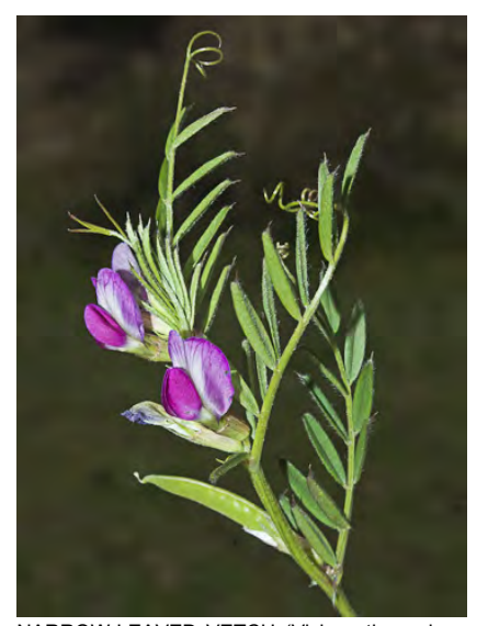
NARROW-LEAVED VETCH (Vicia sativa subsp. nigra) Naturalized Annual - Pea Family -(Mar–Jun) - Roadsides, disturbed areas, grassland, open areas in oak and riparian woodlands - Flowers 1-2 at leaf bases, pink-purple to white, 0.4-0.7" long. Leaflets 0.2-0.3" wide.