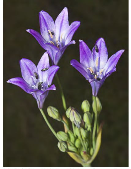
ITHURIEL'S SPEAR (Triteleia laxa) Native Perennial - Brodiaea Family - (Apr–Jun) -Common. Open forest, conifer or foothill woodland, grassland on clay soil - Flower stem 4-28". Leaves 8-16", 0.16-1" wide. Flowers blue, blue-purple or white, 0.7-1.9" long.