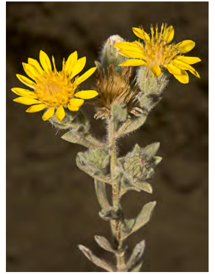
BRISTLY GOLDENASTER (Heterotheca sessiliflora subsp. echioides) Native Perennial -Sunflower Family - (Jul-Oct) - Grassland, scrub, woodland, open forest, disturbed sites - Plant 2-7 dm, bristly. Leaves flat, to 5 cm long, upper reduced. Head bracts not leafy.