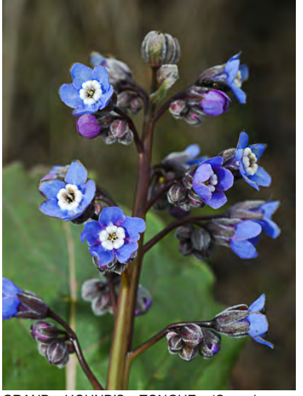
GRAND HOUND'S TONGUE (Cynoglossum grande) Native Perennial - Borage Family -(Feb–May) - Chaparral, woodland - Stem 1-3'. Leaf stalk 3-6". Leaf blade 3-6" cm long, broadly oval. Flowers bright blue w/inner white teeth.