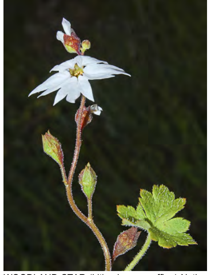
WOODLAND STAR (Lithophragma affine) Native Perennial - Saxifrage Family - (Mar–Apr) - Open, grassy slopes - Plant 4-24" tall. Leaves w/3-5 sharp-toothed shallow lobes, stem leaves alternate. Petals 0.2-0.5" long, white. Hypanthium funnel-shaped.