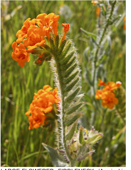
LARGE-FLOWERED FIDDLENECK (Amsinckia grandiflora) Native Annual - Borage Family - (Mar–May) - Grassy slopes - Flowers red-orange, 0.5-0.8" long, 4-6" wide. Flower bract lobes unequal in width, partially fused. Fed & Calif: ENDANGERED.