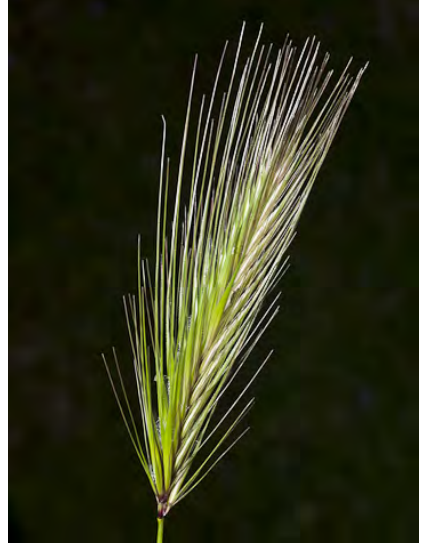
WALL BARLEY (Hordeum murinum subsp. murinum) Naturalized Annual - Grass Family -(Feb-May) - Moist, gen disturbed sites - Stem 1-2'. Leaf auricles notable. Central spikelet stalk 0-0.02". Central floret gen = lateral florets. INVASIVE weed.