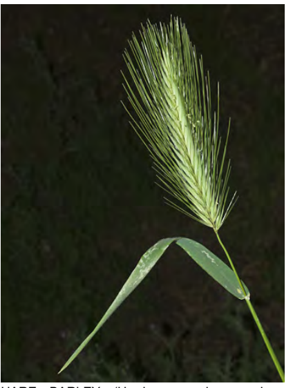
HARE BARLEY (Hordeum murinum subsp. leporinum) Naturalized Annual - Grass Family - (Feb-May) - Moist, gen disturbed sites. Common - Stem 12-43" tall. Central spikelet stalk ~0.06" long. Central floret << lateral florets. INVASIVE weed.