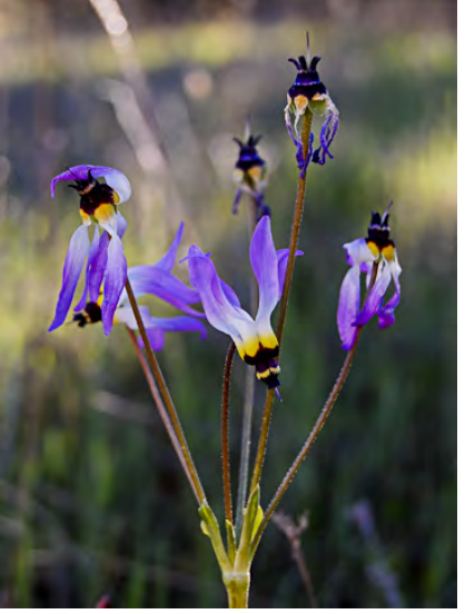
PADRE SHOOTING STAR (Dodecatheon clevelandii subsp. patulum) Native Perennial - Primrose Family - (Mar–May) - Moist places, often on serpentine or in ± alkaline sites - Leaf blade length >2x width. Flowers often white. Filiment tube wlight spots below anthers.