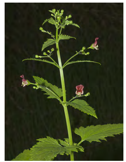
CALIFORNIA FIGWORT (Scrophularia californica) Native Perennial - Snapdragon Family - (Mar-Jul) - Common; damp places, chaparral, roadsides - Stem 2.6-4' tall, square x-section. Leaves opposite, to 7" long, triangular, toothed. Flowers 0.3-0.5" long, upper lips red to maroon, lower paler or yellowish.