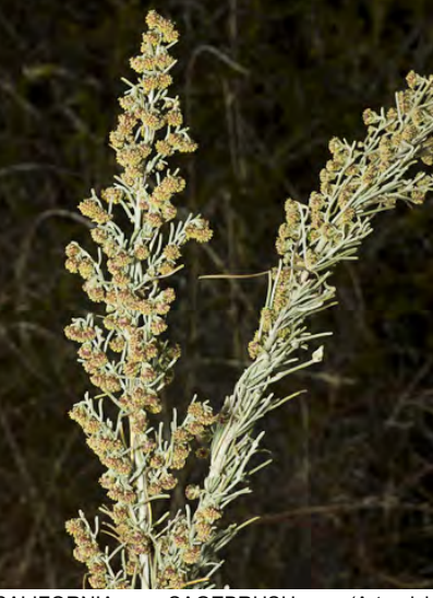
CALIFORNIA SAGEBRUSH (Artemisia californica) Native Perennial - Sunflower Family - (Aug–Nov) - Coastal scrub, chaparral, open woodland - Shrub 2-8.5' tall, rounded. Leaves 0.4-4", hairy, thread-like, It green to gray. Flower heads < 5 mm wide. Sage-scented.