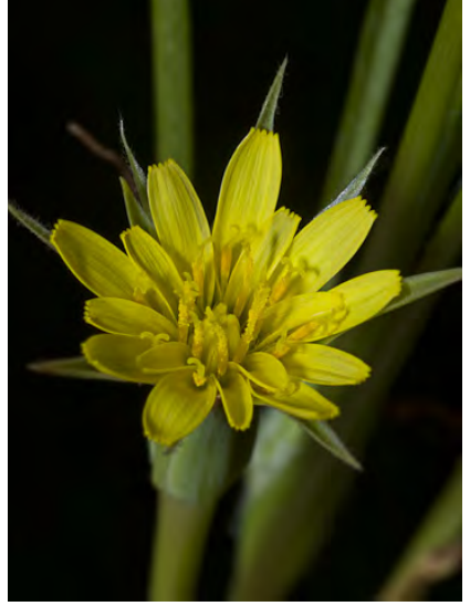
SILVERPUFFS (Uropappus lindleyi) Native Annual - Sunflower Family - (Mar–May) -Common. Open grassland, woodland, chaparral, deserts, gen in loose soils - Heads pale yellow, never nod. Outer head bracts always > 1/4 inner length. Pappus scale notched.