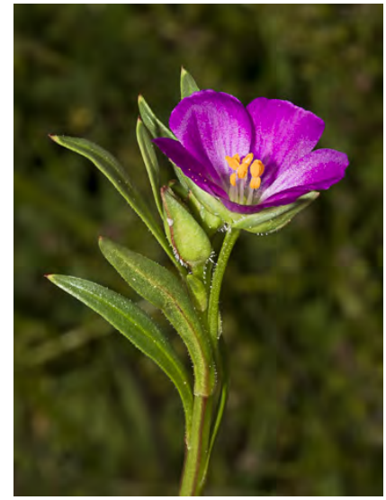
RED MAIDS (Calandrinia ciliata) Native Annual -Miner's Lettuce Family - (Feb–May) - Common. Sandy to loamy soil, grassy areas, cult fields -Petals 0.2-0.6" long, bright pink to red, round-tipped. Fruit < 0.1" longer than bracts.