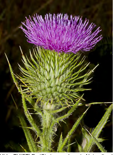
BULL THISTLE (Cirsium vulgare) Naturalized Biennial - Sunflower Family - (May–Oct) -Common. Disturbed areas - Plant 12-79" tall. Top of leaves bristly; leaf base forming decurrent wings on stem. Flowers purple, gen 1-2" wide. NOXIOUS weed.