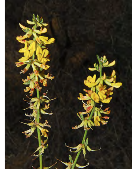
DEERWEED (Acmispon glaber var. glaber) Native Perennial - Pea Family - (Mar–Aug) -Chaparral, roadsides, coastal sands; common -Often shrubby, leaflets 3-6, many clusters of 3-7 stemless flowers, yellow fading to orange-red, 0.3-0.5" long.