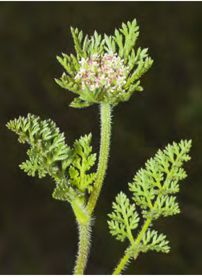
RATTLESNAKE WEED (Daucus pusillus) Native Annual - Carrot Family - (Apr–Jun) - Rocky or sandy places - Plant 1-35" tall, usually < 20". Flower clusters with < 13 flowers, all white. Young roots edible. Sap TOXIC to some people, causing dermititis.