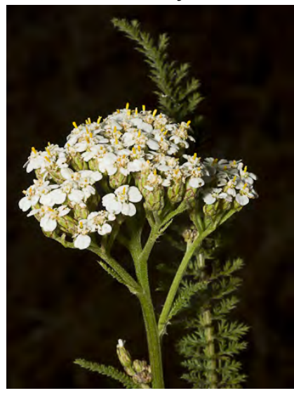
YARROW (Achillea millefolium) Native Perennial - Sunflower Family - (Apr-Sep) - Many habitats -Plant 4"-7' tall. Stem white-hairy. Leaves finely dissected. Flower cluster flat-topped. Flowers white to pink. Widely used in folk medicine.