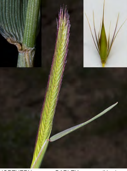
NORTHERNBARLEY(Hordeumbrachyantherum subsp.brachyantherum)NativePerennial -GrassFamily -(May-Aug) -Meadows, pastures, streambanks - Stem 1-3' tall,gen robust.Leaf sheaths gen smooth, blade 7.5"long.Lemma awn < 0.25".</td>