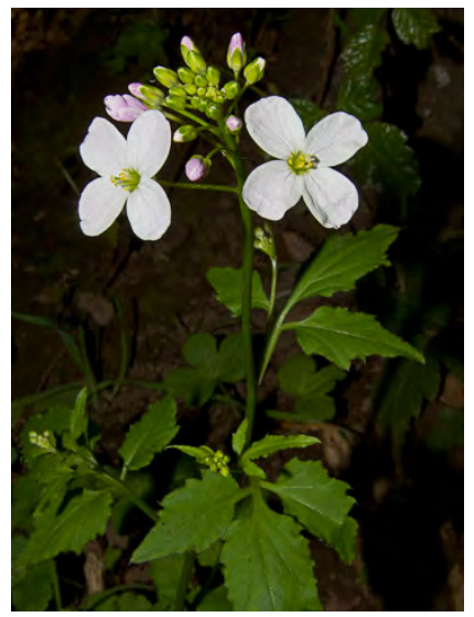
MILK MAIDS (Cardamine californica) Native Perennial - Mustard Family - (Jan–May) - Gen shaded sites, canyons, woodland. One of first spring flowers - Stem 10-24" long. Leaves lobed to compound w/sharp teeth. Petals white or pale rose, 0.3-0.5" long.