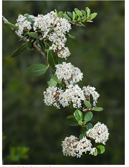
BUCKBRUSH (Ceanothus cuneatus var. cuneatus) Native Perennial - Buckthorn Family -(Feb–May) - Sandy to rocky flats, slopes, ridges -Shrub/tree < 10' tall. Leaves opposite on rigid twigs, w/single main vein. Flowers gen white.