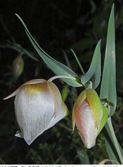
WHITE GLOBE LILY (Calochortus albus) Native Perennial - Lily Family - (Apr–Jun) - Common. Shady to open woodland, scrub - Stem 2-8 dm. Leaves grasslike. Flowers 2-many, hanging, closed at tip. Sepals 10-15 mm. Petals white to pink, 20-25 mm long.