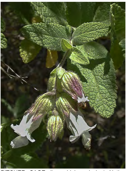
PITCHER SAGE (Lepechinia calycina) Native Perennial - Mint Family - (Apr–Jun) - Common. Rocky slopes; chaparral, woodland - Shrub 3.3-6.6' tall. Leaf blade gen 1.6-4.7" long. Flowers white to lavender tinged, 1-1.2" long, 5-lobed, 2-lipped.