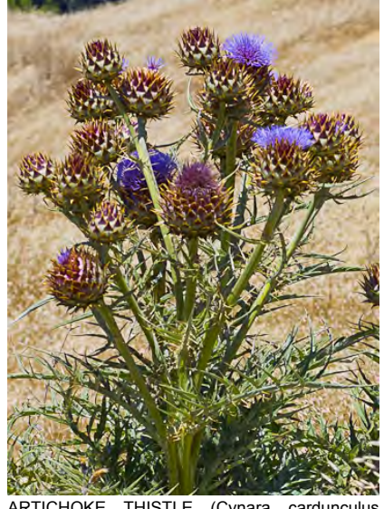
ARTICHOKE THISTLE (Cynara cardunculus subsp. flavescens) Naturalized Perennial -Sunflower Family - (Apr–Jul) - Disturbed places -Plant 1.6-8' tall. Artichoke head 1.6-6" diam, spine-tipped. Flowers blue or purple, 1.2-2" long. NOXIOUS weed.