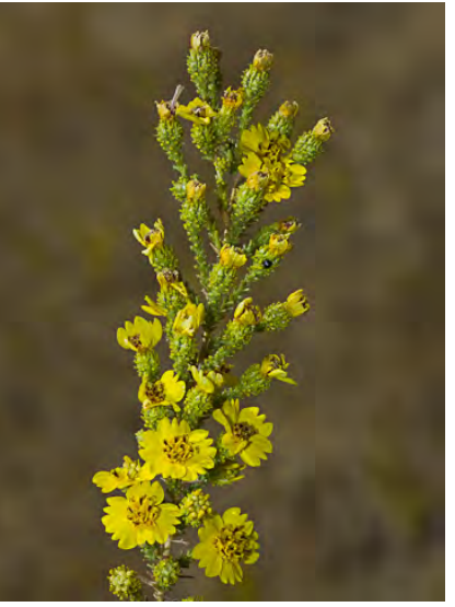
STICKY TARPLANT (Holocarpha virgata subsp. virgata) Native Annual - Sunflower Family -(May–Nov) - Grassland - Plant 8-48" tall, gladular, not very-short-hairy. Heads small, at branch ends. Ray flowers 3-8; disk flowers 9-25, anthers black.