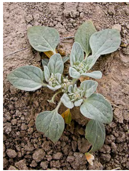
TURKEY-MULLEIN (Croton setigerus) Native Annual - Spurge Family - (May–Oct) - Dry, open, often disturbed areas - Plant < 8" tall, moundlike, covered w/long stiff hairs. Leaf blade 0.4-2" long, oval. TOXIC to livestock.