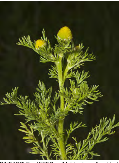
PINEAPPLE WEED (Matricaria discoidea) Naturalized Annual - Sunflower Family -(Feb-Aug) - Abundant. Disturbed sites, riverbanks - Plant 4-12" tall, sweet-scented. Heads pineapple-shaped, ~ 0.4" wide; head stalk to 0.6" long.