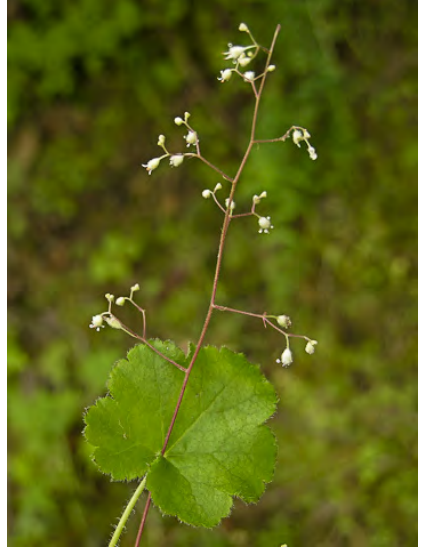
SMALL-FLOWER ALUMROOT (Heuchera micrantha) Native Perennial - Saxifrage Family - (Apr–Jul) - Moist, rocky banks and cliffs - Plant 4-40" tall. Leaf blade 0.8-4.7" long, 5-7 lobed, generally hairy. Petals white, ~ 0.1" long.