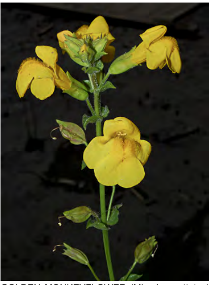
GOLDEN MONKEYFLOWER (Mimulus guttatus) Native Perennial - Lopseed Family - (Mar–Aug) -Common. Wet places, gen terrestrial, occ emergent or floating in mats - Plant 0.8-60". Flower yellow, gen > 0.8" long; mature bracts flattened sideways, inflated in fruit.