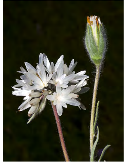
BLOW WIVES (Achyrachaena mollis) Native Annual - Sunflower Family - (Mar–Jun) -Common. Grassy sites, often clay soils - Plant 2-24" tall, soft-hairy. Flowers yellow turning red, 0.1-0.5" wide, extend < 0.1" beyond green bracts. Showy, flat scales attached to seeds.