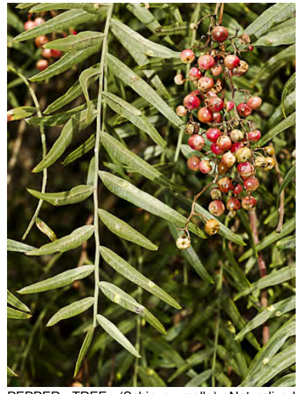
PEPPER TREE (Schinus molle) Naturalized Perennial - Sumac Family - (Jun-Aug) - Washes, slopes, abandoned fields - Tree 16-60' tall. Flowers white to yellow. Leaves compound, leaflets stemless. Fruits pink to red, 0.2-0.3" diam.