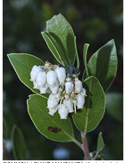
COMMON / GIANT MANZANITA (Arctostaphylos manzanita subsp. manzanita) Native Perennial - Heath Family - (Feb–May) - Chaparral, conifer forest - Erect, 7-26' tall. Flower cluster w/2-7 branches, immature axis 0.6-1.8" long. Flower stalks smooth, hairless.