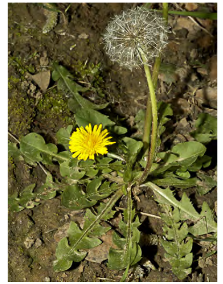
COMMON DANDELION (Taraxacum officinale) Naturalized Biennial-Perennial - Sunflower Family - (All year) - Abundant. Esp disturbed areas -Stem hollow. Leaves bright green with sharp down-pointing lobes. Outer head bracts reflexed. Fruit ~ brown.