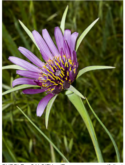
PURPLE SALSIFY (Tragopogon porrifolius) Naturalized Biennial-Perennial - Sunflower Family - (Mar–Nov) - Common. Disturbed places - Plant 16-39" tall, milky sap. Leaves 0.8-1.6" long, very narrow, waxy blue. Flowers purple.