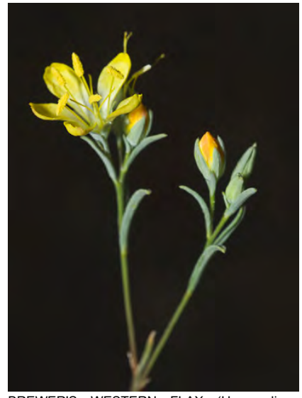
BREWER'S WESTERN FLAX (Hesperolinon breweri) Native Annual - Flax Family - (May–Jun) - Chaparral or grassland, occ on serpentine -Plant 2-8". Flower cluster congested, pedicels < 3 mm. Petals yellow, 0.2-0.4", > sepals. CNPS: FAIRLY ENDANGERED.