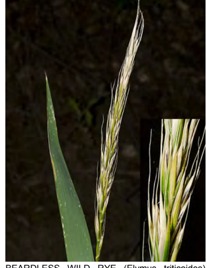
BEARDLESS WILD RYE (Elymus triticoides) Native Perennial - Grass Family - (Jun–Jul) - Dry to moist, often saline, meadows - Plant 18-50" tall, from rhizomes. Flower cluster 2-8" long. Spikelets generally 2/node. Lemmas 3-7, 0.2-0.5" long, awn to 0.12" long.