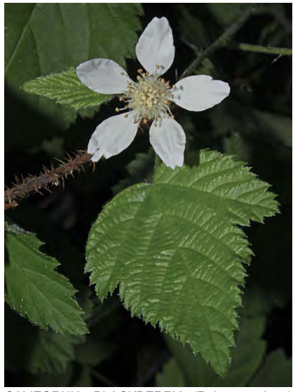
CALIFORNIA BLACKBERRY (Rubus ursinus) Native Perennial - Rose Family - (Mar–Jul) -Open, disturbed areas - Stem round, bristly/prickly. Leaves simple to 3 leaflets, underside green. Plants unisexual. Petals 0.24-0.6" long, white. Blackberry-type fruit.