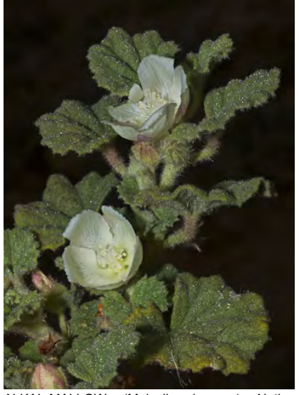
ALKAL-MALLOW (Malvella leprosa) Native Perennial - Mallow Family - (Apr–Nov) - Valleys, gen saline - Stem 4-16" long. Leaf blade 04.-1.4" long, toothed, densely short-hairy. Petals cream-white to yellow, 0.4-0.6" long.