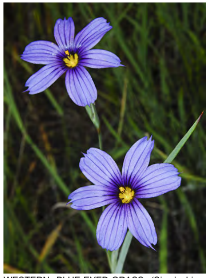
WESTERN BLUE-EYED-GRASS (Sisyrinchium bellum) Native Perennial - Iris Family - (Mar-May) - Common. Open, gen moist, grassy areas, woodland - Stem < 25" tall. Leaves iris-like. Petals 6, blue-purple with dark veins, 0.4-0.7" long.