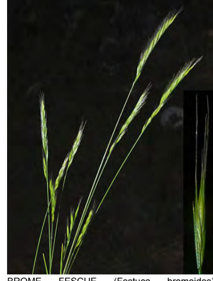
BROME FESCUE (Festuca bromoides) Naturalized Annual - Grass Family - (May–Jun) -Uncommon. Dry, disturbed places, coastal-sage scrub, chaparral - Stem < 20". Inflor 0.6-6" tall, dense, lower branches erect. Spikelet 0.2-0.4" long, awn 0.1-0.3" long.