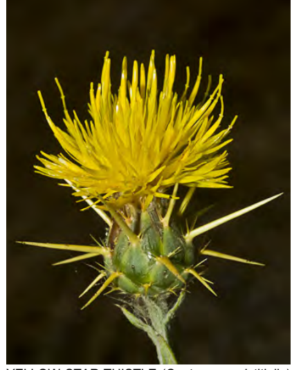
YELLOW STAR-THISTLE (Centaurea solstitialis) Naturalized Annual - Sunflower Family -(May-Oct) - Invasive, roadsides, disturbed grassland or woodland - Plant 4-39" tall. Leaves woolly, extend down the stem. Flower bract spines 0.4-1" long. NOXIOUS weed.