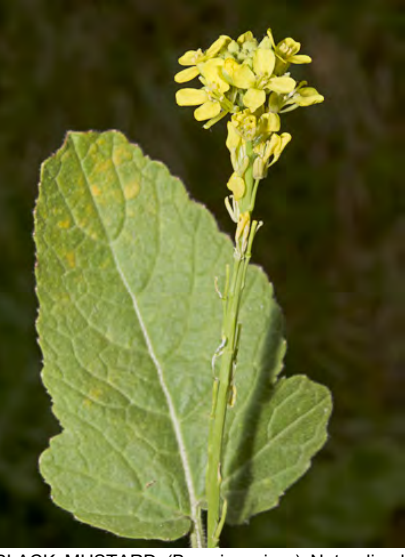
BLACK MUSTARD (Brassica nigra) Naturalized Annual - Mustard Family - (Apr-Sep) - Common. Disturbed areas, fields - Plant 1-6' tall. Petals bright yellow, 0.3-0.4" long. Fruit upright, pressed against stem. INVASIVE weed.