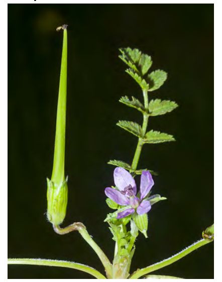
LONG-BEAKED FILAREE (Erodium botrys) Naturalized Annual - Geranium Family -(Mar-Jul) - Dry, open or disturbed sites - Stem 4-35" tall, coarse-hairy. Leaves lobed. Petals pink, 0.3-0.5" long. Sepals w/reddish tip. Fruit beak 2-4.7" long.