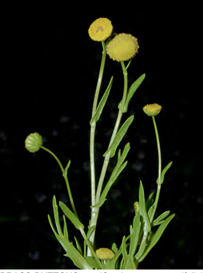
BRASS-BUTTONS (Cotula coronopifolia) Naturalized Perennial - Sunflower Family -(Mar-Dec) - Common. Saline and freshwater marshes, mud flats - Plant 2-16"+ tall, smooth, ± fleshy. Leaves linear to lance-shaped w/linear teeth or lobes. INVASIVE.