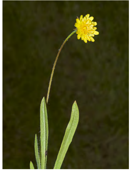
ANNUAL NATIVE DANDELION (Agoseris heterophylla var. cryptopleura) Native Annual - Sunflower Family - (May–Jun) - Many open habitats - Leaf lobes gen 3-5 pair. Flower stem > 2x leaf length. Ray flowers 0.4-0.6" long, much exceeding bracts.