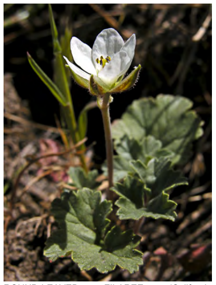
ROUND-LEAVED FILAREE (California macrophylla) Native Annual - Geranium Family -(Mar–Jul) - Open sites, grassland, scrub -Flowers white. Leaves smooth-edged, kidney-shaped, only at base. CNPS: SERIOUSLY ENDANGERED.