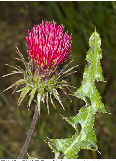
VENUS THISTLE (Cirsium occidentale var. venustum) Native Biennial - Sunflower Family -(May–Jul) - Disturbed areas, grassland, woodland - Plant 1.6-9.8' tall. Head bract cluster 0.6-2" tall, 0.6-3" diam. Flowers gen bright red-pink to red, 0.9-1.4" long.