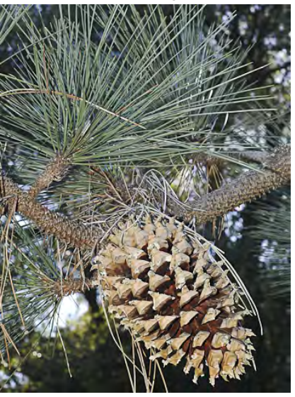
GRAY PINE (Pinus sabiniana) Native Perennial -Pine Family - - - Foothill woodland, n oak woodland, chaparral, infertile soils in mixed-conifer and hardwood forests - Tree < 125' tall. Needles in 3s, 3.5-15" long, gray-green. Cone brownish, seed > wing.