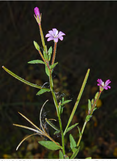
CHAPARRAL WILLOWHERB (Epilobium minutum) Native Annual - Evening Primrose Family - (Apr–Sep) - Dry, open, disturbed areas, vernal pools, often after fire - Plant < 16" tall. Flower cluster open. Petals 0.1-0.2" long, white or pink. Leaves flat, not clustered.