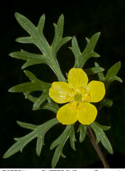
WESTERN BUTTERCUP (Ranunculus occidentalis var. occidentalis) Native Perennial -Buttercup Family - (Mar–Jul) - Grassy slopes in meadows or open woodland - Plant 4-24". Basal leaves partly divided. Petals 5-6, 0.2-0.4" long. Fruit w/short bristles.