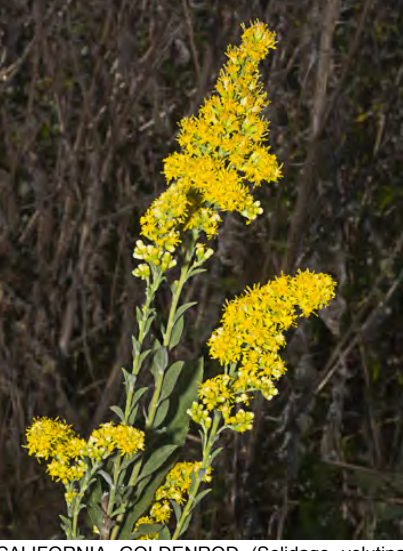
CALIFORNIA GOLDENROD (Solidago velutina subsp. californica) Native Perennial - Sunflower Family - (May–Nov) - Woodland margins, grassland, disturbed soils - Stem 8-60" tall. Gen densely short-soft-hairy. Flower cluster height 2-4x width.