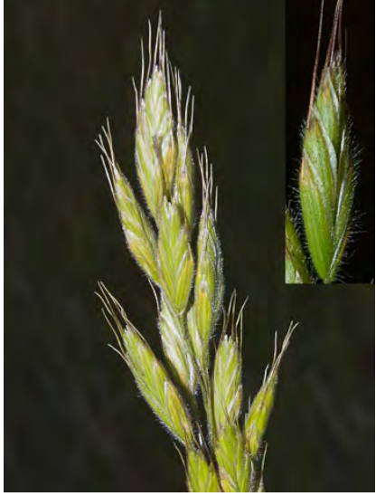
SOFT CHESS (Bromus hordeaceus) Naturalized Annual - Grass Family - (Apr-Jul) - Fields, disturbed areas - Plant 4-26" tall. Leaf hairy. Flower cluster 1-5" long, dense, some stalks > spikelet. Spikelet 0.5-0.9". Lemma 0.26-0.4", awn 0.16-0.4". INVASIVE weed.