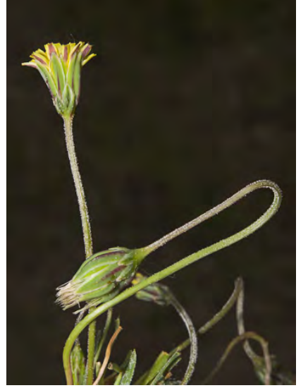
SIERRA FOOTHILL SILVERPUFFS (Microseris acuminata) Native Annual - Sunflower Family - (Apr–Jun) - Grassy, open rocky or clay soil - Plant 2-14". Leaves 1-8" long, basal, linear-lobed. Rays 5-50, yellow. Pappus scale > 0.2" long, no notch.