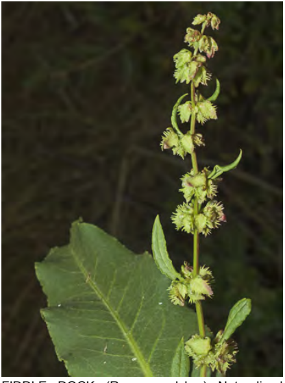
FIDDLE DOCK (Rumex pulcher) Naturalized Perennial - Buckwheat Family - (May–Sep) -Disturbed places, meadows, moist or dry habitats - Stem 8-24" long, branches widely spreading. Leaf blades 1.6-4" long, 1.2-2" wide. Valves w/2-5 teeth.