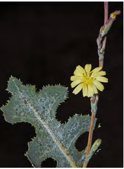
PRICKLY LETTUCE (Lactuca serriola) Naturalized Annual - Sunflower Family -(May–Oct) - Abundant. Disturbed places - Stem 1.6-10' tall, prickly-bristly. Leaves deeply-lobed, midvein and edges prickly-bristly. Flowers pale yellow, 0.16-0.2" wide.