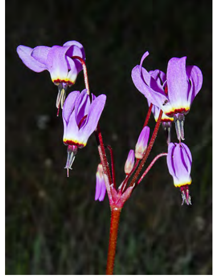
MOSQUITOBILLS SHOOTING STAR (Dodecatheon hendersonii) Native Perennial -Primrose Family - (Mar–Jul) - Gen in shady sites - Leaf blade length generally <2x width. Flower parts 4s or 5s. Filament tube solid black.