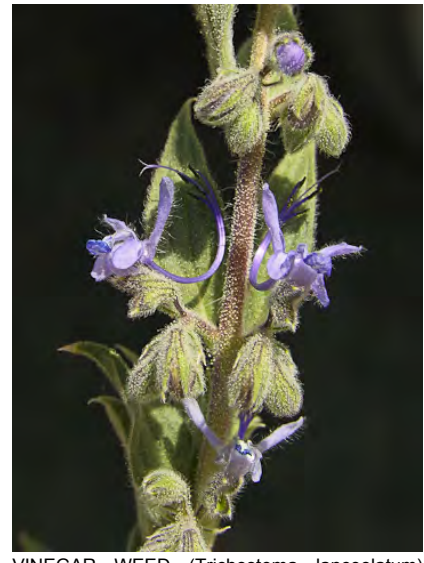
VINEGAR WEED (Trichostema lanceolatum) Native Annual - Mint Family - (Jun–Nov) - Dry, open, gen disturbed habitats - Plant < 39" tall. Leaf blades 0.8-2.8" long, leaf stalk, ~ stalkless. Flowers purple-blue, tube 0.2-0.4" long, curving up. Vinegar scent.