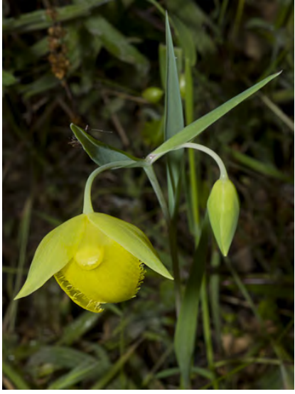
MOUNT DIABLO FAIRY-LANTERN (Calochortus pulchellus) Native Perennial - Lily Family -(Apr-Jun) - Wooded slopes, rarely chaparral, gen n aspect - Stem 4-12", gen branched. Petals light yellow, 1-1.3", sparsely hairy inside. CNPS: FAIRLY ENDANGERED.