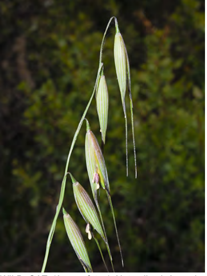
WILD OAT (Avena fatua) Naturalized Annual -Grass Family - (Apr-Jun) - Disturbed sites -Plants 1-5' tall. Spikelets 0.7-1.3" long. Low awn 1-1.6" long. Lemma tip bristles < 0.04" long. Seeds EDIBLE whole or ground for flour. INVASIVE weed.