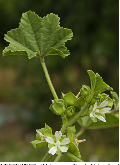
CHEESEWEED (Malva parviflora) Naturalized Annual - Mallow Family - (Mar–May) - Common. Disturbed places - Stem 8-32" long, gen erect, widely branched. Flower bractlets linear. Petals 0.1-0.2" long, pink to gen white. Fruit with flange from flower bracts.