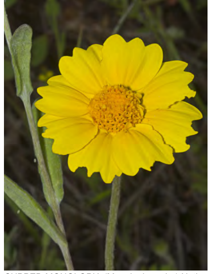
CUPPED MONOLOPIA (Monolopia major) Native Annual - Sunflower Family - (Feb–Jul) -Grassland, bare clay - Plant 2-32" tall. Rays 0.3-0.8" long, 3-lobed, yellow to cream. Head bracts 0.3-0.5" long, fused into a cup w/triangular lobes.