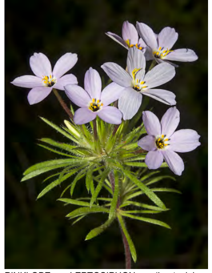
PINKLOBE LEPTOSIPHON (Leptosiphon androsaceus) Native Annual - Phlox Family -(Apr-Jun) - Open or shaded areas in woodland, chaparral - Plant 2-18", hairy. Flowers pink, bracted group, tube 0.4-1.3" long, lobes gen > 0.3" long.