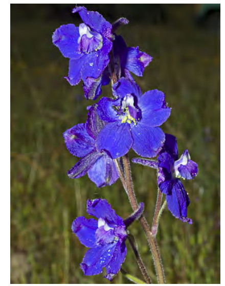
ROYAL LARKSPUR (Delphinium variegatum subsp. variegatum) Native Perennial - Buttercup Family - (Mar–May) - Grassland, open oak woodland - Stem < 24" w/spreading hairs. Leaves w/finger-like segments. Flowers dark royal blue, large and few.