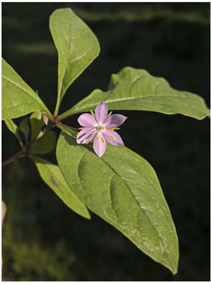
STARFLOWER (Trientalis latifolia) Native Perennial - Myrsine Family - (Apr–Jul) - Shaded places, esp woodland - Stem 2-12". Leaves 1-3.5" long, 0.4-2" wide, egg-shaped; stem leaves in 1 whorl near stem tip. Flower gen pink to rose, 0.3-0.6" wide.