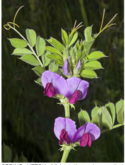
SPRING VETCH (Vicia sativa subsp. sativa) Naturalized Annual - Pea Family - (Mar–Jun) -Roadsides, disturbed areas, grassland, open areas in oak and riparian woodlands - Flowers 1-2 at leaf bases, pink-purple to white, 0.7-1.2" long. Leaflets 0.16-0.4" wide.