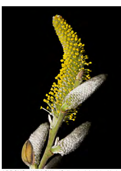
ARROYO WILLOW (Salix lasiolepis) Native Perennial - Willow Family - (Jan–Jun) - Common. Shores, marshes, meadows, etc - Shrub-tree, bark smooth. Leaf-like stipules. Leaf egg-shaped, waxy below. Fruit smooth, bract persistent, dark, stamens 2.