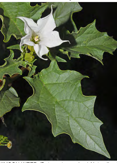
JIMSON WEED (Datura stramonium) Naturalized Annual - Nightshade Family - (Jun–Aug) - Sandy soils, open, often disturbed areas - Plants < 4' tall. Flowers white or pale blue-purple, 2.5-3.5" long; calyx 1.2-1.6" long. Cultivated. All parts very TOXIC.