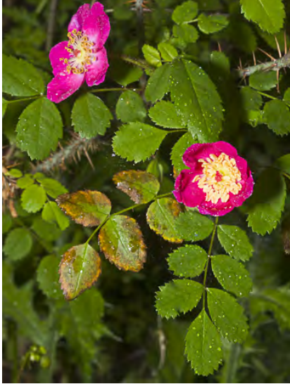
WOOD ROSE (Rosa gymnocarpa var. gymnocarpa) Native Perennial - Rose Family -((Feb)Apr-Jul) - Common. Gen in shade of forest, scrub - Shrub w/straight thorns. Flowers gen solitary, stalks sticky, fruit smooth, sepals deciduous.