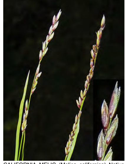
CALIFORNIA MELIC (Melica californica) Native Perennial - Grass Family - (Apr–May) - Open or rocky hillsides, oak woodland, conifer forest -Stem 16-55". Leaf 0.06-0.2" wide. Spiklet 0.2-0.6" long, w/3-7 fertile florets; sterile tip widest above middle, tip squared.