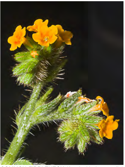
COMMON FIDDLENECK (Amsinckia intermedia) Native Annual - Borage Family - (Mar–Jun) -Abundant. Open, generally disturbed places -Plant 0.5-3' tall. Flowers orange with 5 red spots, 0.3-0.4" long, 0.2-0.4" wide, tube straight.