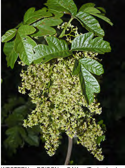
WESTERN POISON OAK (Toxicodendron diversilobum) Native Perennial - Sumac Family -(Apr–Jun) - Canyons, slopes, chaparral, coastal scrub, oak woodland - Shrub or vine. Leaflets 3, red in fall, mid leaflet stalked. Flowers green. Fruits white. TOXIC.