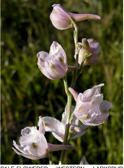
PALE-FLOWERED WESTERN LARKSPUR (Delphinium hesperium subsp. pallescens) Native Perennial - Buttercup Family - (Mar–May) - Oak woodland, e slope coast ranges - Plant gen 16-32" w/short-hairy base. Flowers white, pinkish or It blue.