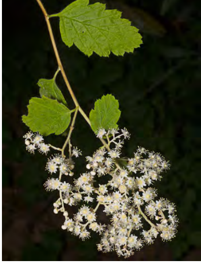
OCEANSPRAY (Holodiscus discolor var. discolor) Native Perennial - Rose Family -(May–Aug) - Moist woodland edges, rocky slopes - Shrub 5-20' tall. Leaf blade 0.6-3.1" long, toothed at end. Flower cluster 0.8-10" long. Petals white, ~0.07" long.