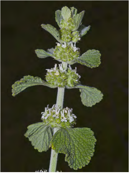
COMMON HOREHOUND (Marrubium vulgare) Naturalized Perennial - Mint Family - (Mar-Nov) -Disturbed sites, gen overgrazed pastures - Stem 4-24" long. Leaf blades 0.6-2.2" long. Flower bract w/10 hook-tipped teeth. Flowers white, ~0.2" long. INVASIVE.