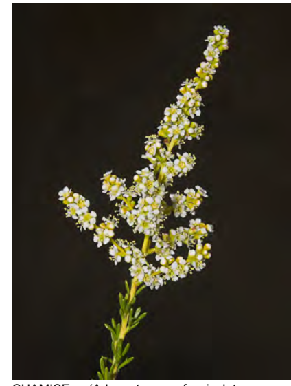
CHAMISE (Adenostoma fasciculatum var. fasciculatum) Native Perennial - Rose Family -(May–Jun) - Dry slopes, ridges, chaparral - Shrub or small tree < 13' tall. Flowers cream to white. Leaves narrow, shiny with flammable oils in warm weather.