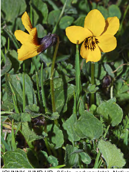
JOHNNY-JUMP-UP (Viola pedunculata) Native Perennial - Violet Family - (Feb–Apr) - Open, grassy slopes, hillsides, chaparral, oak woodland, gen full sun - Plant 2-15" tall. No basal leaves. Petals gold-yellow, lower 3 brown-veined, upper 2 red-brown on back.