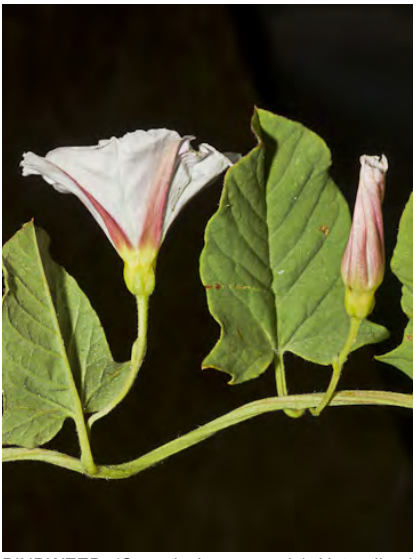
BINDWEED (Convolvulus arvensis) Naturalized Perennial - Morning-glory Family - (Mar–Oct) -Roadsides, open areas in many pl communities -Trailing. Leaf 0.8-1.2" long, w/round tip, pointed lobes. Flowers white to pink, 0.8-1" long. NOXIOUS.