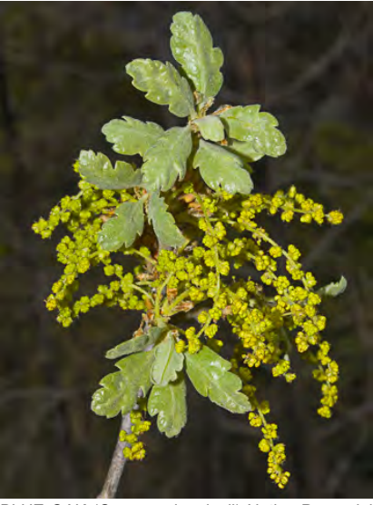
BLUE OAK (Quercus douglasii) Native Perennial - Oak Family - (Apr–May) - Dry slopes, interior foothills, woodland - Tree 20-66', deciduous. Bark checkered into scales. Leaves 1.2-2.4" long, bluish green, unlobed to shallowly lobed, lacking bristles.