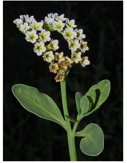
SEASIDE HELIOTROPE (Heliotropium curassavicum var. oculatum) Native Perennial - Borage Family - (Feb–Oct) - Moist to dry, saline to alkaline soils, gen near water - Plant fleshy. Leaf 0.4-2.4 cm long. Flowers white w/ yellow center, 0.12-0.2" long.