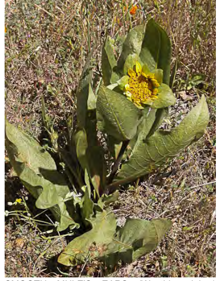
SMOOTH MULE'S EARS (Wyethia glabra) Native Perennial - Sunflower Family - (Mar–Jun) -Gen shady sites - Plant 4-16" tall, shiny green, no woolly hairs. Leaf basal blades 10-18" long, lance-shaped to oval, shiny. Ray flowers 1-2" long.