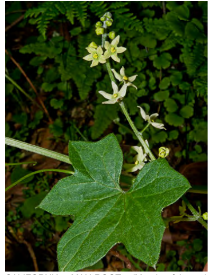
CALIFORNIA MAN-ROOT (Marah fabacea) Native Perennial - Gourd Family - (Feb-Apr) -Streamsides, washes, shrubby open areas - Vine 6-20' long. Leaves moderately lobed. Flowers cream or white, < 0.3" wide. Fruit spiny all over.