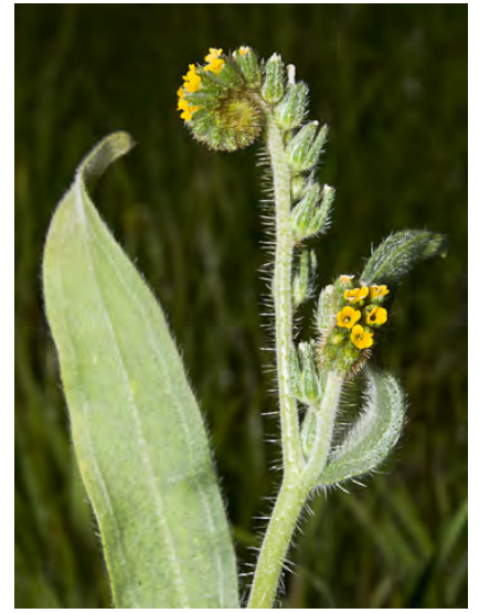
SMALL-FLOWERED FIDDLENECK (Amsinckia menziesii) Native Annual - Borage Family -(May–Jul) - Shade-tolerant, open, disturbed areas at forest/woodland edges - Flowers yellow to orange-yellow, generally spotted, 0.2-0.3" long, 0.1" wide. Leaves coarse-hairy.