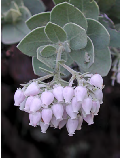
MOUNT DIABLO MANZANITA (Arctostaphylos auriculata) Native Perennial - Heath Family -(Feb-Mar) - Sandstone, upland chaparral near coast. Mount Diablo and vicinity - Leaves clasping. Densely fine-hairy leaves, twigs & fruit. CNPS: ENDANGERED.