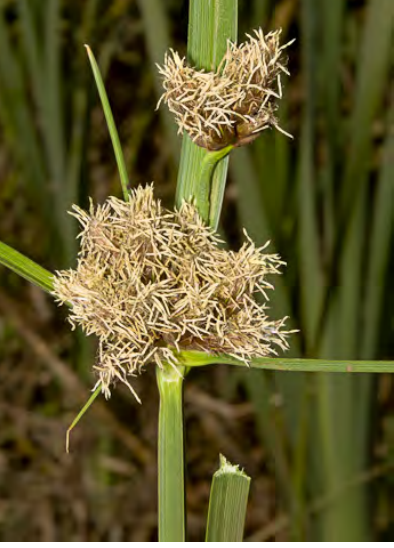
OLNEY'S THREE-SQUARE BULRUSH (Schoenoplectus americanus) Native Perennial -Sedge Family - (Summer) - Mineral-rich or brackish marshes, shores, fens, springs - Stem 1.2-8.2' tall, sharply 3-angled, not leafy. Flower cluster head-like.