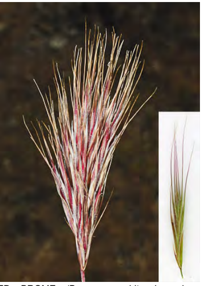
RED BROME (Bromus madritensis subsp. rubens) Naturalized Annual - Grass Family -(Mar–Jun) - Disturbed areas, roadsides - Plant 4-20". Flower cluster condensed, branches obscure, < spikelets. Stem & sheathes hairy. INVASIVE weed.