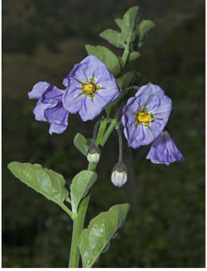
BLUE WITCH (Solanum umbelliferum) Native Perennial - Nightshade Family - (All year) -Shrubland, mixed-evergreen forest, woodland -Plant gen < 39", upper stem hairs branched, dense. Flowers 0.6-1" wide, purple, with green spots at the base.