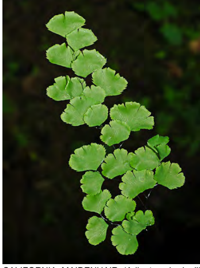
CALIFORNIA MAIDENHAIR (Adiantum jordanii) Native Perennial - Brake Fern Family - - - Shaded hillsides, moist woodland - Leaves 8-28" long with many rounded symmetrical segments, each with < 4 irregular lobes. Cultivated. Sudden Oak Death carrier.