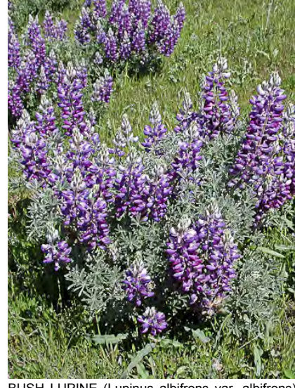
BUSH LUPINE (Lupinus albifrons var. albifrons) Native Perennial - Pea Family - (Mar–Jun) -Common. Chaparral, foothill woodland - Shrub 2-16' tall, gen distinct trunk, green to silvery. Flowers 0.35-0.6'' long, purple, banner back hairy, keel top ciliate mid to tip.