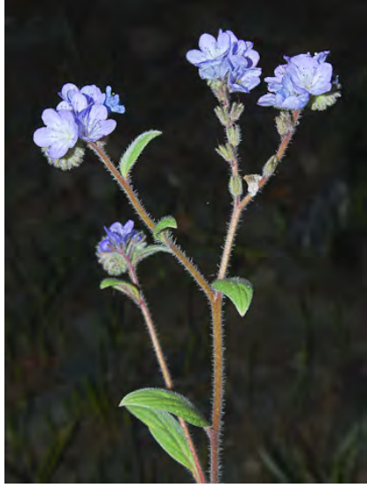
DIVARICATE PHACELIA (Phacelia divaricata) Native Annual - Borage Family - (Apr-Jun) -Open areas, chaparral, woodland, grassland -Plant 3.5-16" tall. Leaves with 0-few lobes. Flowers 0.4-0.6" long, lavender to violet. Seeds 8-16.