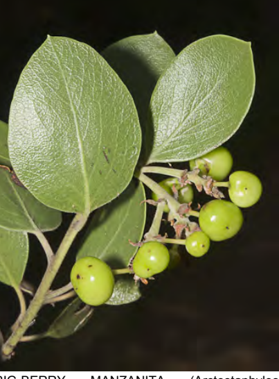
BIG-BERRY MANZANITA (Arctostaphylos glauca) Native Perennial - Heath Family - (Dec-Mar) - Rocky slopes, chaparral, woodland - Shrub-small tree, 3-26' tall. Twigs glabrous. Leaves smooth, waxy-white. Flower stalk 0.3-0.4" long, sticky-hairy.