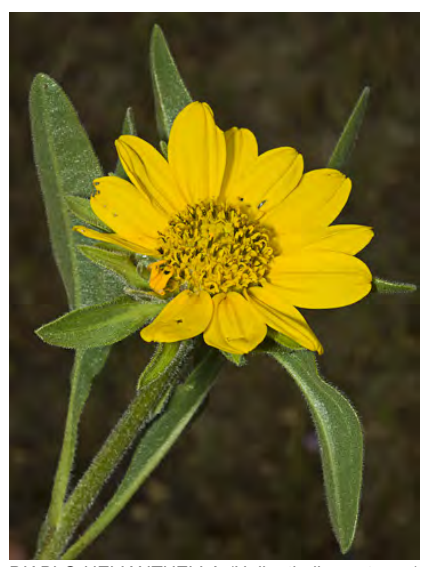
DIABLO HELIANTHELLA (Helianthella castanea) Native Perennial - Sunflower Family - (Apr–Jun) -Open, grassy sites - Stem 4-20" tall. Leaves w/ 1 pair of veins more distinct. Outer head bracts leaf-like, curl around head. CNPS: FAIRLY ENDANGERED.