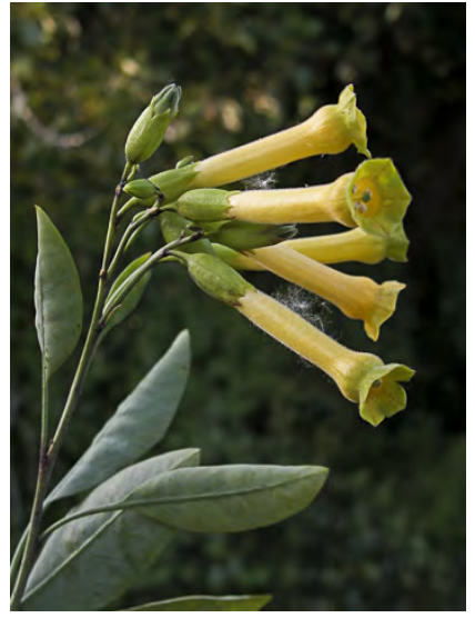
TREE TOBACCO (Nicotiana glauca) Naturalized Perennial - Nightshade Family - (Apr–Aug) -Open, disturbed flats or slopes - Shrub or small tree, waxy-blue. Leaves 2-8" long. Flowers yellow, 1.2-1.4" long. INVASIVE. TOXIC to livestock.