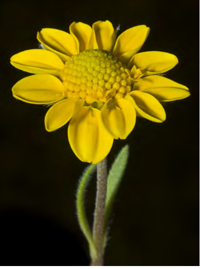
CALIFORNIA GOLDFIELDS (Lasthenia californica subsp. californica) Native Annual -Sunflower Family - (Feb–Jun) - Many habitats -Stem < 16" tall, hairy. Leaves 0.3-2.8" long, <0.25" wide, smooth edged. Head bracts 4-13, not joined. Rays 0.2-0.7" long.