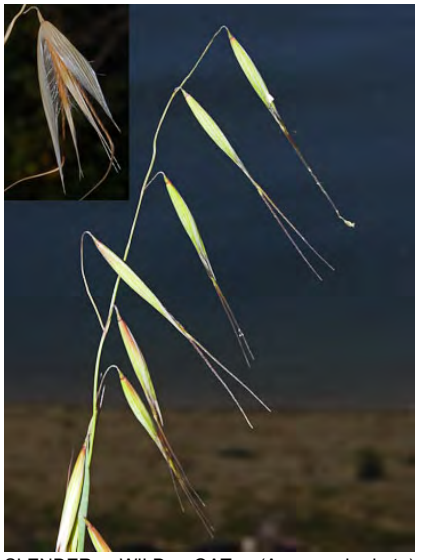
SLENDER WILD OAT (Avena barbata) Naturalized Annual - Grass Family - (Mar–Jun) -Disturbed sites - Plants gen 24-32<sup>°</sup>. Spikelets 0.8-1.2" long. Awns 0.8-1.8" long. Lemma tip bristles ≻= 0.1" long. Seeds EDIBLE whole or ground for flour. INVASIVE weed.