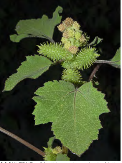
COCKLEBUR (Xanthium strumarium) Native Annual - Sunflower Family - (Jul–Oct) -Disturbed, seasonally wet, often alkaline sites, in grassland, marshes, watercourses - Plant 4-32" tall. Stem spineless. Bur 0.4-1.2"+ long.