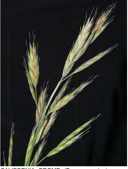
CALIFORNIA BROME (Bromus carinatus var. carinatus) Native Perennial - Grass Family - (Apr–Aug) - Coastal prairies, openings in chaparral, plains, open oak and pine woodland -Plant 20-40° tall. Flower cluster 6-16° long. Spikelet 0.8-1.6° long. Lemma 0.5-0.8° long, hairy, awn 0.3-0.6° long.