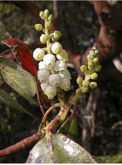
PACIFIC MADRONE (Arbutus menziesii) Native Perennial - Heath Family - (Mar–May) - Conifer, oak forests - Tree < 130' tall, evergreen, peeling red bark. Leaf blades < 5" long. Flowers yellow-white or pink, < 3.1" long. Berries red, < 0.5" diam, round.