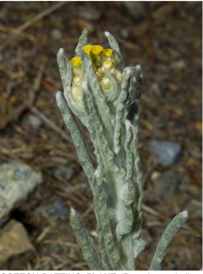
COTTON-BATTING PLANT (Pseudognaphalium stramineum) Native Annual - Sunflower Family - (Mar–Aug) - Many habitats, dunes, chaparral slopes, roadsides - Heads 0.16-0.2" long, female flowers > 0.08" long, pappus bristles free.