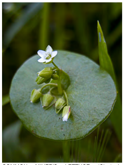
COMMON MINER'S LETTUCE (Claytonia perfoliata subsp. perfoliata) Native Annual -Miner's Lettuce Family - (Jan-May) - Vernally moist, often shady or disturbed sites - Basal leaf length <3x width. Stem leaf gen not angled. Seeds shiny w/large appendage.