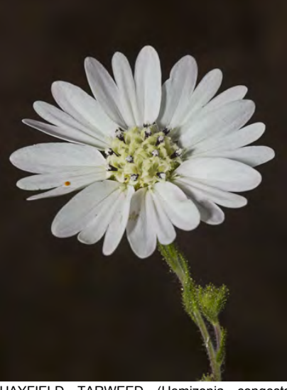
HAYFIELD TARWEED (Hemizonia congesta subsp. luzulifolia) Native Perennial - Sunflower Family - (Mar-Dec) - Disturbed, open, or grassy sites, often clayey soils, serpentine - Plant 2-32" tall. Flowers white, rays 0.2-0.5" long; head bract tips < body.