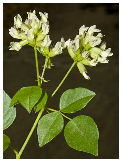
CALIFORNIA TEA (Rupertia physodes) Native Perennial - Pea Family - (May–Sep) - Woodland -Stem ~1.6'. Leaflets 3, triangular to lance-shaped, 1.4-2.8" long, sticky. Flower bracts not hairy, lobes =. Flowers white or yellow, banner 0.4-0.55" long.