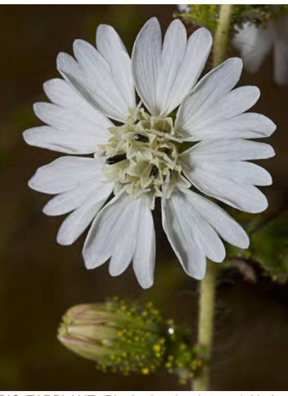
BIG TARPLANT (Blepharizonia plumosa) Native Annual - Sunflower Family - (Jul–Nov) - Dry slopes in grassland - Plant 4-70"+ tall, sticky, aromatic. Rays 5-13, white, 0.2-0.4" long; disk pappus plumose, ~0.1" long. CNPS: SERIOUSLY ENDANGERED.