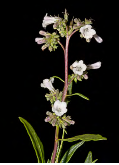
CALIFORNIA YERBA SANTA (Eriodictyon californicum) Native Perennial - Borage Family - (Apr-Jul) - Slopes, fields, roadsides, woodland, chaparral - Shrub 3.3-10' tall. Leaf blade sticky, <= 6" long, 1.6-2" wide. Flowers white to purple, 0.3-0.5" long.