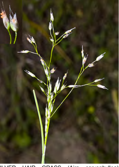
SILVER HAIR GRASS (Aira caryophyllea) Naturalized Annual - Grass Family - (Apr–Jun) -Sandy soils, open or disturbed sites - Flower cluster > 0.6" wide, diffuse with long slender branches. Spikelets about 0.1" long with 2 extended awns.