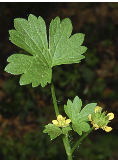
PRICKLESEED BUTTERCUP (Ranunculus muricatus) Naturalized Annual - Buttercup Family - (Apr–Jun) - Stream-banks, drainages, low meadows - Plant 6-20". Leaves gen 3-lobed. Petals yellow, 5, 0.16-0.3" long. Fruits 0.2" long with curved bristles.