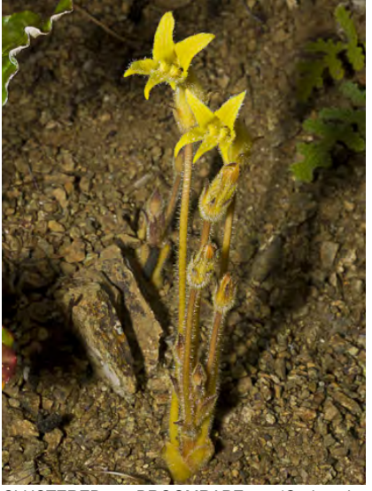
CLUSTERED BROOMRAPE (Orobanche fasciculata) Native Perennial - Broom-rape Family - (Apr–Jul) - Dry, gen bare places. Root parasite on various shrubs - Plant 2-8" tall. Flowers pink or yellow, 5-20 on long stems.