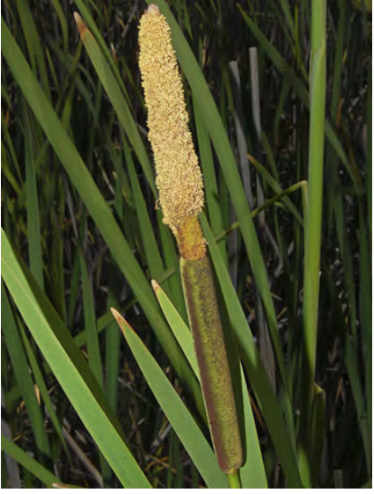
BROAD-LEAVED CATTAIL (Typha latifolia) Native Perennial - Cattail Family - (Jun–Jul) -Unpolluted to nutrient-rich freshwater (brackish) marshes - Plant 4.9-9.8' tall. Widest leaves 0.4-1.1" wide. Flower cluster with no gap between flower types.