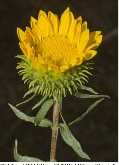
GREAT VALLEY GUMPLANT (Grindelia camporum) Native Perennial - Sunflower Family - (May–Nov) - Sandy or saline bottomland, roadsides - Stem non-woody, 2-8' tall, whitish. Leaves gen resinous. Head to 1.2" wide, bracts bend downward.