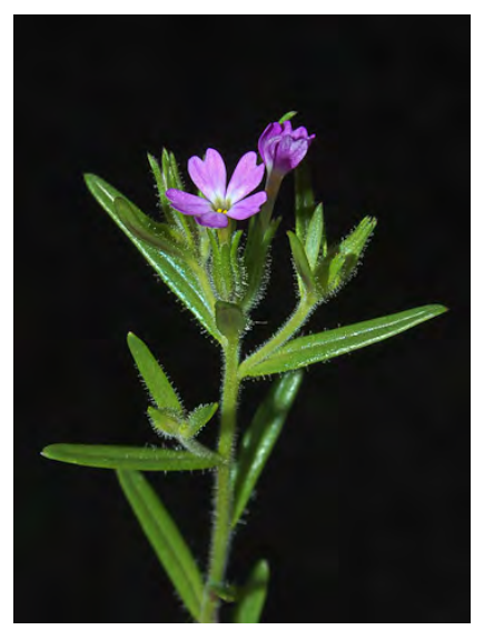
SLENDER ANNUAL PHLOX (Microsteris gracilis) Native Annual - Phlox Family - (Mar–Aug) - Dry to moist areas - Plant < 8" tall, glandualr-hairy. Leaves 0.4-1.2" long. Flowers 0.3-0.5" long, tubes yellow, lobes bright pink to white.