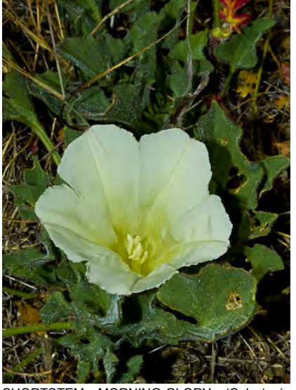
SHORTSTEM MORNING-GLORY (Calystegia subacaulis subsp. subacaulis) Native Perennial - Morning-glory Family - (Apr–Jun) - Dry, open scrub or woodland - Stem gen ~0.8" long. Flowers 1.3-2.4" long, white or cream. Bractlets concealing flower bracts.