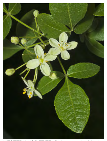
WESTERN HOP TREE (Ptelea crenulata) Native Perennial - Rue Family - (Apr–May) - Scrub, woodland - Shrub/tree < 16' tall. Leaflets 3, 0.8-2.8" long, citrus odor when crushed. Petals green-white, 0.16-0.2" long, fragrant. Fruits 1-2 cm long.