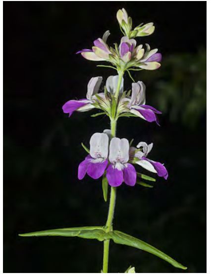
CHINESE-HOUSES (Collinsia heterophylla var. heterophylla) Native Annual - Plantain Family -(Mar-Jun) - Shady places in chaparral, open mixed woodland, oak woodland - Plant 4-20" tall. Flowers 0.6-0.8" long, upper lip whitish.