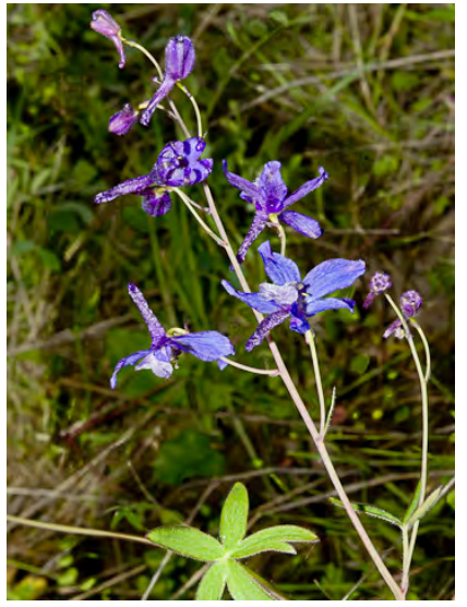
COAST LARKSPUR (Delphinium decorum subsp. decorum) Native Perennial - Buttercup Family - (Mar-May) - Open coastal grassland, chaparral - Stems 3-14" tall. Leaves short-hairy under, with few-toothed lobes. Flowers few, dark blue-purple.