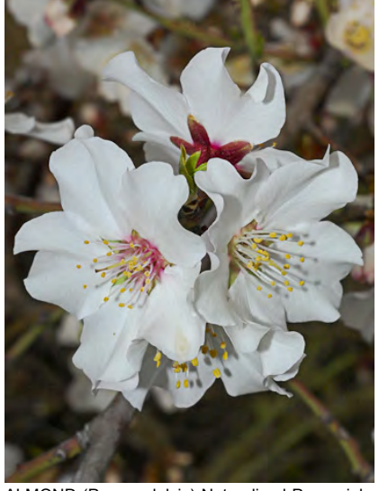
ALMOND (Prunus dulcis) Naturalized Perennial -Rose Family - (Feb–Mar) - Canyons, roadsides, grassland (as waif) - Tree 16-26' tall. Leaf blades 1-4" long. Flowers 1-3/cluster. Petals pink to nearly white, 0.5-1" long. Fruit 1-1.6" long, hairy. Cultivar.