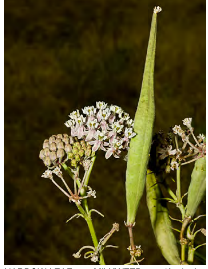
NARROW-LEAF MILKWEED (Asclepias fascicularis) Native Perennial - Dogbane Family - (May–Oct) - Dry ground, valleys, foothills - Plant gen hairless. Stem leaves narrow, 3-5 in whorls. Flowers green-white to purple-tinged, ~0.25" long.