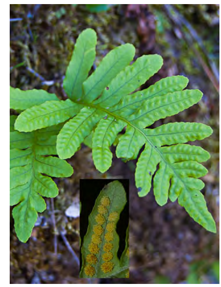
POLYPODY FERN (Polypodium calirhiza) Native Perennial - Polypody Family - - On plants, rocky cliffs or outcrops, roadcuts, often granitic or volcanic, rarely dunes - Leaf blades 4-8" long, often widest above base, deeply lobed.