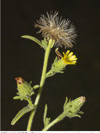
STINKWORT (Dittrichia graveolens) Naturalized Annual - Sunflower Family - (Sep–Nov) -Disturbed areas - Plant 8-24" tall, camphor-scented, glandular. Flowers yellow. Flower-head bracts Aster-like. Fall bloomer. INVASIVE weed.