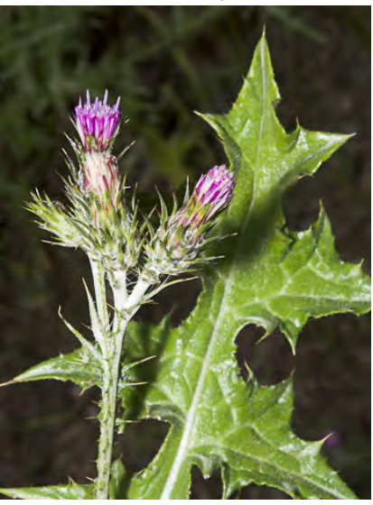
ITALIAN THISTLE (Carduus pycnocephalus subsp. pycnocephalus) Naturalized Annual -Sunflower Family - (Mar–Jul) - Roadsides, pastures, disturbed areas - Stems 8-79", narrow spiny-wings. Lower leaves 4-10 lobed, heads 2-5, flower bracts woolly. NOXIOUS.