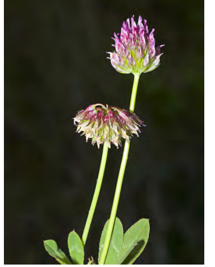
FOOTHILL CLOVER (Trifolium ciliolatum) Native Annual - Pea Family - (Mar–Jun) - Locally common. Grassland, chaparral, disturbed areas -Flower head 0.3-0.8" wide w/vestigial bract. Flowers pink to purple, soon reflexed, bracts w/short, flat bristles.