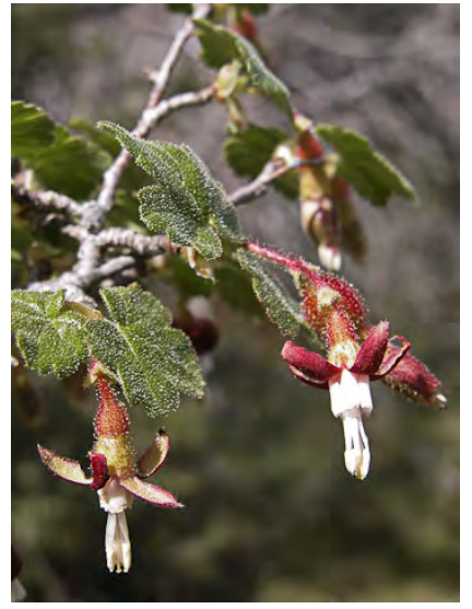
CANYON GOOSEBERRY (Ribes menziesii var. menziesii) Native Perennial - Gooseberry Family - (Feb-Apr) - Common. Forest openings, chaparral - Shrub < 10', prickly. Leaves sticky below. Styles glabrous, anthers exserted, sepals purplish.