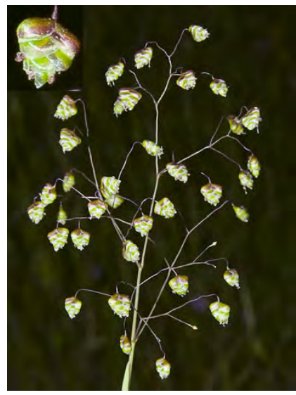
LITTLE QUAKING GRASS (Briza minor) Naturalized Annual - Grass Family - (Apr–Jul) -Shaded or moist, open sites - Stem 3-20" tall. Spikelets 0.1-0.2" long, resemble tiny rattlesnake rattles.