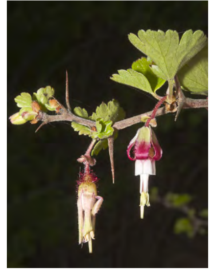
HILLSIDE GOOSEBERRY (Ribes californicum var. californicum) Native Perennial - Gooseberry Family - (Feb–Mar) - Forest openings, woodland -Shrub < 5' tall. Leaf blades 0.4-1.2" long, not sticky. Sepals greenish, petals 0.12" long, white.