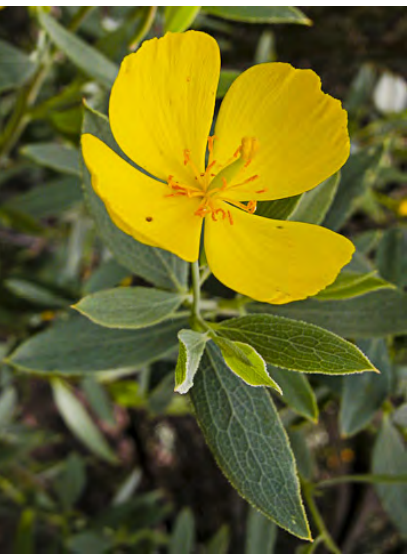
BUSH POPPY (Dendromecon rigida) Native Perennial - Poppy Family - (Apr–Jun) - Dry slopes, washes, esp recent burns - Shrub 3.3-10' tall. Leaves 1-4" long, 0.3-1" wide. Petals 4, yellow, 0.8-1.2" long. Many stamens.