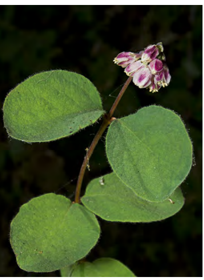
CREEPING SNOWBERRY (Symphoricarpos mollis) Native Perennial - Honeysuckle Family -(Apr-May) - Ridges, slopes, open places in woodland - Shrub 6-24" tall, sprawling. Flowers < 8/cluster, pink + often red outside, 0.16" long, bell-shaped, symetrical.