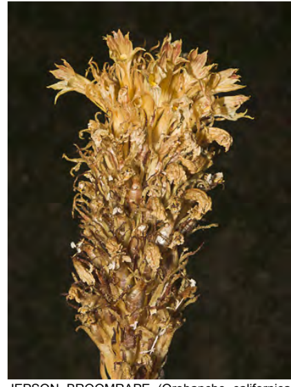
JEPSON BROOMRAPE (Orobanche californica subsp. jepsonii) Native Perennial - Broom-rape Family - (Jul-Sep) - Uncommon. Gen dry flats, slopes. Root parasite on sunflower family - Plant 4-14" tall. Flowers > 20, stalkless, lips 0.4-0.55" long, buff-colored.