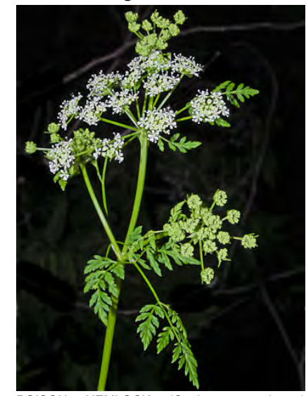
POISON HEMLOCK (Conium maculatum) Naturalized Biennial - Carrot Family - (Apr–Jul) -Common. Moist, esp disturbed places - Plants 2-10' tall. Stems purple-spotted. Leaves fern-like, gen 2x divided. Flowers white. TOXIC. INVASIVE weed.