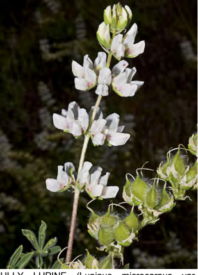
GULLY LUPINE (Lupinus microcarpus var. densiflorus) Native Annual - Pea Family -(Apr–Jun) - Abundant. Open or disturbed areas, occ seeded on roadbanks - Plant 4-32" tall, hairy. Flowers 0.3-0.7" long, white to yellow. Flower bract hairs few, short.