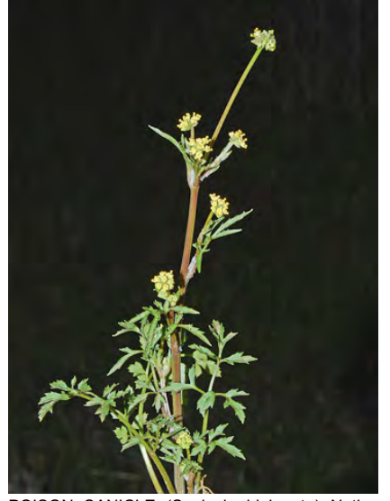
POISON SANICLE (Sanicula bipinnata) Native Perennial - Carrot Family - (Apr–May) - Open grassland or pine/oak woodland - Plants 5-24" tall. Leaves 2x pinnate. Flowers yellow, male flower stalk < fruit. Reported to be slightly TOXIC.