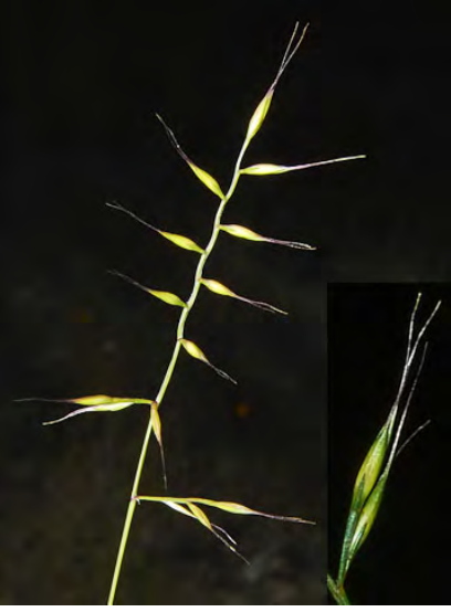
HAIRY FESCUE (Festuca microstachys) Native Annual - Grass Family - (Apr-Jun) - Disturbed, open, gen sandy soils - Stem 6-29". Spikelet 0.2-0.4" long, awn 0.1-0.5" long. Glumes & lemma smooth or hairy.