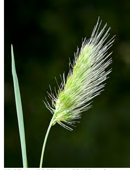
BRISTLY DOGTAIL GRASS (Cynosurus echinatus) Naturalized Annual - Grass Family -(May–Jul) - Open, disturbed sites - Tufted. Stem 4-28" long. Leaf blade 0.1-0.6" wide. Flower cluster 0.4-1.6" long, 1-sided. Fertile and sterile spikelets. INVASIVE weed.