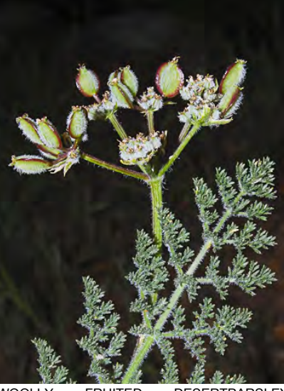
WOOLLY FRUITED DESERTPARSLEY (Lomatium dasycarpum subsp. dasycarpum) Native Perennial - Carrot Family - (Mar–Jun) Rocky (gen serpentine), chaparral, woodland -Plant 4-20", short-hairy. Flowers greenish-white, petals and fruit hairy.