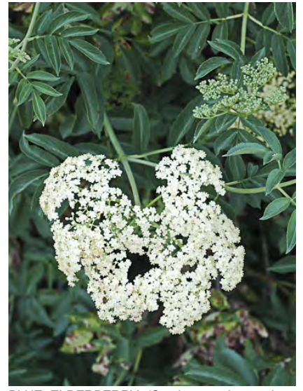
BLUE ELDERBERRY (Sambucus nigra subsp. caerulea) Native Perennial - Muskroot Family - (Mar-Sep) - Common. Streambanks, open places in forest - Shrub 7-26' tall. Flower cluster flat-topped, 1.6-13" diam, petals spreading. Fruits waxy blue-black.