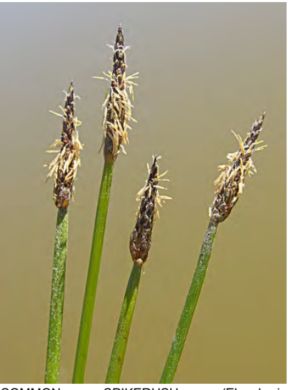
COMMON SPIKERUSH (Eleocharis macrostachya) Native Perennial - Sedge Family -(Spring-summer) - Common. Fresh to brackish wetland - Stem 8-39" tall, 0.06-0.1" wide. Spikelet 0.2-1.6" long, 0.08-0.2" wide, style 2-branched.