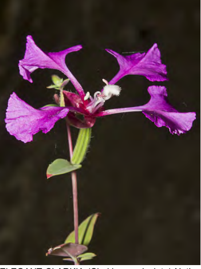
ELEGANT CLARKIA (Clarkia unguiculata) Native Annual - Evening Primrose Family - (Apr–Sep) -Common. Woodland - Buds nodding. Axis erect. Petals 0.4-1" long, pink to dark-red, clawed. Sepals united; sepals & ovary w/spreading hairs to 0.1".