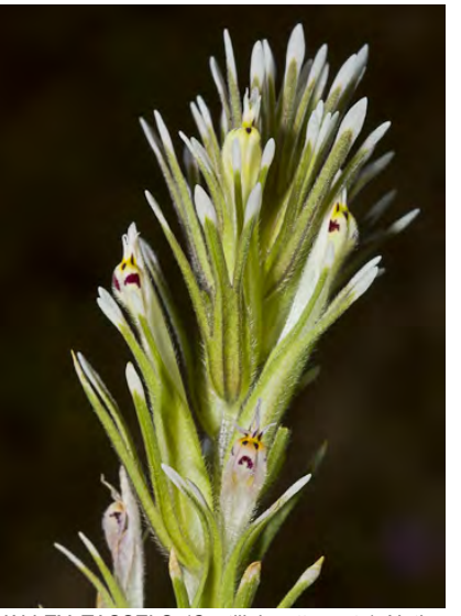
VALLEY TASSELS (Castilleja attenuata) Native Annual - Broom-rape Family - (Mar–May) -Grassland - Plant 4-20" tall, hairy, non-sticky. Leaves 0.8-3.1" long, narrow, 0-3 lobes. Flower cluster 1-12" long, narrow, tips white or pale yellow.