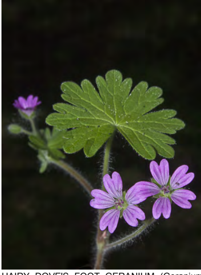
HAIRY DOVE'S FOOT GERANIUM (Geranium molle) Naturalized Annual - Geranium Family -(Feb-Aug) - Open to shaded sites, disturbed ground - Stem 4-17" tall. Petals red-purple, 0.1-0.4" long, notched. Sepals awnless. Fruit smooth, wrinkled.