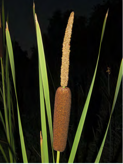
NARROW-LEAVED CATTAIL (Typha angustifolia) Native Perennial - Cattail Family - (May–Aug) - Nutrient-rich freshwater to brackish marshes, wet disturbed places - Plant 4.9-9.8' tall. Leaves gen < 0.4" wide. Flower cluster gap > 0.4".