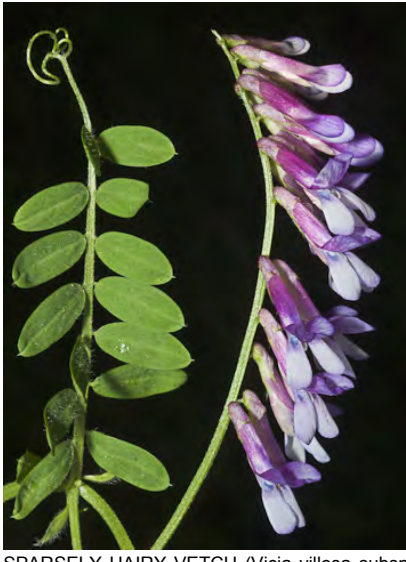
SPARSELY HAIRY VETCH (Vicia villosa subsp. varia) Naturalized Annual-Biennial - Pea Family - (Mar–Jun) - Grassland, roadside, disturbed areas - Stems W/few hairs. Flowers 10-20, blue-purple to white, 0.4-0.55" long. Lower bract lobes 0.04-0.1" long.