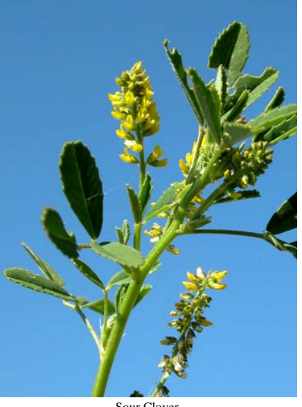
Sour Clover Melilotus indica Introduced Annual-Biennial Pea Family