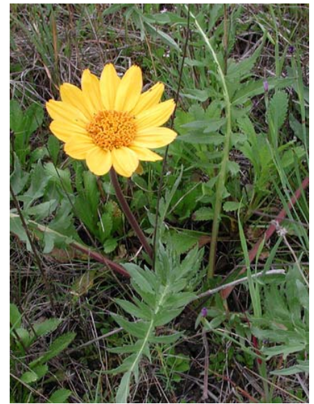
Bigscale Balsamroot Balsamorhiza macrolepis var. macrolepis Native Perennial Sunflower Family