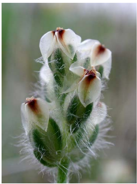
California Dwarf Plantain Plantago erecta Native Annual Plantain Family