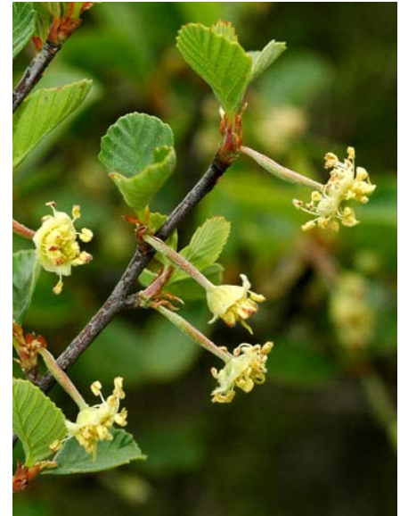
Birch-leaf Mt. Mahogany Cercocarpus betuloides var. betuloides Native Perennial Rose Family