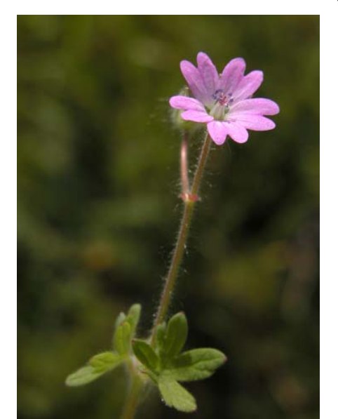
Hairy Dove's Foot Geranium Geranium molle Introduced Annual Geranium Family