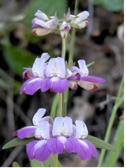
Chinese Houses Collinsia heterophylla Native Annual Snapdragon Family