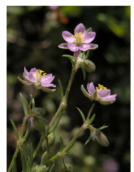
Ruby Sand Spurry Spergularia rubra Introduced Annual-Perennial Pink Family