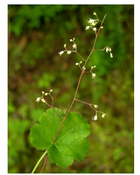
Small-flower Alumroot Heuchera micrantha Native Perennial Saxifrage Family