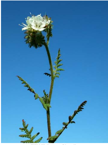
Wild Heliotrope Phacelia Phacelia distans Native Annual Waterleaf Family