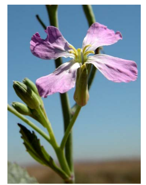
Wild Radish Raphanus sativus Introduced Annual Mustard Family