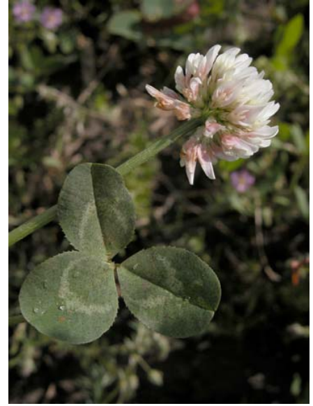
White Clover Trifolium repens Introduced Perennial Pea Family