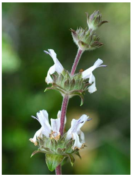
Black Sage Salvia mellifera Native Perennial Mint Family