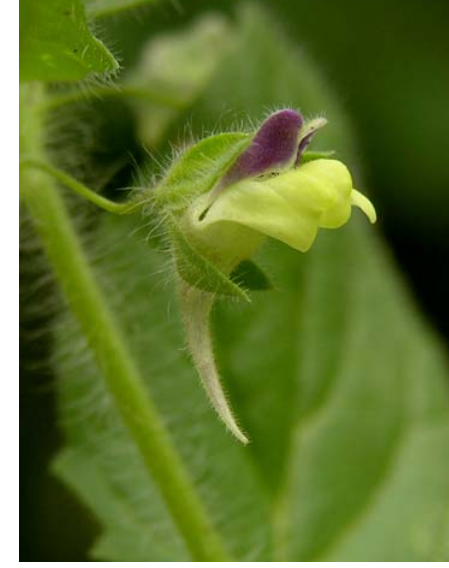
Sharp Point Fluvellin Kickxia elatine Introduced Annual Snapdragon Family