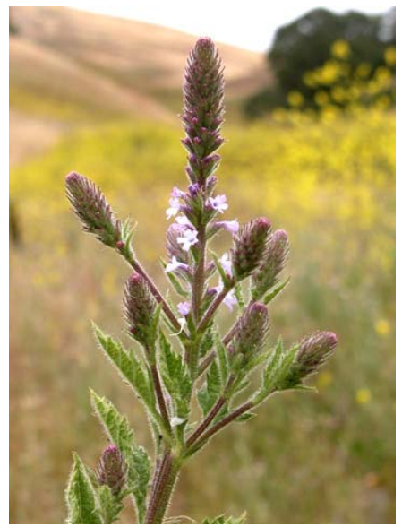
Robust Vervain Verbena lasiostachys var. scabrida Native Perennial Vervain Family