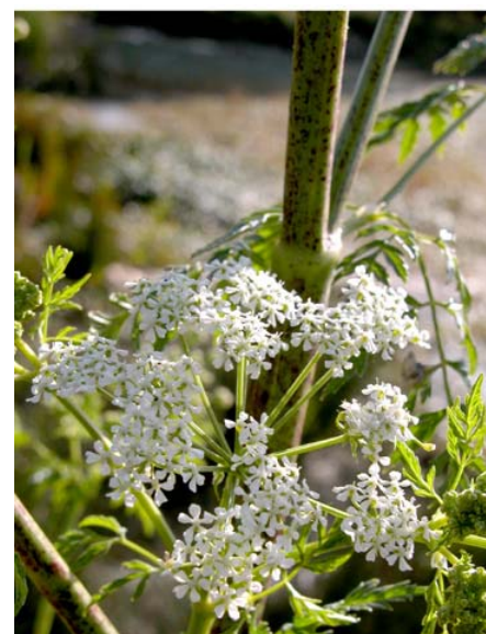
Poison Hemlock Conium maculatum Introduced Biennial Carrot Family