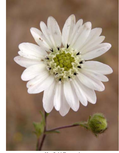
Hayfield Tarweed Hemizonia congesta ssp. luzulaefolia Native Perennial Sunflower Family