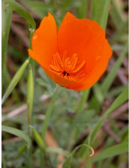
California Poppy Eschscholzia californica Native Perennial Poppy Family