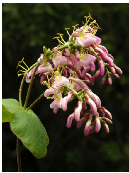
Hairy Vine Honeysuckle Lonicera hispidula var. vacillans Native Perennial Honeysuckle Family