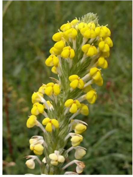
Yellow Johnny-tuck Triphysaria eriantha ssp. eriantha Native Annual Snapdragon Family