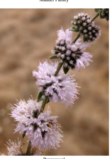
Pennyroyal Mentha pulegium Introduced Perennial Mint Family