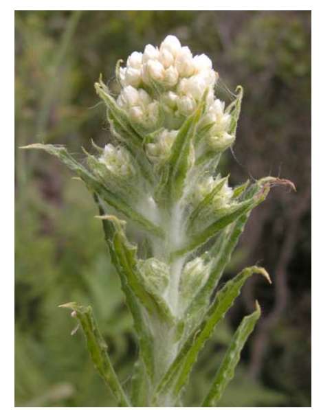
California Everlasting Gnaphalium californicum Native Biennial Sunflower Family