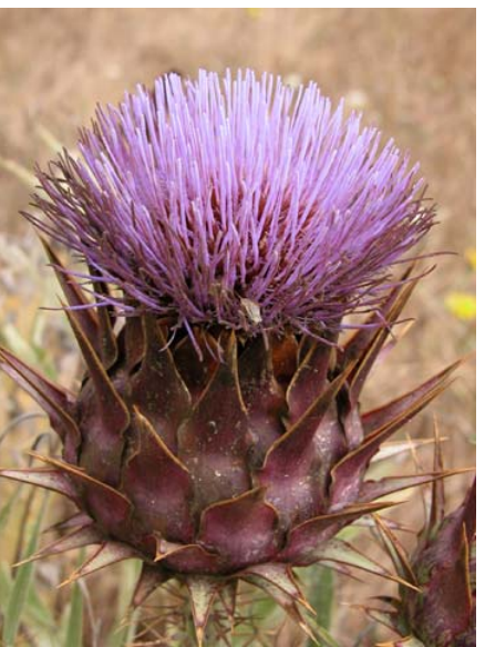
Cardoon / Artichoke Thistle Cynara cardunculus Introduced Perennial Sunflower Family