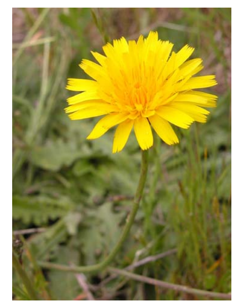
Rough Cat's-ear Hypochaeris radicata Introduced Perennial Sunflower Family