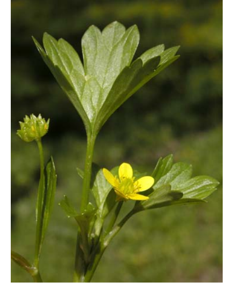
Prickleseed Buttercup Ranunculus muricatus Introduced Annual Buttercup Family