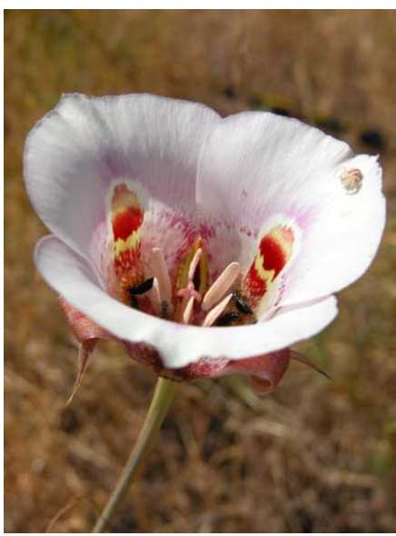
White Butterfly Mariposa Lily Calochortus venustus Native Perennial Lily Family