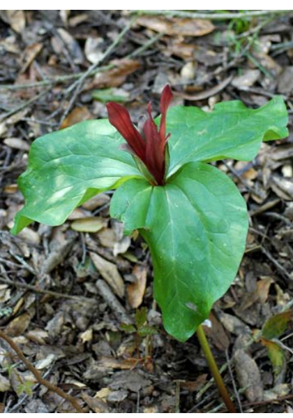
Giant Trillium Trillium chloropetalum Native Perennial Lily Family