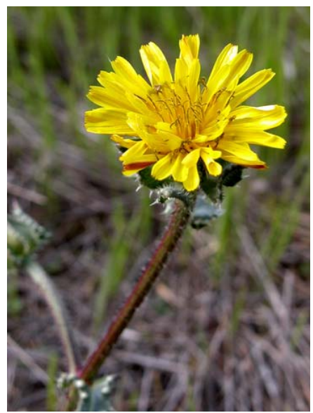
Bristly Ox-tongue Picris echioides Introduced Annual-Biennial Sunflower Family