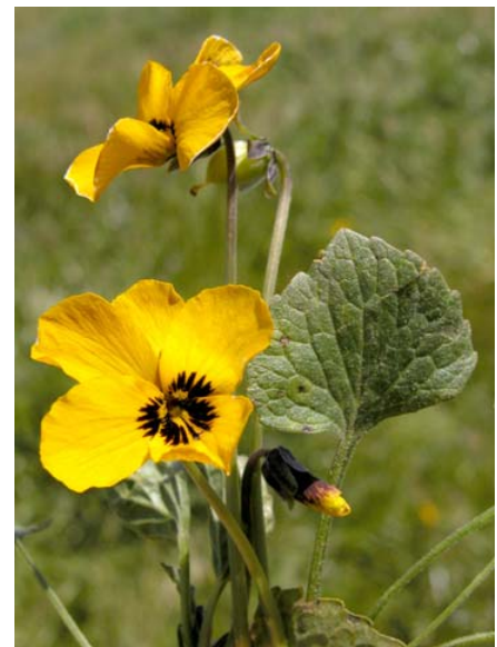
Johnny-Jump-Up / Wild Pansy Viola pedunculata Native Perennial Violet Family