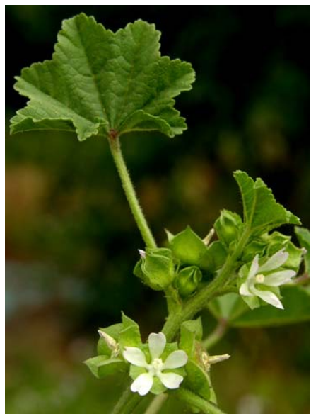
Hidden-flower Cheeseweed Malva parviflora Introduced Annual Mallow Family