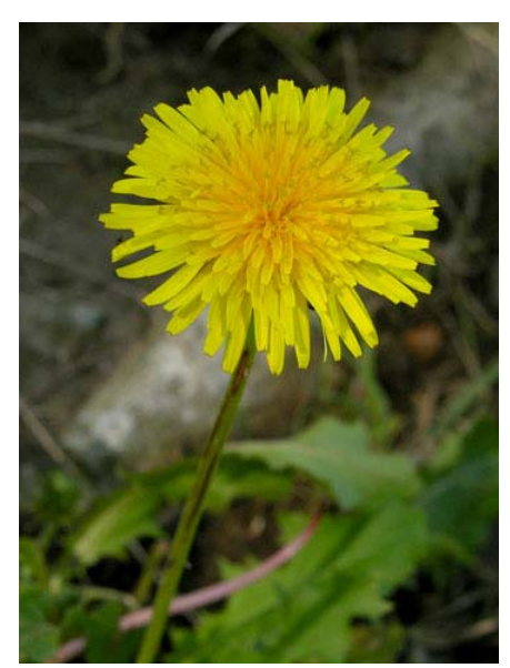
Common Dandelion Taraxacum officinale Introduced Biennial-Perennial Sunflower Family