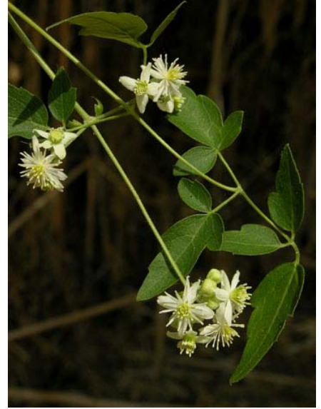
Western Virgin's Bower Clematis ligusticifolia Native Perennial Buttercup Family