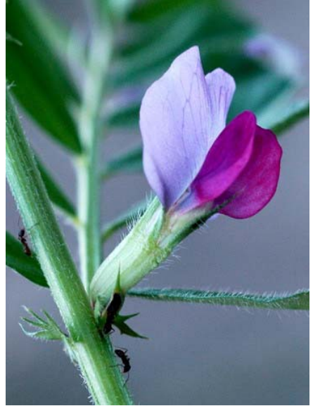
Spring Vetch Vicia sativa ssp. sativa Introduced Annual Pea Family