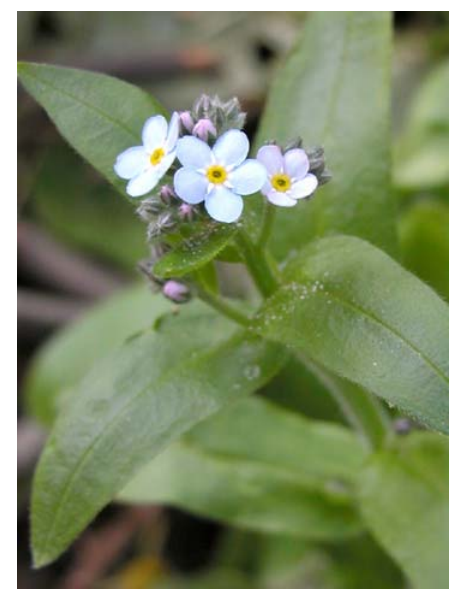
Forget-me-not Myosotis latifolia Introduced Perennial Borage Family