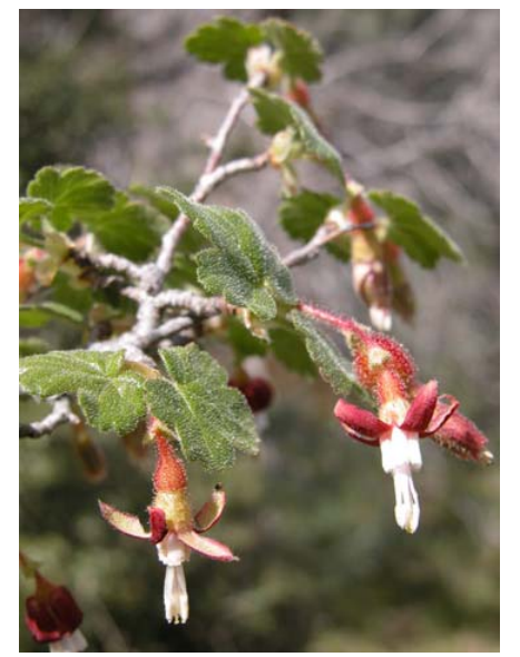
Canyon Gooseberry Ribes menziesii Native Perennial Gooseberry Family