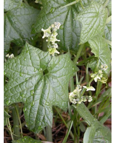
Common / California Manroot Marah fabaceus Native Perennial Gourd Family