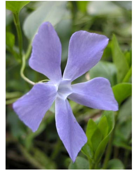
Greater Periwinkle Vinca major Introduced Perennial Dogbane Family