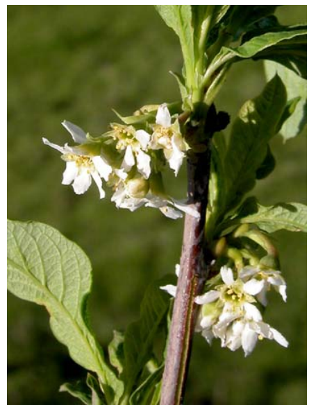
Oso Berry Oemleria cerasiformis Native Perennial Rose Family