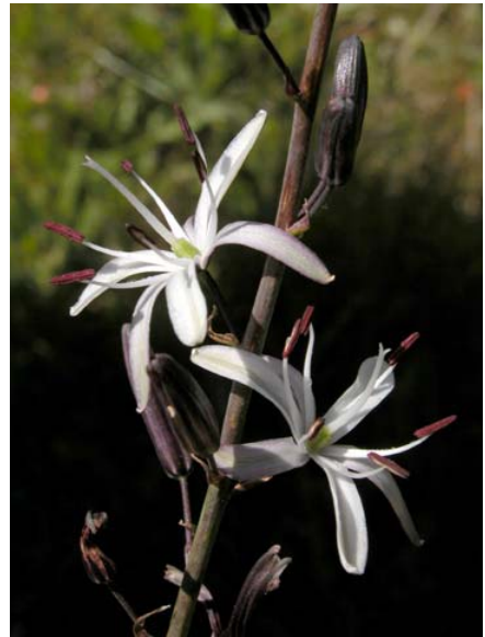
Common Soap Plant Chlorogalum pomeridianum var. pomeridianum Native Perennial Lily Family