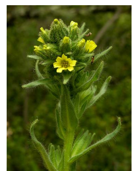
Common / Coast Tarweed Madia sativa Native Annual Sunflower Family