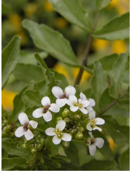
White Water Cress *Rorippa nasturtium-aquaticum Native Perennial Mustard Family