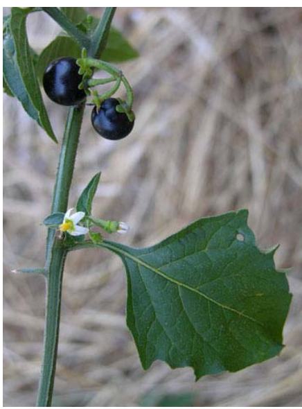
Small-flower Nightshade Solanum americanum Native Annual-Perennial Nightshade Family