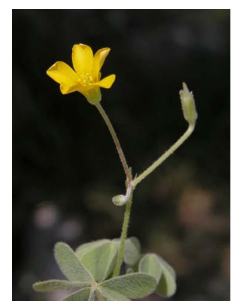
Creeping Wood Sorrel Oxalis corniculata Introduced Perennial Oxalis Family