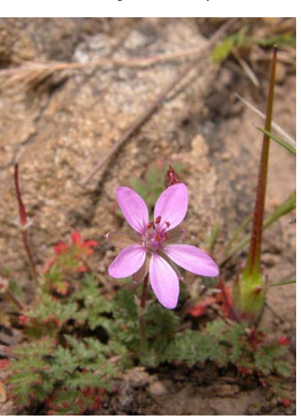
Red-stem Filaree Erodium cicutarium Introduced Annual Geranium Family