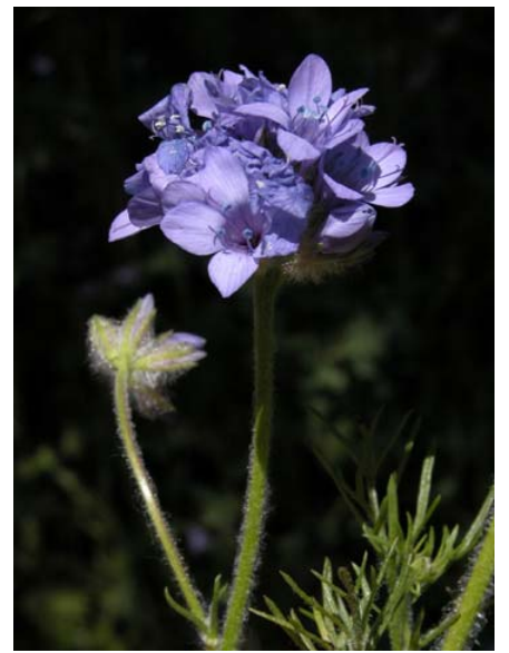
California Blue Gilia Gilia achilleifolia ssp. achilleifolia Native Annual Phlox Family