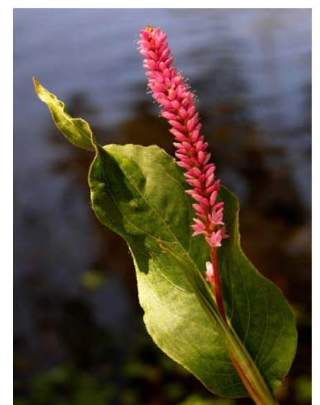
Swamp / Water Knotweed Polygonum amphibium var. emersum Native Perennial Buckwheat Family