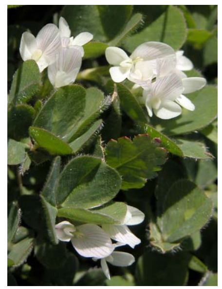
Subterranean Clover Trifolium subterraneum Introduced Annual Pea Family