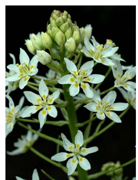
Common Star Lily Zigadenus fremontii Native Perennial Lily Family