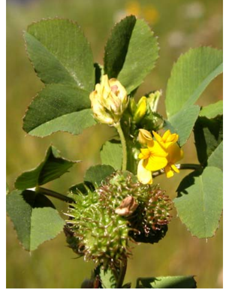
California Bur Clover Medicago polymorpha Introduced Annual Pea Family