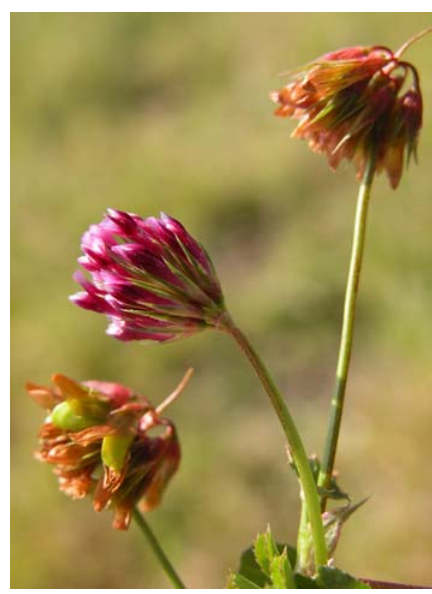
Pinpoint Clover Trifolium gracilentum var. gracilentum Native Annual Pea Family