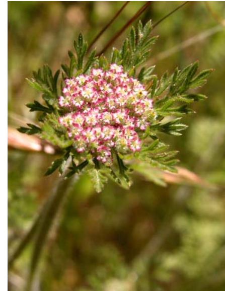
Rattlesnake Weed Daucus pusillus Native Annual Carrot Family