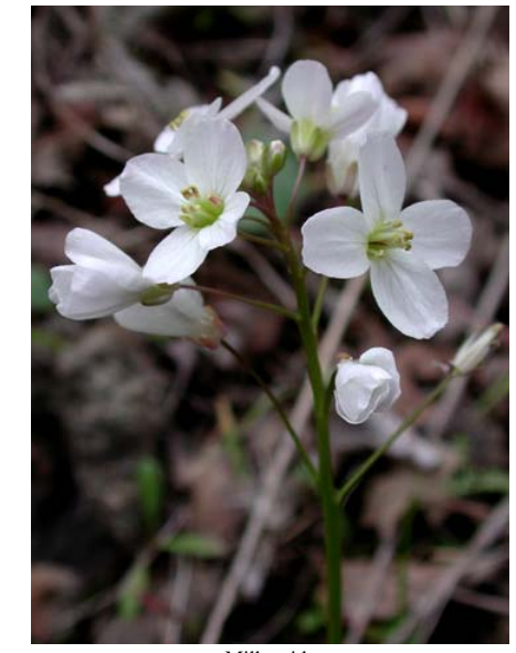
Milkmaids Cardamine californica Native Perennial Mustard Family