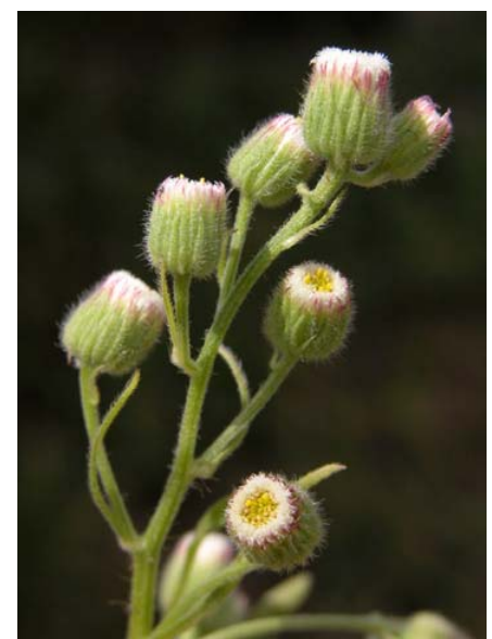
South American Horseweed Conyza bonariensis Introduced Annual Sunflower Family