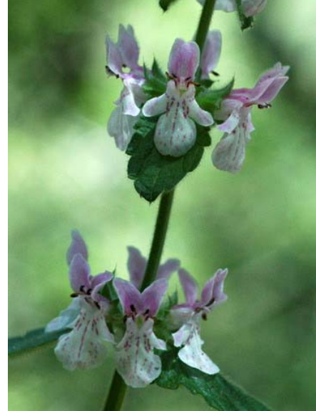
Common Rigid Hedge Nettle Stachys ajugoides var. rigida Native Perennial Mint Family