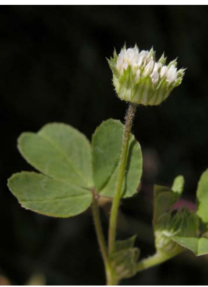
Thimble Clover Trifolium microdon Native Annual Pea Family