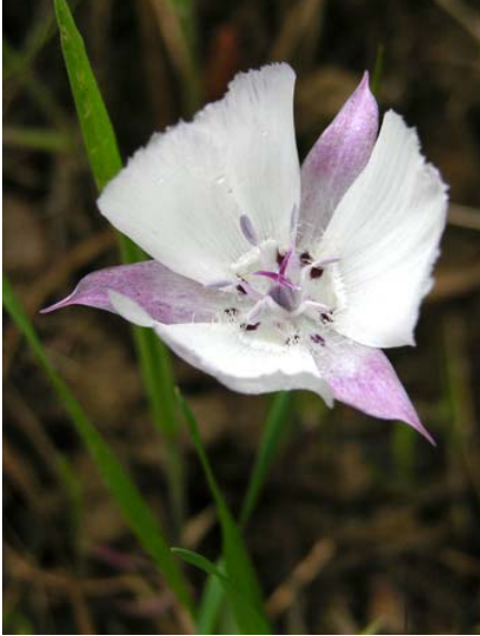
Oakland Star Tulip Calochortus umbellatus Native Perennial Lily Family