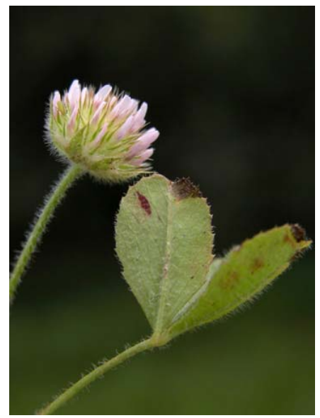
Small-head Clover Trifolium microcephalum Native Annual Pea Family