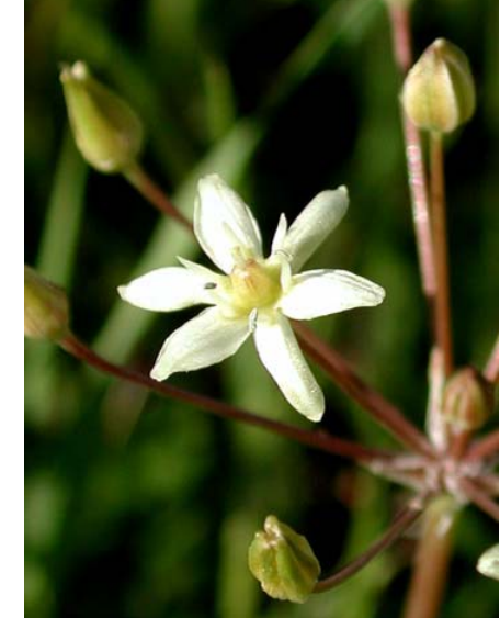
Common Muilla Muilla maritima Native Perennial Lily Family