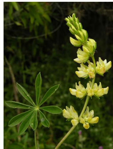
Gully Lupine Lupinus microcarpus var. densiflorus Native Annual Pea Family