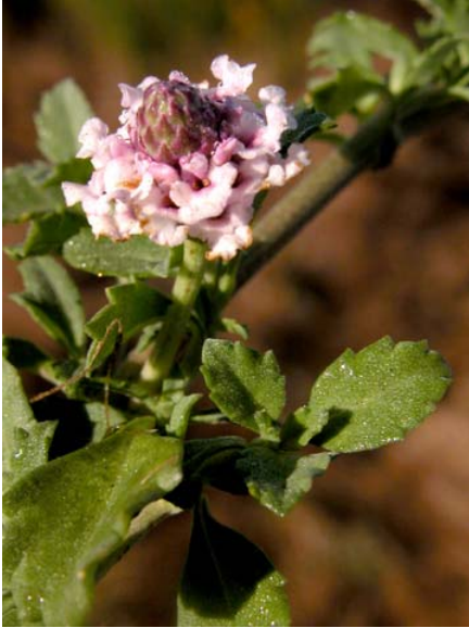
Lemon Verbena Phyla nodiflora var. nodiflora Native Perennial Vervain Family