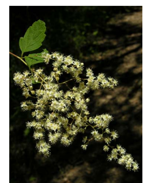
Creambush / Ocean Spray Holodiscus discolor Native Perennial Rose Family