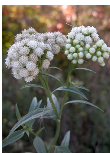
Douglas/Salt Marsh Baccharis Baccharis douglasii Native Perennial Sunflower Family