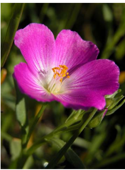
Magenta Red Maids Calandrinia ciliata Native Annual Purslane Family