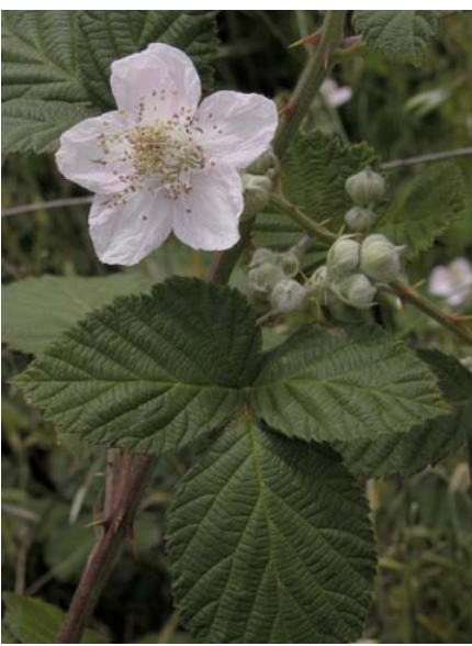
Himalayan Blackberry Rubus discolor Introduced Perennial Rose Family