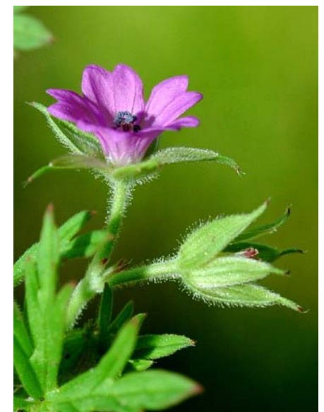
Purpletip Cut-leaf Geranium Geranium dissectum Introduced Annual Geranium Family