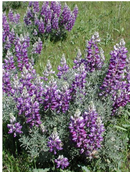
Blue Bush / Silver Lupine Lupinus albifrons var. albifrons Native Perennial Pea Family