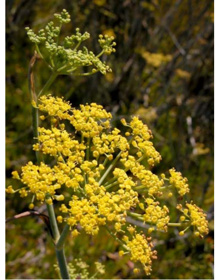
Sweet Fennel Foeniculum vulgare Introduced Perennial Carrot Family