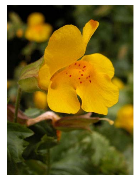
Golden Monkey Flower Minulus guttatus Native Perennial Snapdragon Family