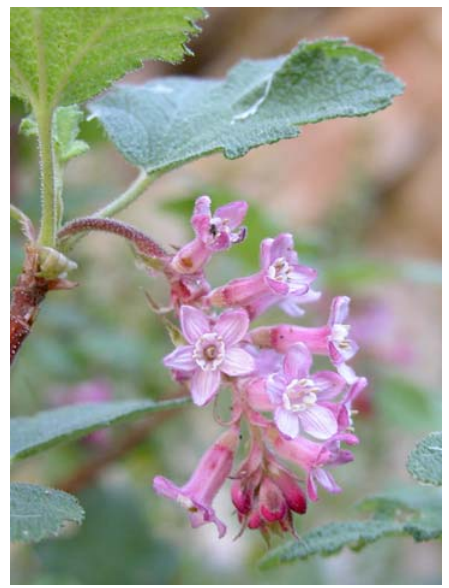
Chaparral Currant Ribes malvaceum var. malvaceum Native Perennial Gooseberry Family