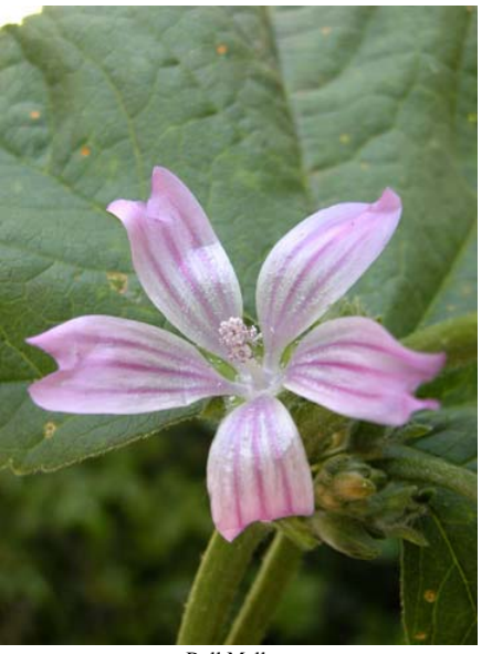
Bull Mallow Malva nicaeensis Introduced Annual Mallow Family