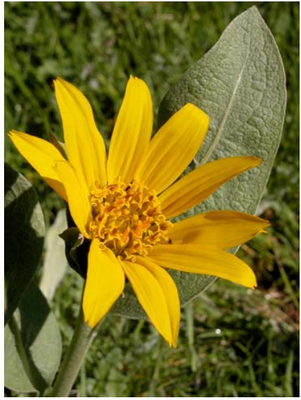
Gray Mule's Ear Wyethia helenioides Native Perennial Sunflower Family