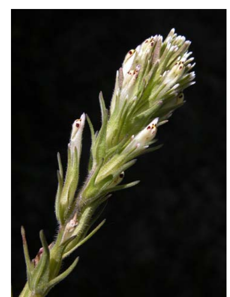
Valley Tassels Castilleja attenuata Native Annual Snapdragon Family