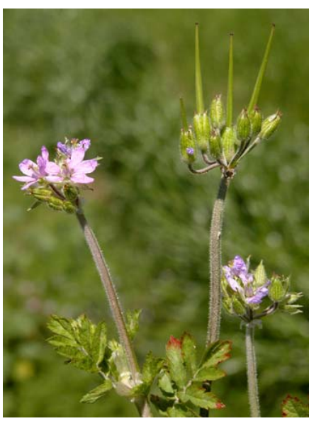
White-stem Filaree Erodium moschatum Introduced Annual Geranium Family