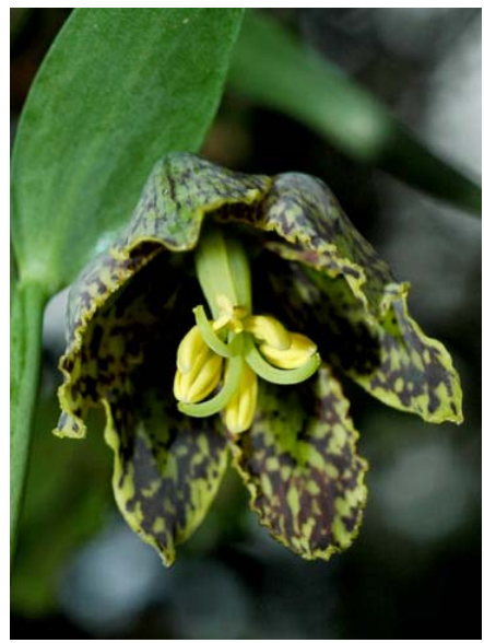
Checker Lily Fritillaria affinis var. affinis Native Perennial Lily Family