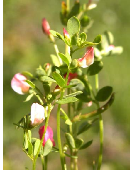
Spanish Clover Lotus purshianus var. purshianus Native Annual Pea Family