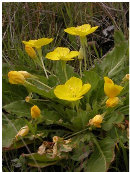
Golden Eggs Suncup Camissonia ovata Native Perennial Evening Primrose Family