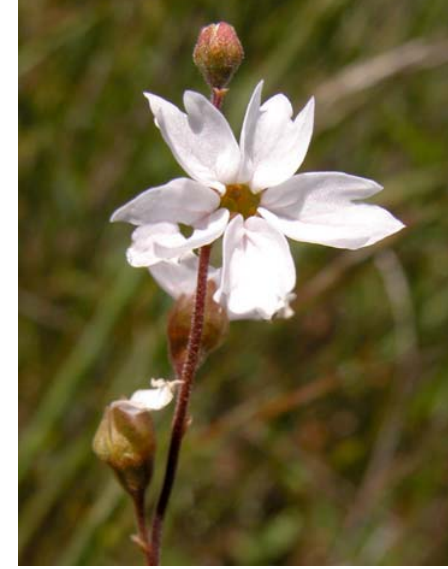
Woodland Star Lithophragma affine Native Perennial Saxifrage Family