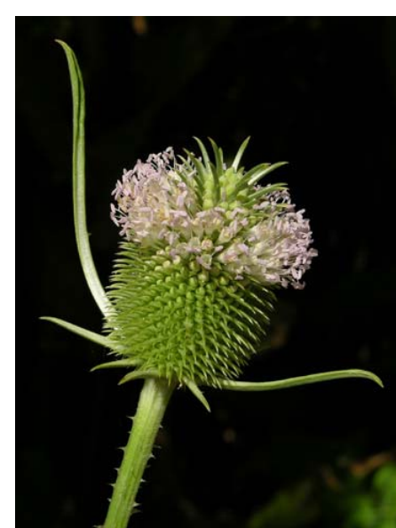
Wild Teasel Dipsacus sativus Introduced Biennial Teasel Family