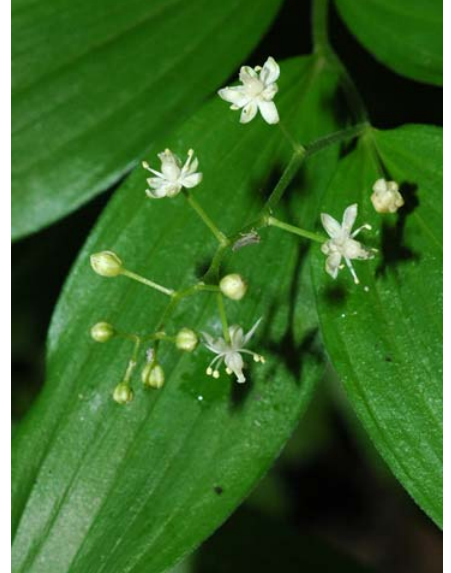
Starry False Solomon's Seal Smilacina stellata Native Perennial Lily Family