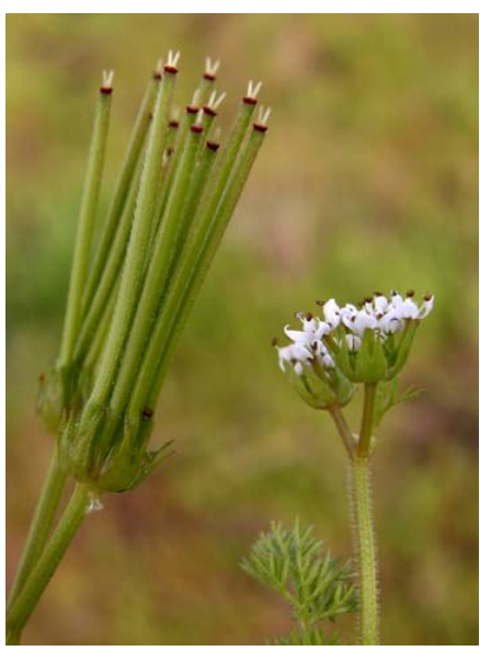
Shepherd's Needle Scandix pecten-veneris Introduced Annual Carrot Family