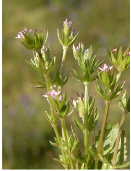
Blue Field Madder Sherardia arvensis Introduced Annual Madder Family