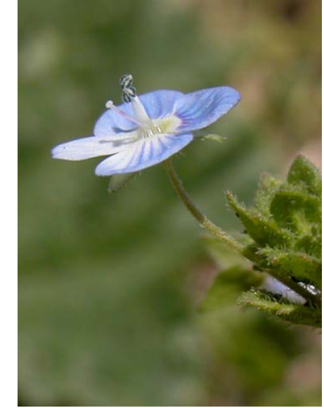
Persian Speedwell Veronica persica Introduced Annual Snapdragon Family