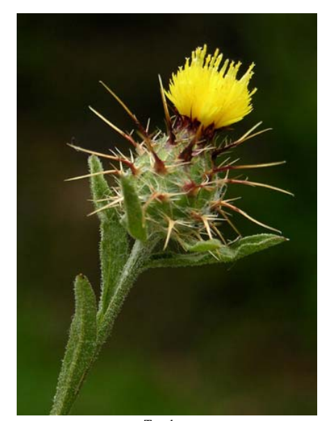
Tocalote Centaurea melitensis Introduced Annual