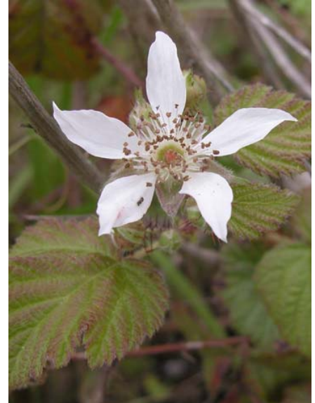
Native California Blackberry Rubus ursinus Native Perennial Rose Family