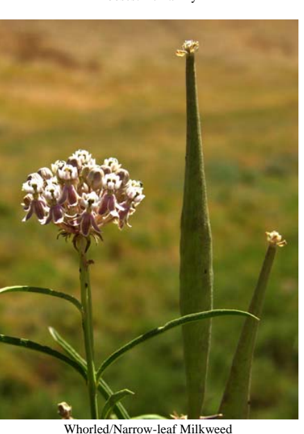
Whorled/Narrow-leaf Milkweed Asclepias fascicularis Native Perennial Milkweed Family