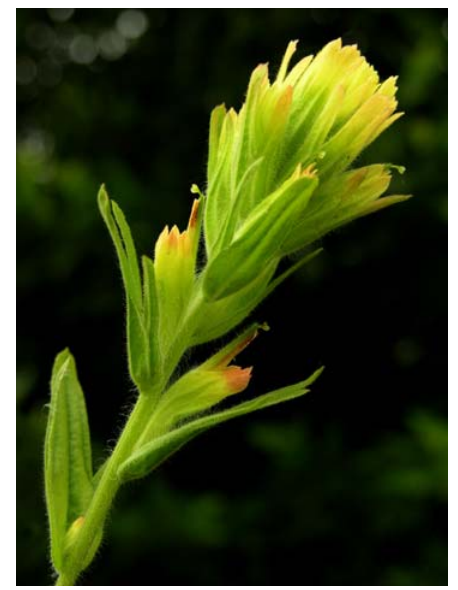
Seaside / Coastal Paintbrush Castilleja wightii Native Perennial Snapdragon Family