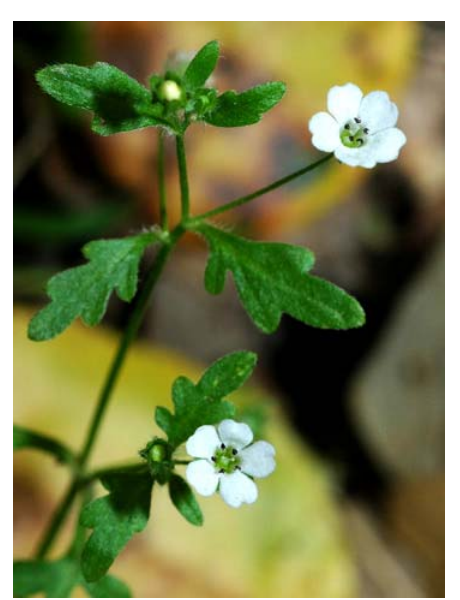
Variable-leaf Nemophila Nemophila heterophylla Native Annual Waterleaf Family