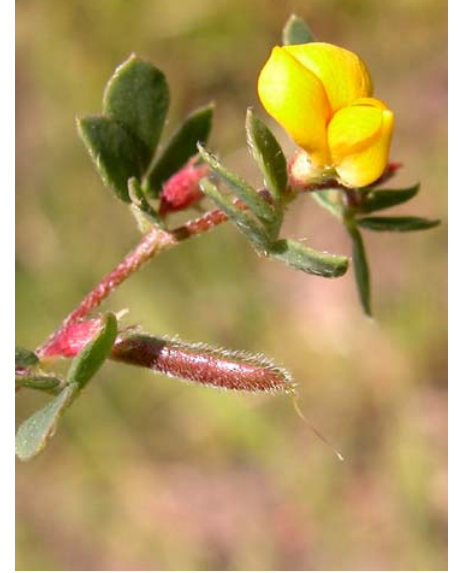
California Lotus Lotus wrangelianus Native Annual Pea Family