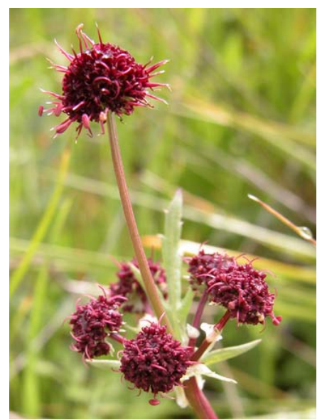
Purple Sanicle Sanicula bipinnatifida Native Perennial Carrot Family