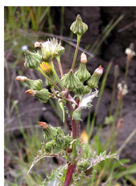
Prickly Sow Thistle Sonchus asper ssp. asper Introduced Annual Sunflower Family