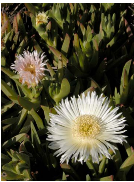
Yellow Hottentot Fig Carpobrotus edulis Introduced Perennial Fig-Marigold Family