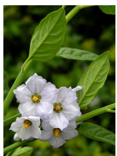
Blue Witch Solanum umbelliferum Native Perennial Nightshade Family