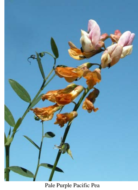
Lathyrus vestitus var. vestitus Native Perennial Pea Family