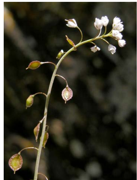
Hairy Fringepod Thysanocarpus curvipes Native Annual Mustard Family