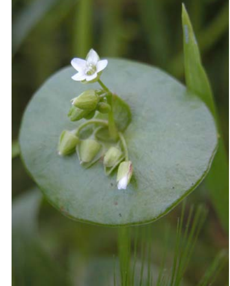
Common Miner's Lettuce Claytonia perfoliata ssp. perfoliata Native Annual Purslane Family