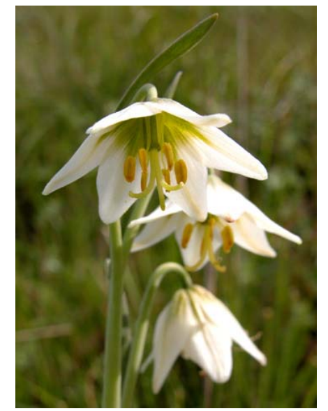
Fragrant White Fritillary Fritillaria liliacea Native Perennial Lily Family