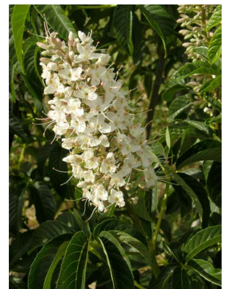
California Buckeye Aesculus californica Native Perennial Buckeye Family