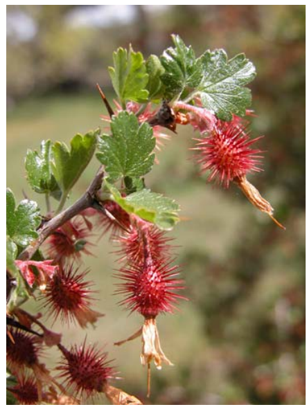
Hillside Gooseberry Ribes californicum var. californicum Native Perennial Gooseberry Family