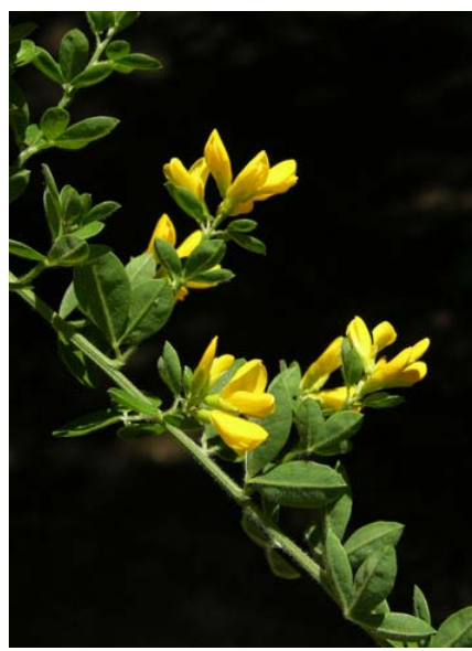
French Broom Genista monspessulana Introduced Perennial Pea Family