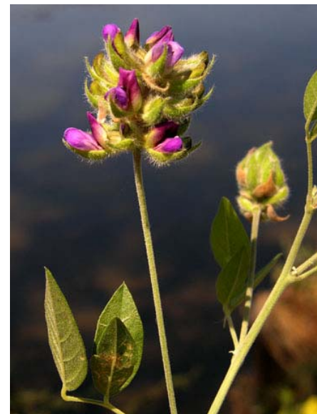
California Tea Rupertia physodes Native Perennial Pea Family