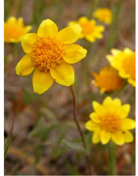
Goldfields Lasthenia californica Native Annual Sunflower Family