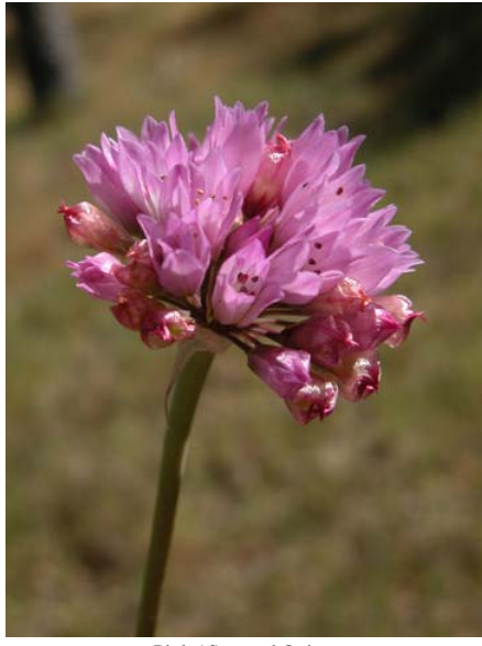
Pink / Serrated Onion Allium serra Native Perennial Lily Family