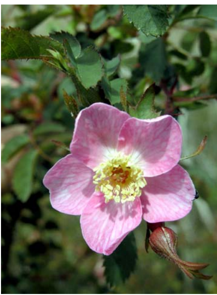
California Wild Rose Rosa californica Native Perennial Rose Family