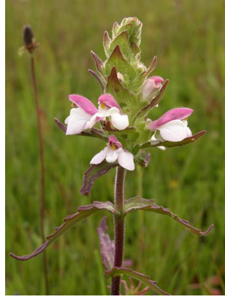
Bellardia Bellardia trixago Introduced Annual Snapdragon Family