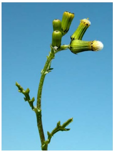
Common Groundsel Senecio vulgaris Introduced Annual Sunflower Family