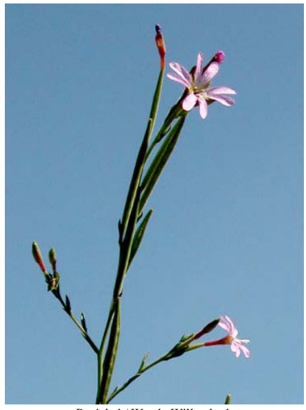
Panicled / Weedy Willowherb Epilobium brachycarpum Native Annual Evening Primrose Family