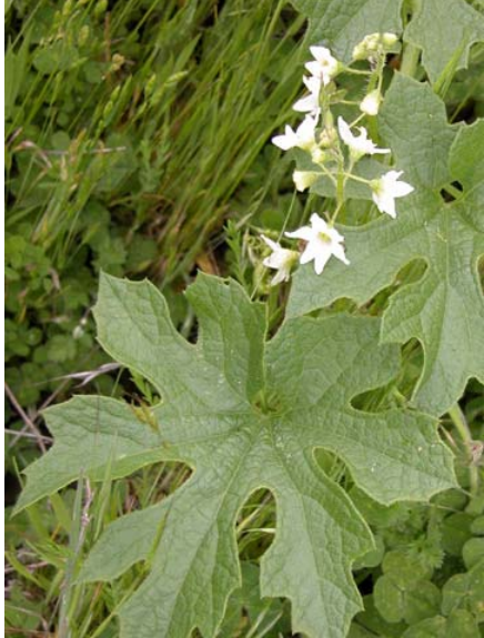
Oregon / Coast Manroot Marah oreganus Native Perennial Gourd Family