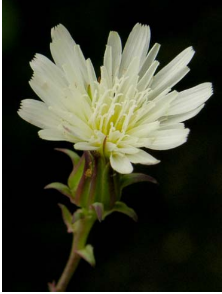
California White Chicory Rafinesquia californica Native Annual Sunflower Family