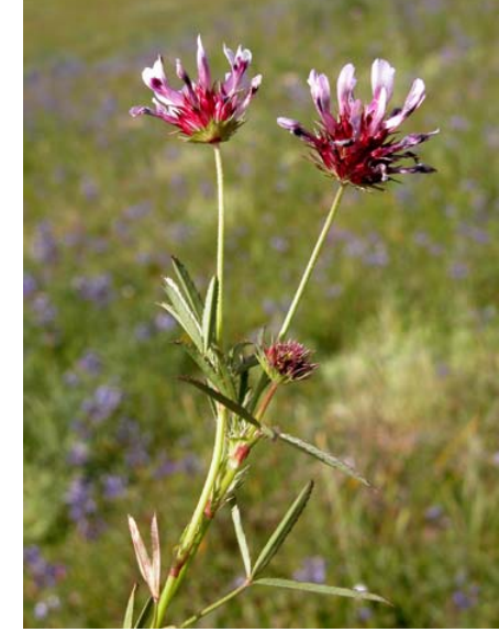
Tomcat Clover Trifolium willdenovii Native Annual Pea Family