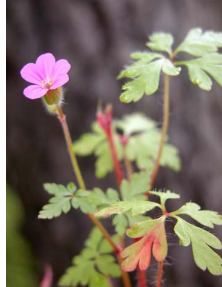
Herb Robert Geranium robertianum Introduced Annual-Biennial Geranium Family