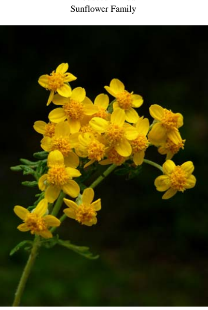
Golden Yarrow Eriophyllum confertiflorum var. confertiflorum Native Perennial Sunflower Family