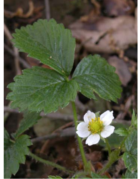
Woodland Strawberry Fragaria vesca Native Perennial Rose Family