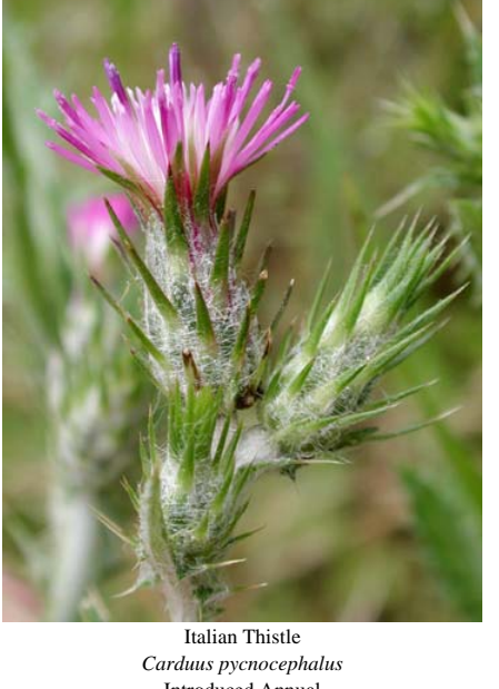
Introduced Annual Sunflower Family