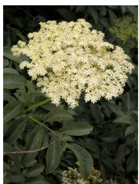
Blue Elderberry Sambucus mexicana Native Perennial Honeysuckle Family