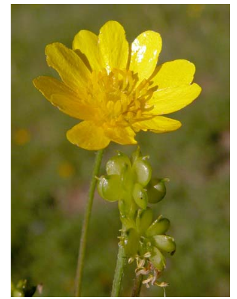
California Buttercup Ranunculus californicus Native Perennial Buttercup Family