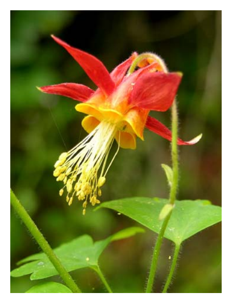
Red / Crimson Columbine Aquilegia formosa Native Perennial Buttercup Family