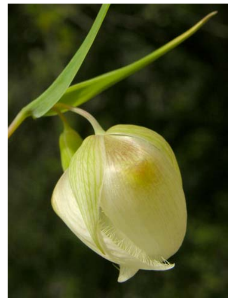
White Fairy Lantern Calochortus albus Native Perennial Lily Family