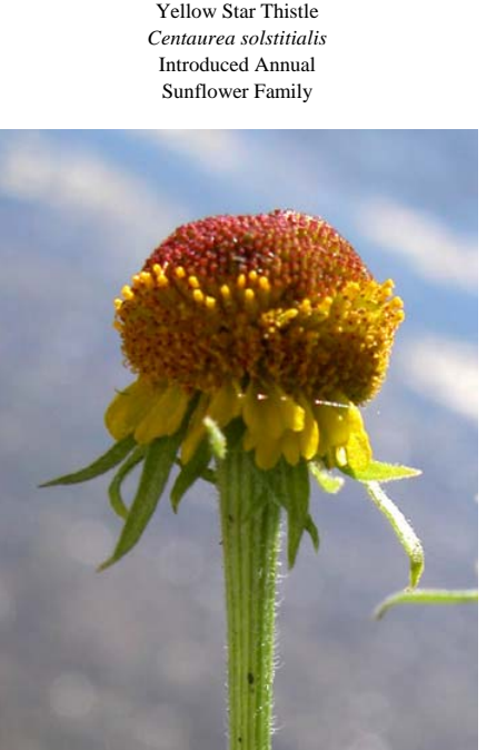
Rosilla Helenium puberulum Native Biennial Sunflower Family