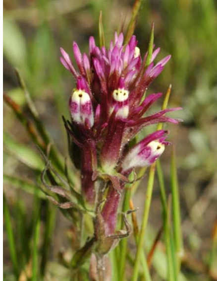
Common Owl's Clover Castilleja densiflora ssp. densiflora Native Annual Snapdragon Family