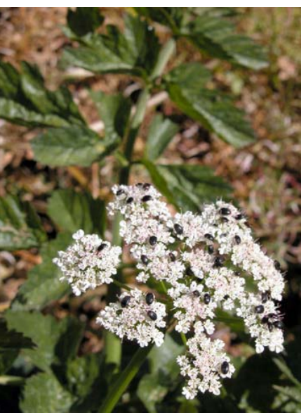
Pacific Water Parsley Oenanthe sarmentosa Native Perennial Carrot Family