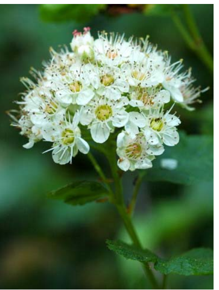
Pacific Ninebark Physocarpus capitatus Native Perennial Rose Family