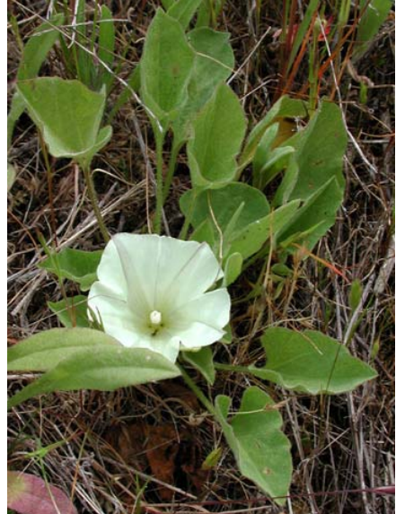
Shortstem Morning Glory Calystegia subacaulis ssp. subacaulis Native Perennial Morning-Glory Family