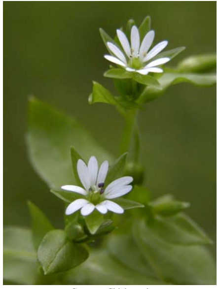
Common Chickweed Stellaria media Introduced Annual Pink Family