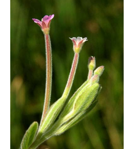
Common Willowherb Epilobium ciliatum ssp. ciliatum Native Perennial Evening Primrose Family