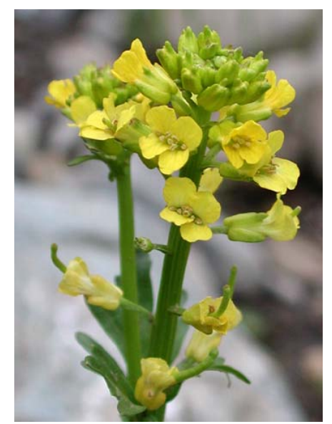
Erect-pod Winter Cress Barbarea orthoceras Native Perennial Mustard Family