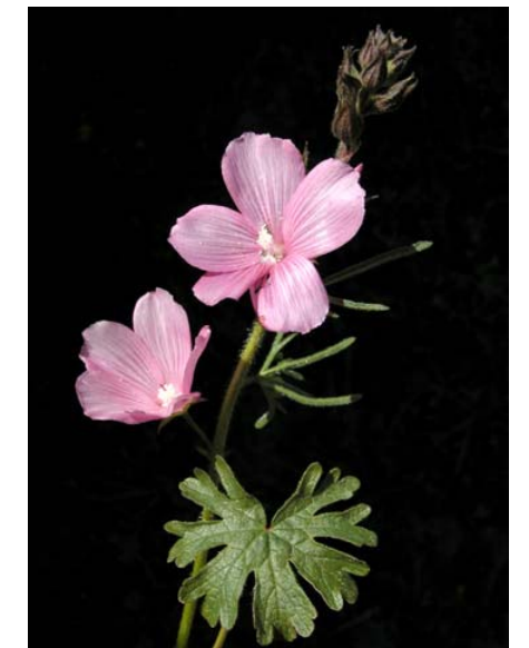
Common Checkerbloom Sidalcea malvaeflora ssp. malvaeflora Native Perennial Mallow Family