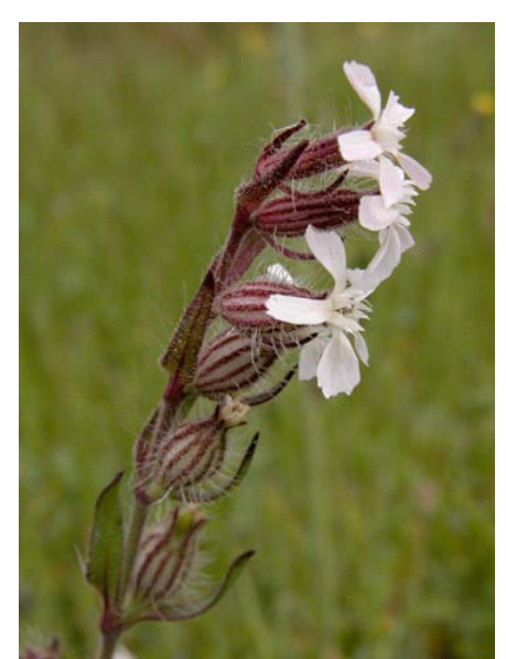
Windmill Pink Silene gallica Introduced Annual Pink Family