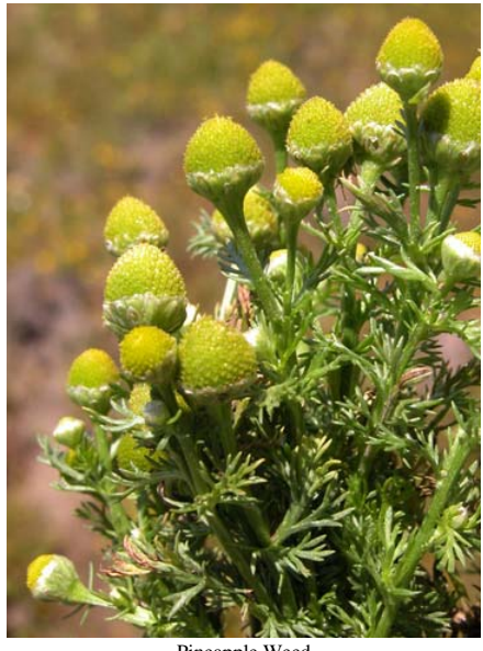
Pineapple Weed Chamomilla suaveolens Introduced Annual Sunflower Family