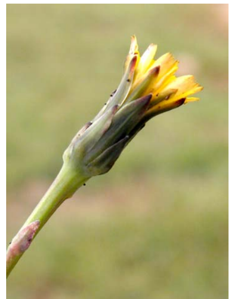
Smooth Cat's-ear Hypochaeris glabra Introduced Annual Sunflower Family