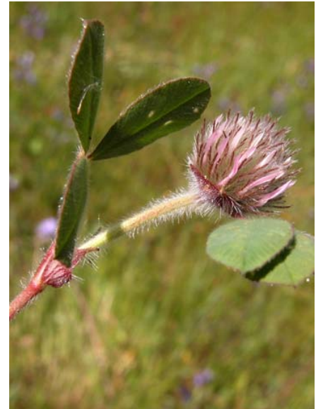
Rose Clover Trifolium hirtum Introduced Annual Pea Family