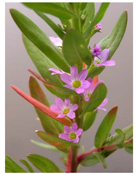
Grass Poly Loosestrife Lythrum hyssopifolium Introduced Annual-Perennial Loosestrife Family