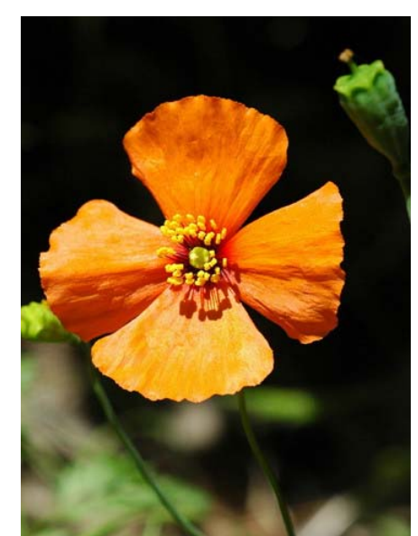
Wind Poppy Stylomecon heterophylla Native Annual Poppy Family