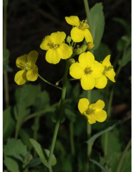
Yellow Field Mustard Brassica rapa Introduced Annual Mustard Family