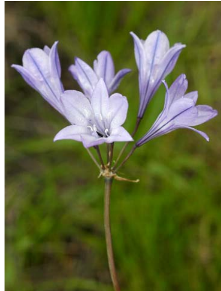
Ithuriel's Spear Triteleia laxa Native Perennial Lily Family