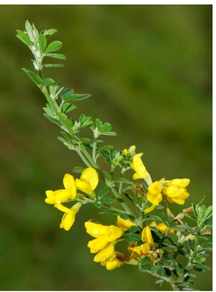
Scotch Broom Cytisus scoparius Introduced Perennial Pea Family