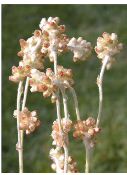
Weedy Cudweed Gnaphalium luteo-album Introduced Annual Sunflower Family