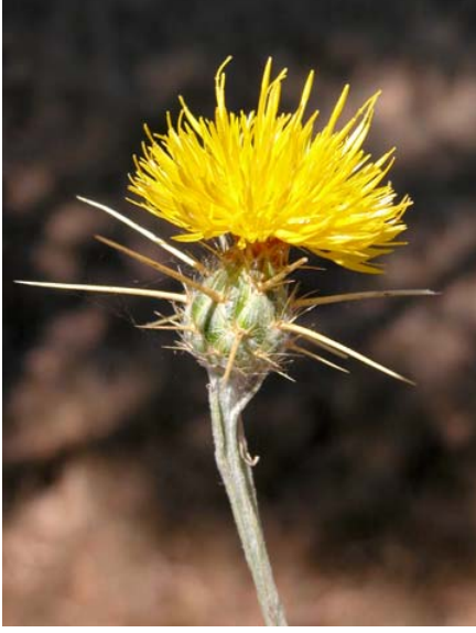
Yellow Star Thistle Introduced Annual