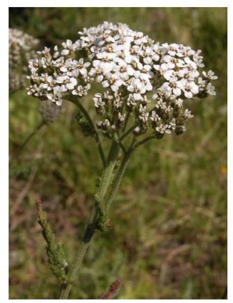
Yarrow Achillea millefolium Native Perennial Sunflower Family