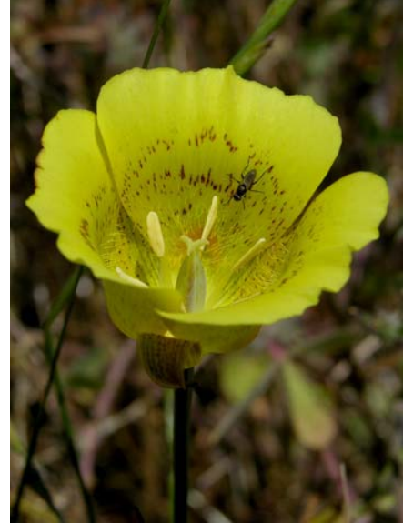
Yellow Mariposa Lily Calochortus luteus Native Perennial Lily Family