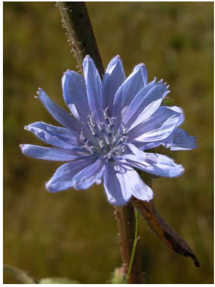
Chicory Cichorium intybus Introduced Perennial Sunflower Family