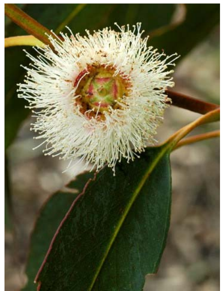
Blue Gum Eucalyptus globulus Introduced Perennial Myrtle Family