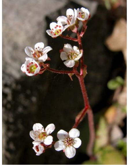
California Saxifrage Saxifraga californica Native Perennial Saxifrage Family