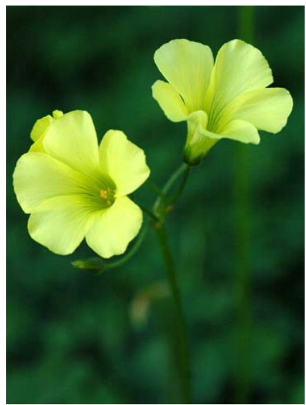
Bermuda Buttercup Oxalis pes-caprae Introduced Perennial Oxalis Family