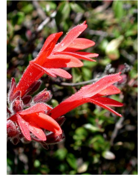
California Fuchsia Epilobium canum ssp. canum Native Perennial Evening Primrose Family