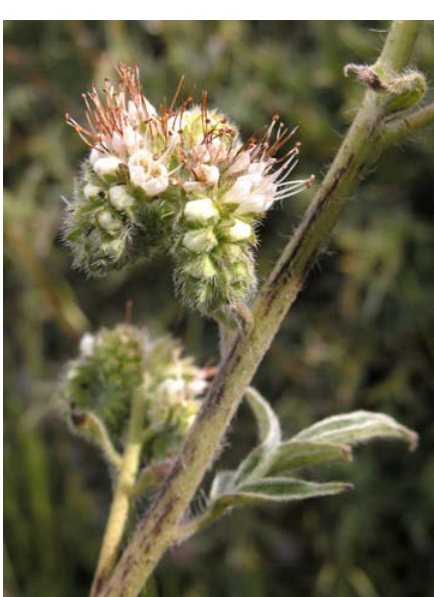
Rock Phacelia Phacelia imbricata ssp. imbricata Native Perennial Waterleaf Family