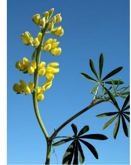
Yellow Bush Lupine Lupinus arboreus Native Perennial Pea Family