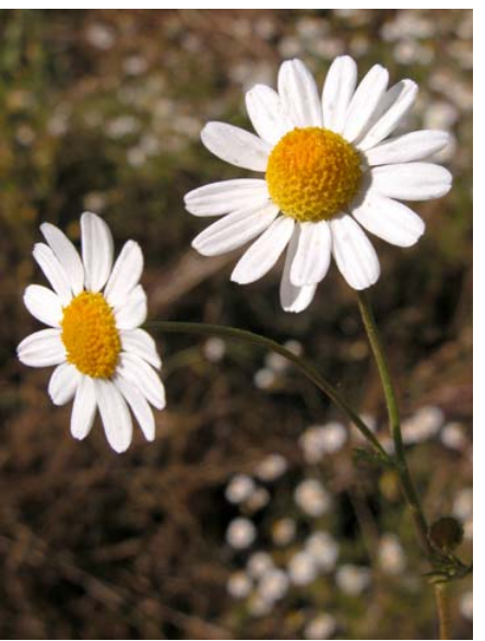
Mayweed Anthemis cotula Introduced Annual Sunflower Family