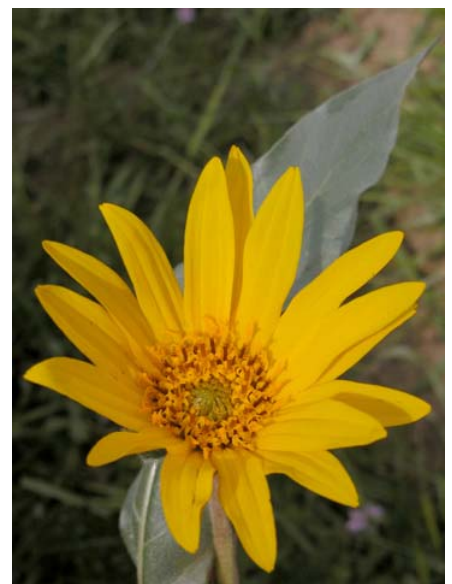
Narrow-leaf Mule's Ear Wyethia angustifolia Native Perennial Sunflower Family