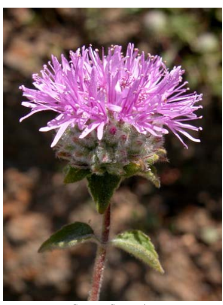
Common Coyotemint Monardella villosa ssp. villosa Native Perennial Mint Family