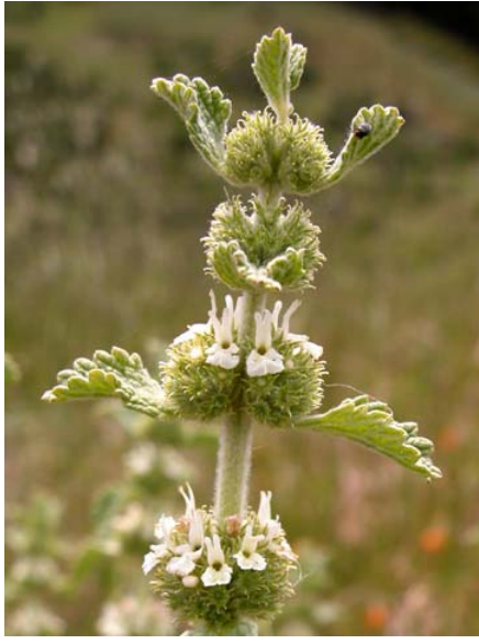
Common Horehound Marrubium vulgare Introduced Perennial Mint Family