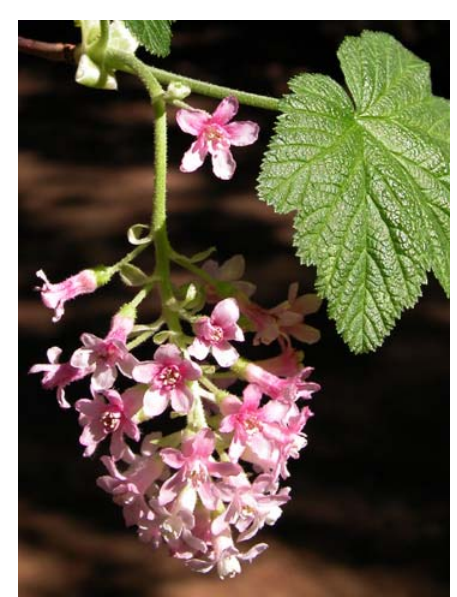
Flowering/Pinkflower Currant Ribes sanguineum var. glutinosum Native Perennial Gooseberry Family