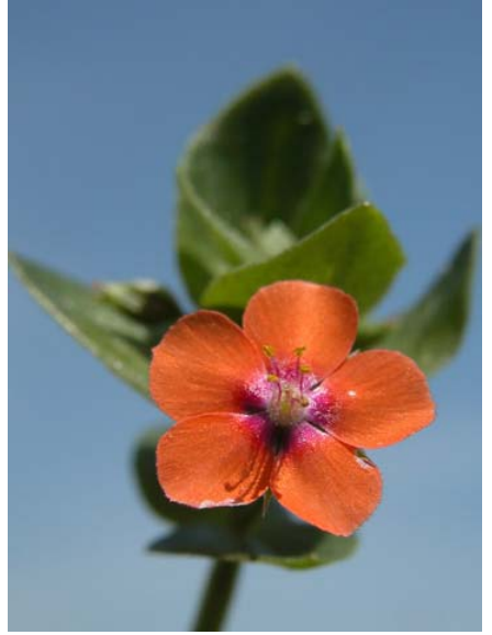
Scarlet Pimpernel Anagallis arvensis Introduced Annual Primrose Family