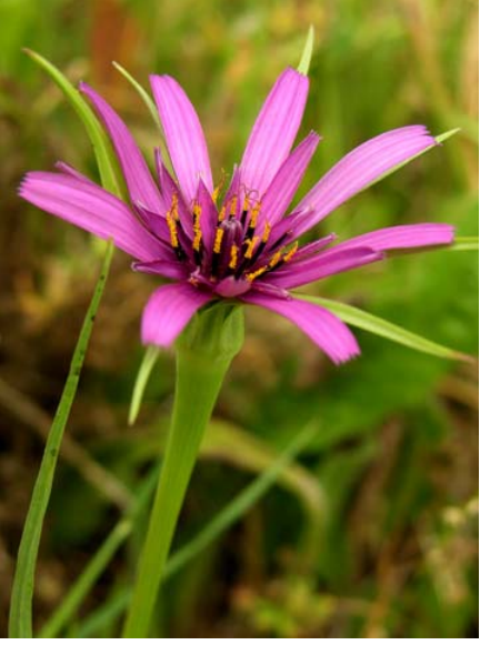
Purple Salsify Tragopogon porrifolius Introduced Biennial-Perennial Sunflower Family