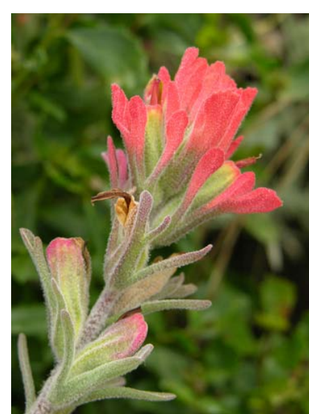
Woolly Paintbrush Castilleja foliolosa Native Perennial Snapdragon Family