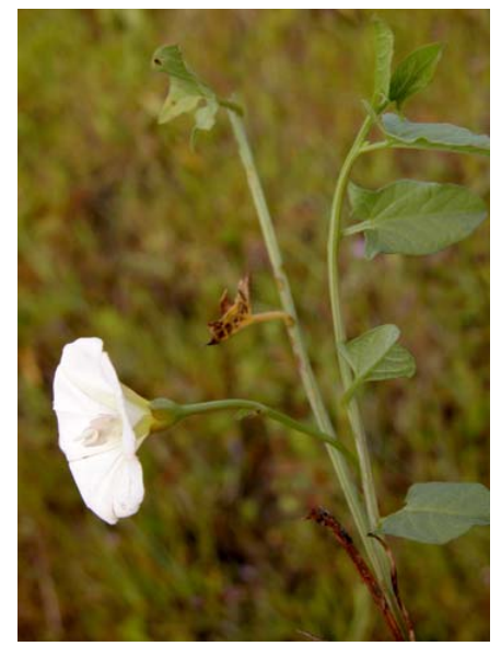
Field Bindweed Convolvulus arvensis Introduced Perennial Morning-Glory Family