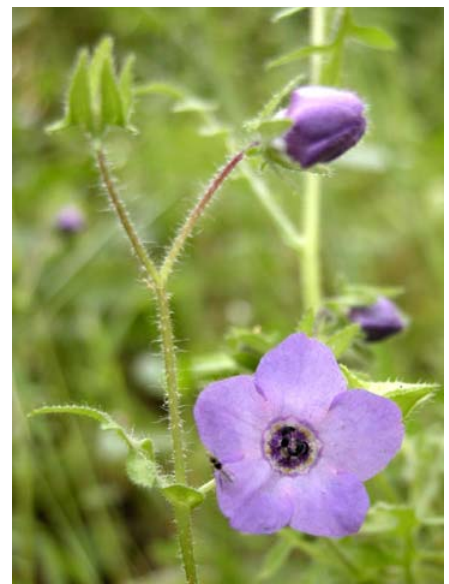
Blue Fiesta Flower Pholistoma auritum var. auritum Native Annual Waterleaf Family