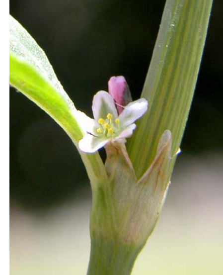
Common Yard Knotweed Polygonum arenastrum Introduced Annual Buckwheat Family