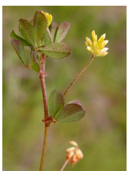
Shamrock Clover Trifolium dubium Introduced Annual Pea Family