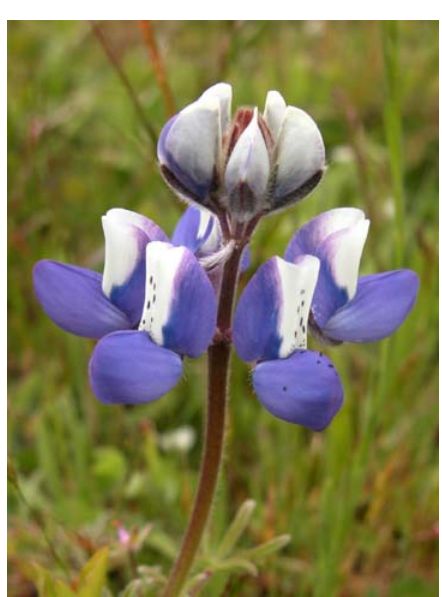
Douglas Sky Lupine Lupinus nanus Native Annual Pea Family