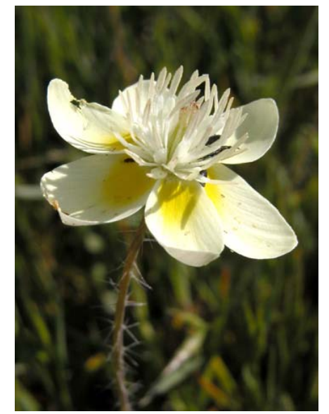
Cream Cups Platystemon californicus Native Annual Poppy Family