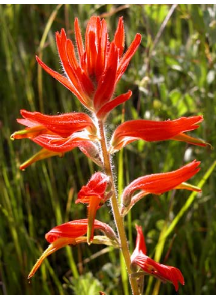
Common Indian Paintbrush Castilleja affinis ssp. affinis Native Perennial Snapdragon Family