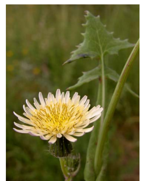
Common Sow Thistle Sonchus oleraceus Introduced Annual Sunflower Family