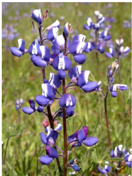
Miniature Dove Lupine Lupinus bicolor Native Annual Pea Family