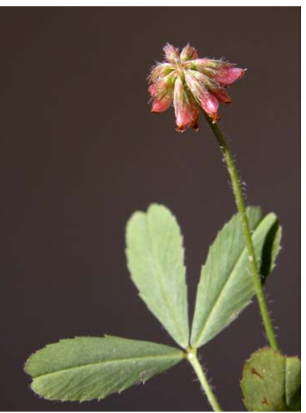
Tree Clover Trifolium ciliolatum Native Annual Pea Family