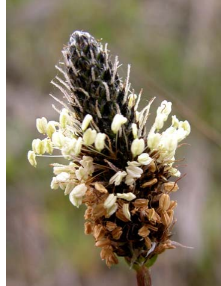
English Plantain Plantago lanceolata Introduced Annual Plantain Family