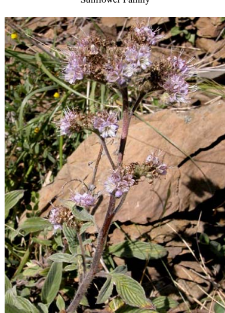
California / Rock Phacelia Phacelia californica Native Perennial Waterleaf Family