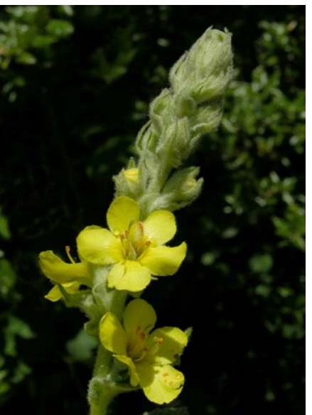
Common Woolly Mullein Verbascum thapsus Introduced Biennial Snapdragon Family