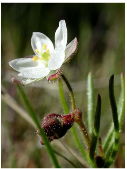
Stickwort Spergula arvensis ssp. arvensis Introduced Annual Pink Family