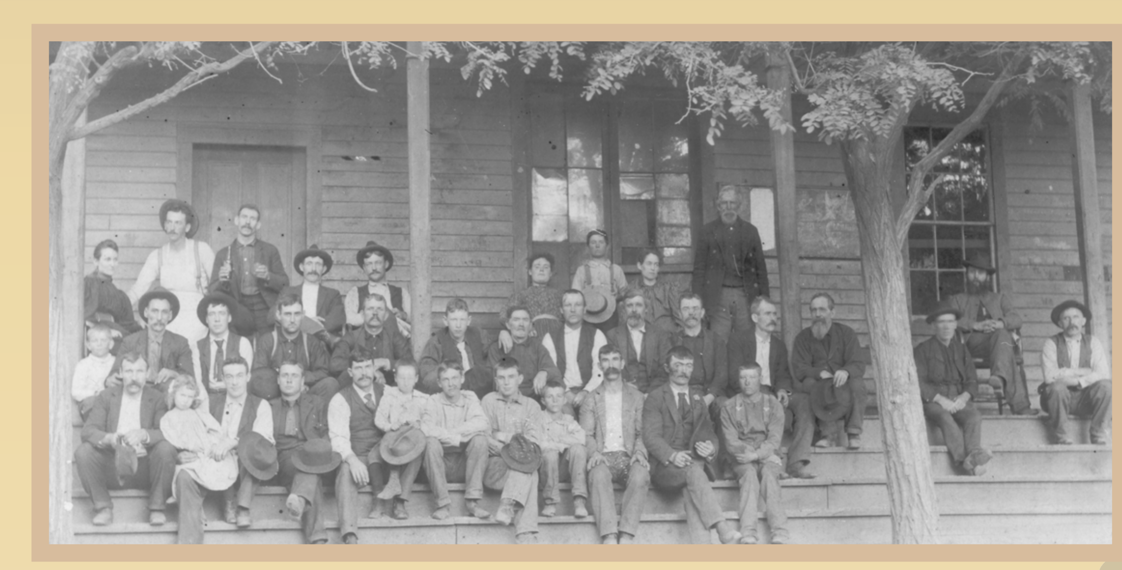
Townspeople at the Somersville Hotel, circa 1890s