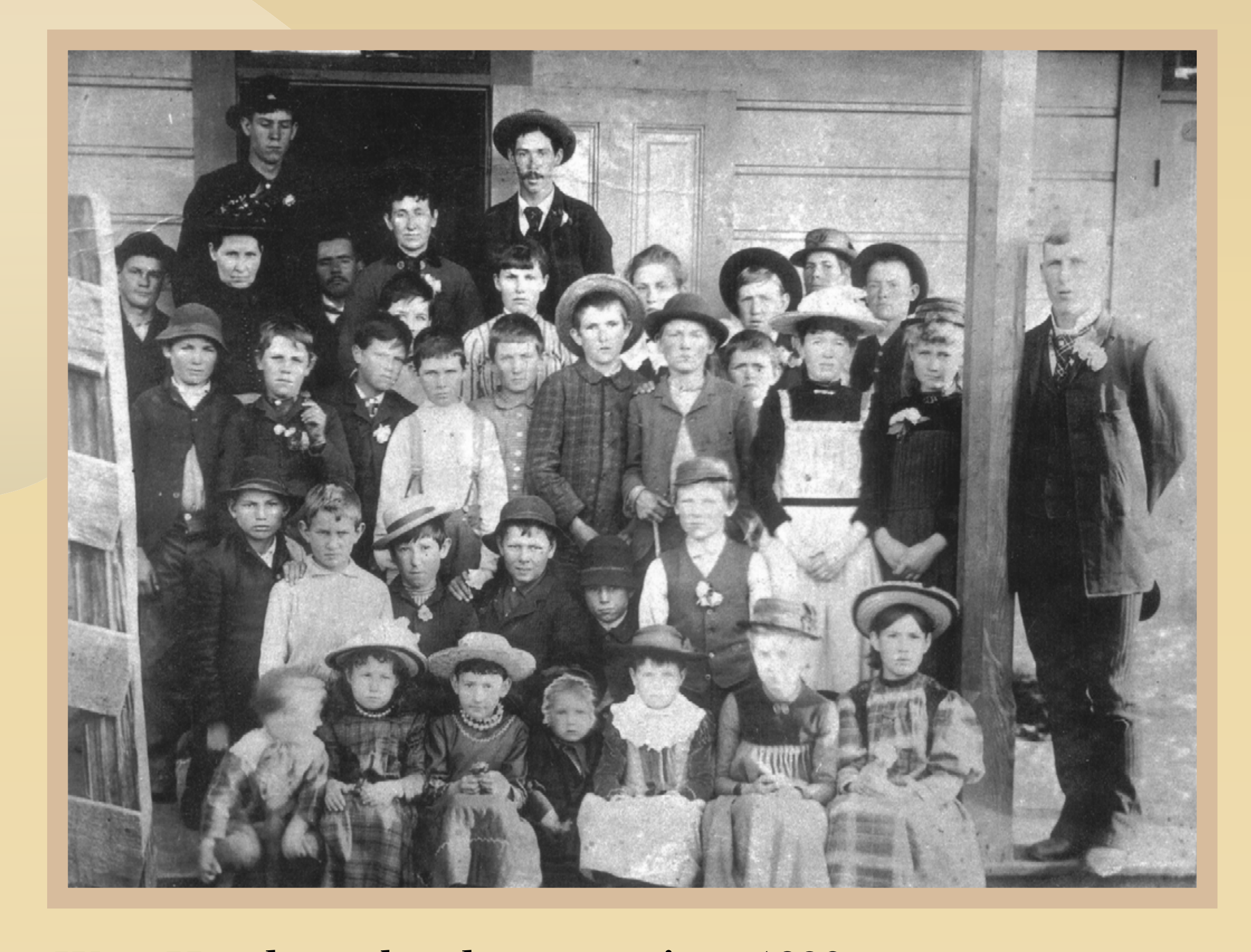
West Hartley school group, circa 1890