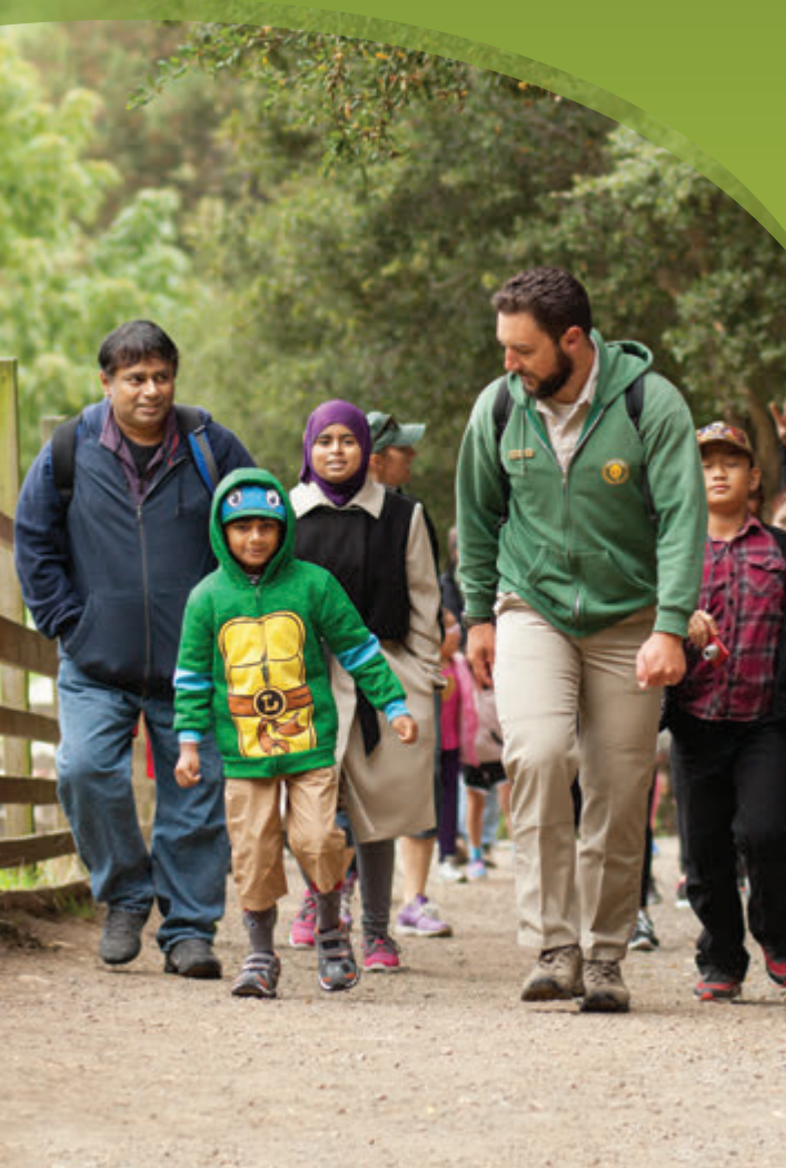
Tilden Nature Area, Berkeley