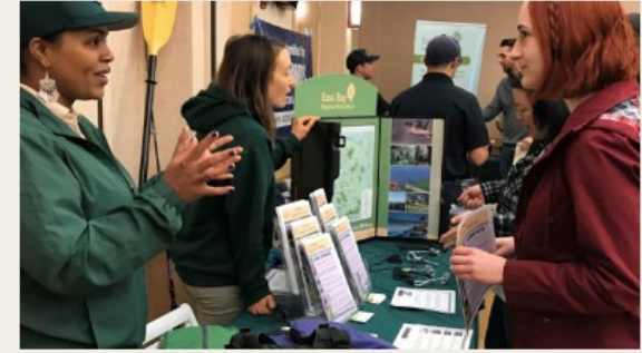
FAQs About Employment

Frequently Asked Questions About Employment