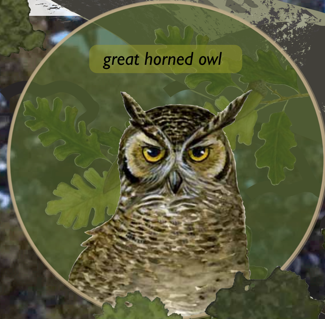
great horned owl

Even "messy" old oaks are valuable wildlife habitat. The loose bark of snags make snug roosts for bats. Fallen leaf litter creates a patch of increased soil fertility where countless invertebrates and fungi thrive. Understory shrubs, like poison oak, hide small mammals and birds from predators, and woodpeckers make homes and store food in the dead branches.