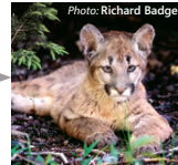
6 to 8 weeks old As kittens grow, they accompany their mother on hunts.