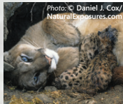
92-day Gestation to Birth 1 to 4 kittens are born, fully furred, spotted, and weighing just over a pound at birth.