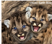
2 weeks old Eyes and ears open. Mother leaves for short periods of time to hunt.