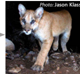
6 to 12 months Juvéniles become more independent. Spots continue to fade. They disperse at about 16 months to establish their own territories.