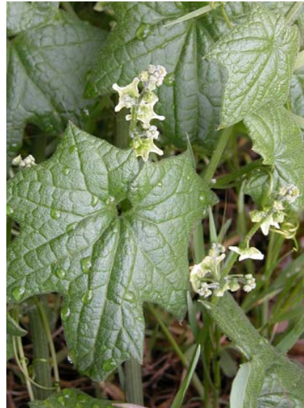
Common / California Manroot Marah fabaceus Native Perennial Gourd Family