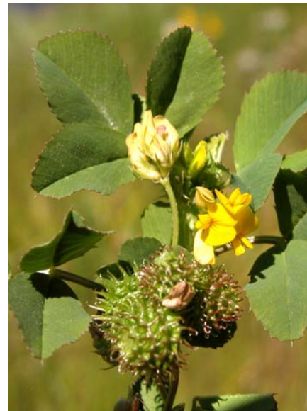
California Bur Clover Medicago polymorpha Introduced Annual Pea Family