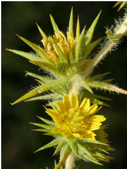
Congdon Spikeweed Hemizonia parryi ssp. congonii Native Annual Sunflower Family