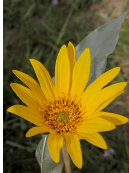
Narrow-leaf Mule's Ear Wyethia angustifolia Native Perennial Sunflower Family