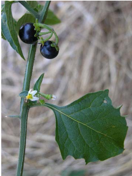
Small-flower Nightshade Solanum americanum Native Annual-Perennial Nightshade Family