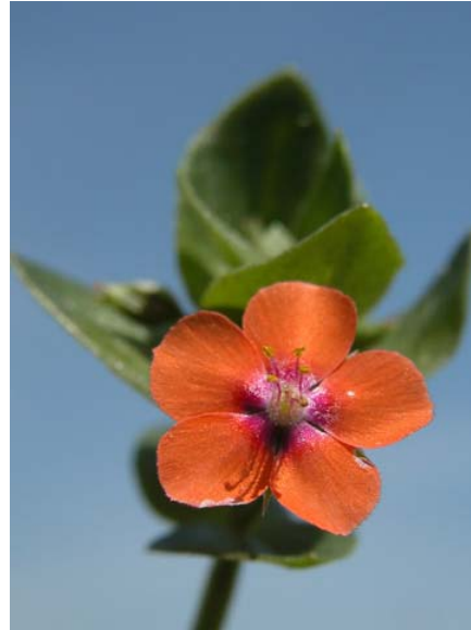
Scarlet Pimpernel Anagallis arvensis Introduced Annual Primrose Family