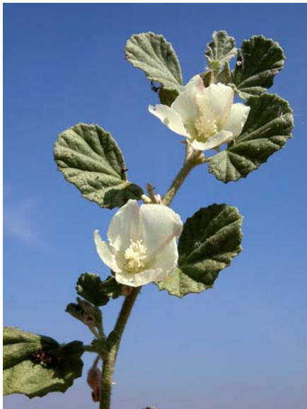
Alkali Mallow Malvella leprosa Native Perennial Mallow Family