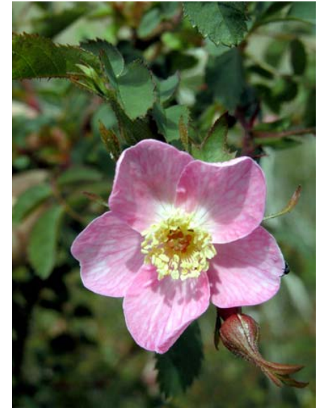
California Wild Rose Rosa californica Native Perennial Rose Family