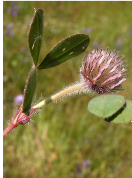
Rose Clover Trifolium hirtum Introduced Annual Pea Family