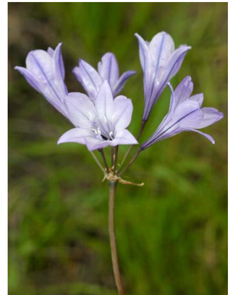
Ithuriel's Spear Triteleia laxa Native Perennial Lily Family