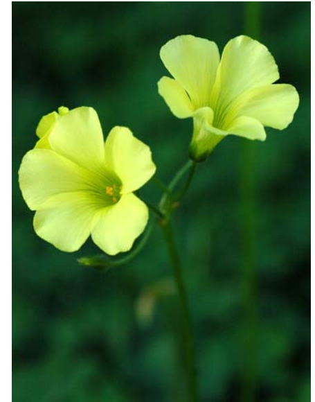
Bermuda Buttercup Oxalis pes-caprae Introduced Perennial Oxalis Family