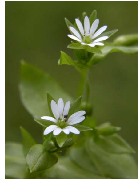
Common Chickweed Stellaria media Introduced Annual Pink Family