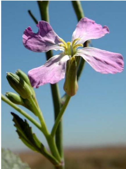
Wild Radish Raphanus sativus Introduced Annual Mustard Family