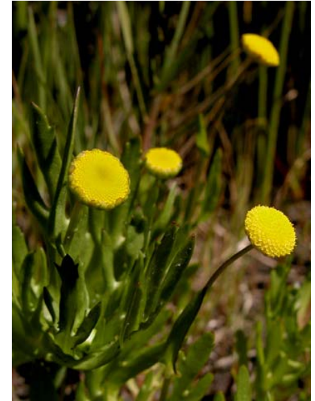
Brass Buttons Cotula coronopifolia Introduced Perennial Sunflower Family