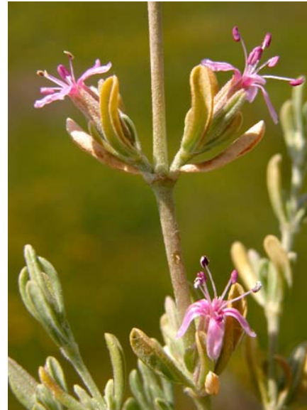
Alkali Heath Frankenia salina Native Perennial Frankenia Family