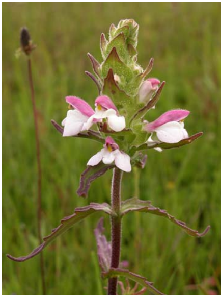
Bellardia Bellardia trixago Introduced Annual Snapdragon Family