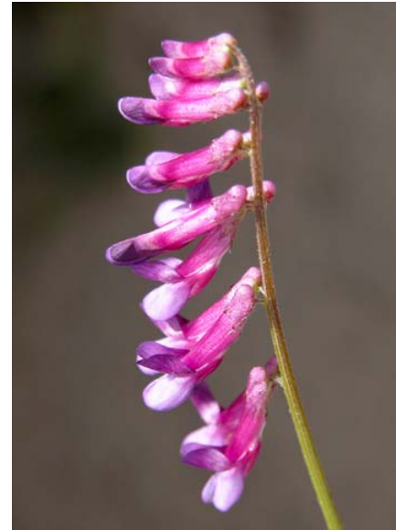
Winter Vetch Vicia villosa ssp. varia Introduced Annual-Biennial Pea Family