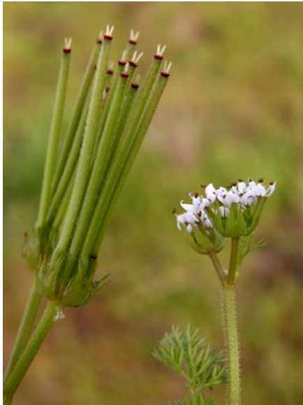
Shepherd's Needle Scandix pecten-veneris Introduced Annual Carrot Family