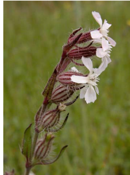
Windmill Pink Silene gallica Introduced Annual Pink Family