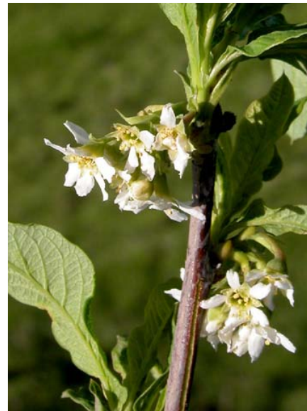
Oso Berry Oemleria cerasiformis Native Perennial Rose Family