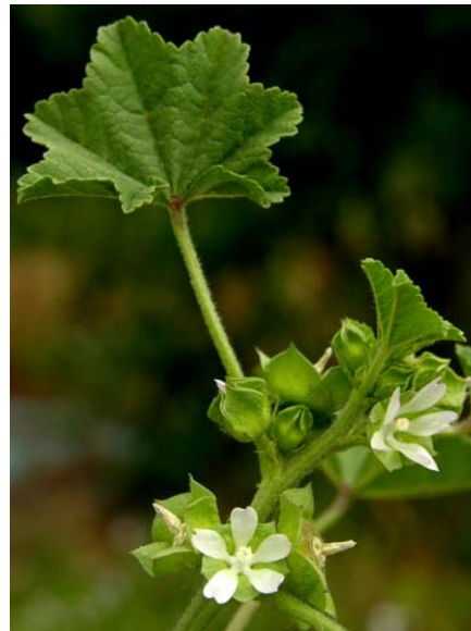
Hidden-flower Cheeseweed Malva parviflora Introduced Annual Mallow Family