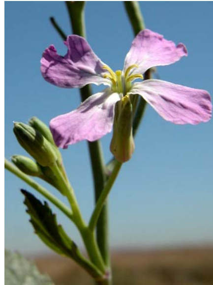
Wild Radish Raphanus sativus Introduced Annual Mustard Family