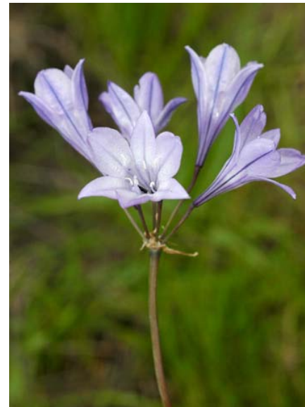
Ithuriel's Spear Triteleia laxa Native Perennial Lily Family