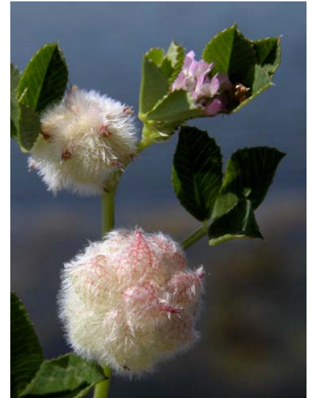
Strawberry Clover Trifolium fragiferum Introduced Perennial Pea Family