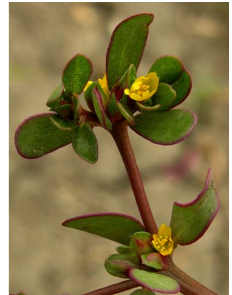
Common Purslane Portulaca oleracea Introduced Perennial Purslane Family