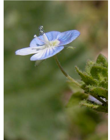
Persian Speedwell Veronica persica Introduced Annual Snapdragon Family