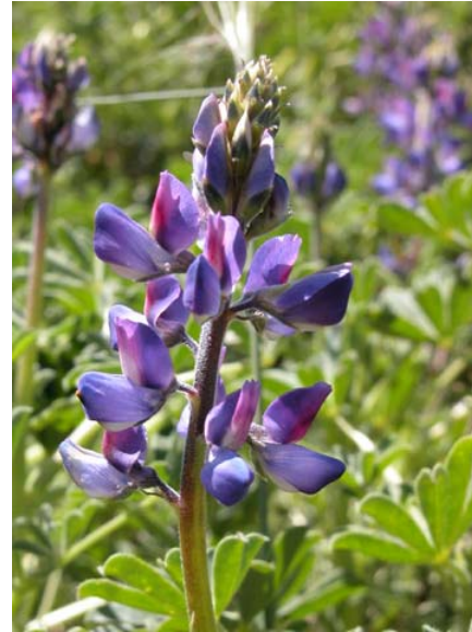
Arroyo Lupine Lupinus succulentus Native Annual Pea Family