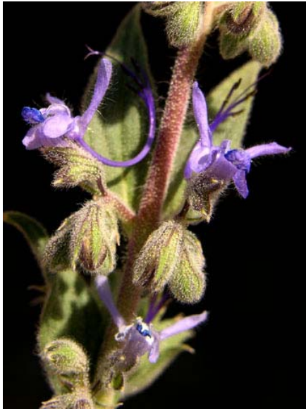
Vinegar Weed Trichostema lanceolatum Native Annual Mint Family