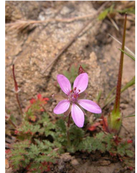
Red-stem Filaree Erodium cicutarium Introduced Annual Geranium Family