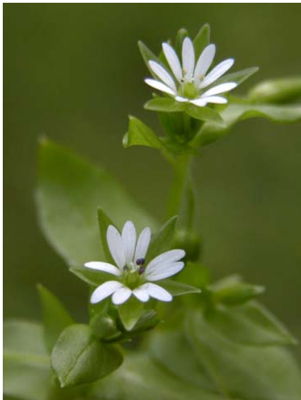
Common Chickweed Stellaria media Introduced Annual Pink Family