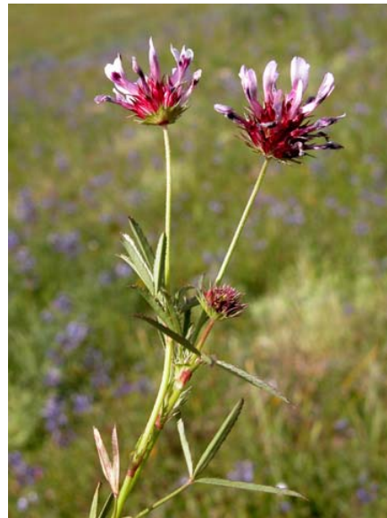
Tomcat Clover Trifolium willdenovii Native Annual Pea Family