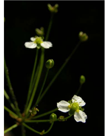
Common Water Plantain Alisma plantago-aquatica Native Perennial Water-Plantain Family