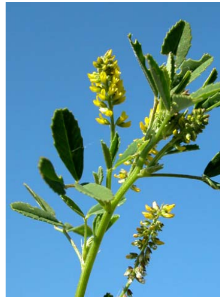
Sour Clover Melilotus indica Introduced Annual-Biennial Pea Family