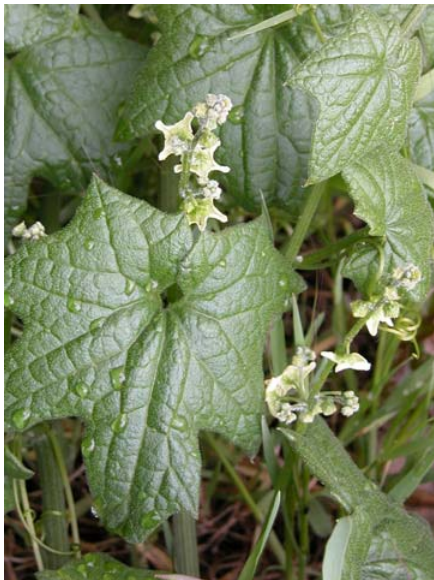
Common / California Manroot Marah fabaceus Native Perennial Gourd Family