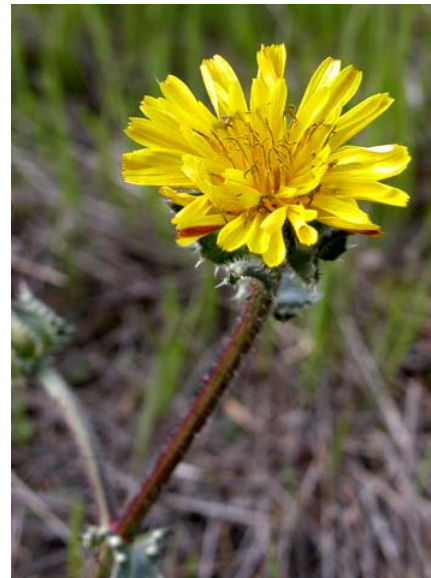
Bristly Ox-tongue Picris echioides Introduced Annual-Biennial Sunflower Family