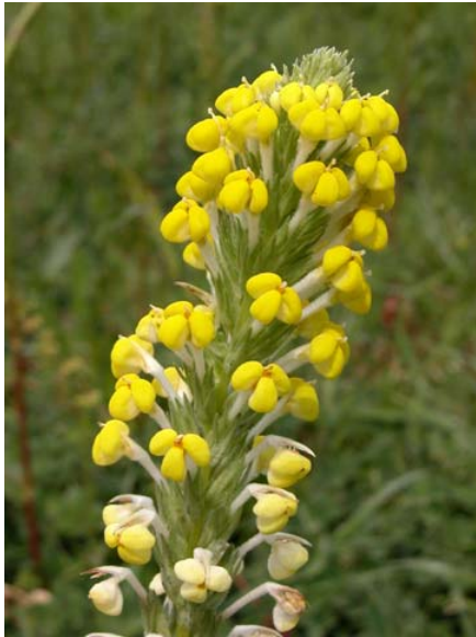
Yellow Johnny-tuck Triphysaria eriantha ssp. eriantha Native Annual Snapdragon Family