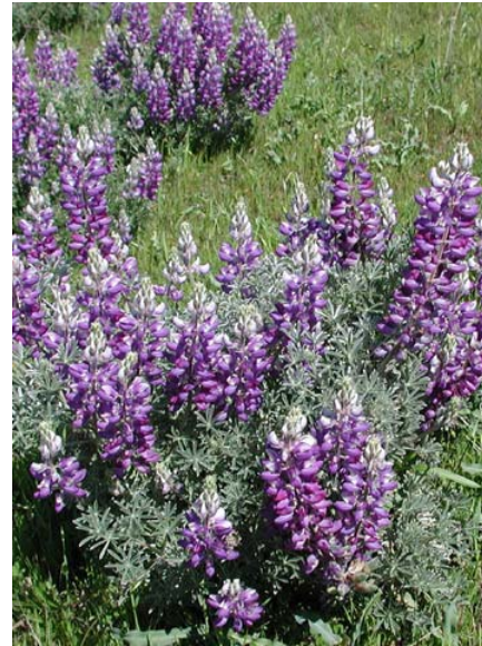
Blue Bush / Silver Lupine Lupinus albifrons var. albifrons Native Perennial Pea Family