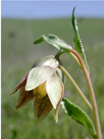
Stinkbells Fritillaria agrestis Native Perennial Lily Family