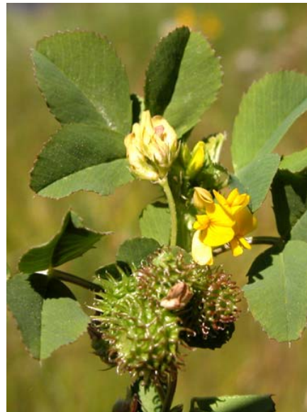
California Bur Clover Medicago polymorpha Introduced Annual Pea Family