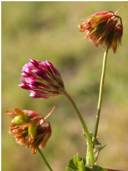
Pinpoint Clover Trifolium gracilentum var. gracilentum Native Annual Pea Family