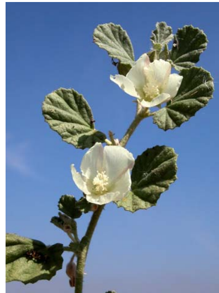
Alkali Mallow Malvella leprosa Native Perennial Mallow Family