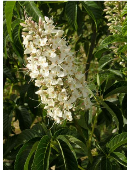
California Buckeye Aesculus californica Native Perennial Buckeye Family