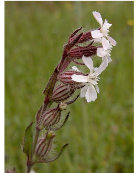
Windmill Pink Silene gallica Introduced Annual Pink Family