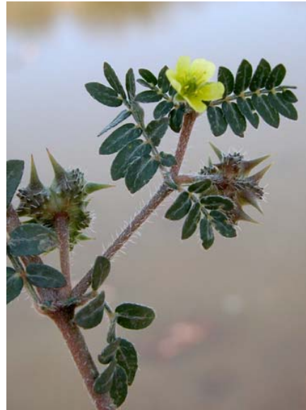
Puncture Vine Tribulus terrestris Introduced Annual Caltrop Family