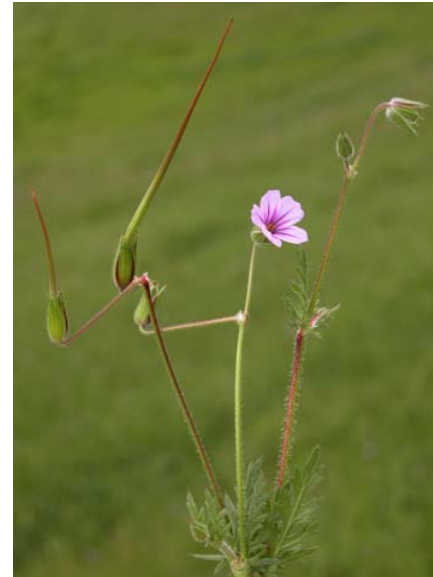
Long-beaked Filaree Erodium botrys Introduced Annual Geranium Family