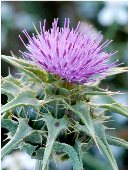
Milk Thistle Silybum marianum Introduced Annual-Biennial Sunflower Family