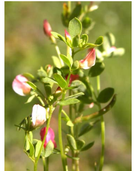
Spanish Clover Lotus purshianus var. purshianus Native Annual Pea Family