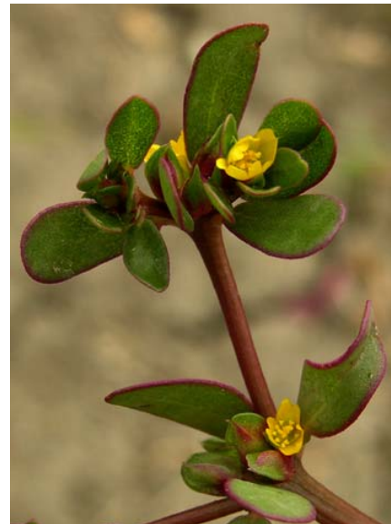
Common Purslane Portulaca oleracea Introduced Perennial Purslane Family