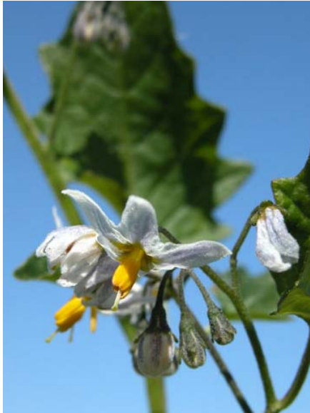
Black Nightshade Solanum nigrum Introduced Annual Nightshade Family