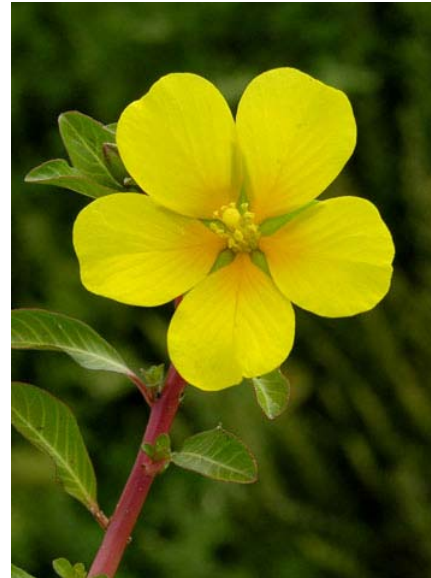
Yellow Water Primrose Ludwigia peploides ssp. peploides Native Perennial Evening Primrose Family