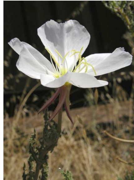
Antioch Dunes Eve. Primrose Oenothera deltoides ssp. howellii Native Perennial Evening Primrose Family