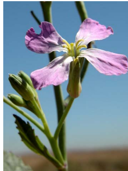
Wild Radish Raphanus sativus Introduced Annual Mustard Family