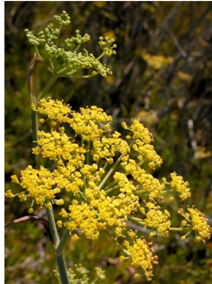
Sweet Fennel Foeniculum vulgare Introduced Perennial Carrot Family