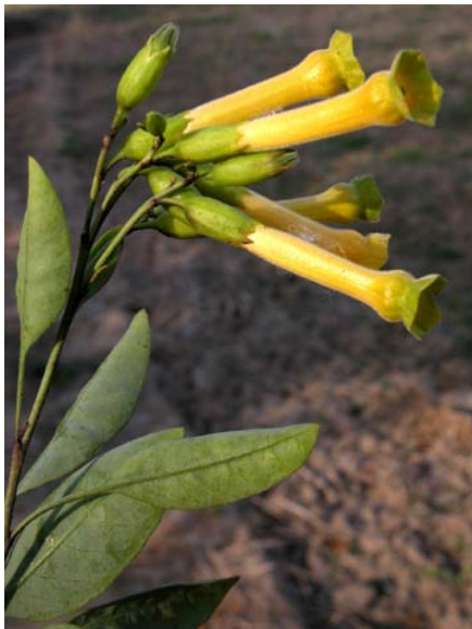
Tree Tobacco Nicotiana glauca Introduced Perennial Nightshade Family