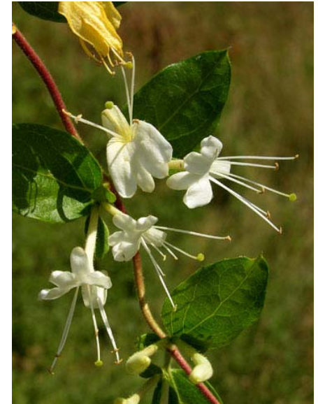
Japanese Honeysuckle Lonicera japonica Introduced Perennial Honeysuckle Family