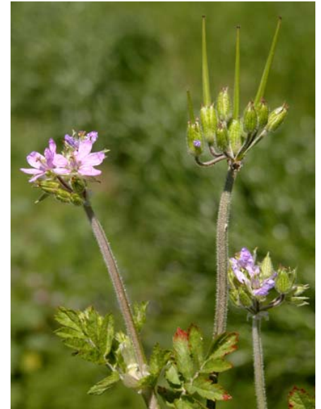
White-stem Filaree Erodium moschatum Introduced Annual Geranium Family