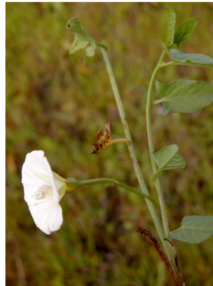
Field Bindweed Convolvulus arvensis Introduced Perennial Morning-Glory Family