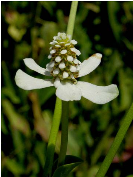
Yerba Mansa Anemopsis californica Native Perennial Lizard's-Tail Family