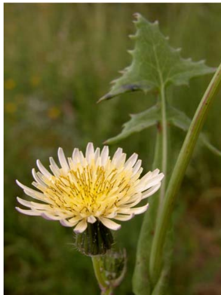
Common Sow Thistle Sonchus oleraceus Introduced Annual Sunflower Family