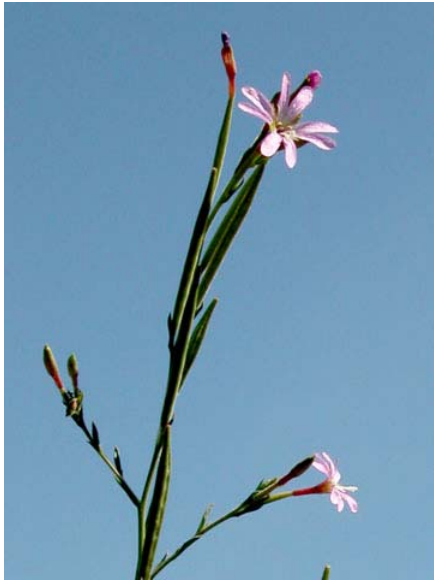
Panicled / Weedy Willowherb Epilobium brachycarpum Native Annual Evening Primrose Family