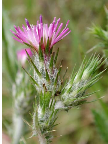
Italian Thistle Carduus pycnocephalus Introduced Annual Sunflower Family