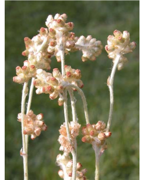
Weedy Cudweed Gnaphalium luteo-album Introduced Annual Sunflower Family