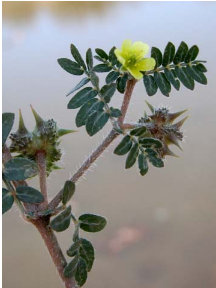
Puncture Vine Tribulus terrestris Introduced Annual Caltrop Family