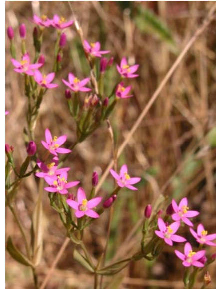
Monterey Centaury Centaureum muhlenbergii Native Annual-Biennial Gentian Family