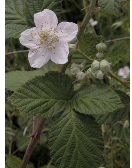
Himalayan Blackberry Rubus discolor Introduced Perennial Rose Family