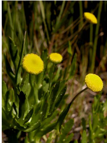
Brass Buttons Cotula coronopifolia Introduced Perennial Sunflower Family