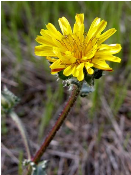
Bristly Ox-tongue Picris echioides Introduced Annual-Biennial Sunflower Family