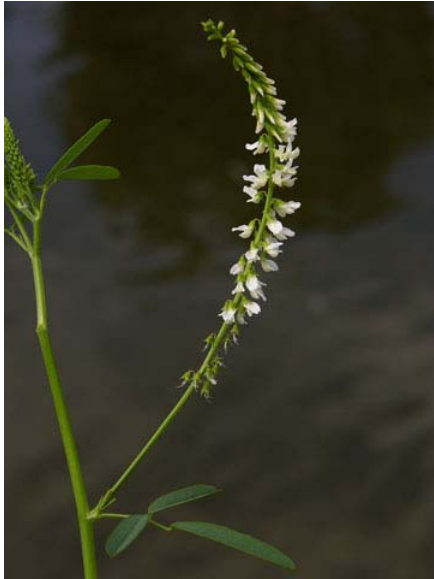
White Sweet Clover Melilotus alba Introduced Annual-Biennial Pea Family