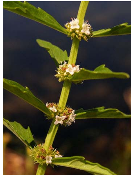
Field Mint Mentha arvensis Native Perennial Mint Family