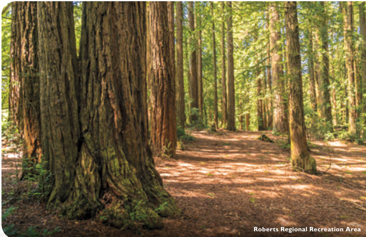
Roberts Regional Recreation Area

that to stay healthy, redwoods need the blanket of shed needles that collect around their base. This accumulation of duff acidifies the soil, holds moisture and protects the shallow roots. "Too much foot traffic removes the duff and negatively impacts the trees," Kassebaum says. Many people are unaware that these majestic trees have delicate root systems. The Park District and the League have worked together to educate park users about the risk of human impact and the importance of protecting the trees' ecosystem. To ensure that the trees have the space they need to thrive, the Park District rerouted several trails and repositioned some picnic tables to provide additional clearance. Additionally, split-rail fencing has been installed around some