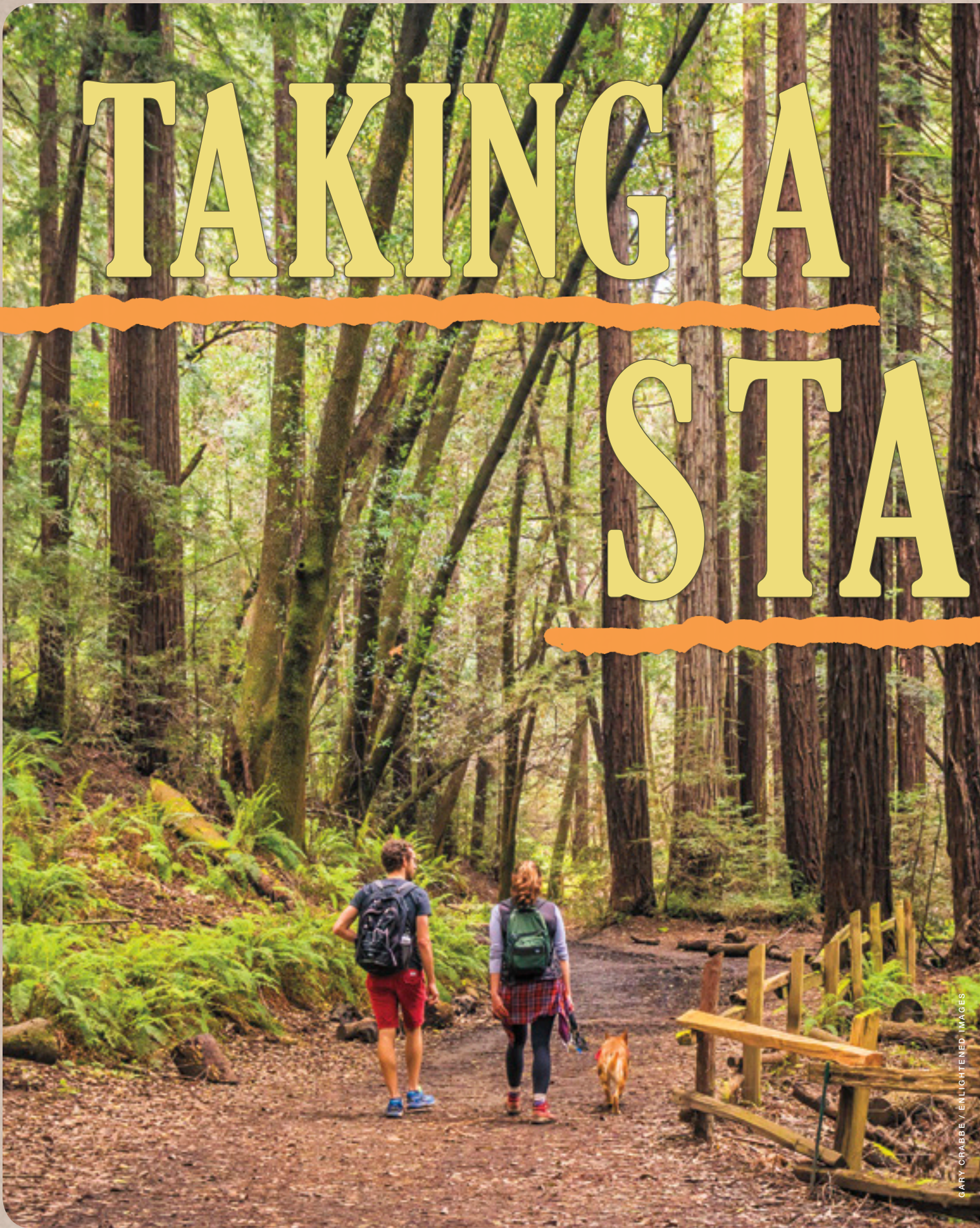
GARY CRABBE / ENLIGHTENED IMAGES