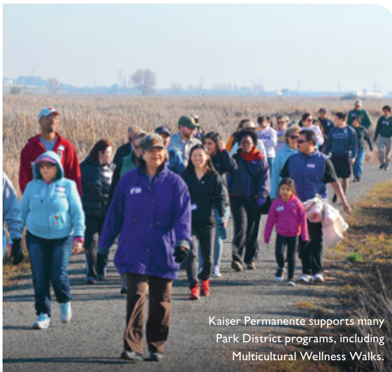
Kaiser Permanente supports many Park District programs, including Multicultural Wellness Walks.