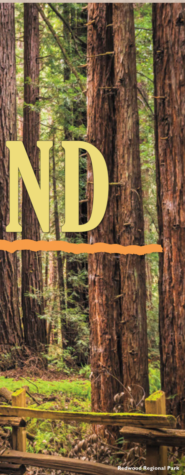
Redwood Regional Park