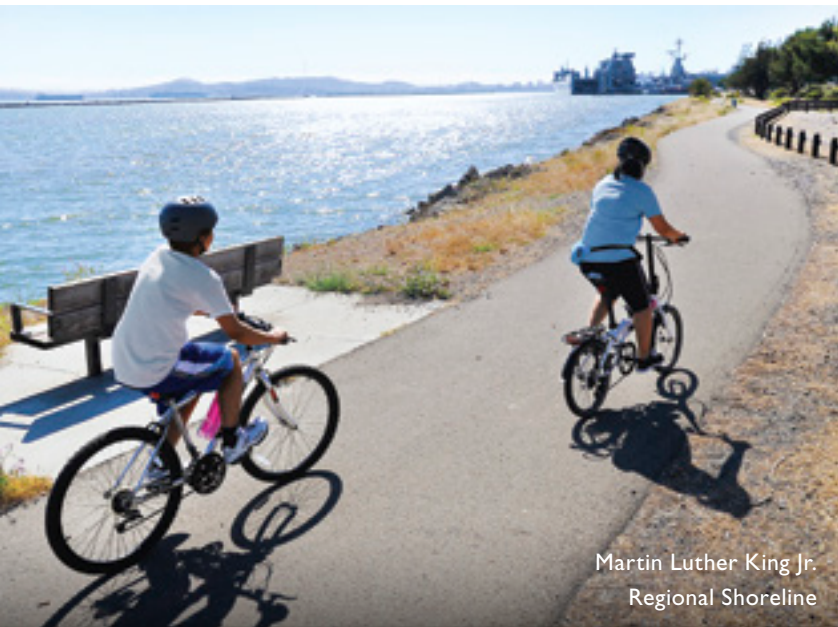
Martin Luther King Jr. Regional Shoreline

she wanted to keep going and she said, 'Yes, I am going to do the Trails Challenge today.' So we got in the car and headed to Martin Luther King Jr. Regional Shoreline.