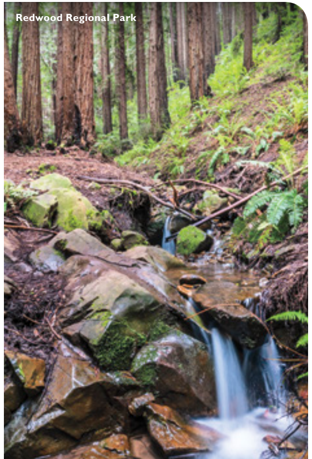
Redwood Regional Park