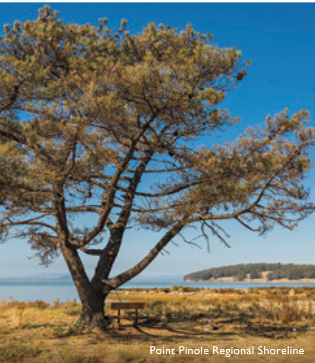
Point Pinole Regional Shoreline