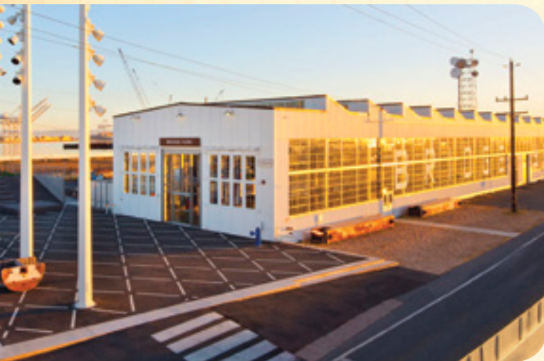
The Bridge Yard building (top and above) will be a future hub for the East Bay Gateway Regional Park.

A proposed shoreline park near the eastern span of the Bay Bridge promises recreation opportunities and spectacular views