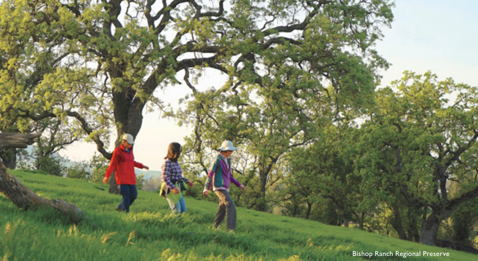
Bishop Ranch Regional Preserve