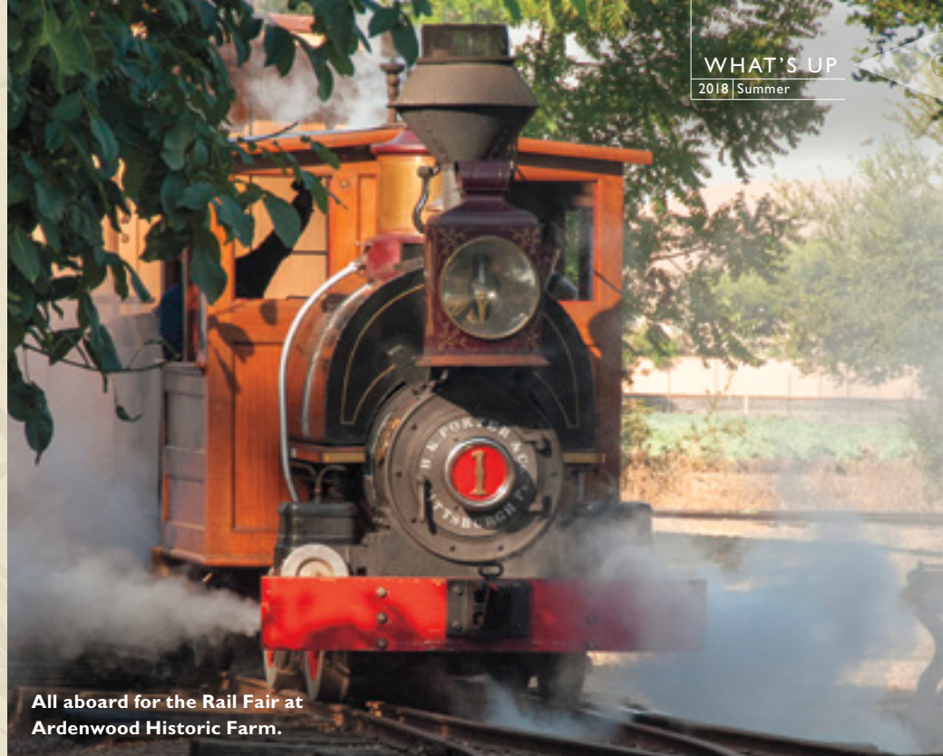
All aboard for the Rail Fair at Ardenwood Historic Farm.

Join us for the 33rd Annual Coastal Cleanup Day. Park District staff and volunteers will pick up litter and recyclables from shoreline