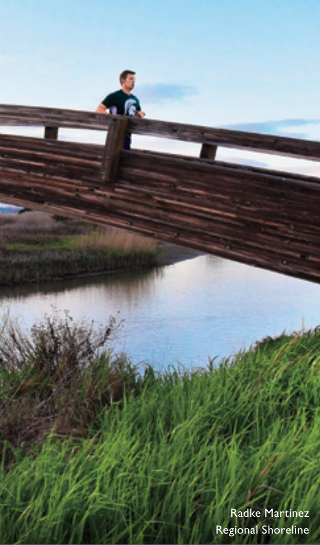
Radke Martinez Regional Shoreline