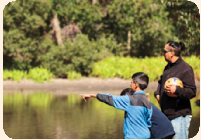
From explorations around Jewel Lake to animal encounters at the Little Farm, the 740-acre Tilden Nature Area offers a variety of family-friendly activities.