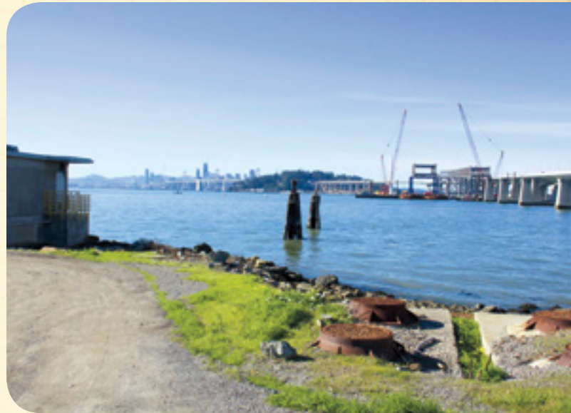
East Bay Gateway Regional Park promises views of the Port of Oakland and other shoreline highlights.

East Bay Gateway, which will be managed by the Park District, includes Caltrans land and property transferred from the former