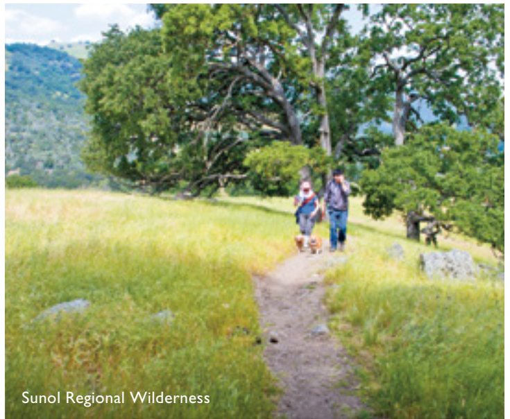
Sunol Regional Wilderness

“PARK VISITORS APPRECIATE THE DIVERSITY OF TRAILS SELECTED. WE TRY TO GET PEOPLE OUT TO VARIOUS LOCATIONS SO THEY EXPERIENCE DIFFERENT TYPES OF NATURE.”