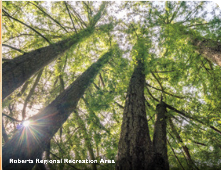
Roberts Regional Recreation Area

sensitive areas, with interpretive panels to educate park users about how they can help protect these beautiful trees.