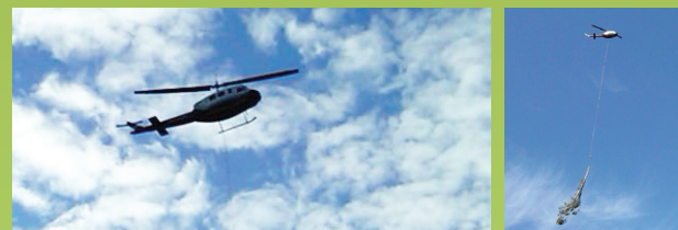
Figure 2. Helicopter flight operations over the Anthony Chabot Campground Fuels Unit 2 - AC013; images by Janet Gomes.