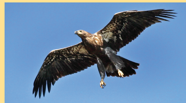
Figure 4. In early July, the fledgling eagle takes his first whirl around Lake Chabot.