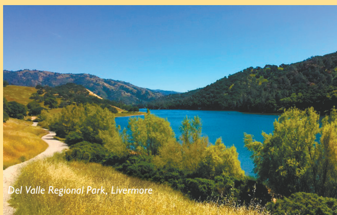
Del Valle Regional Park, Livermore