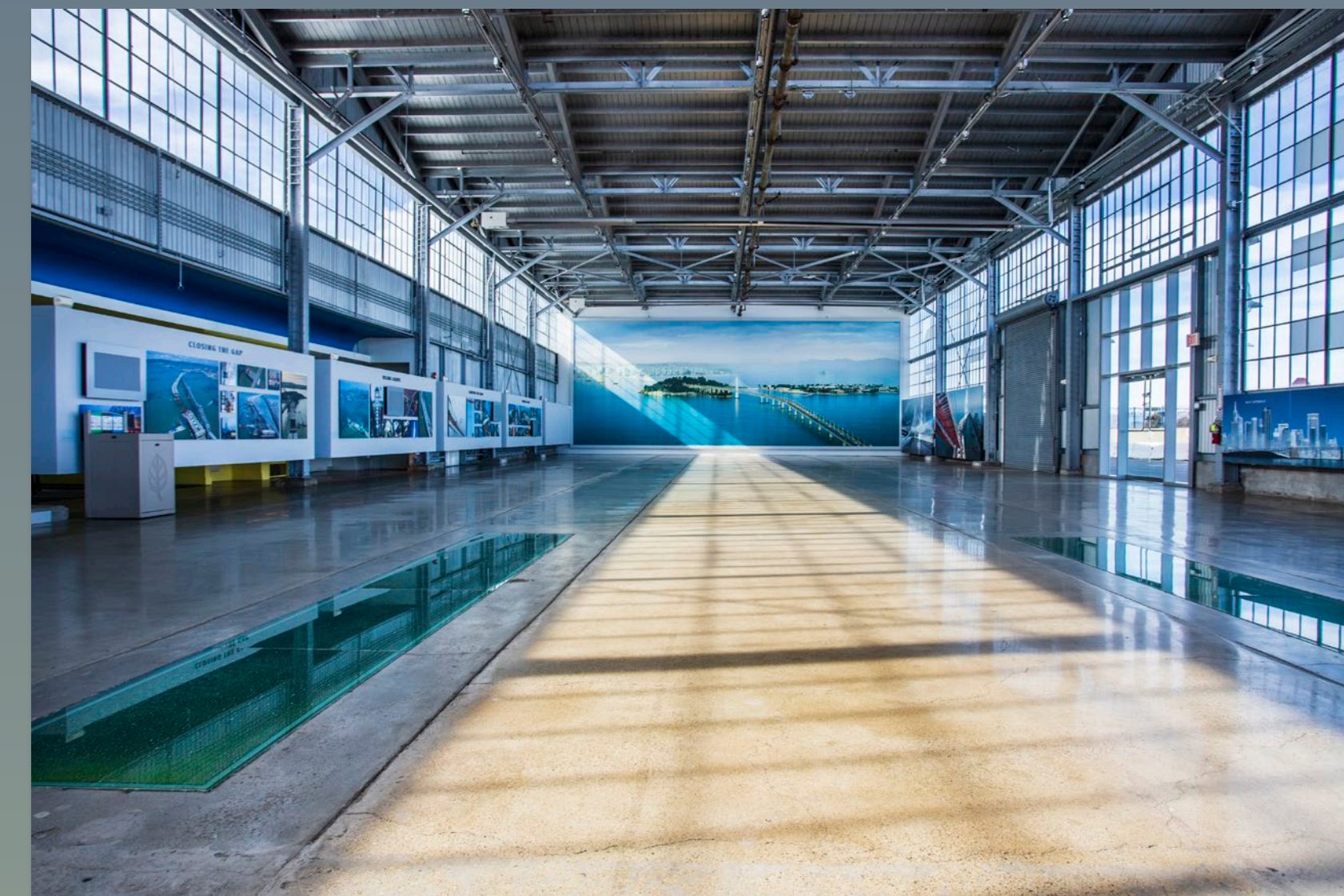
Bridge Yard Interior