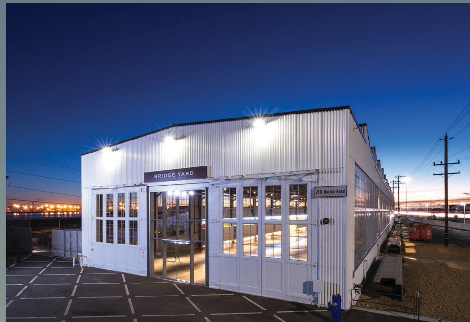
Bridge Yard Building