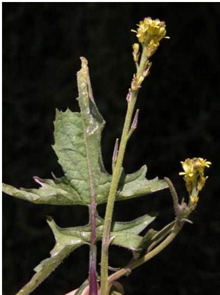
Black Mustard Brassica nigra Introduced Annual Mustard Family