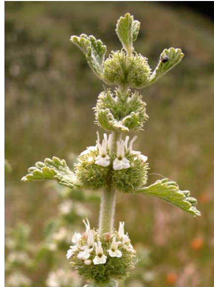
Common Horehound Marrubium vulgare Introduced Perennial Mint Family