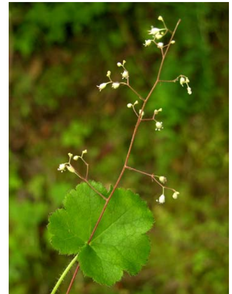
Small-flower Alumroot Heuchera micrantha Native Perennial Saxifrage Family