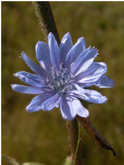
Chicory Cichorium intybus Introduced Perennial Sunflower Family