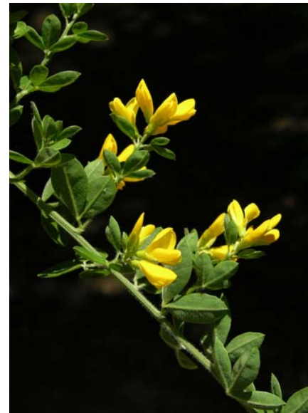
French Broom Genista monspessulana Introduced Perennial Pea Family