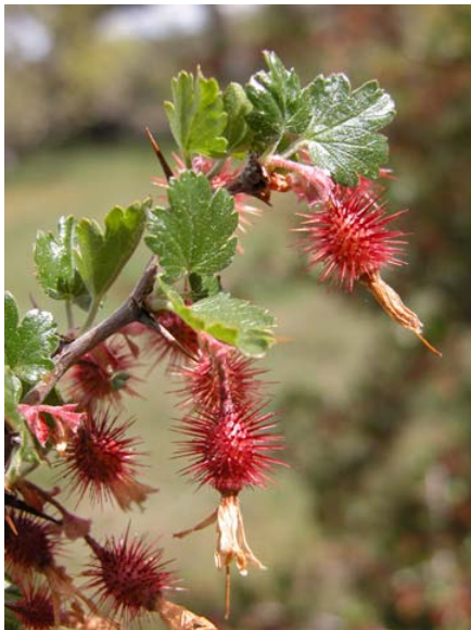
Hillside Gooseberry Ribes californicum var. californicum Native Perennial Gooseberry Family