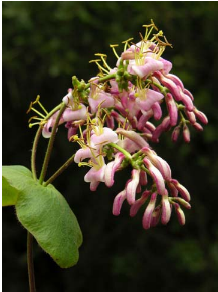
Hairy Vine Honeysuckle Lonicera hispidula var. vacillans Native Perennial Honeysuckle Family