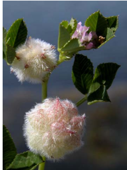
Strawberry Clover Trifolium fragiferum Introduced Perennial Pea Family