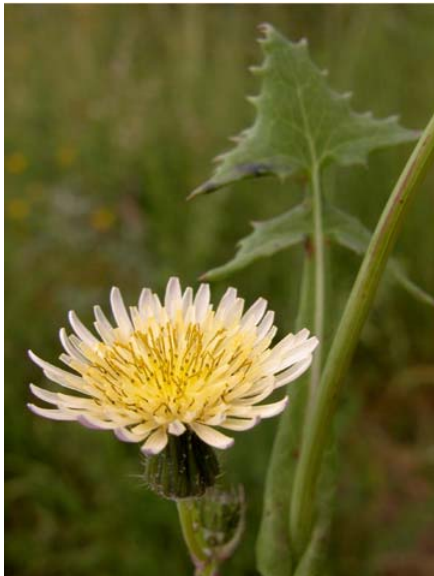
Common Sow Thistle Sonchus oleraceus Introduced Annual Sunflower Family