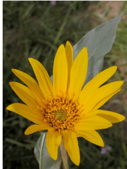
Narrow-leaf Mule's Ear Wyethia angustifolia Native Perennial Sunflower Family