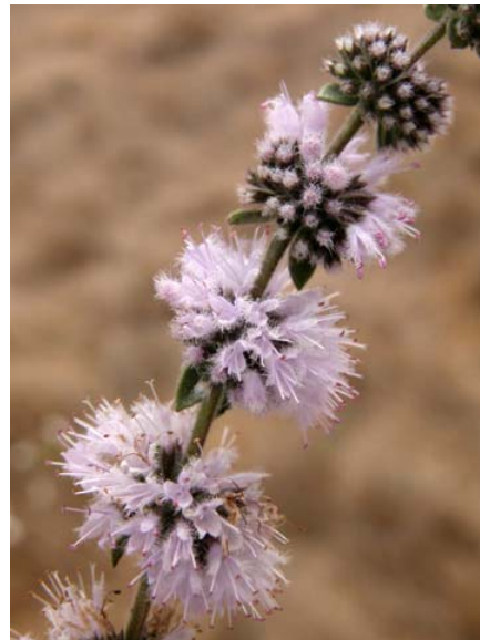
Pennyroyal Mentha pulegium Introduced Perennial Mint Family