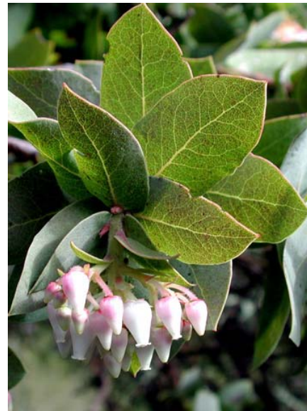
Pallid Manzanita Arctostaphylos pallida Native Perennial Heath Family