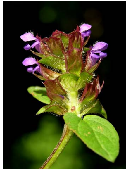
Narrow-leaf Selfheal Prunella vulgaris var. lanceolata Native Perennial Mint Family