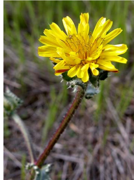
Bristly Ox-tongue Picris echioides Introduced Annual-Biennial Sunflower Family