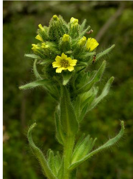
Common / Coast Tarweed Madia sativa Native Annual Sunflower Family