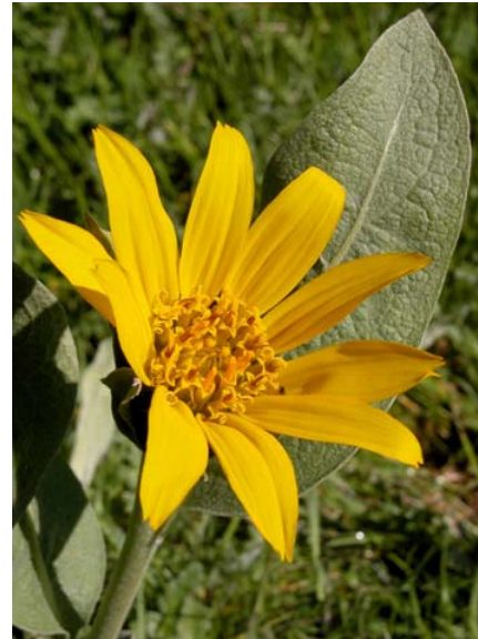
Gray Mule's Ear Wyethia helenioides Native Perennial Sunflower Family