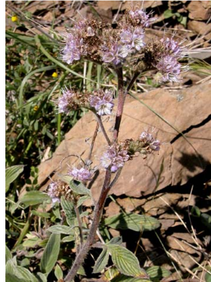
California / Rock Phacelia Phacelia californica Native Perennial Waterleaf Family