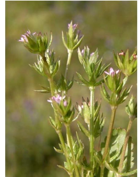
Blue Field Madder Sherardia arvensis Introduced Annual Madder Family