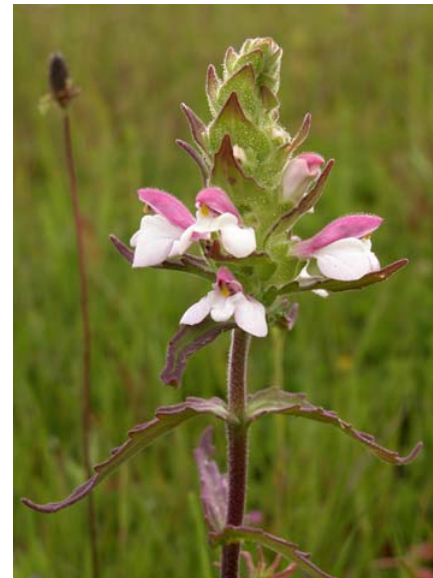
Bellardia Bellardia trixago Introduced Annual Snapdragon Family