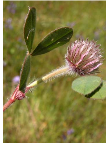
Rose Clover Trifolium hirtum Introduced Annual Pea Family