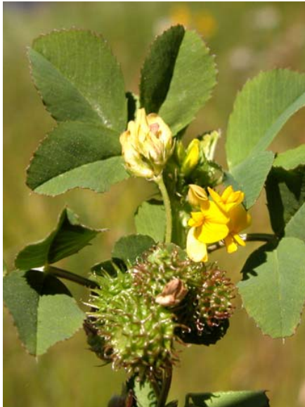
California Bur Clover Medicago polymorpha Introduced Annual Pea Family