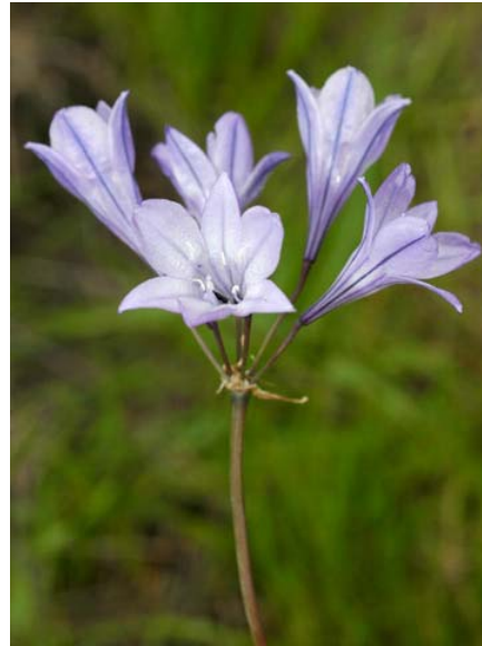
Ithuriel's Spear Triteleia laxa Native Perennial Lily Family