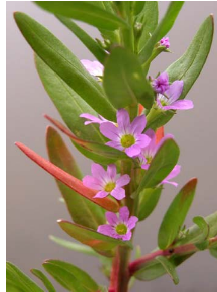
Grass Poly Loosestrife Lythrum hyssopifolium Introduced Annual-Perennial Loosestrife Family