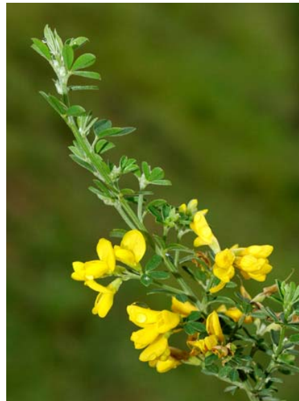
Scotch Broom Cytisus scoparius Introduced Perennial Pea Family