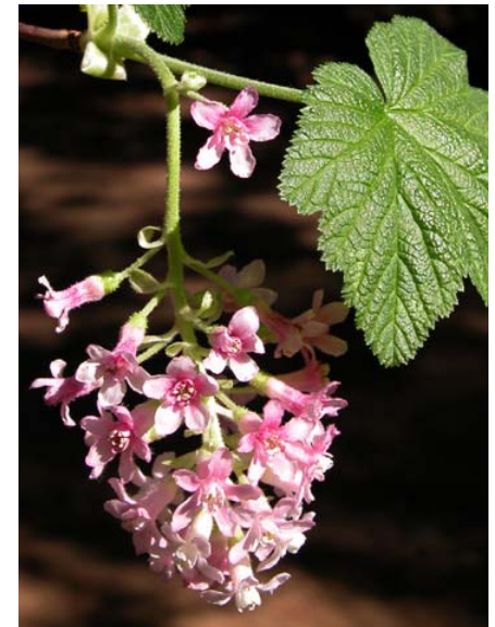
Flowering/Pinkflower Currant Ribes sanguineum var. glutinosum Native Perennial Gooseberry Family