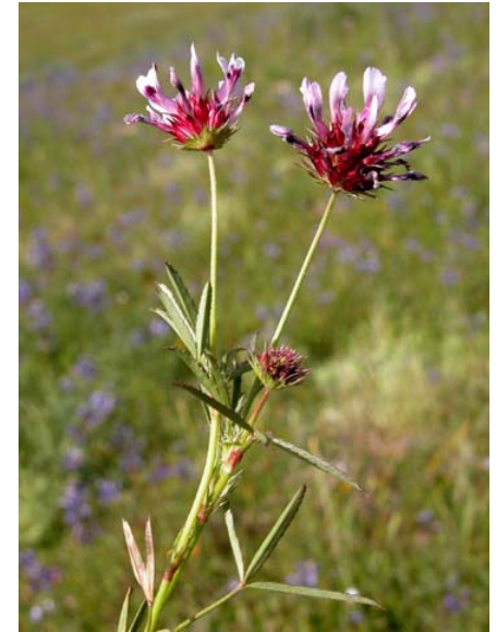
Tomcat Clover Trifolium willdenovii Native Annual Pea Family