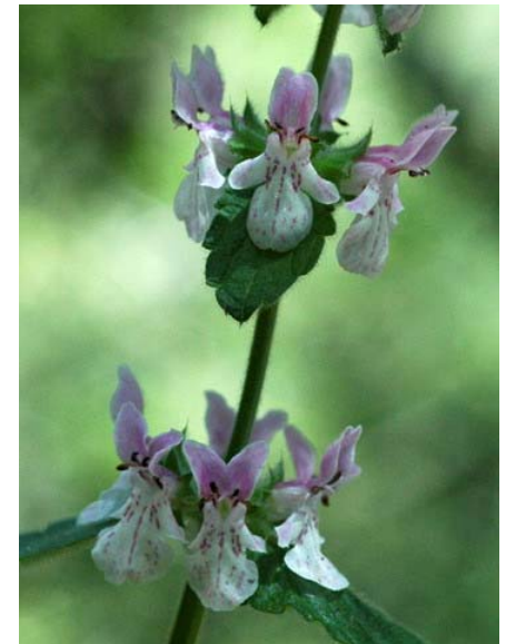
Common Rigid Hedge Nettle Stachys ajugoides var. rigida Native Perennial Mint Family