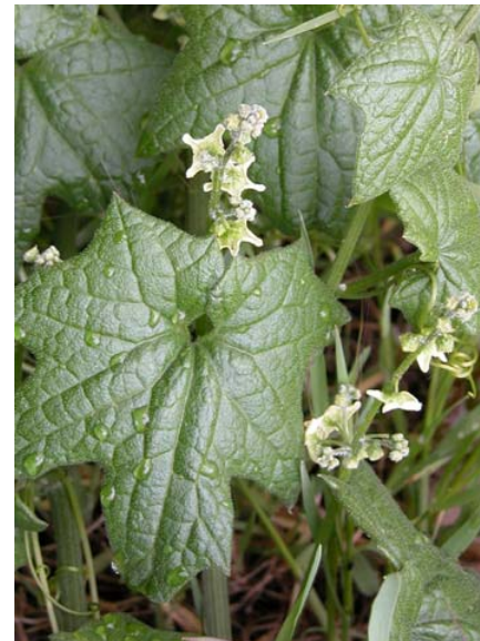
Common / California Manroot Marah fabaceus Native Perennial Gourd Family