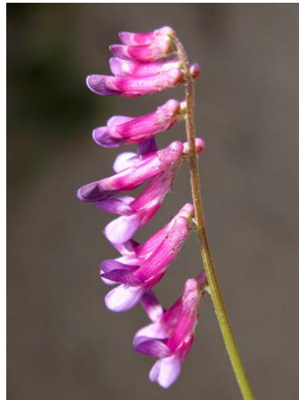
Winter Vetch Vicia villosa ssp. varia Introduced Annual-Biennial Pea Family