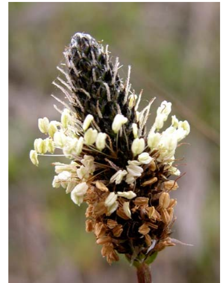
English Plantain Plantago lanceolata Introduced Annual Plantain Family