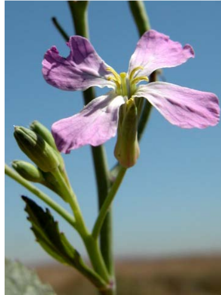
Wild Radish Raphanus sativus Introduced Annual Mustard Family