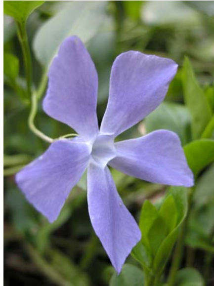
Greater Periwinkle Vinca major Introduced Perennial Dogbane Family