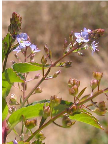
American Brooklime Speedwell Veronica americana Native Perennial Snapdragon Family