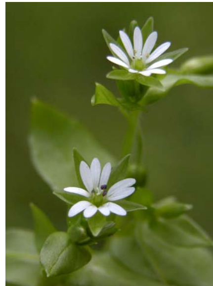
Common Chickweed Stellaria media Introduced Annual Pink Family