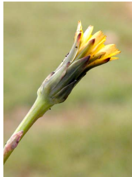
Smooth Cat's-ear Hypochaeris glabra Introduced Annual Sunflower Family