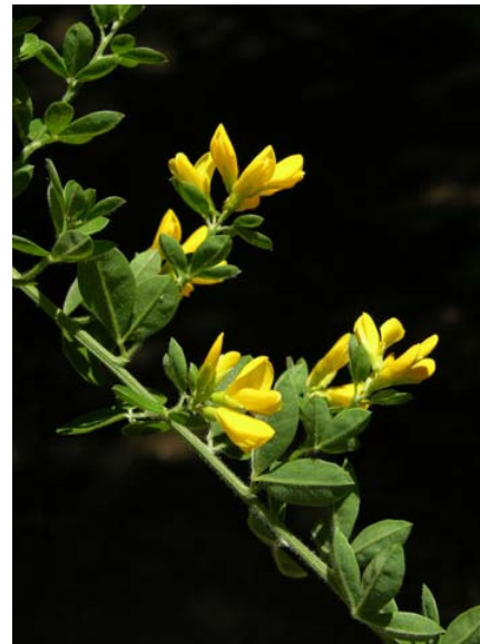
French Broom Genista monspessulana Introduced Perennial Pea Family