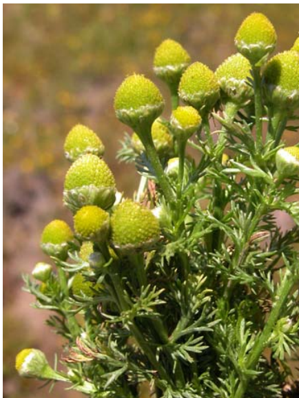
Pineapple Weed Chamomilla suaveolens Introduced Annual Sunflower Family