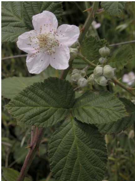
Himalayan Blackberry Rubus discolor Introduced Perennial Rose Family