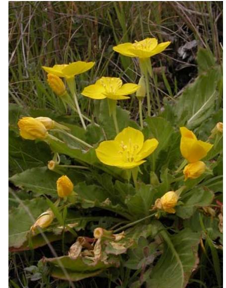
Golden Eggs Suncup Camissonia ovata Native Perennial Evening Primrose Family