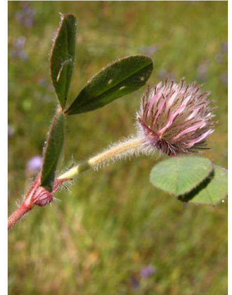
Rose Clover Trifolium hirtum Introduced Annual Pea Family