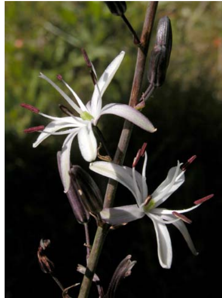
Common Soap Plant Chlorogalum pomeridianum var. pomeridianum Native Perennial Lily Family