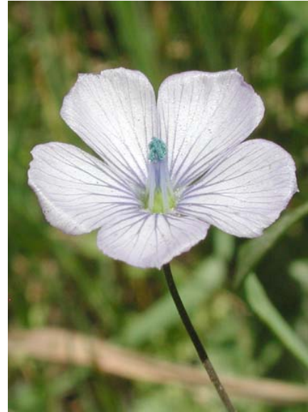
Narrow-leaf Flax Linum bienne Introduced Perennial Flax Family