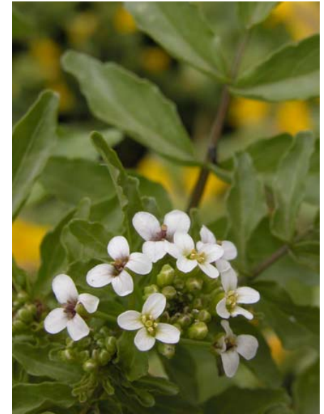
White Water Cress Rorippa nasturtium-aquaticum Native Perennial Mustard Family