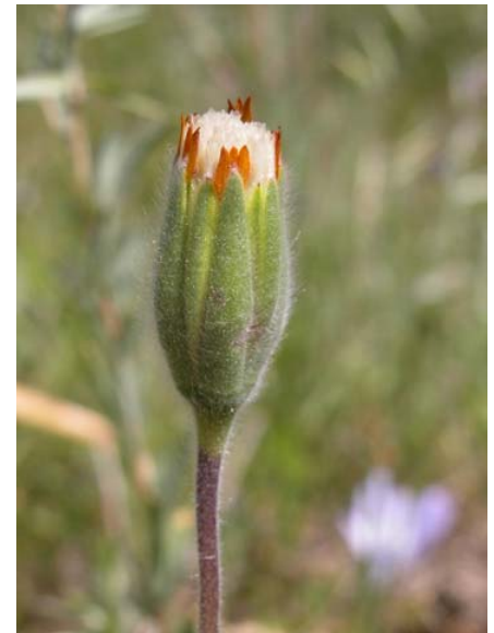
Blow Wives Achyrachaena mollis Native Annual Sunflower Family