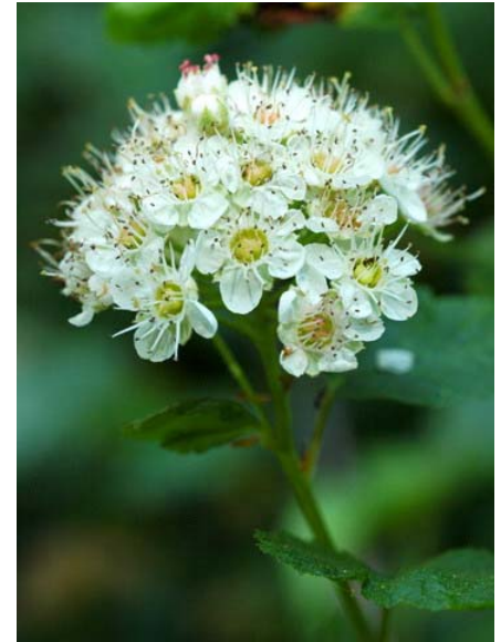
Pacific Ninebark Physocarpus capitatus Native Perennial Rose Family