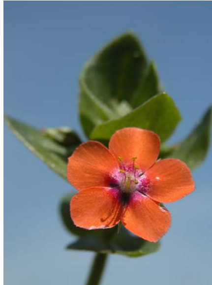
Scarlet Pimpernel Anagallis arvensis Introduced Annual Primrose Family