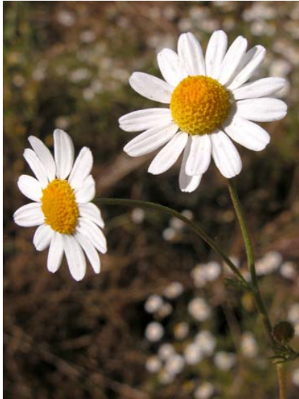
Mayweed Anthemis cotula Introduced Annual Sunflower Family