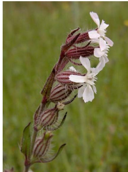
Windmill Pink Silene gallica Introduced Annual Pink Family