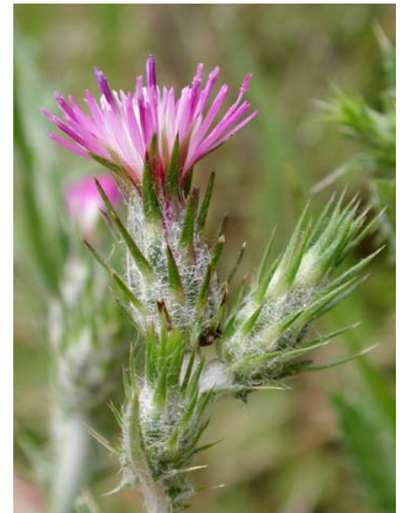
Italian Thistle Carduus pycnocephalus Introduced Annual Sunflower Family