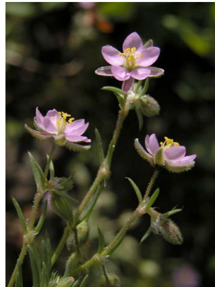
Ruby Sand Spurry Spergularia rubra Introduced Annual-Perennial Pink Family