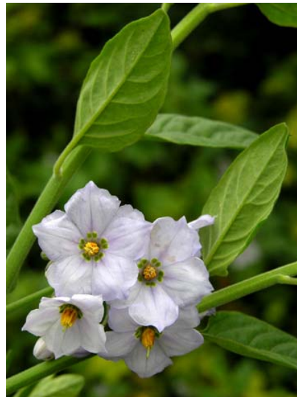
Blue Witch Solanum umbelliferum Native Perennial Nightshade Family