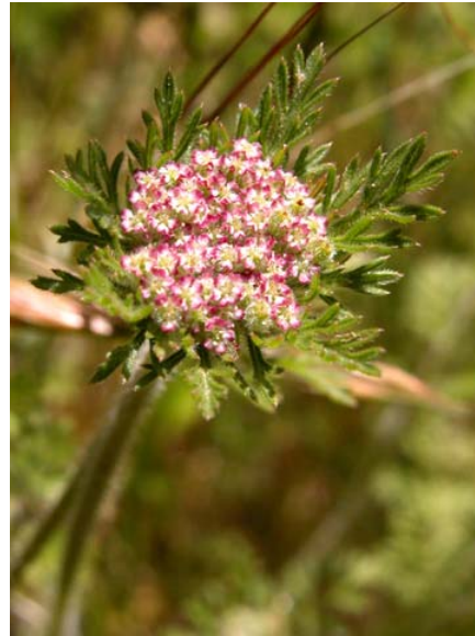
Rattlesnake Weed Daucus pusillus Native Annual Carrot Family