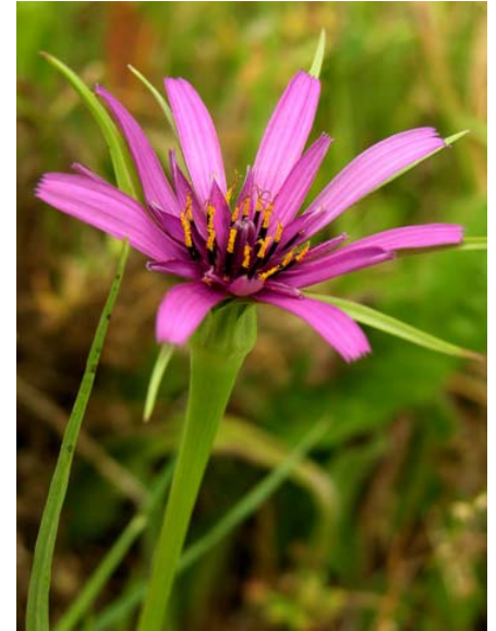
Purple Salsify Tragopogon porrifolius Introduced Biennial-Perennial Sunflower Family