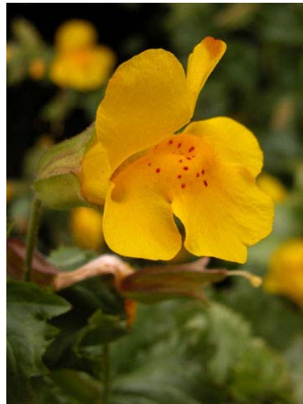
Golden Monkey Flower Mimulus guttatus Native Perennial Snapdragon Family