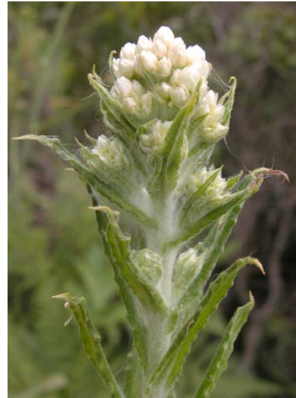
California Everlasting Gnaphalium californicum Native Biennial Sunflower Family