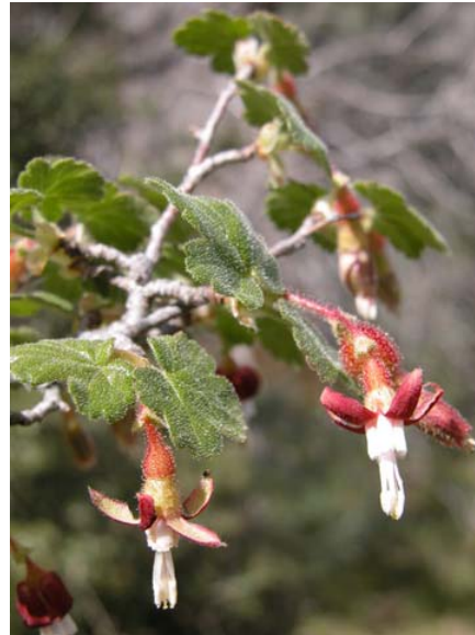
Canyon Gooseberry Ribes menziesii Native Perennial Gooseberry Family