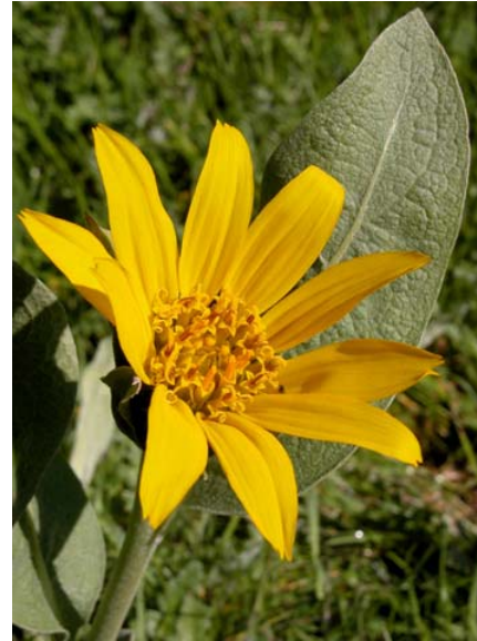
Gray Mule's Ear Wyethia helenioides Native Perennial Sunflower Family