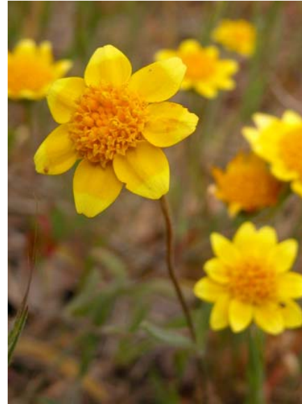
Goldfields Lasthenia californica Native Annual Sunflower Family