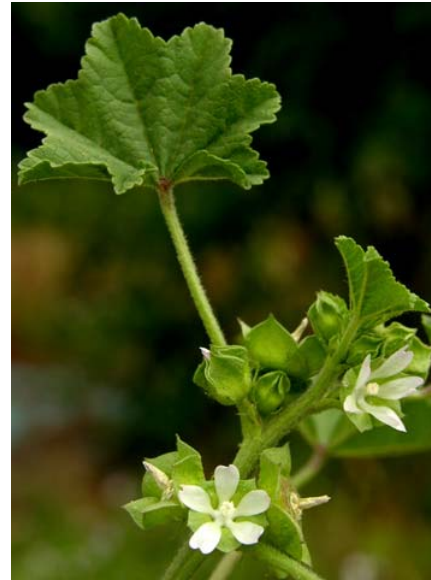
Hidden-flower Cheeseweed Malva parviflora Introduced Annual Mallow Family