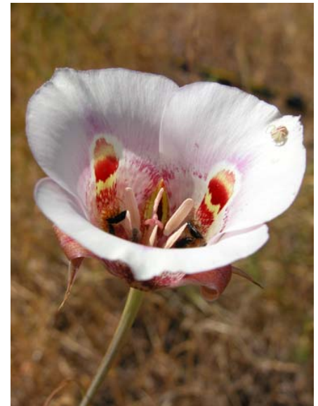
White Butterfly Mariposa Lily Calochortus venustus Native Perennial Lily Family