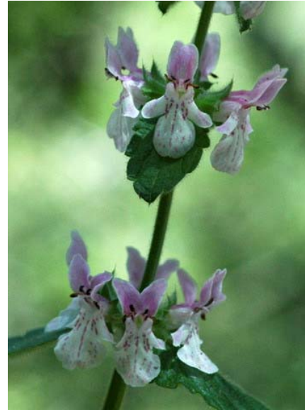
Common Rigid Hedge Nettle Stachys ajugoides var. rigida Native Perennial Mint Family