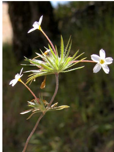
Pinklobe Linanthus Linanthus androsaceus Native Annual Phlox Family