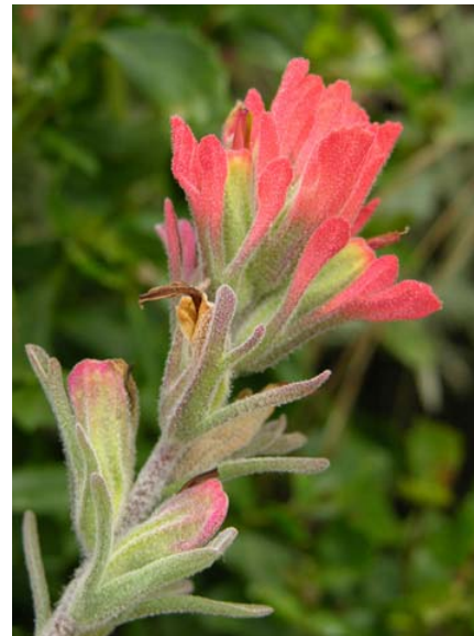
Woolly Paintbrush Castilleja foliolosa Native Perennial Snapdragon Family