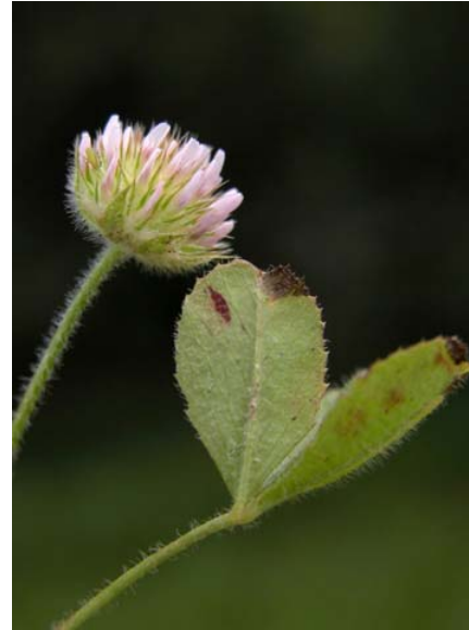
Small-head Clover Trifolium microcephalum Native Annual Pea Family