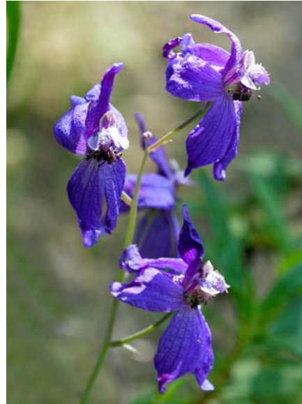
Royal Larkspur Delphinium variegatum ssp. variegatum Native Perennial Buttercup Family