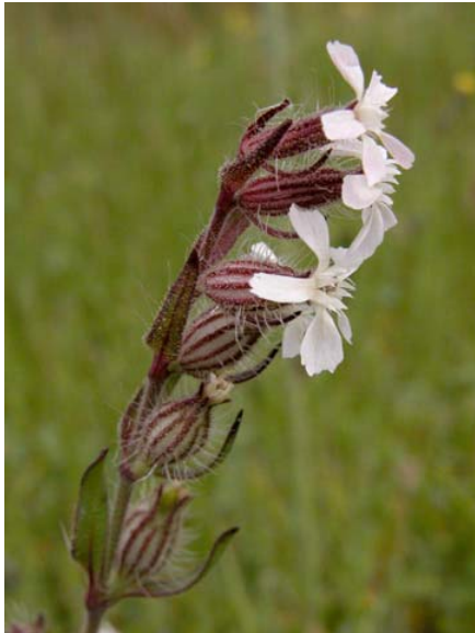
Windmill Pink Silene gallica Introduced Annual Pink Family