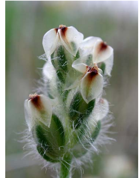
California Dwarf Plantain Plantago erecta Native Annual Plantain Family