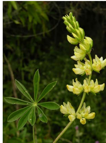
Gully Lupine Lupinus microcarpus var. densiflorus Native Annual Pea Family