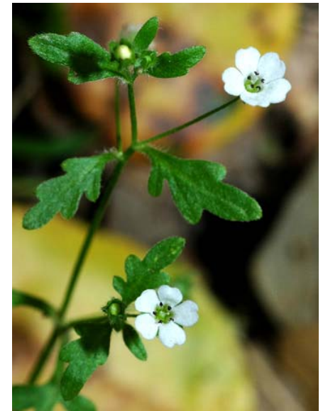
Variable-leaf Nemophila Nemophila heterophylla Native Annual Waterleaf Family