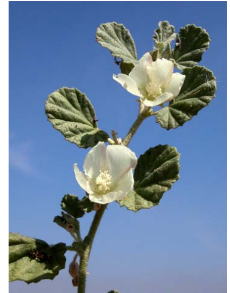
Alkali Mallow Malvella leprosa Native Perennial Mallow Family