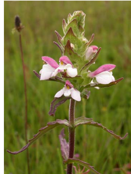
Bellardia Bellardia trixago Introduced Annual Snapdragon Family