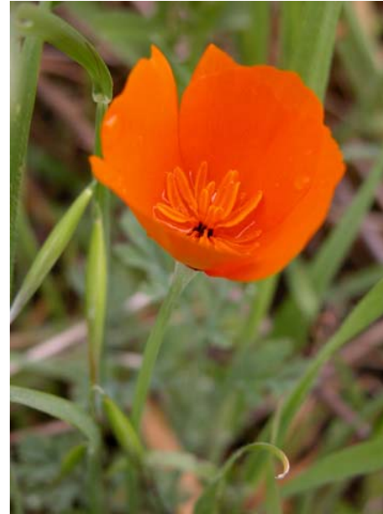
California Poppy Eschscholzia californica Native Perennial Poppy Family