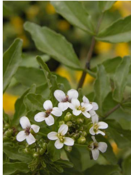
White Water Cress Rorippa nasturtium-aquaticum Native Perennial Mustard Family