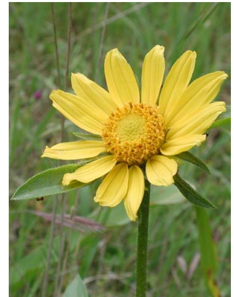
Mt. Diablo Helianthella Helianthella castanea Native Perennial Sunflower Family