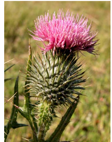
Bull Thistle Cirsium vulgare Introduced Biennial Sunflower Family