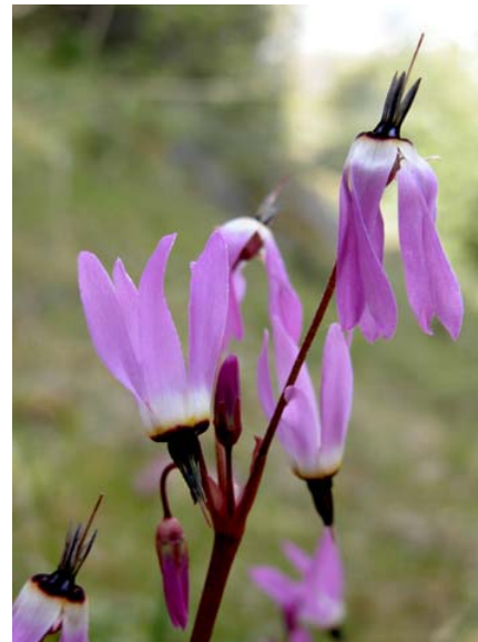
Mosquitobills Shooting Star Dodecatheon hendersonii Native Perennial Primrose Family