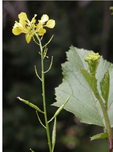
Yellow Charlock Sinapis arvensis Introduced Annual Mustard Family