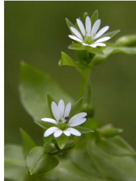
Common Chickweed Stellaria media Introduced Annual Pink Family