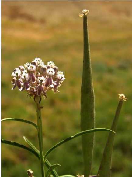
Whorled/Narrow-leaf Milkweed Asclepias fascicularis Native Perennial Milkweed Family