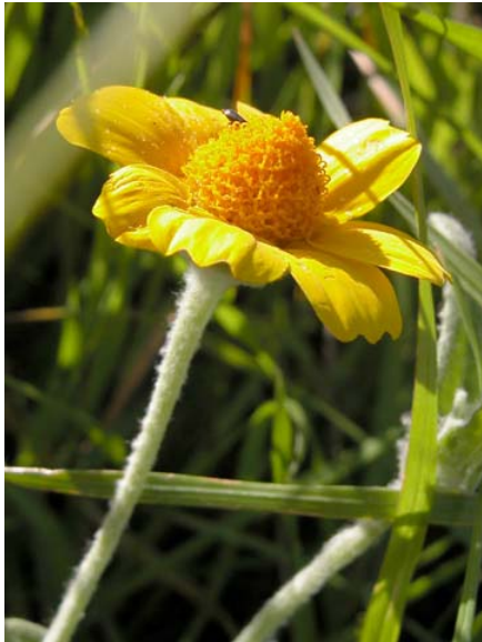
Cupped Monolopia Monolopia major Native Annual Sunflower Family