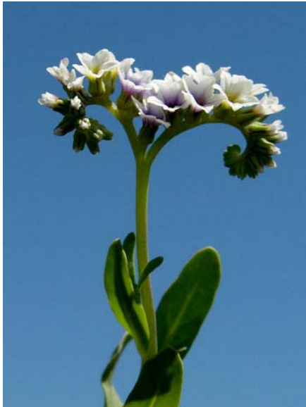
Seaside Heliotrope Heliotropium curassavicum Native Perennial Borage Family