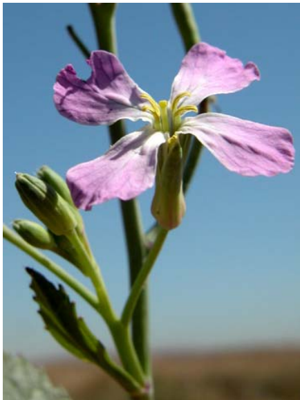
Wild Radish Raphanus sativus Introduced Annual Mustard Family