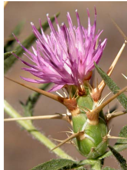
Purple Star Thistle Centaurea calcitrapa Introduced Annual-Biennial Sunflower Family