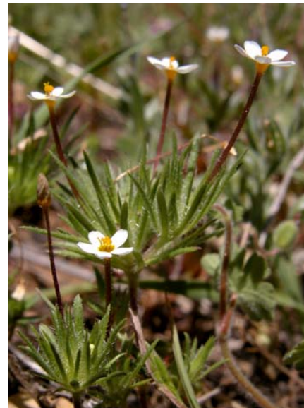
Bicolor Linanthus Linanthus bicolor Native Annual Phlox Family