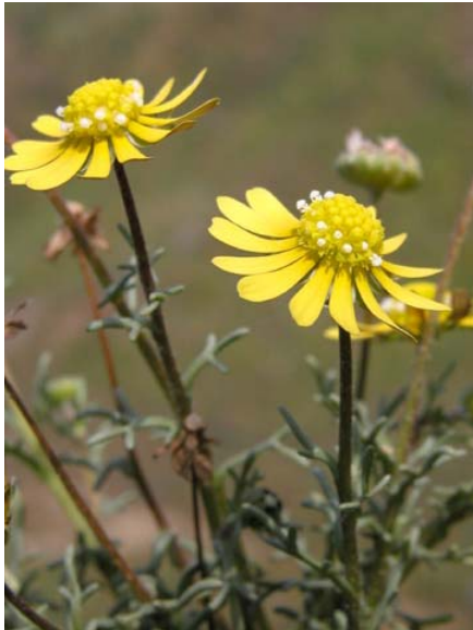
Glue-seed Blennosperma nanum var. nanum Native Annual Sunflower Family