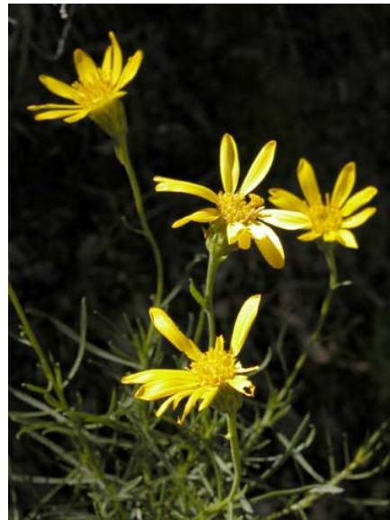
Interior Golden Bush Ericameria linearifolia Native Perennial Sunflower Family