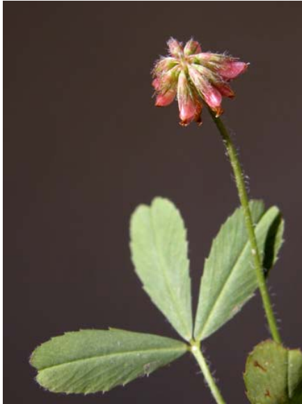
Tree Clover Trifolium ciliolatum Native Annual Pea Family