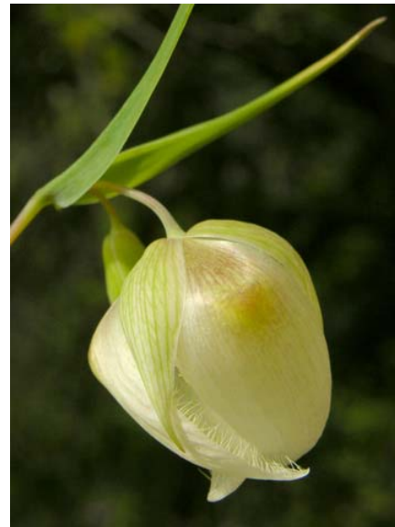
White Fairy Lantern Calochortus albus Native Perennial Lily Family