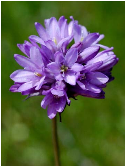
Ookow Dichelostemma congestum Native Perennial Lily Family