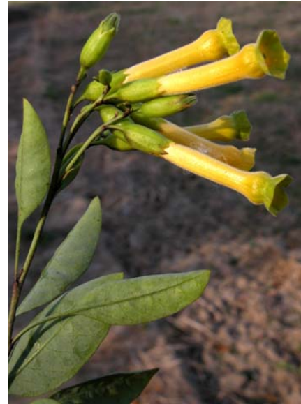
Tree Tobacco Nicotiana glauca Introduced Perennial Nightshade Family