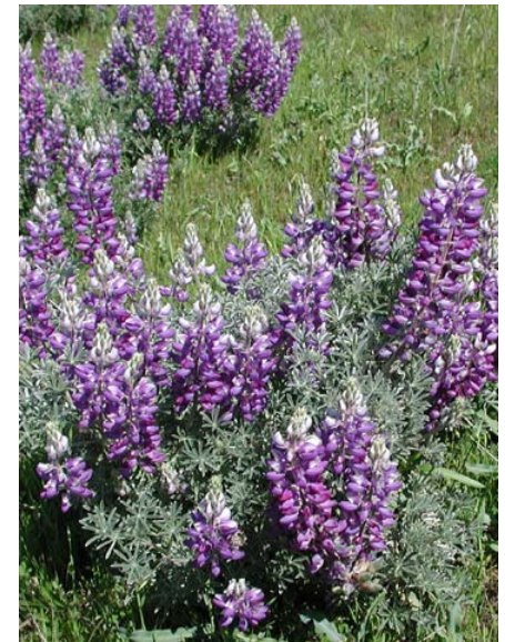
Blue Bush / Silver Lupine Lupinus albifrons var. albifrons Native Perennial Pea Family