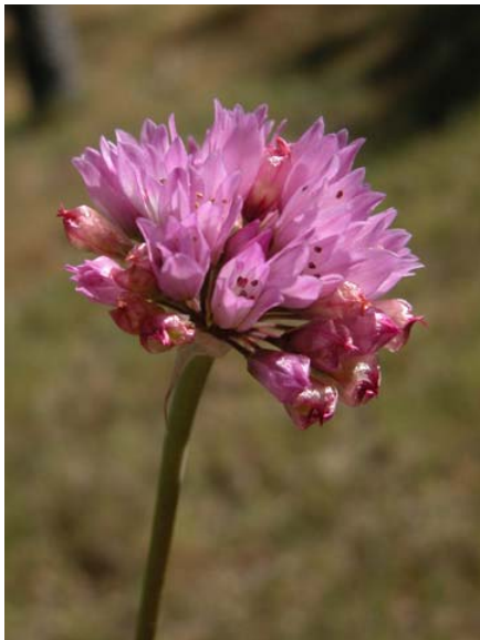
Pink / Serrated Onion Allium serra Native Perennial Lily Family