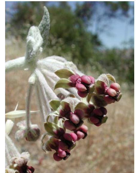
California Milkweed Asclepias californica Native Perennial Milkweed Family