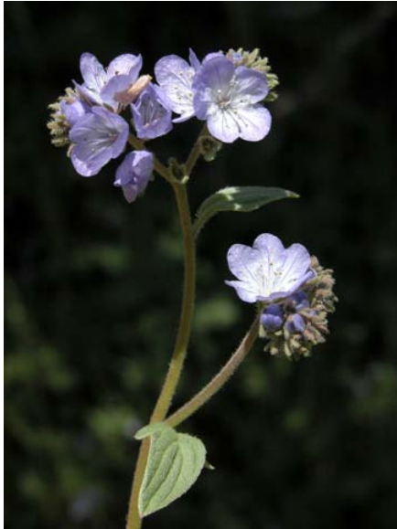
Brewer Phacelia Phacelia breweri Native Perennial Waterleaf Family