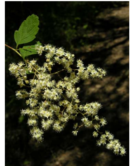
Creambush / Ocean Spray Holodiscus discolor Native Perennial Rose Family