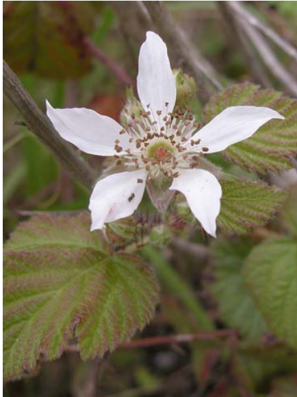
Native California Blackberry Rubus ursinus Native Perennial Rose Family