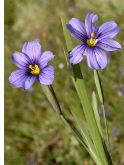
Blue-eyed Grass Sisyrinchium bellum Native Perennial Iris Family