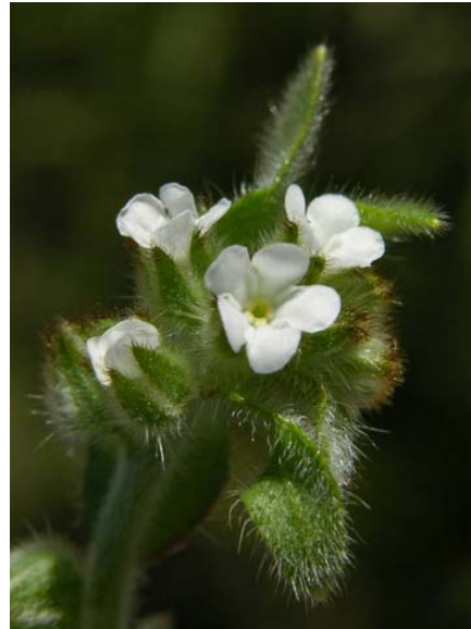
Valley Popcorn Flower Plagiobothrys canescens Native Annual Borage Family