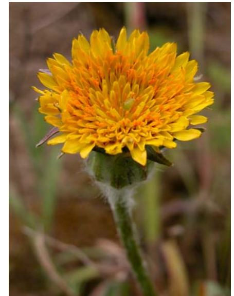
Large-flower Native Dandelion Agoseris grandiflora Native Perennial Sunflower Family