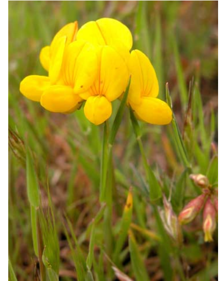
Bird's-foot Deerweed Lotus corniculatus Introduced Perennial Pea Family