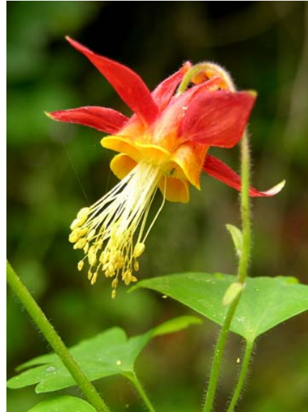
Red / Crimson Columbine Aquilegia formosa Native Perennial Buttercup Family