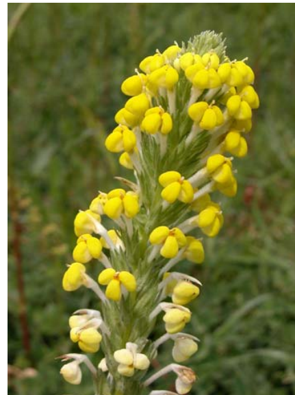
Yellow Johnny-tuck Triphysaria eriantha ssp. eriantha Native Annual Snapdragon Family