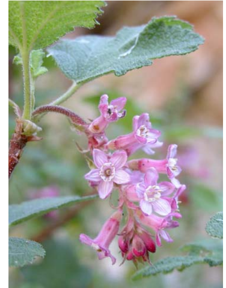
Chaparral Currant Ribes malvaceum var. malvaceum Native Perennial Gooseberry Family