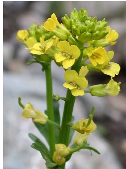
Erect-pod Winter Cress Barbarea orthoceras Native Perennial Mustard Family