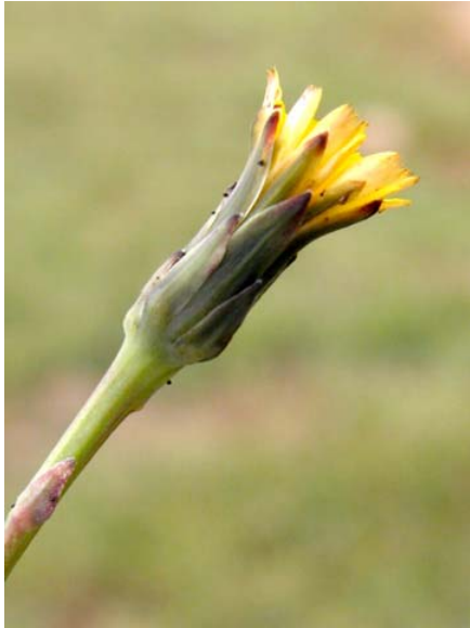
Smooth Cat's-ear Hypochaeris glabra Introduced Annual Sunflower Family