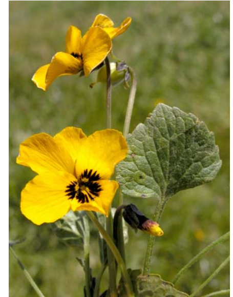
Johnny-Jump-Up / Wild Pansy Viola pedunculata Native Perennial Violet Family