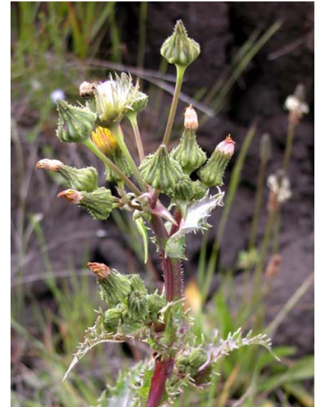
Prickly Sow Thistle Sonchus asper ssp. asper Introduced Annual Sunflower Family