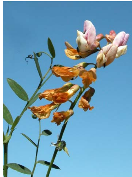
Pale Purple Pacific Pea Lathyrus vestitus var. vestitus Native Perennial Pea Family