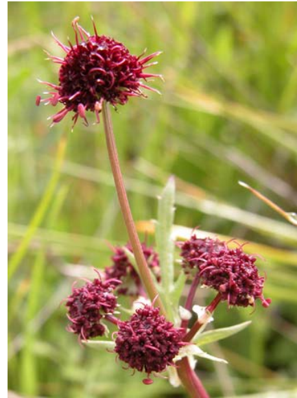
Purple Sanicle Sanicula bipinnatifida Native Perennial Carrot Family