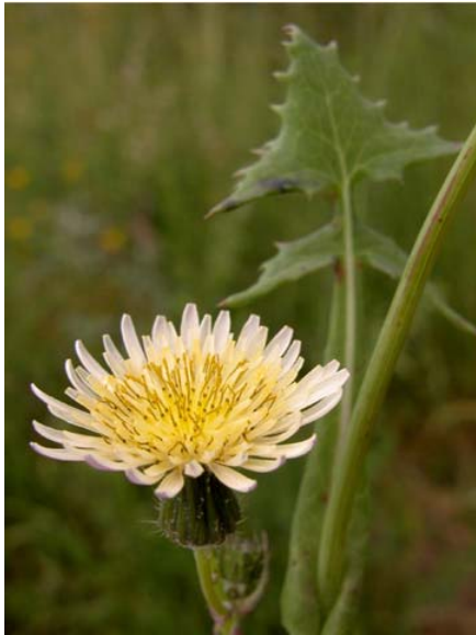
Common Sow Thistle Sonchus oleraceus Introduced Annual Sunflower Family