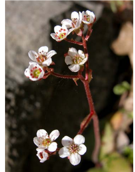
California Saxifrage Saxifraga californica Native Perennial Saxifrage Family