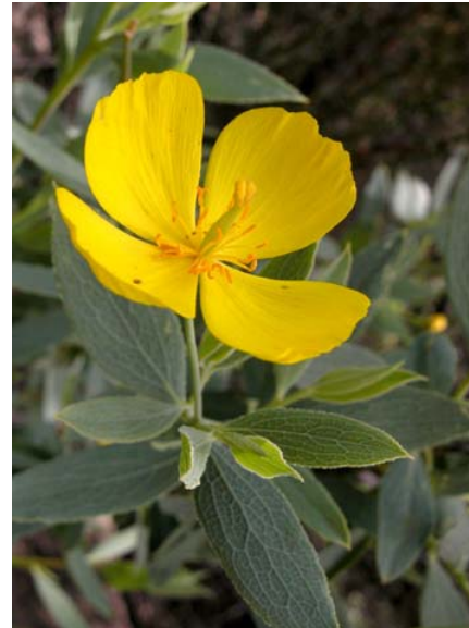
Bush Poppy Dendromecon rigida Native Perennial Poppy Family