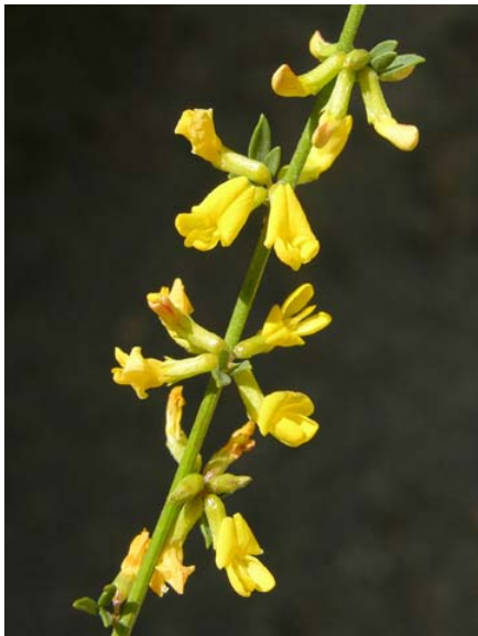
Deerweed Lotus scoparius var. scoparius Native Perennial Pea Family