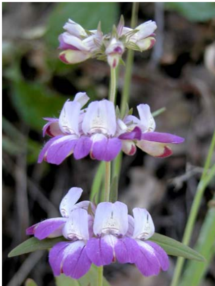
Chinese Houses Collinsia heterophylla Native Annual Snapdragon Family