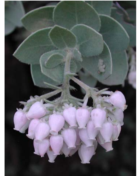
Mt. Diablo Manzanita Arctostaphylos auriculata Native Perennial Heath Family