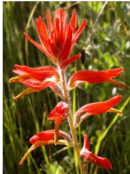
Common Indian Paintbrush Castilleja affinis ssp. affinis Native Perennial Snapdragon Family