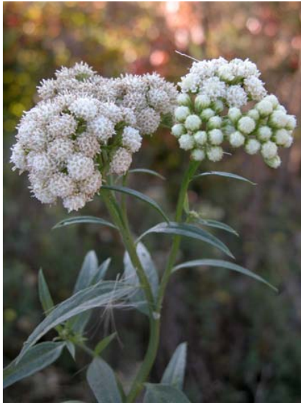
Douglas/Salt Marsh Baccharis Baccharis douglasii Native Perennial Sunflower Family