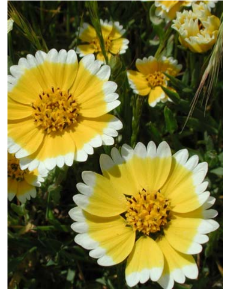
Common Tidytip Layia platyglossa Native Annual Sunflower Family