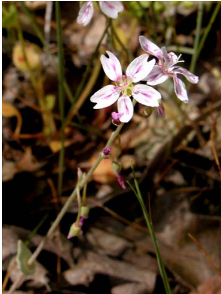
Common Pale Claytonia Claytonia exigua ssp. exigua Native Annual Purslane Family