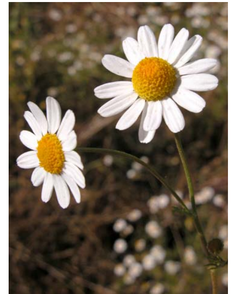
Mayweed Anthemis cotula Introduced Annual Sunflower Family