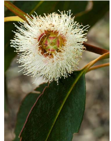
Blue Gum Eucalyptus globulus Introduced Perennial Myrtle Family