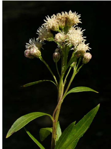
Mulefat Baccharis salicifolia Native Perennial Sunflower Family