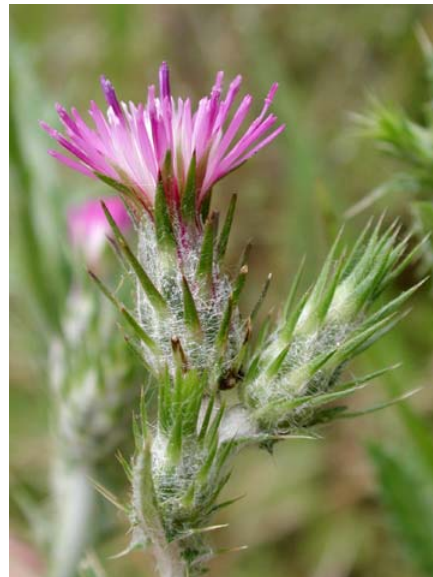
Italian Thistle Carduus pycnocephalus Introduced Annual Sunflower Family