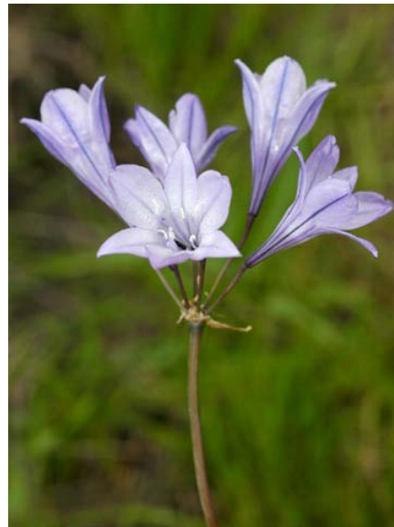
Ithuriel's Spear Triteleia laxa Native Perennial Lily Family