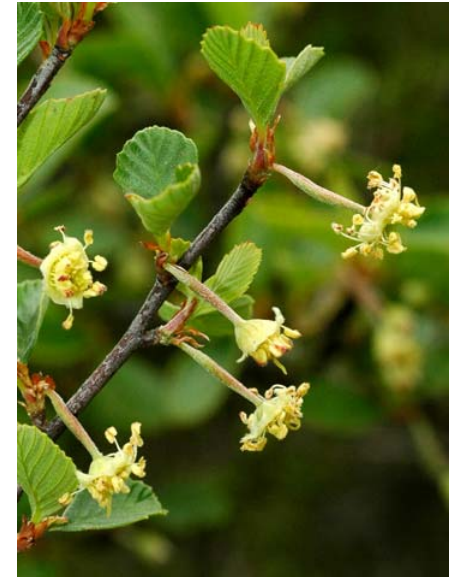
Birch-leaf Mt. Mahogany Cercocarpus betuloides var. betuloides Native Perennial Rose Family