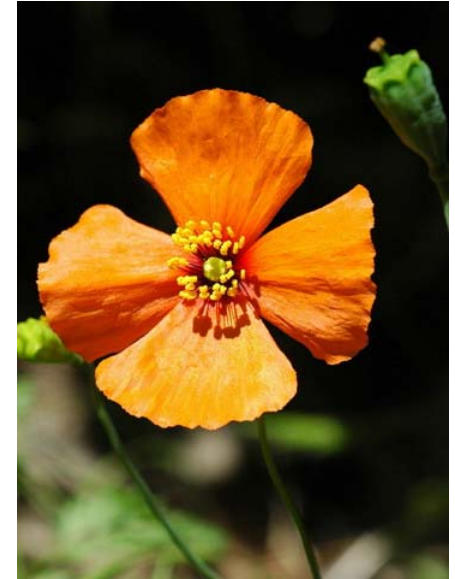
Wind Poppy Stylomecon heterophylla Native Annual Poppy Family