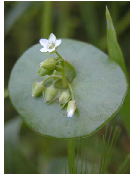
Common Miner's Lettuce Claytonia perfoliata ssp. perfoliata Native Annual Purslane Family