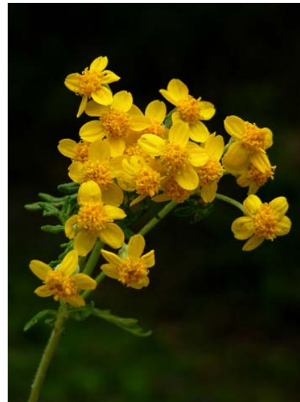
Golden Yarrow Eriophyllum confertiflorum var. confertiflorum Native Perennial Sunflower Family