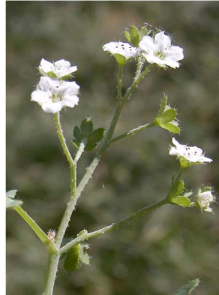
White Fiesta Flower Pholistoma membranaceum Native Annual Waterleaf Family