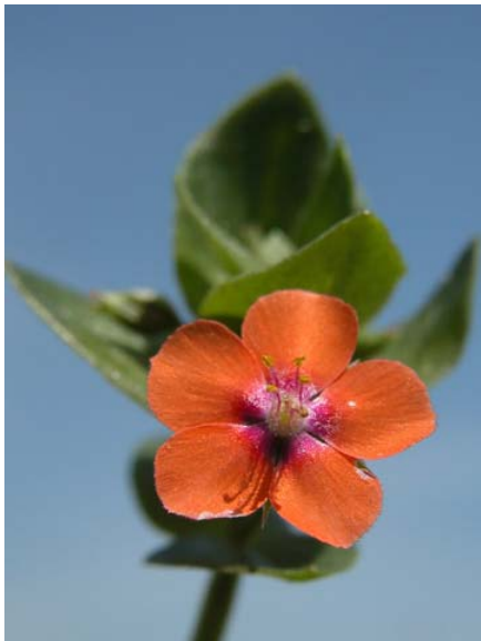
Scarlet Pimpernel Anagallis arvensis Introduced Annual Primrose Family