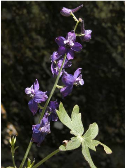
Coast Larkspur Delphinium decorum ssp. decorum Native Perennial Buttercup Family