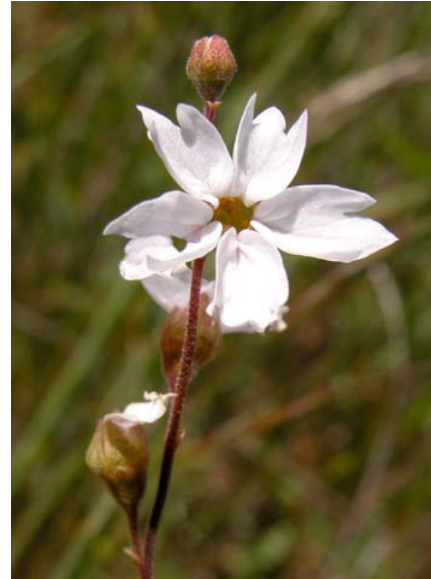
Woodland Star Lithophragma affine Native Perennial Saxifrage Family