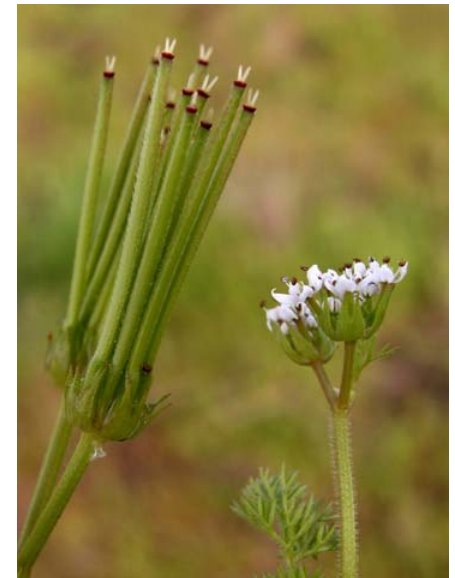
Shepherd's Needle Scandix pecten-veneris Introduced Annual Carrot Family