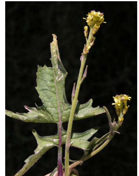
Black Mustard Brassica nigra Introduced Annual Mustard Family