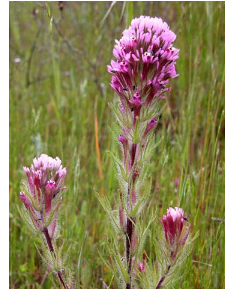
Purple Owl's Clover Castilleja exserta ssp. exserta Native Annual Snapdragon Family