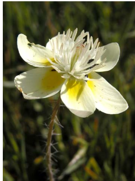
Cream Cups Platystemon californicus Native Annual Poppy Family