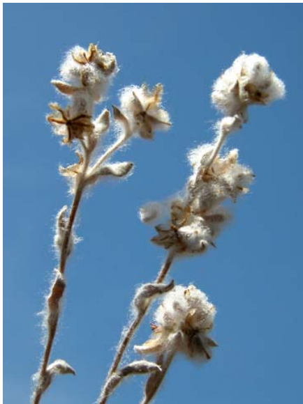
Slender Cottonweed Micropus californicus var. californicus Native Annual Sunflower Family