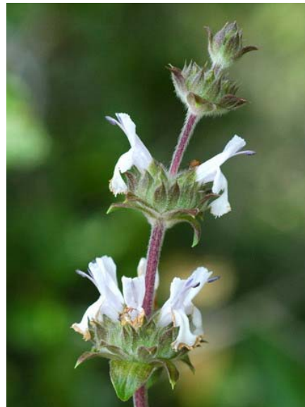
Black Sage Salvia mellifera Native Perennial Mint Family