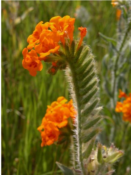
Largeflower Fiddleneck Amsinckia grandiflora Native Annual Borage Family