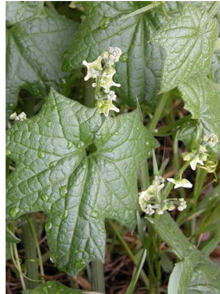
Common / California Manroot Marah fabaceus Native Perennial Gourd Family