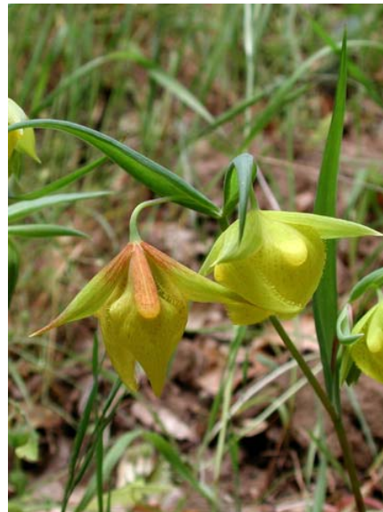
Mt. Diablo Fairy Lantern Calochortus pulchellus Native Perennial Lily Family