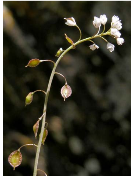
Hairy Fringe-pod Thysanocarpus curvipes Native Annual Mustard Family