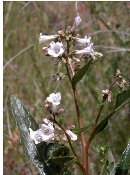
Yerba Santa Eriodictyon californicum Native Perennial Waterleaf Family