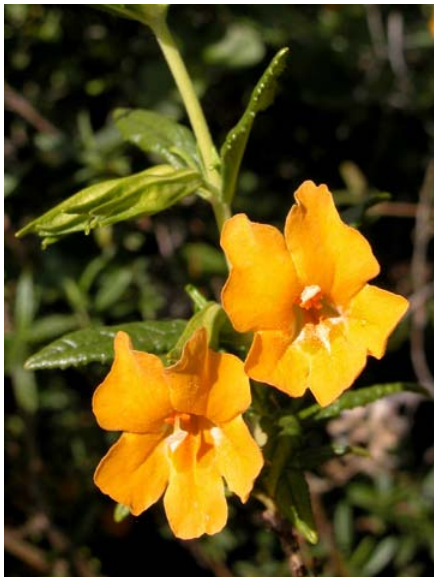
Bush Monkey Flower Mimulus aurantiacus Native Perennial Snapdragon Family