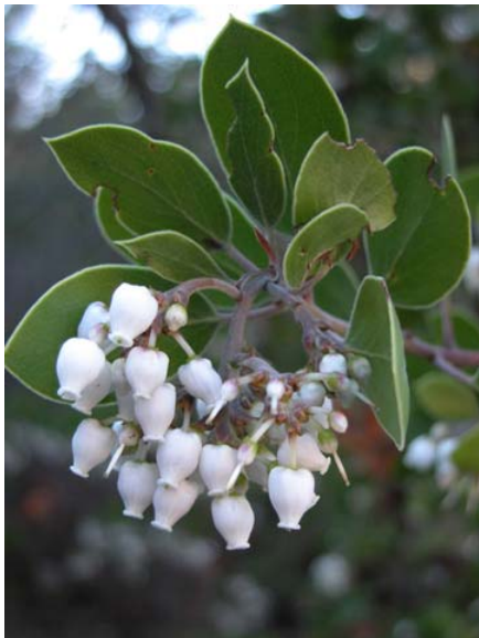
Common / Giant Manzanita Arctostaphylos manzanita ssp. manzanita Native Perennial Heath Family