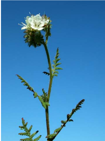
Wild Heliotrope Phacelia Phacelia distans Native Annual Waterleaf Family