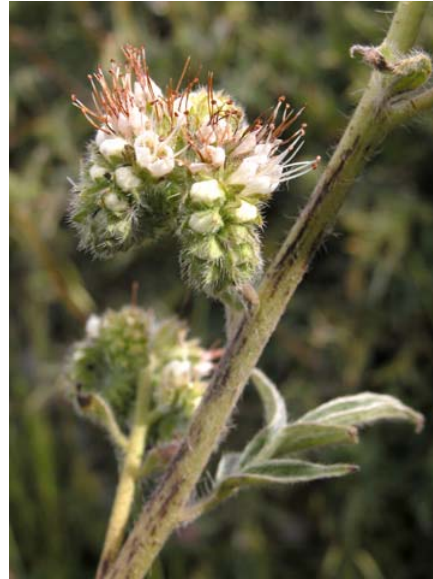
Rock Phacelia Phacelia imbricata ssp. imbricata Native Perennial Waterleaf Family