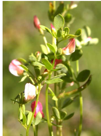
Spanish Clover Lotus purshianus var. purshianus Native Annual Pea Family