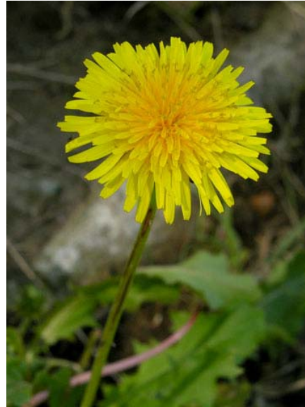
Common Dandelion Taraxacum officinale Introduced Biennial-Perennial Sunflower Family