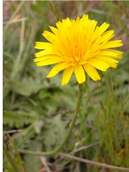
Rough Cat's-ear Hypochaeris radicata Introduced Perennial Sunflower Family