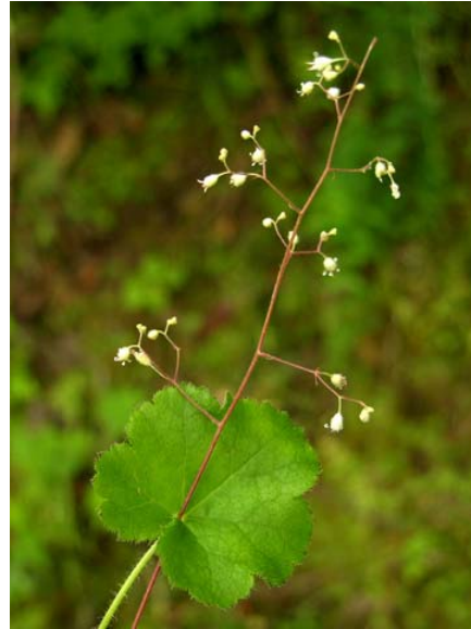
Small-flower Alumroot Heuchera micrantha Native Perennial Saxifrage Family