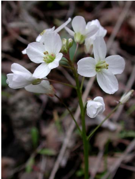
Milkmaids Cardamine californica Native Perennial Mustard Family