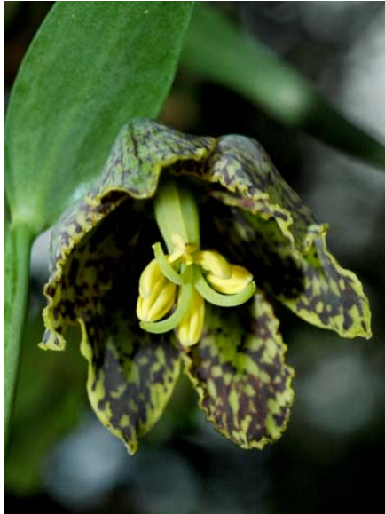
Checker Lily Fritillaria affinis var. affinis Native Perennial Lily Family