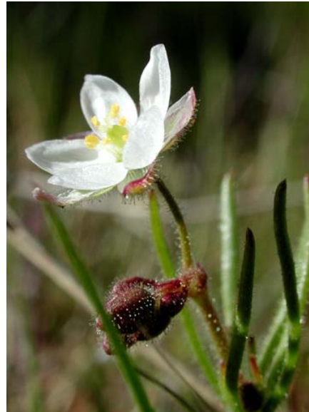
Stickwort Spergula arvensis ssp. arvensis Introduced Annual Pink Family