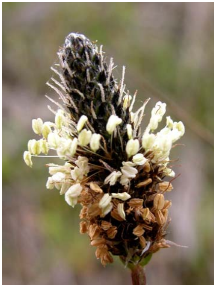
English Plantain Plantago lanceolata Introduced Annual Plantain Family