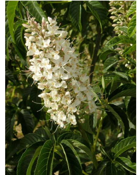
California Buckeye Aesculus californica Native Perennial Buckeye Family