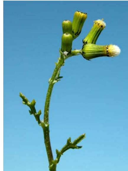
Common Groundsel Senecio vulgaris Introduced Annual Sunflower Family