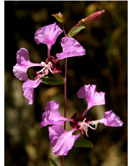
Elegant Clarkia Clarkia unguiculata Native Annual Evening Primrose Family