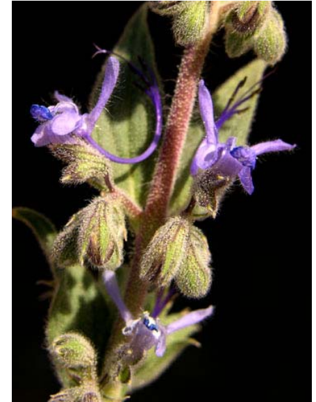
Vinegar Weed Trichostema lanceolatum Native Annual Mint Family