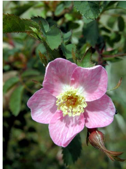
California Wild Rose Rosa californica Native Perennial Rose Family