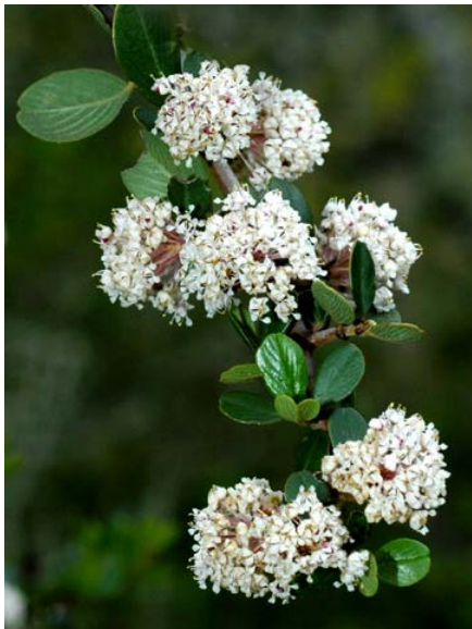
Buckbrush Ceanothus cuneatus var. cuneatus Native Perennial Buckthorn Family