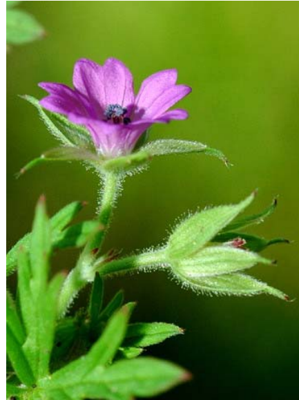
Purpletip Cut-leaf Geranium Geranium dissectum Introduced Annual Geranium Family