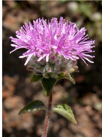
Common Coyotemint Monardella villosa ssp. villosa Native Perennial Mint Family