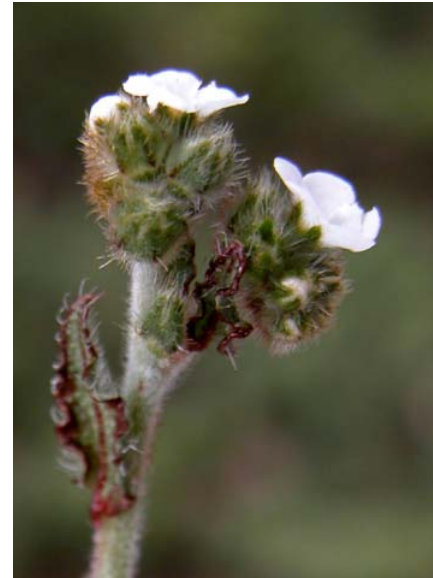
Nievitas Popcorn Flower Plagiobothrys nothofulvus Native Annual Borage Family