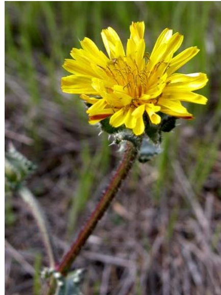
Bristly Ox-tongue Picris echinoides Introduced Annual-Biennial Sunflower Family