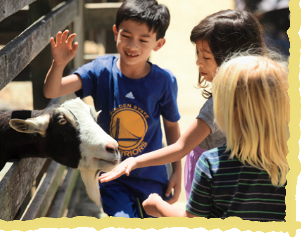
Above: Young visitors enjoy educational opportunities at the Little Farm. Funds from Measure CC supported improvements to the popular attraction.