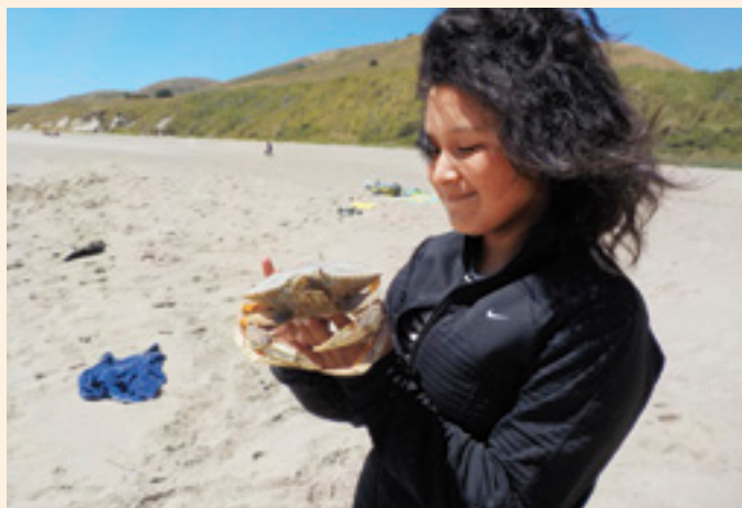
Clockwise from left: Richmond Rangers enjoying the Ohlone Wilderness, Radke Martinez Regional Shoreline and Point Reyes National Seashore.

The program loans hiking and camping gear to participants, provides food and transportation for the outings, and hosts