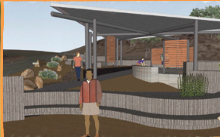
Early concept architectural renderings of the planned interpretive pavilion at Shadow Cliffs Regional Recreation Area in Pleasanton (final design may differ).