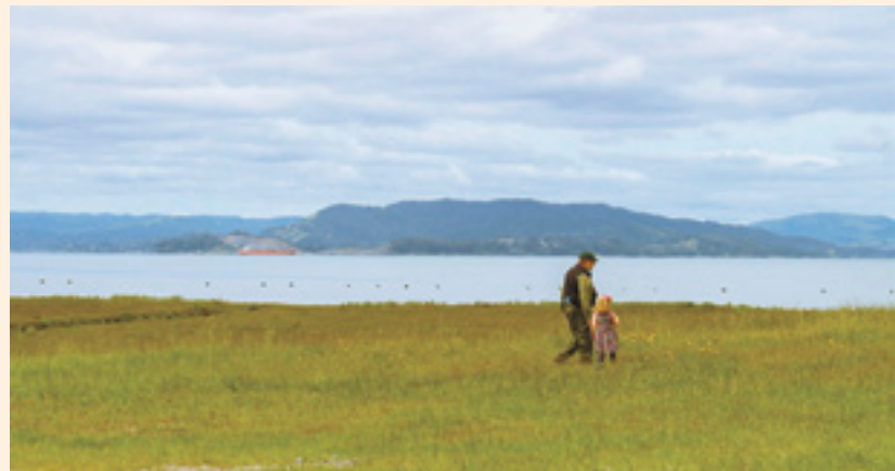
Top to bottom: Winter brings monarch butterflies to Ardenwood; all-ages hikes at Tilden Regional Park; exploring the Dotson Family Marsh; a migrating newt on parade.

Nature lovers may also enjoy the migrating newts. The Park District closes South Park Drive at Tilden Regional Park during the winter to help protect the newts as they head to the water to lay their eggs. Visitors can park near the road and look for parading newts during or just after a period of rain.