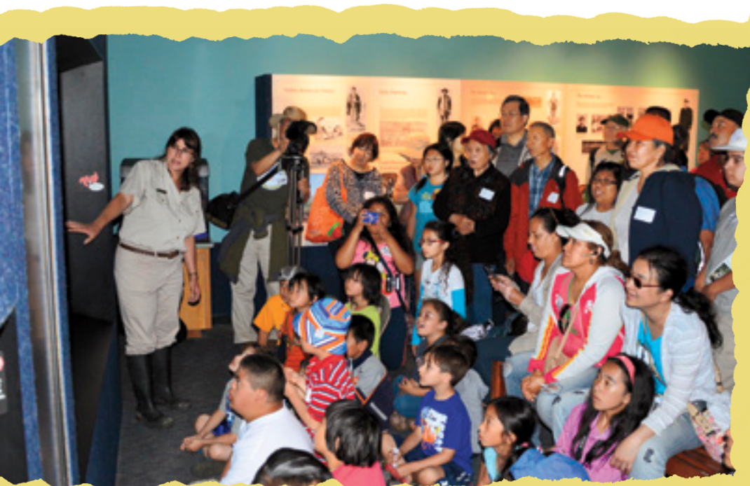
Below: A Multicultural Awareness Day at Crab Cove Visitor Center, which is staffed year-round with the help of Measure CC funds.