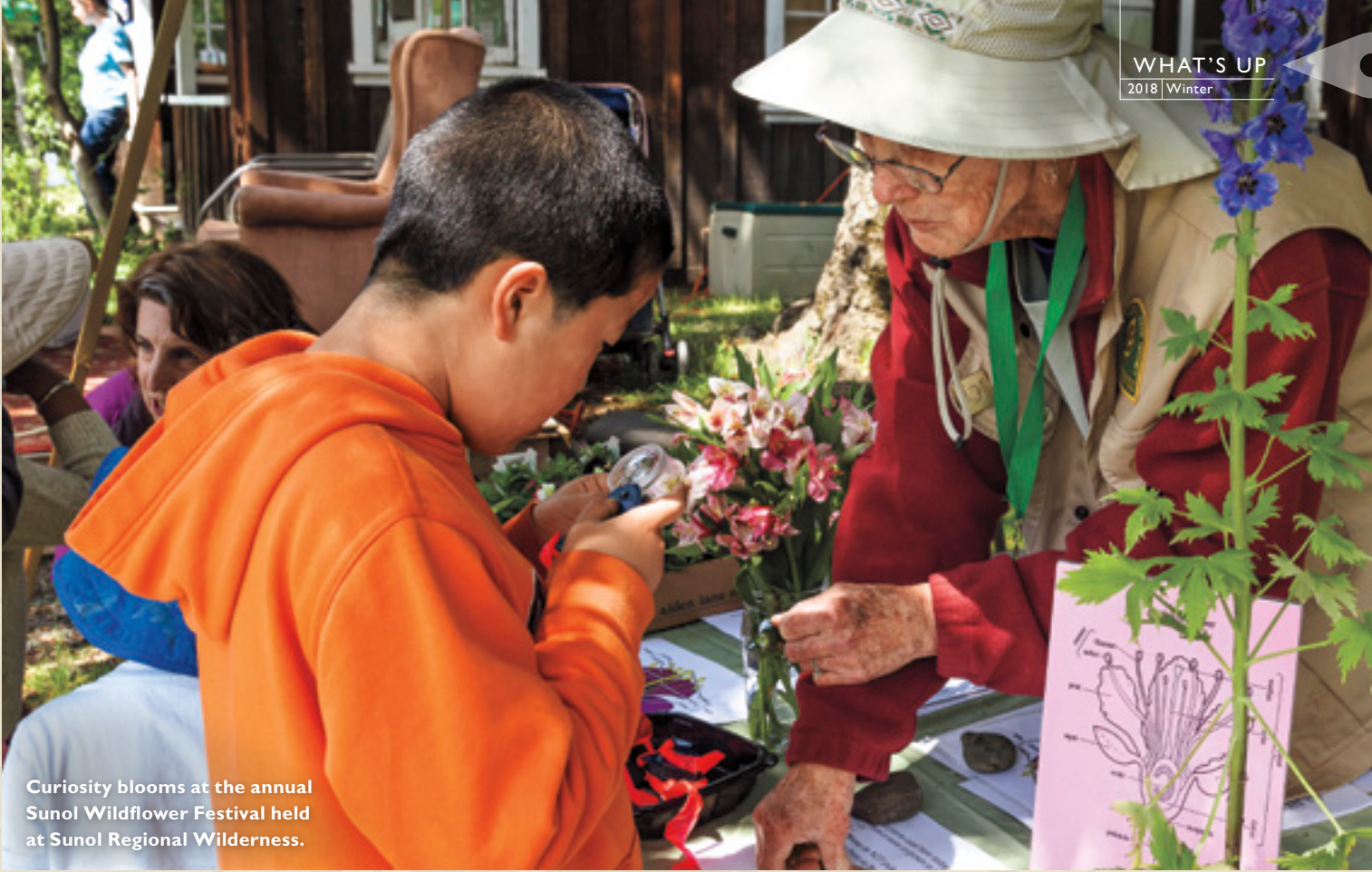
Curiosity blooms at the annual Sunol Wildflower Festival held at Sunol Regional Wilderness.