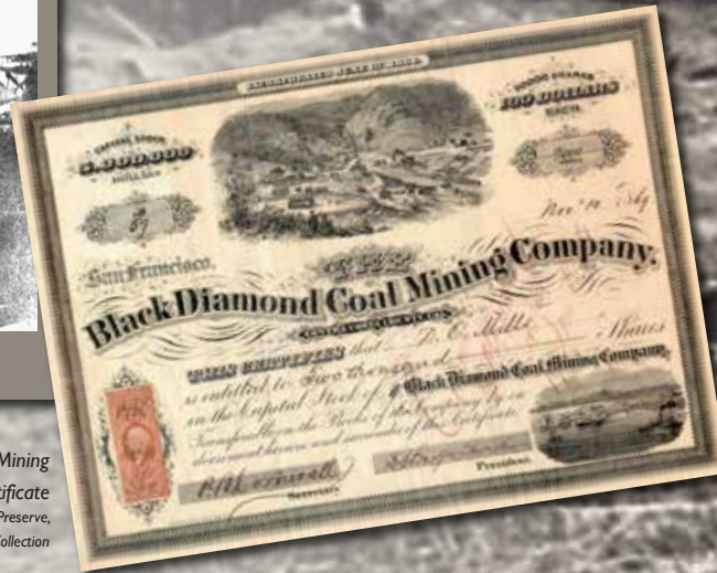
Black Diamond Coal Mining Company Stock Certificate