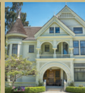
Patterson House tours