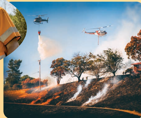
EBRPD and CAL FIRE extinguish an urban interface wildfire

The role of firefighters across the state is critical for the safety of all Californians. The Park District's Fire Department is an important component of overall parkland operations, as well as the region's public safety. This is especially significant considering many of the Park District's lands are in the WUI. The Park District is uniquely situated to fight fires with wildland scale equipment and infrastructure – including helicopter water dropping capability. During wildfire events, two helicopters stand ready to protect our natural resources, whether on parklands, or in neighboring communities. Continued resources are needed for fire suppression equipment, as well as mitigation.