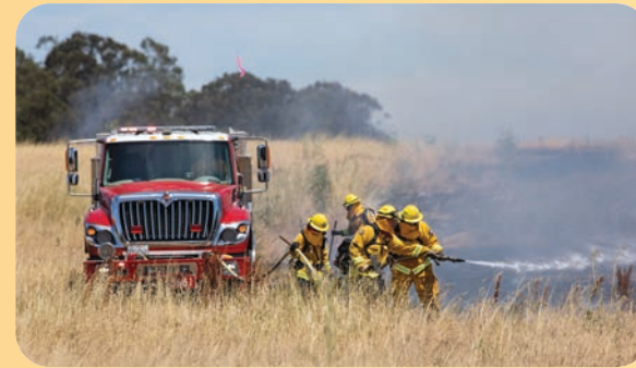
EBRPD firefighters battle a wildfire