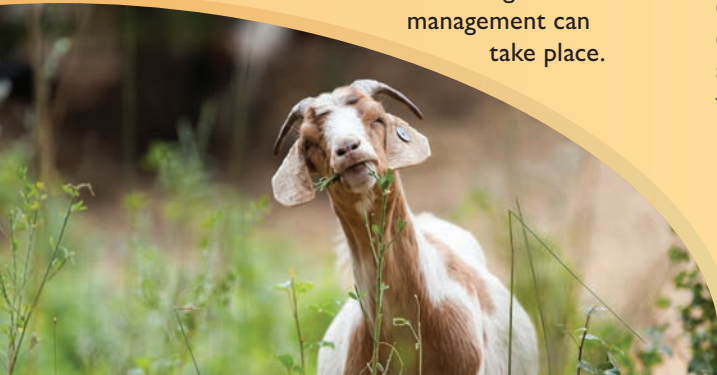
Cattle, sheep and goats provide effective vegetation management in Park District grasslands

Managing natural resources for endangered and threatened species can create challenges regarding where and when vegetation management can take place.