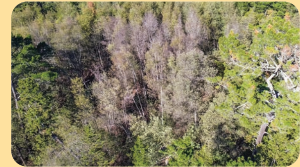
Aerial views of pine and redwood die off

Since October 2020, the Park District has been impacted by a sudden onset of tree mortality and dieback on over 1,500 acres of parklands. The suspected cause of tree mortality include impacts of drought, extreme heat and/or newly introduced pathogens due to climate change. Dead and dying