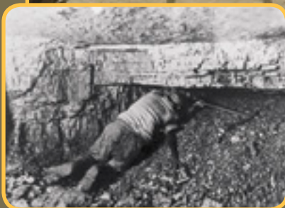
Above: The coal mine exhibit under construction off-site. Left: Park District staff referenced historic photos for the exhibit.