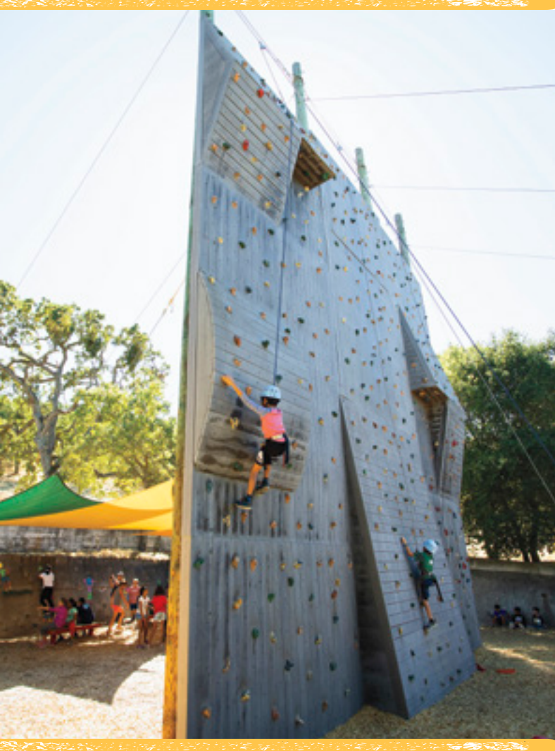
Adventure awaits with zip lines and climbing walls.

environment. The students may learn how they can integrate conservation into their daily lives and hone their team-building skills on a ropes course or by performing skits together onstage.