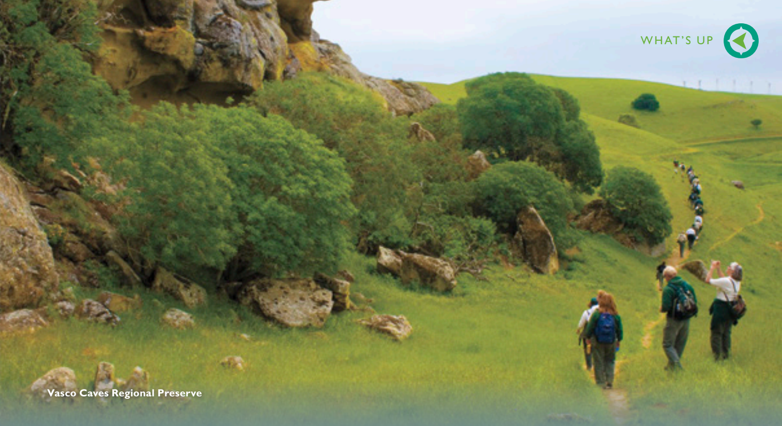
Vasco Caves Regional Preserve