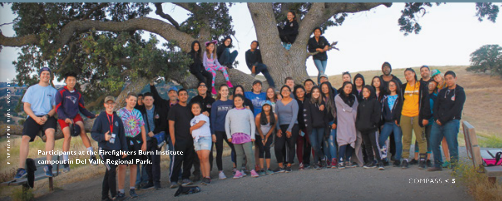
Participants at the Firefighters Burn Institute campout in Del Valle Regional Park.