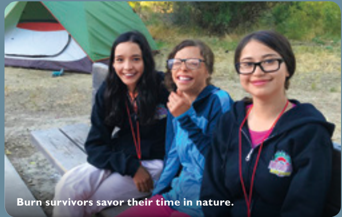
Burn survivors savor their time in nature.