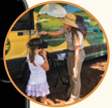
Students enjoy virtual park tours using cardboard viewers and the Timelooper app, as well as a VR headset on the mobile visitor center.