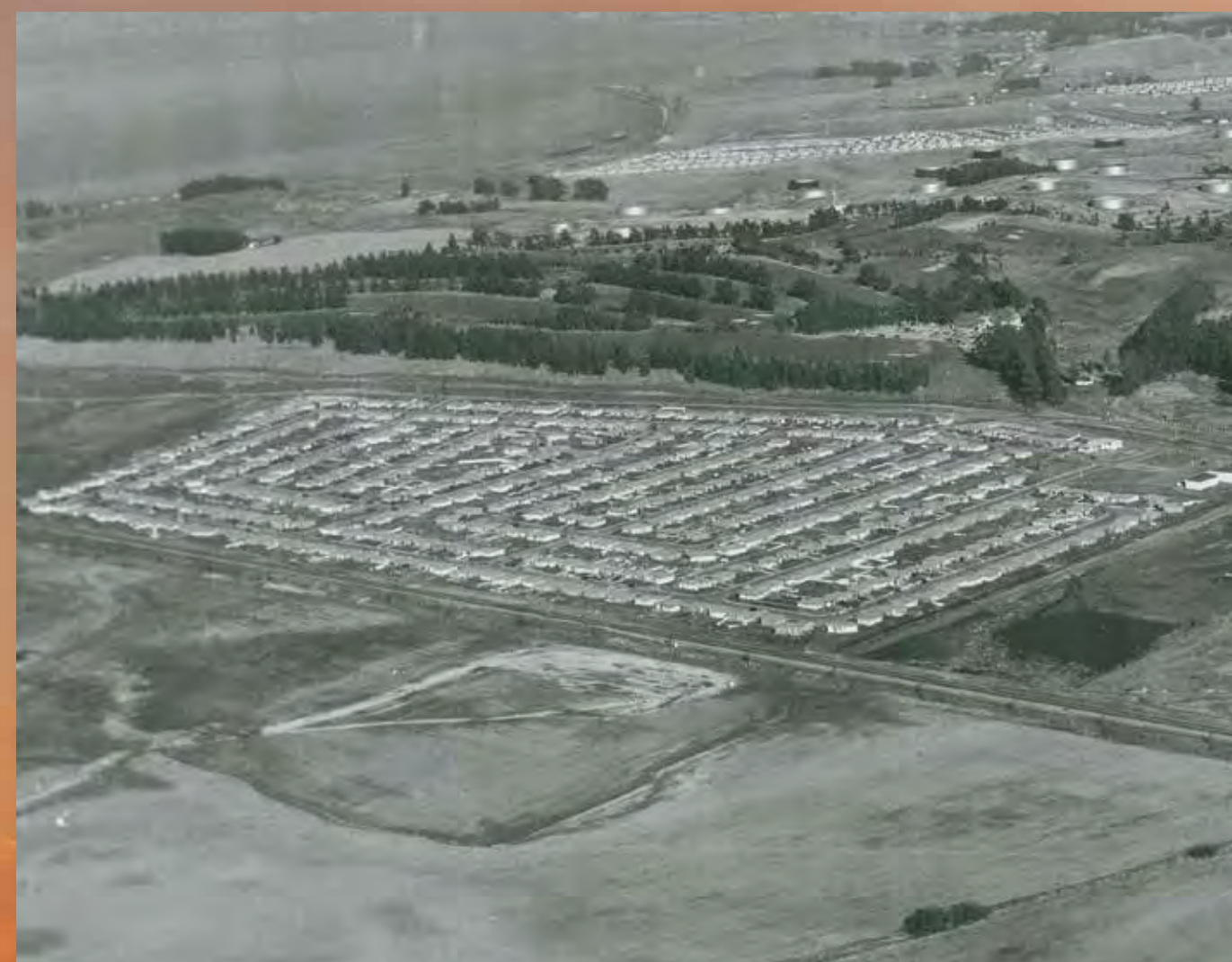
1950s aerial view of Parchester Village

The name of this park pays tribute to the great contributions of the Dotson Family.