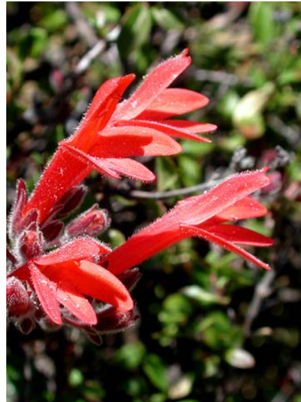
California Fuchsia Epilobium canum ssp. canum Native Perennial Evening Primrose Family