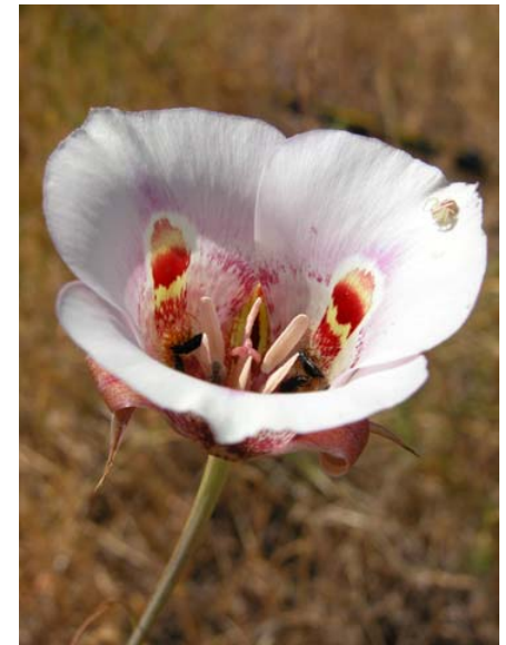
White Butterfly Mariposa Lily Calochortus venustus Native Perennial Lily Family