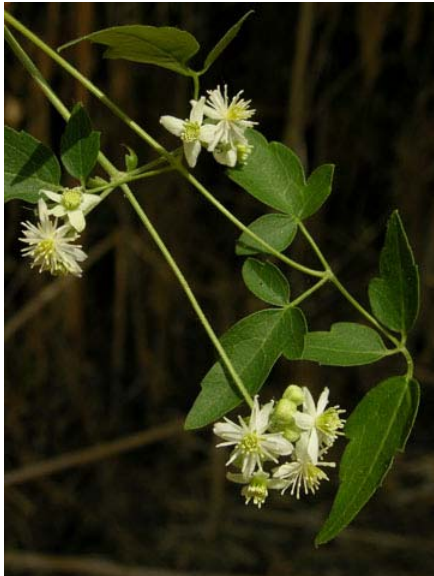
Western Virgin's Bower Clematis ligusticifolia Native Perennial Buttercup Family