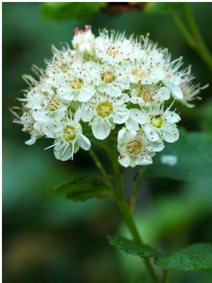
Pacific Ninebark Physocarpus capitatus Native Perennial Rose Family