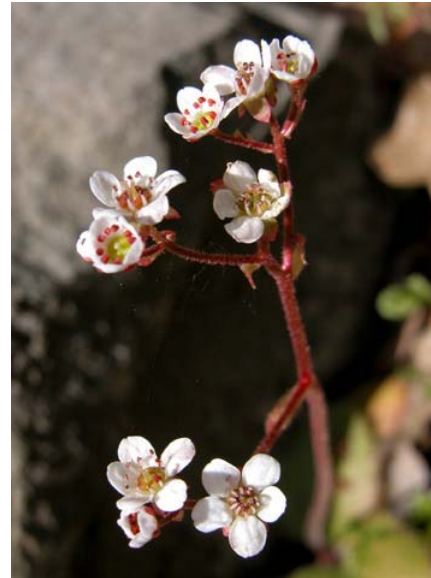
California Saxifrage Saxifraga californica Native Perennial Saxifrage Family