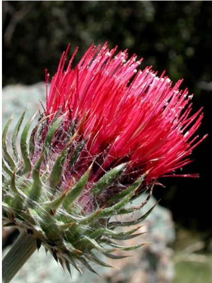
Venus / Cobweb Thistle Cirsium occidentale var. venustum Native Biennial Sunflower Family