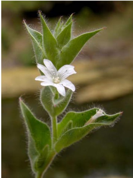
Dense-flower Willowherb Epilobium densiflorum Native Annual Evening Primrose Family