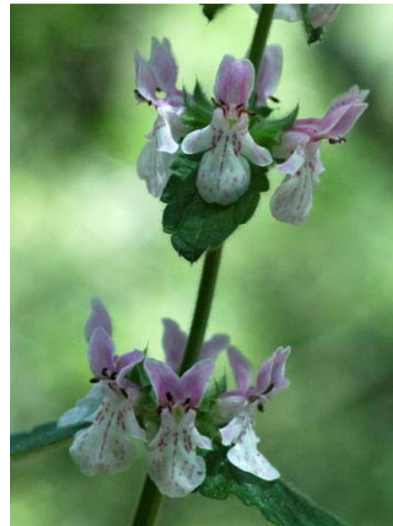
Common Rigid Hedge Nettle Stachys ajugoides var. rigida Native Perennial Mint Family