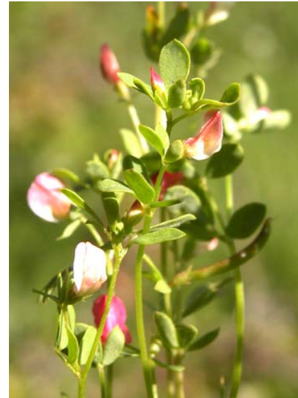
Spanish Clover Lotus purshianus var. purshianus Native Annual Pea Family