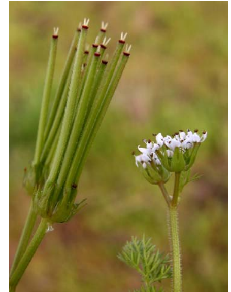
Shepherd's Needle Scandix pecten-veneris Introduced Annual Carrot Family