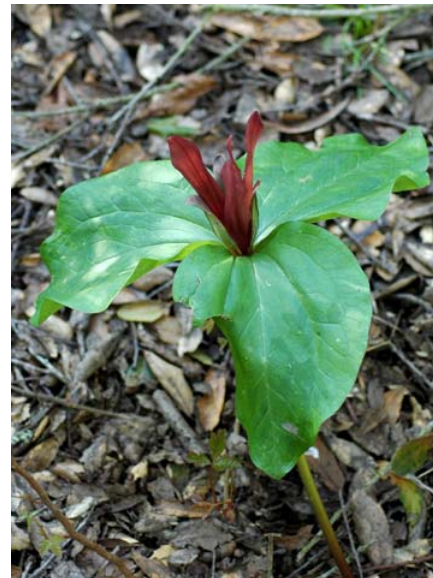
Giant Trillium Trillium chloropetalum Native Perennial Lily Family