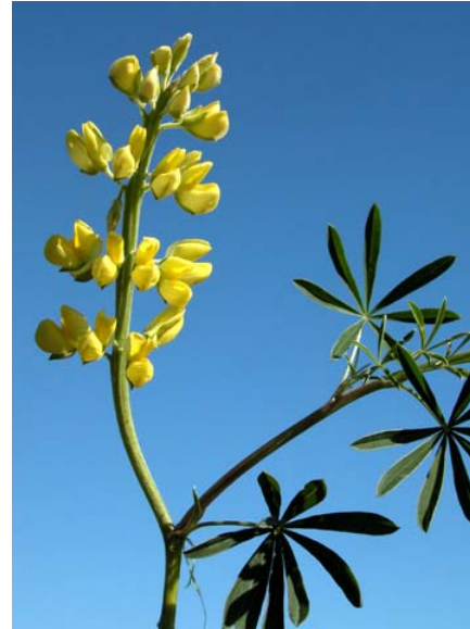
Yellow Bush Lupine Lupinus arboreus Native Perennial Pea Family