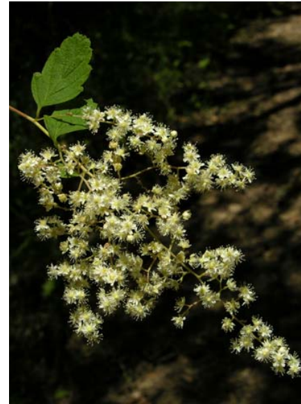
Creambush / Ocean Spray Holodiscus discolor Native Perennial Rose Family