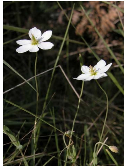
California Meconella Meconella californica Native Annual Poppy Family