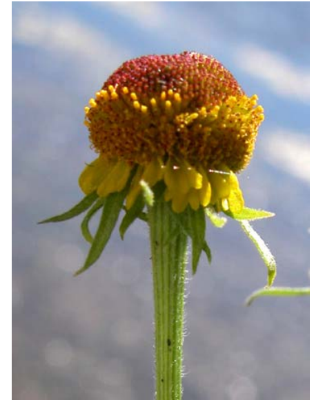
Rosilla Helenium puberulum Native Biennial Sunflower Family