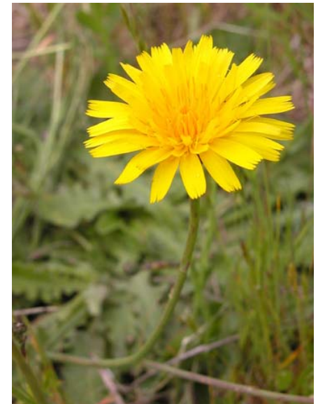
Rough Cat's-ear Hypochaeris radicata Introduced Perennial Sunflower Family