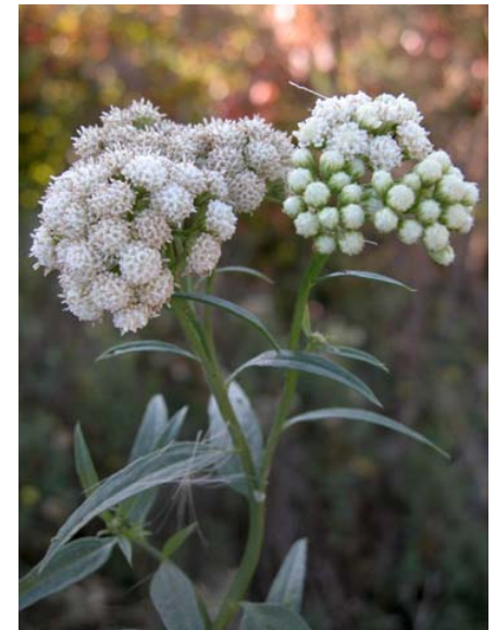
Douglas/Salt Marsh Baccharis Baccharis douglasii Native Perennial Sunflower Family