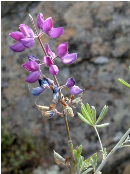
Bay Area Silver Lupine Lupinus albifrons var. collinus Native Perennial Pea Family