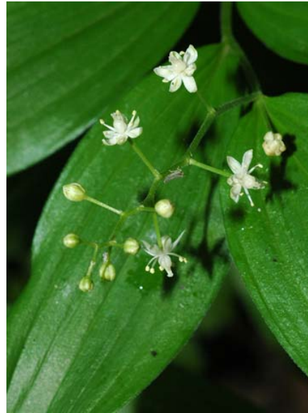
Starry False Solomon's Seal Smilacina stellata Native Perennial Lily Family