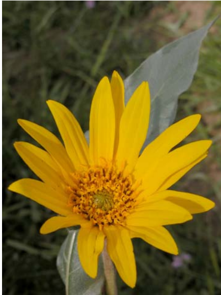
Narrow-leaf Mule's Ear Wyethia angustifolia Native Perennial Sunflower Family