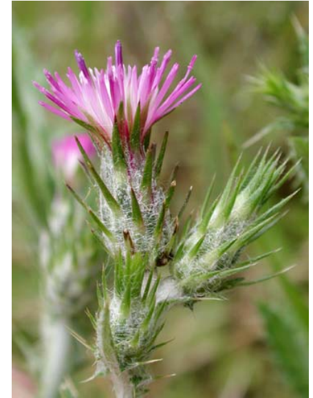
Italian Thistle Carduus pycnocephalus Introduced Annual Sunflower Family