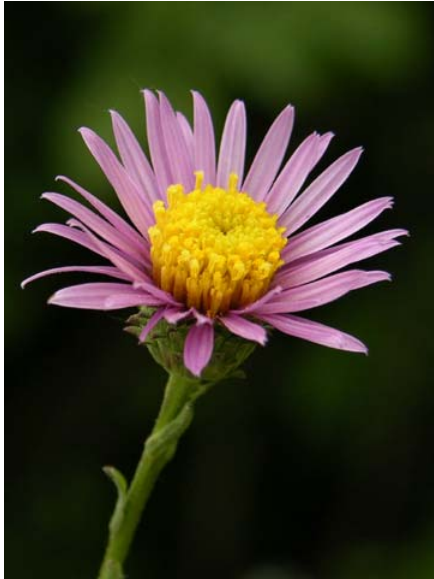
Common Lessingia Lessingia filaginifolia var. filaginifolia Native Perennial Sunflower Family