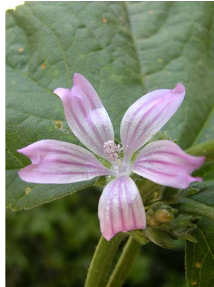
Bull Mallow Malva nicaeensis Introduced Annual Mallow Family