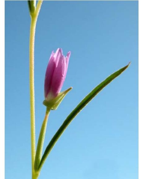
Small Clarkia Clarkia affinis Native Annual Evening Primrose Family