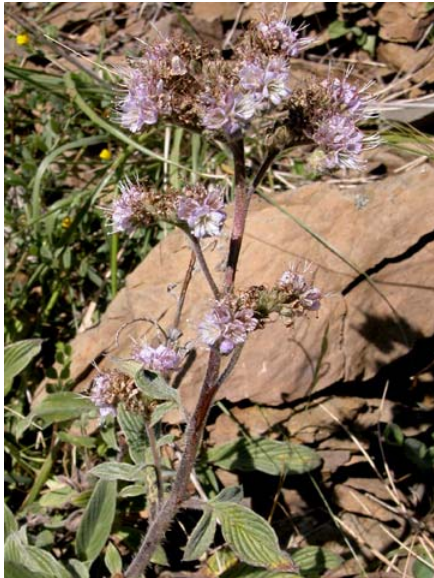
California / Rock Phacelia Phacelia californica Native Perennial Waterleaf Family