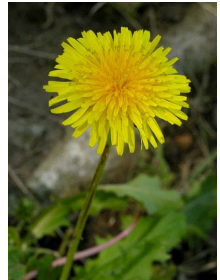
Common Dandelion Taraxacum officinale Introduced Biennial-Perennial Sunflower Family