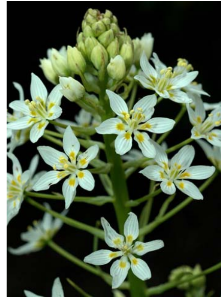
Common Star Lily Zigadenus fremontii Native Perennial Lily Family