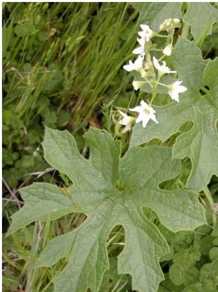
Oregon / Coast Manroot Marah oreganus Native Perennial Gourd Family