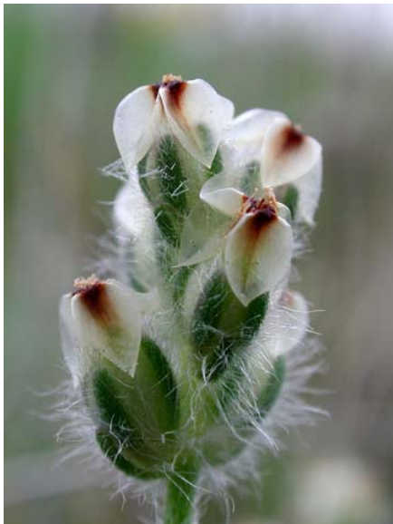
California Dwarf Plantain Plantago erecta Native Annual Plantain Family