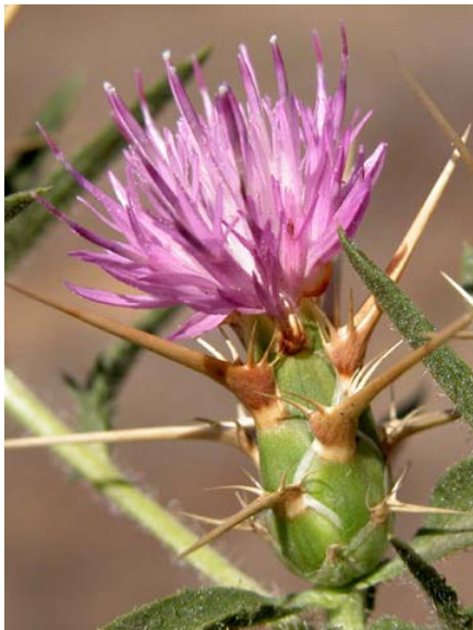
Purple Star Thistle Centaurea calcitrapa Introduced Annual-Biennial Sunflower Family