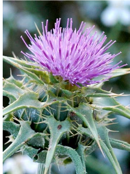
Milk Thistle Silybum marianum Introduced Annual-Biennial Sunflower Family