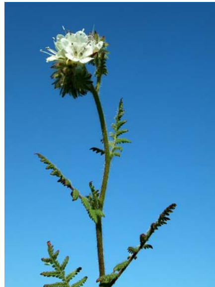
Wild Heliotrope Phacelia Phacelia distans Native Annual Waterleaf Family