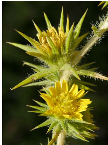
Congdon Spikeweed Hemizonia parryi ssp. congdonii Native Annual Sunflower Family