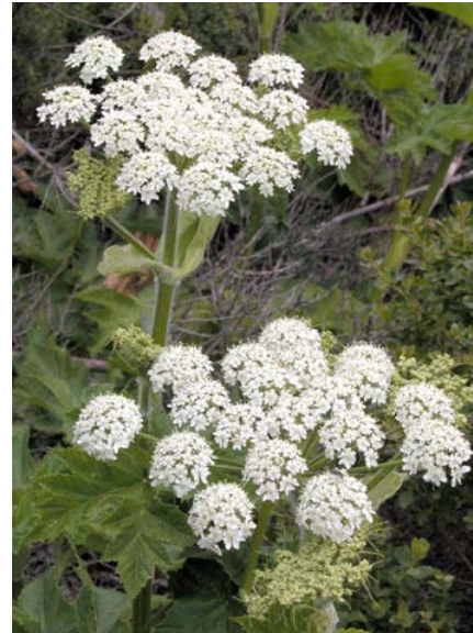
Cow Parsnip Heracleum lanatum Native Perennial Carrot Family