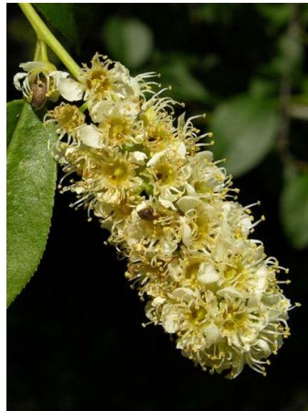
Western Chokecherry Prunus virginiana var. demissa Native Perennial Rose Family