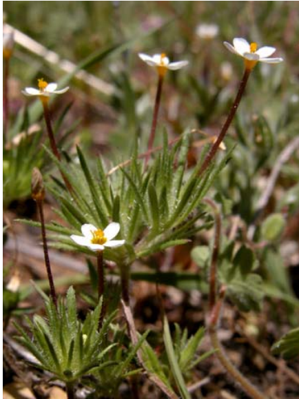
Bicolor Linanthus Linanthus bicolor Native Annual Phlox Family