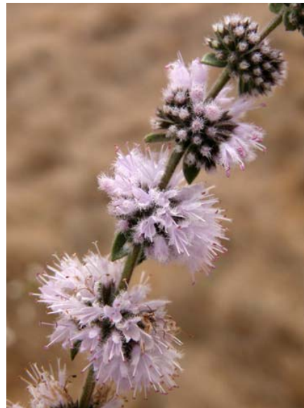
Pennyroyal Mentha pulegium Introduced Perennial Mint Family