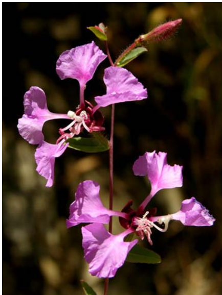
Elegant Clarkia Clarkia unguiculata Native Annual Evening Primrose Family