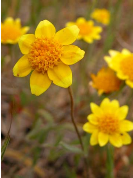
Goldfields Lasthenia californica Native Annual Sunflower Family