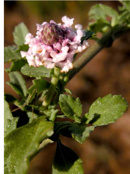
Lemon Verbena Phyla nodiflora var. nodiflora Native Perennial Vervain Family