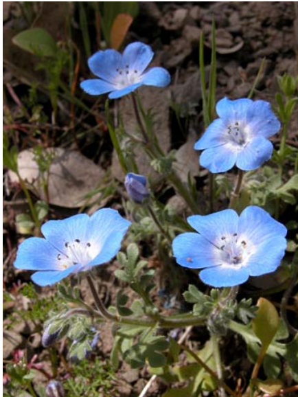
Baby Blue-eyes Nemophila menziesii var. menziesii Native Annual Waterleaf Family