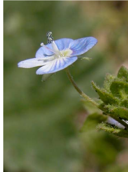
Persian Speedwell Veronica persica Introduced Annual Snapdragon Family