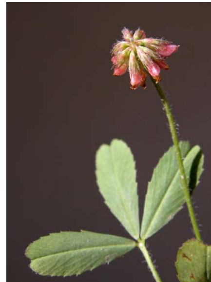
Tree Clover Trifolium ciliolatum Native Annual Pea Family