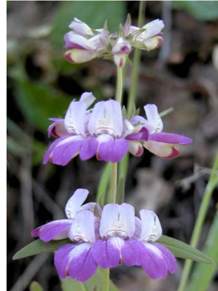
Chinese Houses Collinsia heterophylla Native Annual Snapdragon Family