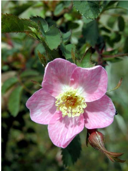
California Wild Rose Rosa californica Native Perennial Rose Family