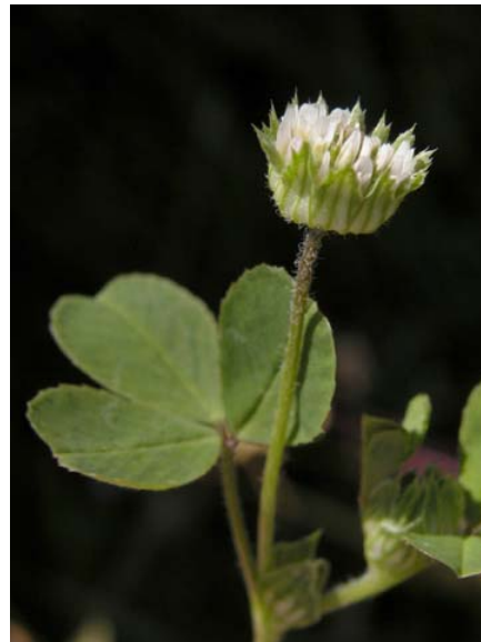
Thimble Clover Trifolium microdon Native Annual Pea Family