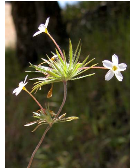
Pinklobe Linanthus Linanthus androsaceus Native Annual Phlox Family