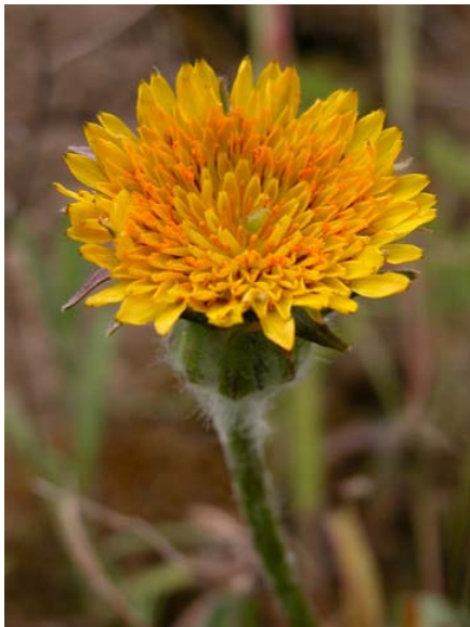
Large-flower Native Dandelion Agoseris grandiflora Native Perennial Sunflower Family