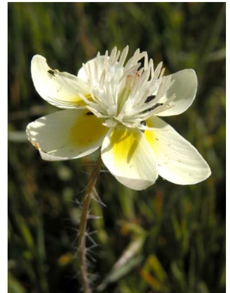
Cream Cups Platystemon californicus Native Annual Poppy Family