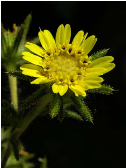
Fitch Spikeweed Hemizonia fitchii Native Perennial Sunflower Family