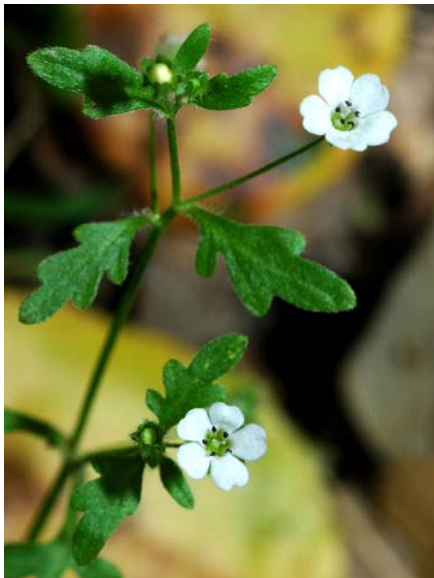
Variable-leaf Nemophila Nemophila heterophylla Native Annual Waterleaf Family