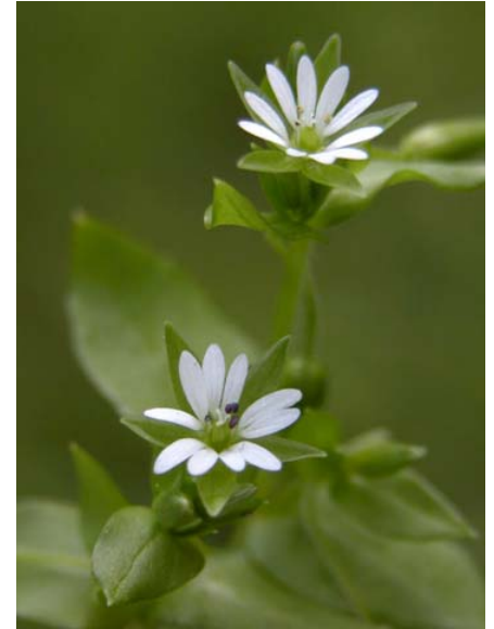
Common Chickweed Stellaria media Introduced Annual Pink Family