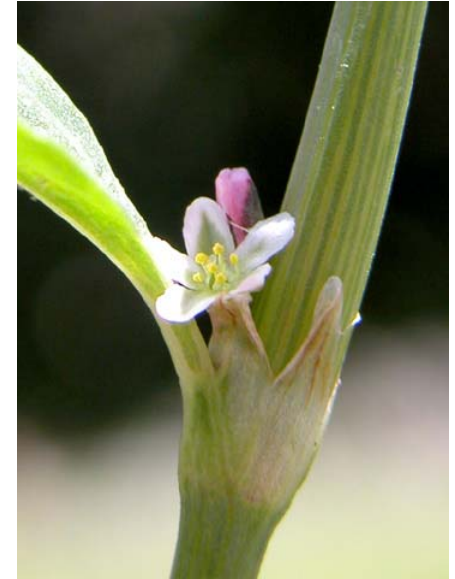
Common Yard Knotweed Polygonum arenastrum Introduced Annual Buckwheat Family