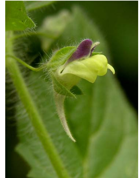
Sharp Point Fluellin Kickxia elatine Introduced Annual Snapdragon Family