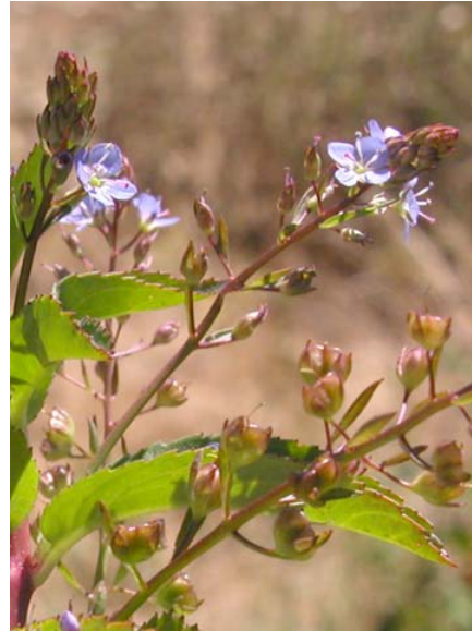
American Brooklime Speedwell Veronica americana Native Perennial Snapdragon Family