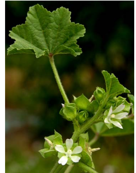
Hidden-flower Cheeseweed Malva parviflora Introduced Annual Mallow Family