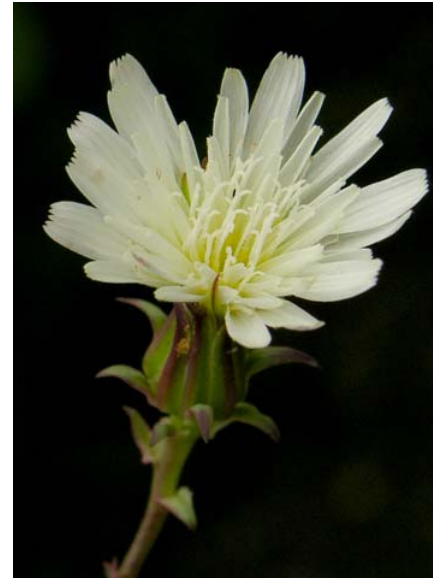
California White Chicory Rafinesquia californica Native Annual Sunflower Family