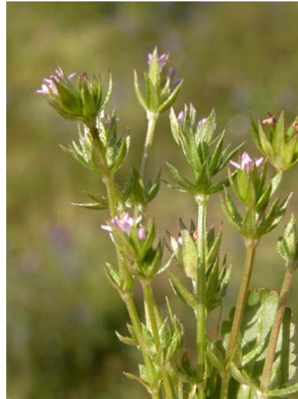
Blue Field Madder Sherardia arvensis Introduced Annual Madder Family