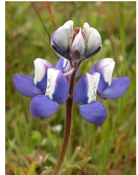
Douglas Sky Lupine Lupinus nanus Native Annual Pea Family