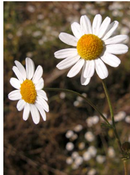
Mayweed Anthemis cotula Introduced Annual Sunflower Family