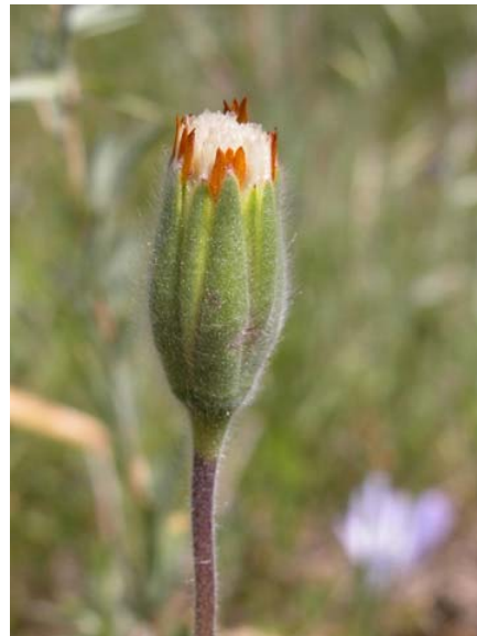
Blow Wives Achyrrachaena mollis Native Annual Sunflower Family