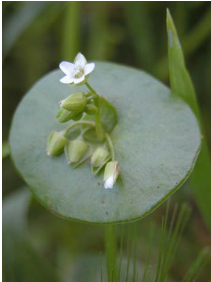
Common Miner's Lettuce Claytonia perfoliata ssp. perfoliata Native Annual Purslane Family