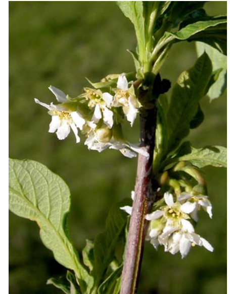
Oso Berry Oemleria cerasiformis Native Perennial Rose Family