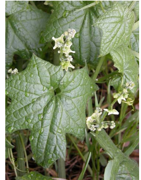
Common / California Manroot Marah fabaceus Native Perennial Gourd Family