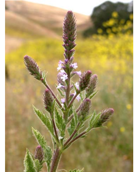
Robust Vervain Verbena lasiostachys var. scabrida Native Perennial Vervain Family