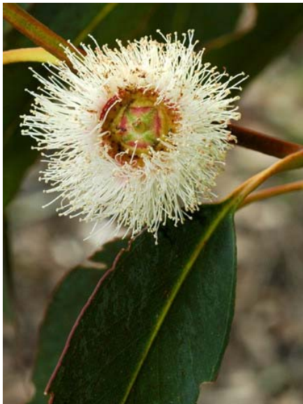
Blue Gum Eucalyptus globulus Introduced Perennial Myrtle Family