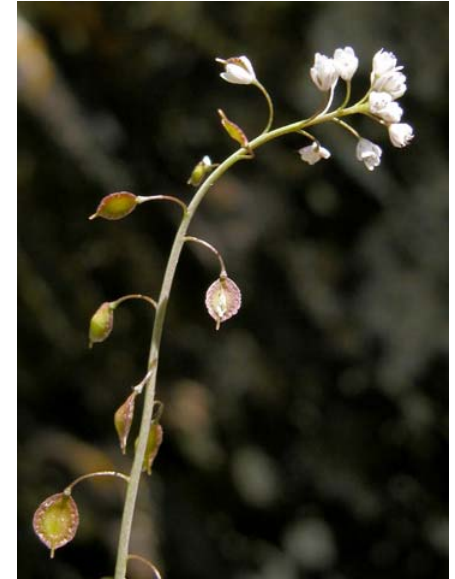
Hairy Fringe-pod Thysanocarpus curvipes Native Annual Mustard Family