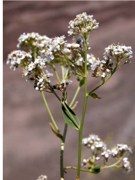
Slender Peren. Peppergrass Lepidium latifolium Introduced Perennial Mustard Family