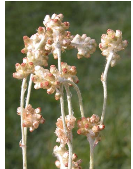
Weedy Cudweed Gnaphalium luteo-album Introduced Annual Sunflower Family