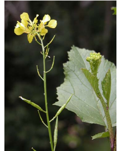
Yellow Charlock Sinapis arvensis Introduced Annual Mustard Family