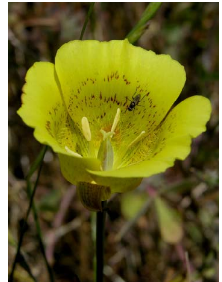
Yellow Mariposa Lily Calochortus luteus Native Perennial Lily Family