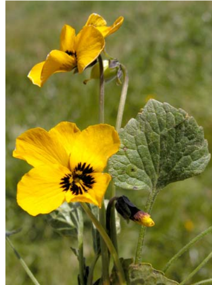
Johnny-Jump-Up / Wild Pansy Viola pedunculata Native Perennial Violet Family