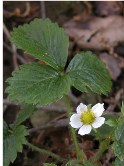
Woodland Strawberry Fragaria vesca Native Perennial Rose Family