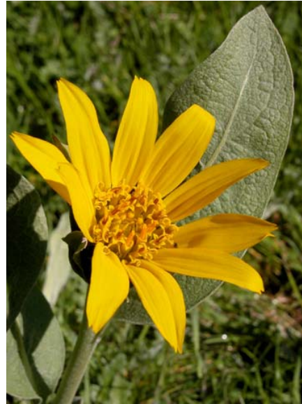
Gray Mule's Ear Wyethia helenioides Native Perennial Sunflower Family