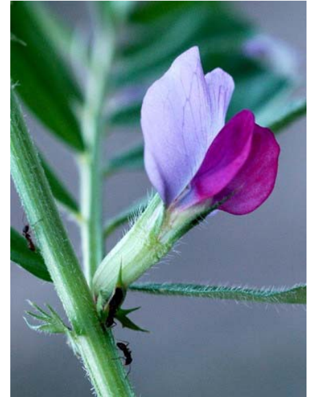
Spring Vetch Vicia sativa ssp. sativa Introduced Annual Pea Family