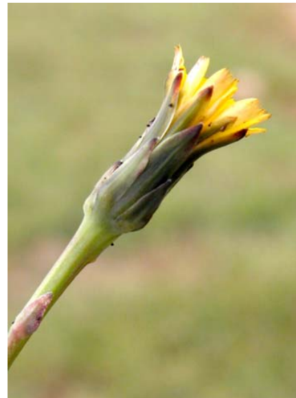
Smooth Cat's-ear Hypochaeris glabra Introduced Annual Sunflower Family