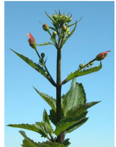
California Figwort Scrophularia californica ssp. californica Native Perennial Snapdragon Family