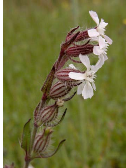
Windmill Pink Silene gallica Introduced Annual Pink Family