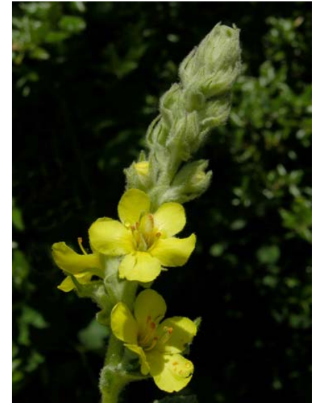
Common Woolly Mullein Verbascum thapsus Introduced Biennial Snapdragon Family