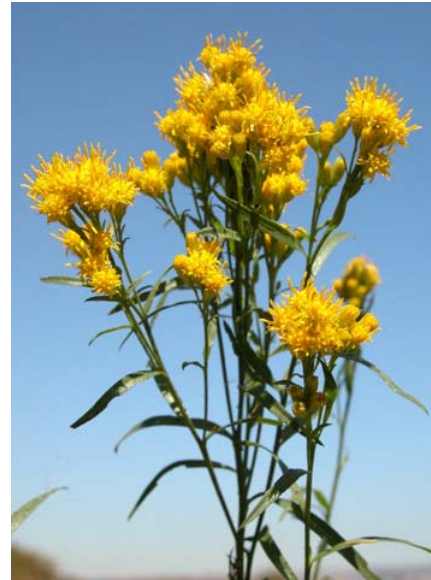
Western Goldenrod Euthamia occidentalis Native Perennial Sunflower Family