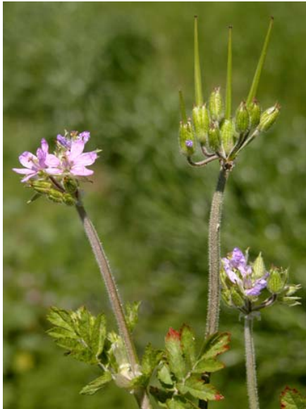
White-stem Filaree Erodium moschatum Introduced Annual Geranium Family