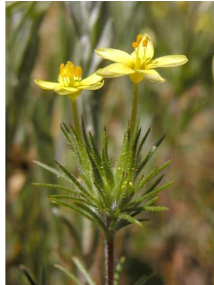
Bristly Linanthus Linanthus acicularis Native Annual Phlox Family