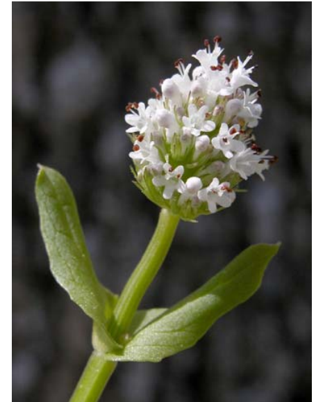
Longhorn Plecritis Plectritis macrocera Native Annual Valerian Family