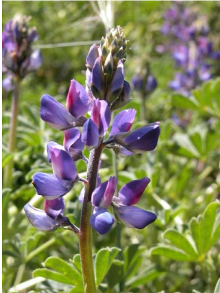
Arroyo Lupine Lupinus succulentus Native Annual Pea Family