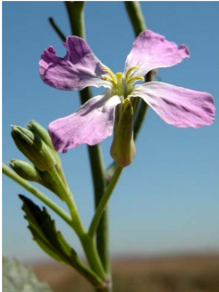
Wild Radish Raphanus sativus Introduced Annual Mustard Family