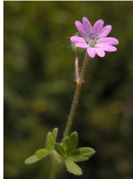
Hairy Dove's Foot Geranium Geranium molle Introduced Annual Geranium Family