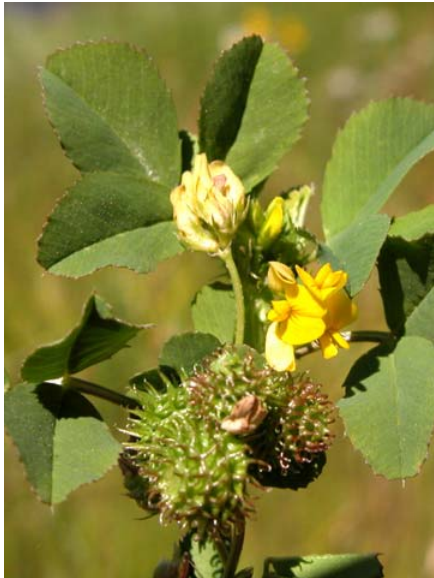
California Bur Clover Medicago polymorpha Introduced Annual Pea Family