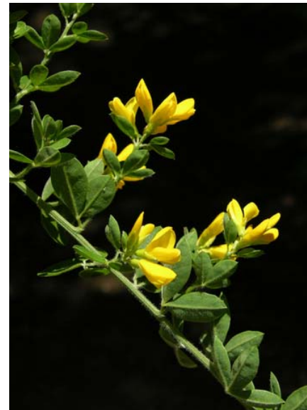
French Broom Genista monspessulana Introduced Perennial Pea Family