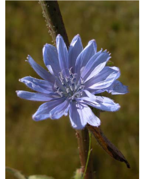
Chicory Cichorium intybus Introduced Perennial Sunflower Family