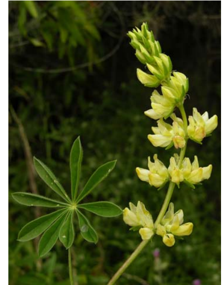
Gully Lupine Lupinus microcarpus var. densiflorus Native Annual Pea Family