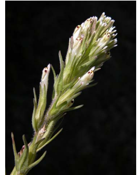
Valley Tassels Castilleja attenuata Native Annual Snapdragon Family