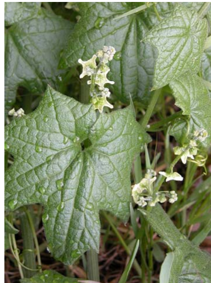
Common / California Manroot Marah fabaceus Native Perennial Gourd Family