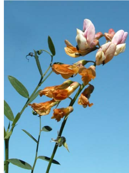
Pale Purple Pacific Pea Lathyrus vestitus var. vestitus Native Perennial Pea Family