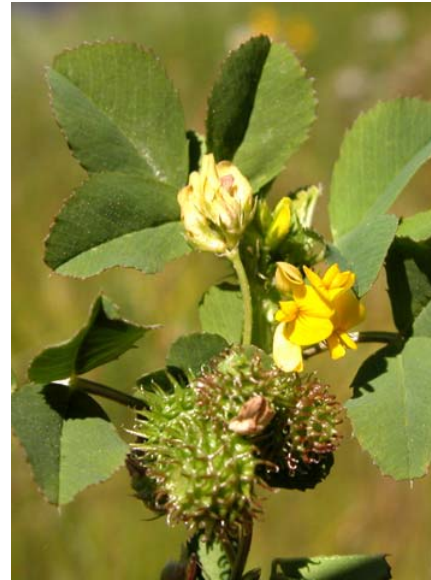
California Bur Clover Medicago polymorpha Introduced Annual Pea Family