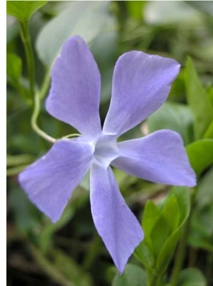
Greater Periwinkle Vinca major Introduced Perennial Dogbane Family