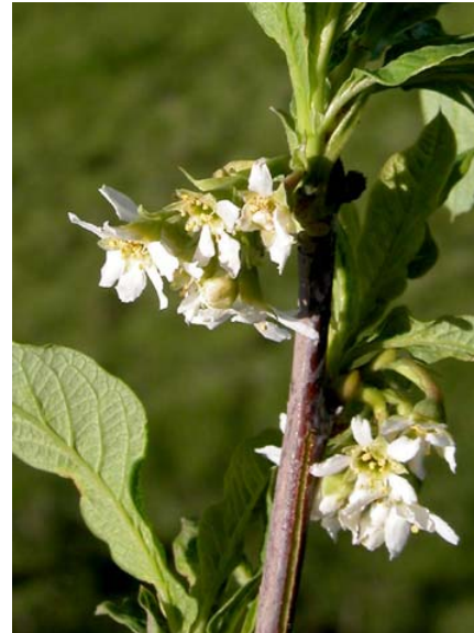
Oso Berry Oemleria cerasiformis Native Perennial Rose Family