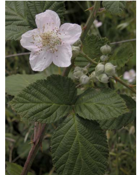
Himalayan Blackberry Rubus discolor Introduced Perennial Rose Family