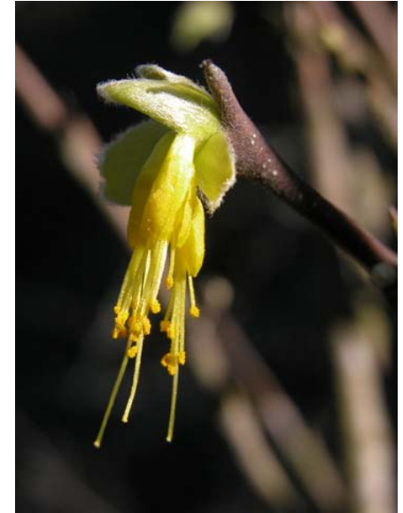
Western Leatherwood Dirca occidentalis Native Perennial Daphne Family