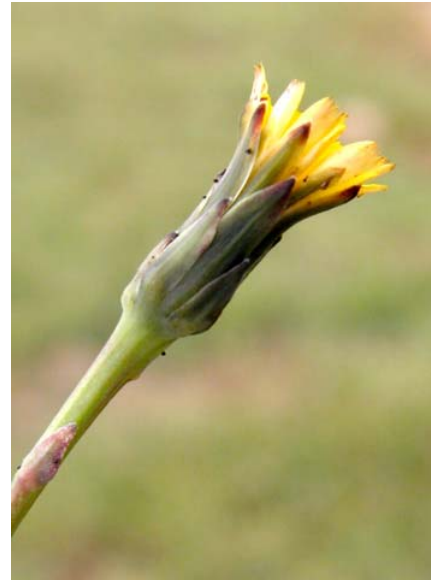
Smooth Cat's-ear Hypochaeris glabra Introduced Annual Sunflower Family