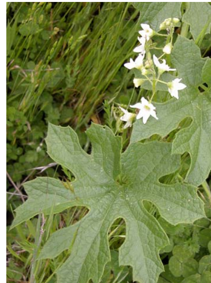
Oregon / Coast Manroot Marah oreganus Native Perennial Gourd Family