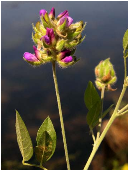
California Tea Rupertia physodes Native Perennial Pea Family