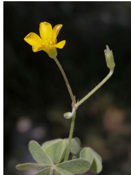
Creeping Wood Sorrel Oxalis corniculata Introduced Perennial Oxalis Family