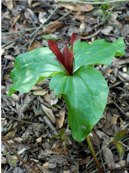
Giant Trillium Trillium chloropetalum Native Perennial Lily Family