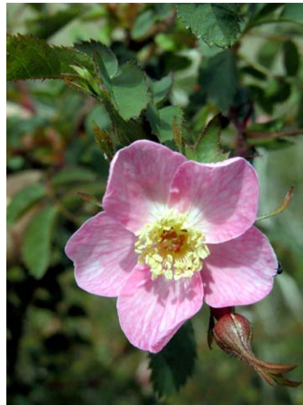
California Wild Rose Rosa californica Native Perennial Rose Family