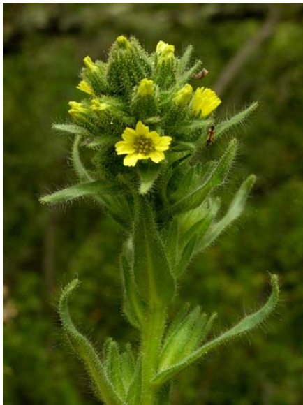
Common / Coast Tarweed Madia sativa Native Annual Sunflower Family