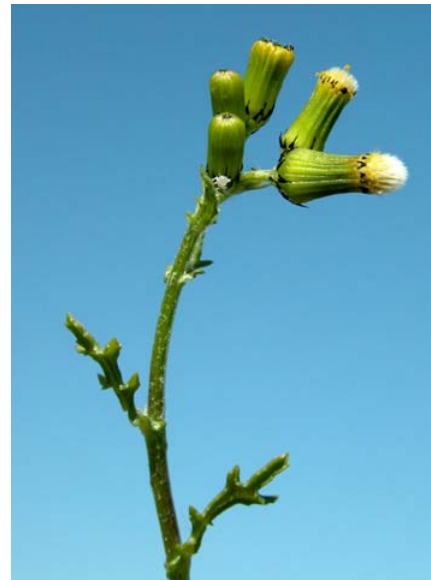
Common Groundsel Senecio vulgaris Introduced Annual Sunflower Family