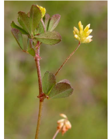
Shamrock Clover Trifolium dubium Introduced Annual Pea Family