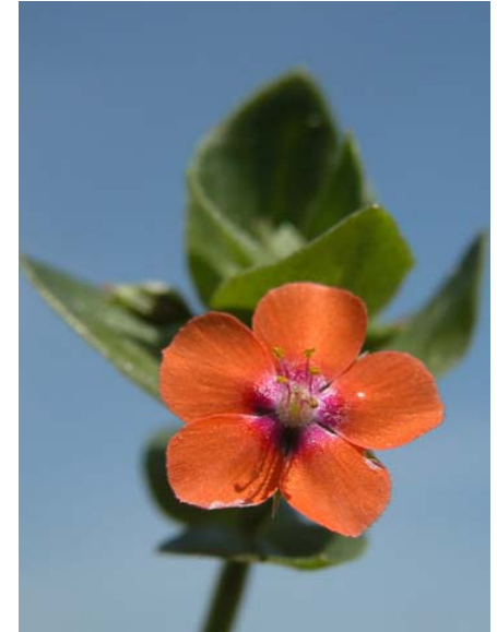
Scarlet Pimpernel Anagallis arvensis Introduced Annual Primrose Family