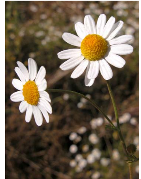
Mayweed Anthemis cotula Introduced Annual Sunflower Family