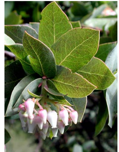
Pallid Manzanita Arctostaphylos pallida Native Perennial Heath Family