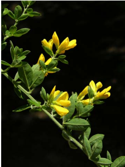
French Broom Genista monspessulana Introduced Perennial Pea Family