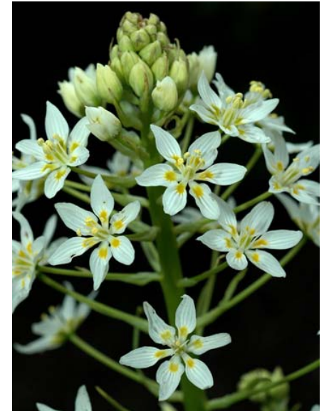
Common Star Lily Zigadenus fremontii Native Perennial Lily Family