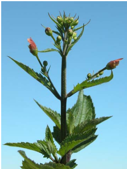
California Figwort Scrophularia californica ssp. californica Native Perennial Snapdragon Family