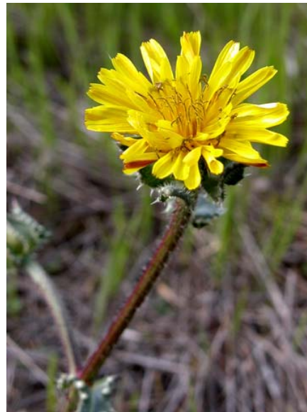
Bristly Ox-tongue Picris echioides Introduced Annual-Biennial Sunflower Family