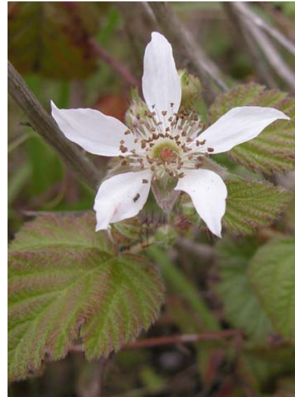
Native California Blackberry Rubus ursinus Native Perennial Rose Family