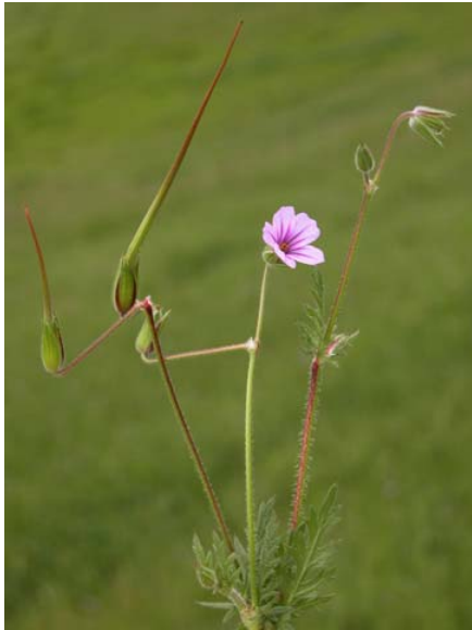
Long-beaked Filaree Erodium botrys Introduced Annual Geranium Family