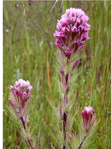
Purple Owl's Clover Castilleja exserta ssp. exserta Native Annual Snapdragon Family