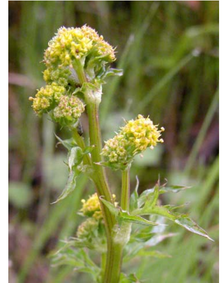
Pacific Woodland Sanicle Sanicula crassicaulis Native Perennial Carrot Family