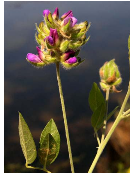
California Tea Rupertia physodes Native Perennial Pea Family