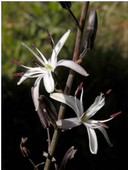
Common Soap Plant Chlorogalum pomeridianum var. pomeridianum Native Perennial Lily Family