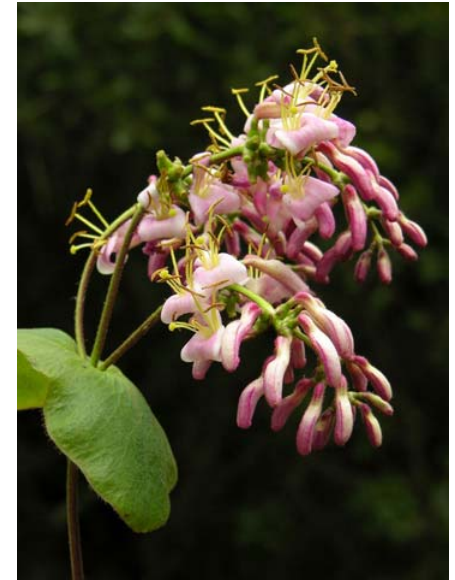
Hairy Vine Honeysuckle Lonicera hispidula var. vacillans Native Perennial Honeysuckle Family