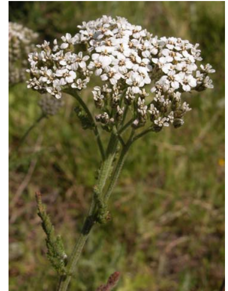
Yarrow Achillea millefolium Native Perennial Sunflower Family