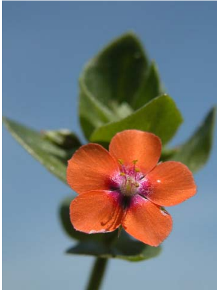
Scarlet Pimpernel Anagallis arvensis Introduced Annual Primrose Family