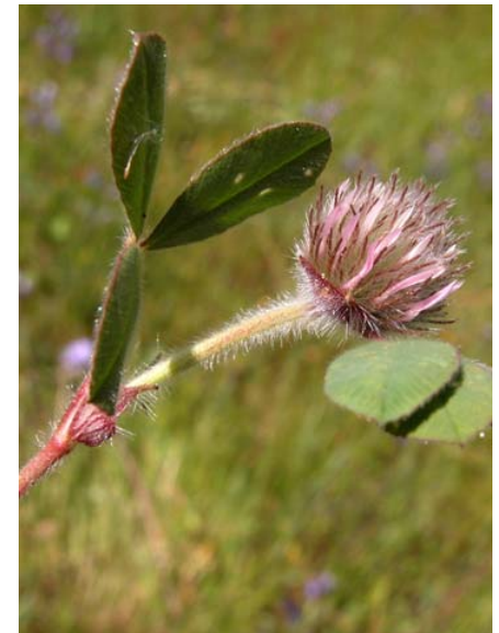
Rose Clover Trifolium hirtum Introduced Annual Pea Family