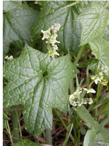
Common / California Manroot Marah fabaceus Native Perennial Gourd Family