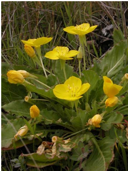
Golden Eggs Suncup Camissonia ovata Native Perennial Evening Primrose Family