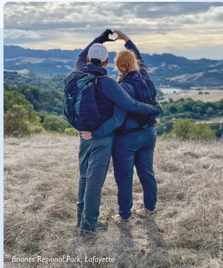
Briones Regional Park, Lafayette

We thank you for doing your part to keep parks open and safe in 2020 and into 2021. Let's continue to keep active, healthy, and safe in the Regional Parks!