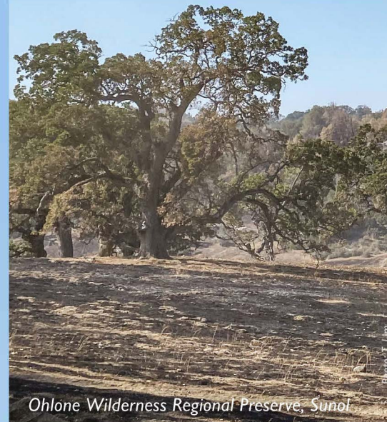
Ohlone Wilderness Regional Preserve, Sunol

Our perennial fuels management, grazing program, and trail maintenance work have proven highly effective in wildfire mitigation. In many cases, the wildfires decelerated in grazed areas and stopped at well-maintained trails and fire roads.