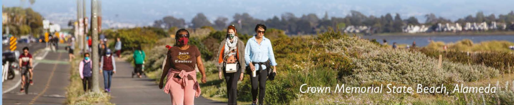
Crown Memorial State Beach, Alameda

The pandemic underscored the efficacy of our decade-long Healthy Parks Healthy People partnerships with healthcare providers prescribing nature to their patients to build health and resilience in the Regional Parks. Our extensive network of parks and trails, which provide fresh air and a place to relieve stress and strengthen connections, contributes $20 million annually towards healthcare cost savings, according to a 2017 Economic Impact Analysis.