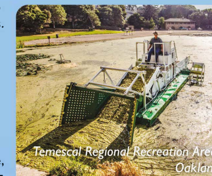
Temescal Regional Recreation Area, Oakland

To protect parks and trails from climate change, we are building recreational amenities and wildlife habitat that can withstand extreme weather, sea level rise, and wildfires. Planning and assessments are underway, including a regional study to assess the effects of sea-level rise on the San Francisco Bay Trail, of which 40 miles are managed by the Park District, and a joint Hayward Shoreline Master Plan with the City of Hayward and Hayward Area Recreation and Park District to address the impacts of sea-level rise along the Hayward shoreline.