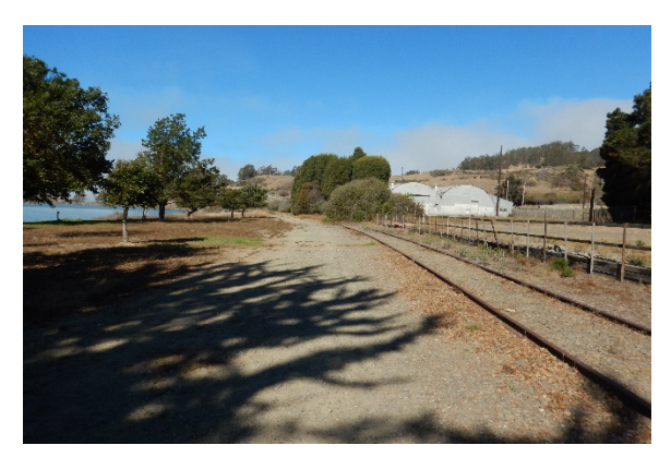
Photo 13 Point Molate Beach Park looking north. Segment B is proposed left of existing rail at this location. 10/26/2015