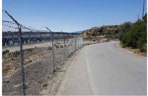
Photo 1 Beginning of Segment A looking west. Trail will be separated from existing road with elevation, and/or trail markings. 7/7/2016

Photographs along the proposed trail alignment are presented from south to north.