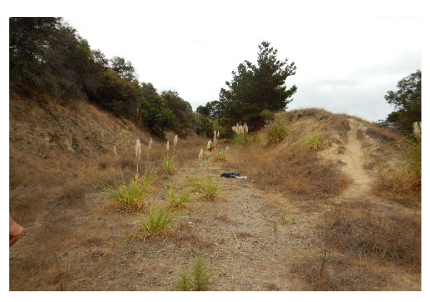
Photo 8 Near north end of Segment A. Proposed trail location through existing cut slope from Richmond Belt Railway. Social trails to sensitive natural communities at right to be fenced to minimize impacts from trail users. 10/26/2015