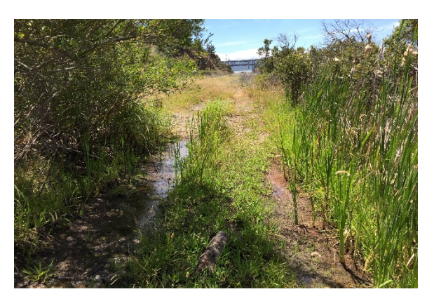
Photo 7 Seep Wetland in Segment A where boardwalk is proposed. 7/7/2015