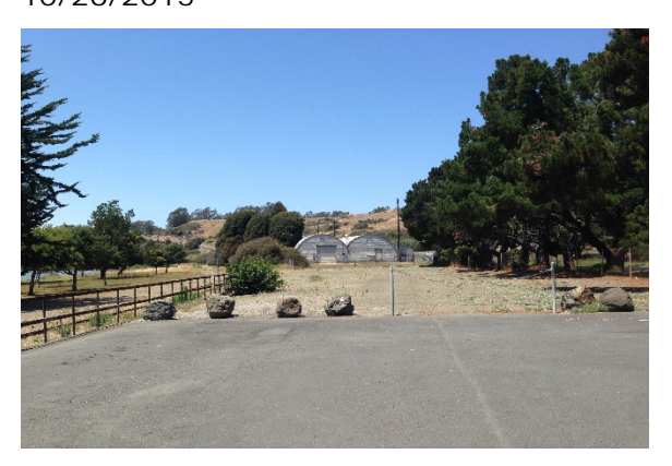
Photo 11 Second proposed staging area in existing parking lot at Point Molate Beach Park. 7/21/2015