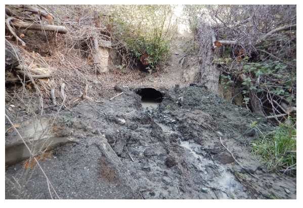
Photo 9 Near start of Segment B (south end). Clogged storm drain pipe conveying upland and street runoff through proposed trail alignment into Bay via existing outfall. 10/26/2015