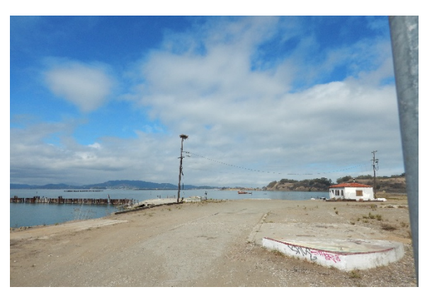
Photo 6 Osprey nest at Castro Point near proposed alignment for Segment A. Date Unknown