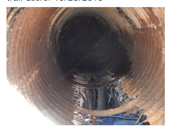
Photo 10 Near start of Segment B (south end). Existing storm drain outfall proposed for removal and replacement, or daylighting with boardwalk over flow path. 10/26/2015