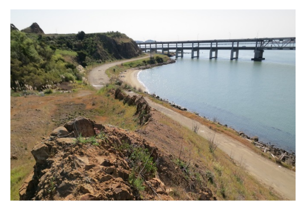
Photo 5 Southeast view of existing access road on Chevron property where Segment A is proposed. Date Unknown