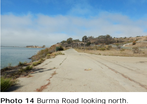
Photo 14 Burma Road looking north. Segment B is proposed left of existing rail and then will cross to coastal side of the existing road. Date Unknown