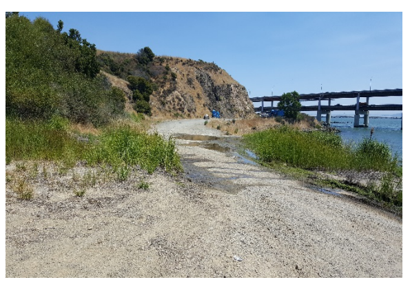
Photo 3 Portion of Wetland on right to be filled to construct the trail and maintain existing fire access to private property. Upland wetland (left side) will be protected and maintained. 7/27/2016