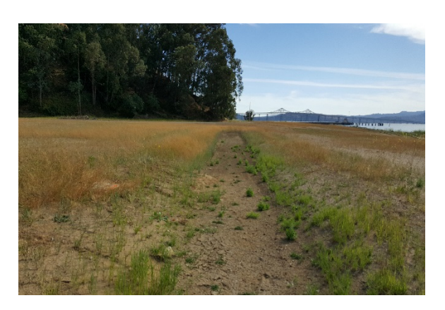
Photo 17 Segment B proposed trail corridor looking south towards the drum lot. 6/3/2016