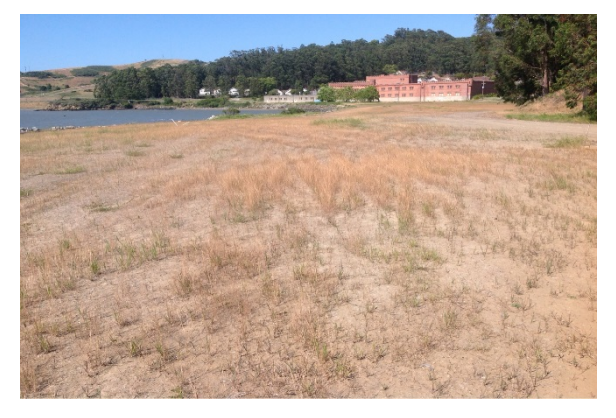
Photo 18 Segment B proposed trail corridor looking north towards Winehaven. 6/28/2016