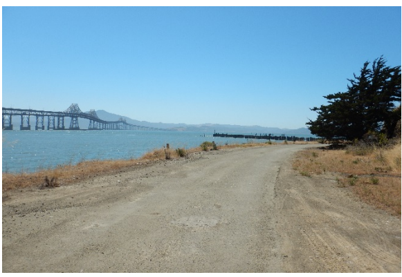
Photo 4 Trail will follow coastline side of existing access road throughout much of Segment A. 6/28/2016