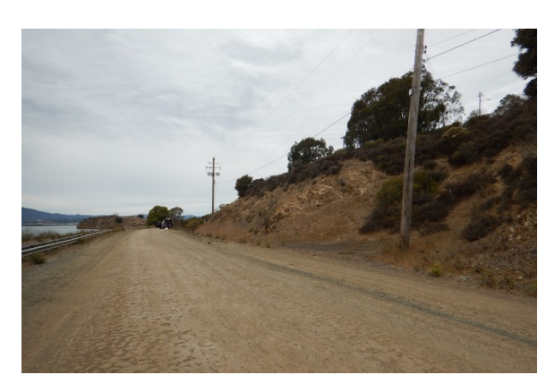
Photo 15 North end of Burma Road near the drum lot. Segment B is proposed on left side of existing road. Date Unknown