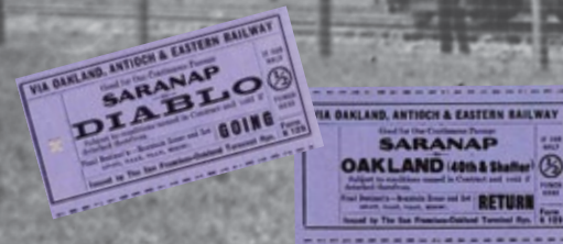
Background photo: OA&E train East of Moraga Depot headed for Oakland.