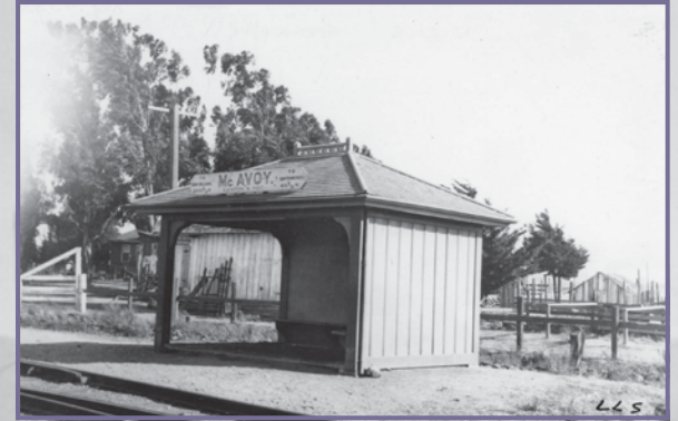
McAvoy Railroad Station.

Today the Bay Point railways continue to serve as a vital transportation link for passengers and freight.