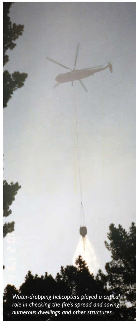
Water-dropping helicopters played a critical role in checking the fire’s spread and saving numerous dwellings and other structures.