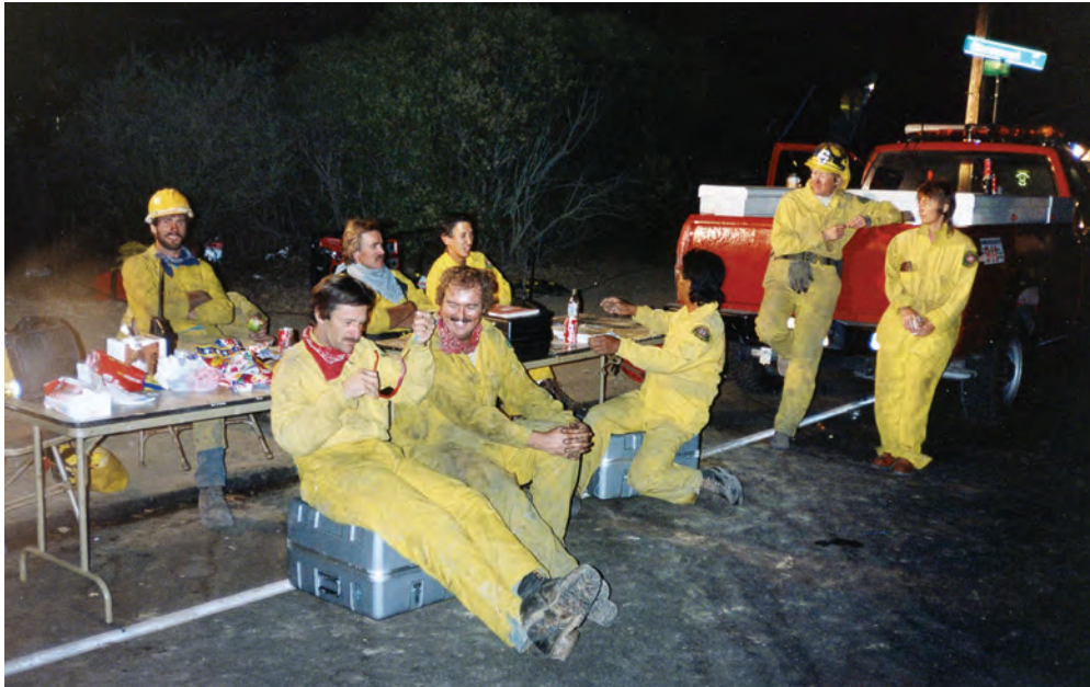
Top: A Park District Fire Department pickup truck, burned but still serviceable. In the background, the firefighter checks in at the command post on Grizzly Peak Boulevard.