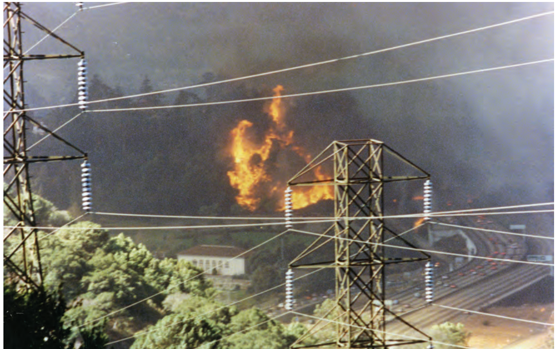
Fire jumps Highway 24 and flares up in Temescal Regional Recreation Area.