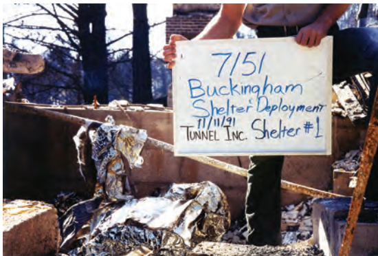
A partially deployed tent shelter at a pool house next to 7151 Buckingham.