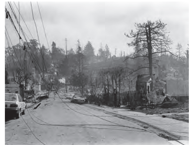
Top: The glow of the Oakland Hills firestorm was visible from San Francisco, more than 10 miles to the west.