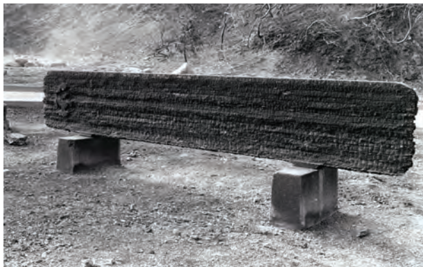
Top: Temescal Park office's burned rubble.