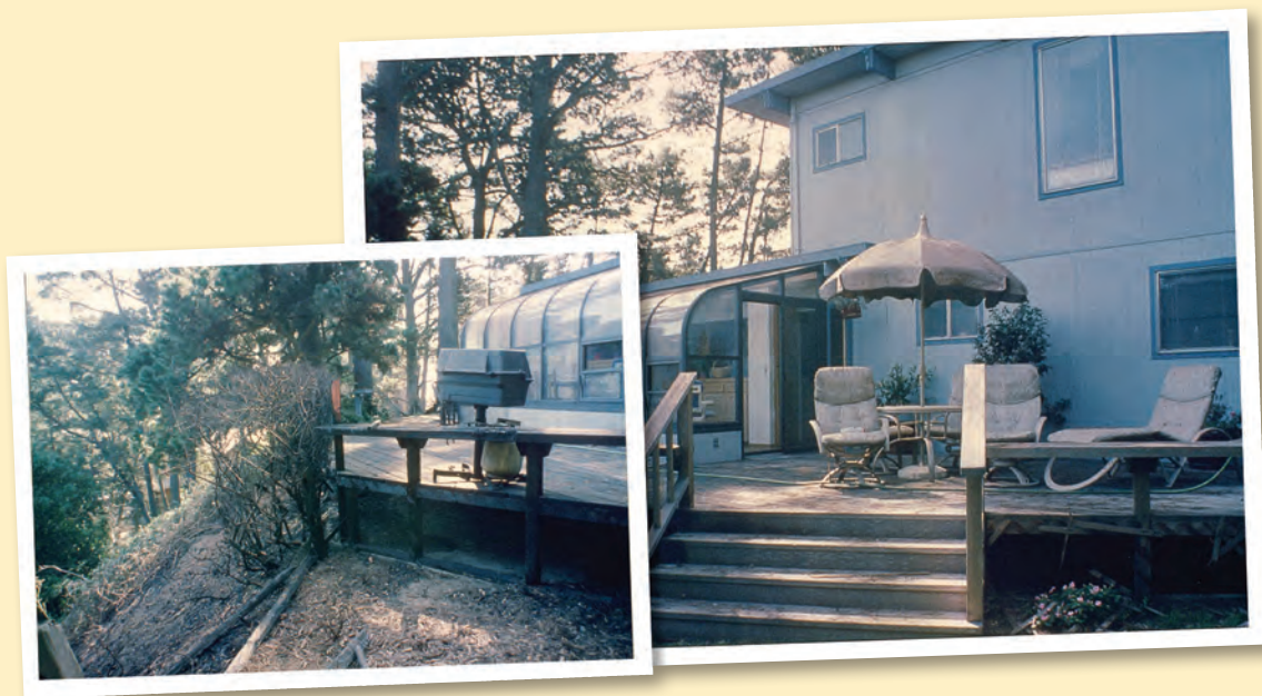
The saved home and charred underdeck at 5940 Grizzly Peak Boulevard.

Ragatz found that Skyline Boulevard had been blocked a short distance north of the intersection with Grizzly Peak Boulevard. While he was asking Oakland police officers which Oakland fire units were closest, Kent drove up.