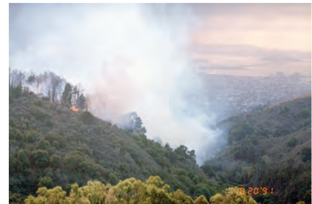
Top: A massive smoke column builds above the Caldecott Tunnel and Highway 24 after the fire rekindled on Sunday.