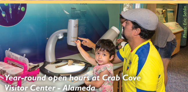
Year-round open hours at Crab Cove Visitor Center - Alameda