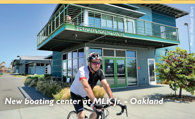
New boating center at MLK Jr. - Oakland