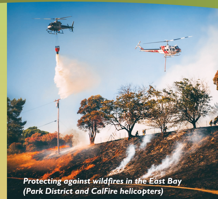
Protecting against wildfires in the East Bay (Park District and CalFire helicopters)