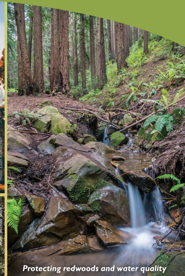
Protecting redwoods and water quality