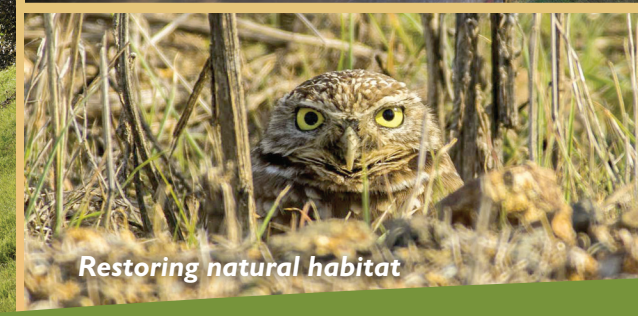
Restoring natural habitat

Measure FF is a $12/year ($1/month) parcel tax extension measure. It does not change or increase tax rates.