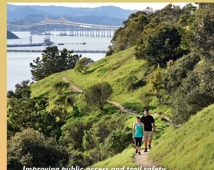
Improving public access and trail safety