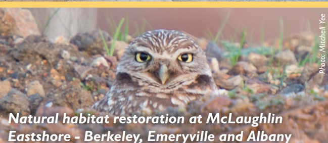
Natural habitat restoration at McLaughlin Eastshore - Berkeley, Emeryville and Albany