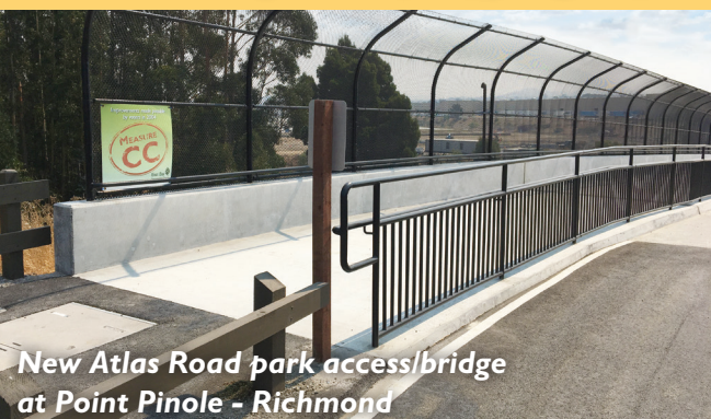
New Atlas Road park access/bridge at Point Pinole - Richmond