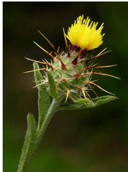
Tocalote Centaurea melitensis Introduced Annual Sunflower Family