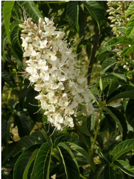
California Buckeye Aesculus californica Native Perennial Buckeye Family