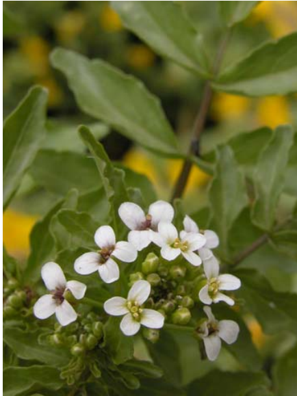
White Water Cress Rorippa nasturtium-aquaticum Native Perennial Mustard Family