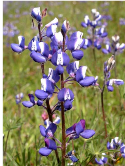
Miniature Dove Lupine Lupinus bicolor Native Annual Pea Family