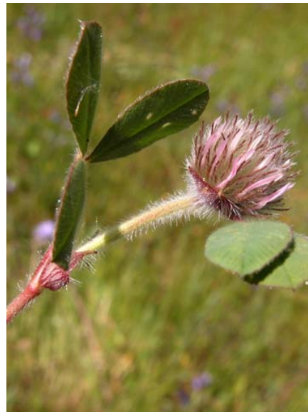
Rose Clover Trifolium hirtum Introduced Annual Pea Family