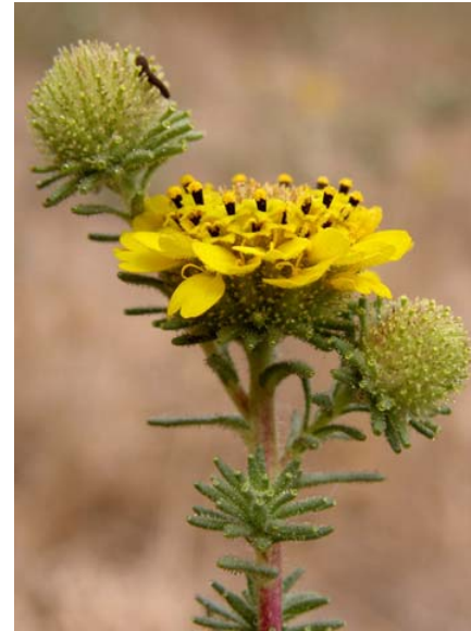
Santa Cruz Tarplant Holocarpa macradenia Native Annual Sunflower Family