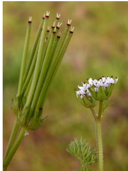
Shepherd's Needle Scandix pecten-veneris Introduced Annual Carrot Family