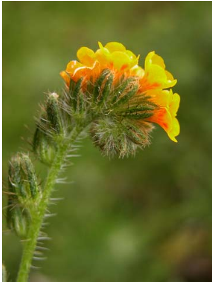
Common Fiddleneck Amsinckia menziesii var. intermedia Native Annual Borage Family