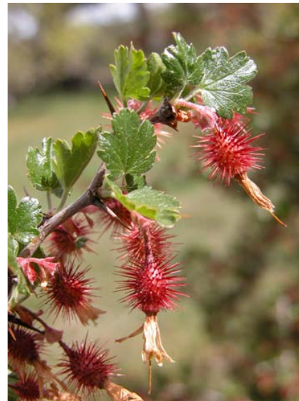
Hillside Gooseberry Ribes californicum var. californicum Native Perennial Gooseberry Family