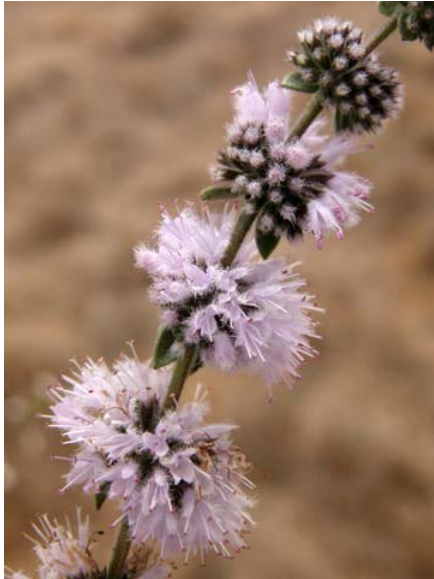
Pennyroyal Mentha pulegium Introduced Perennial Mint Family