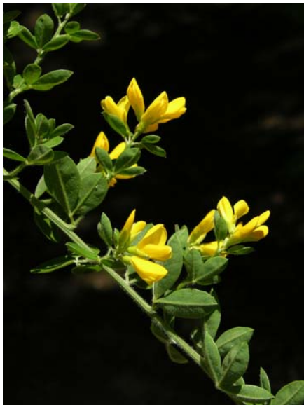
French Broom Genista monspessulana Introduced Perennial Pea Family