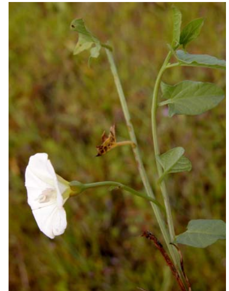
Field Bindweed Convolvulus arvensis Introduced Perennial Morning-Glory Family