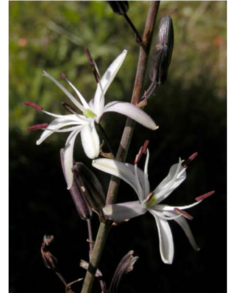
Common Soap Plant Chlorogalum pomeridianum var. pomeridianum Native Perennial Lily Family