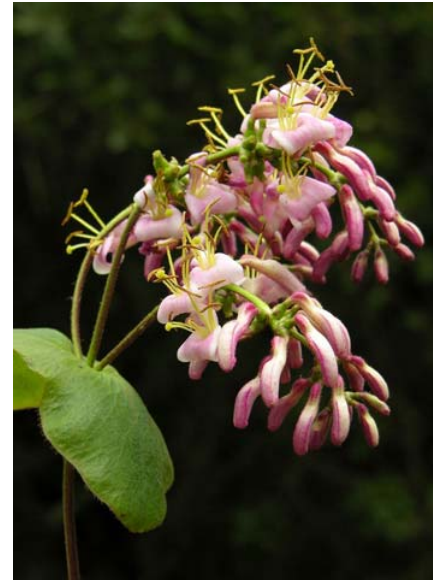
Hairy Vine Honeysuckle Lonicera hispidula var. vacillans Native Perennial Honeysuckle Family