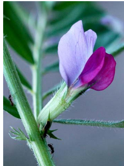
Spring Vetch Vicia sativa ssp. sativa Introduced Annual Pea Family