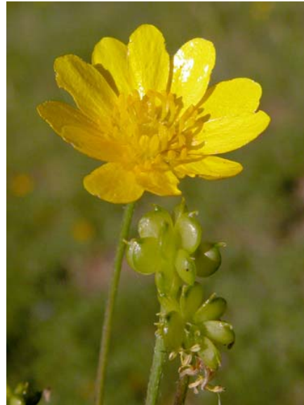
California Buttercup Ranunculus californicus Native Perennial Buttercup Family