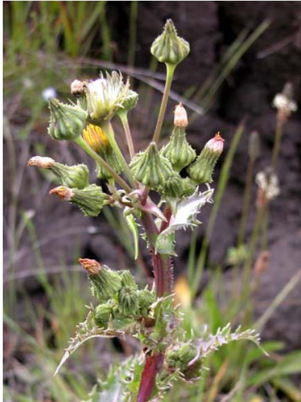
Prickly Sow Thistle Sonchus asper ssp. asper Introduced Annual Sunflower Family