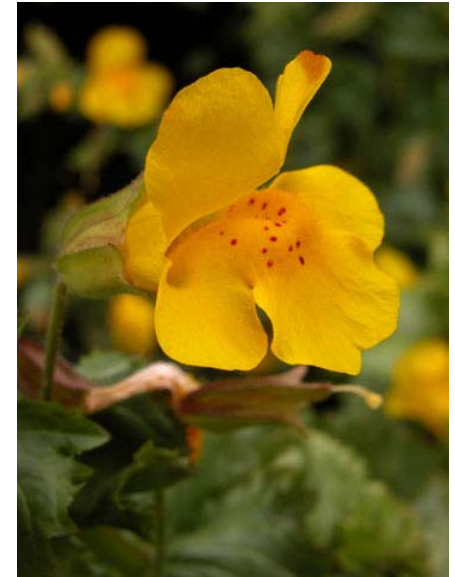
Golden Monkey Flower Mimulus guttatus Native Perennial Snapdragon Family