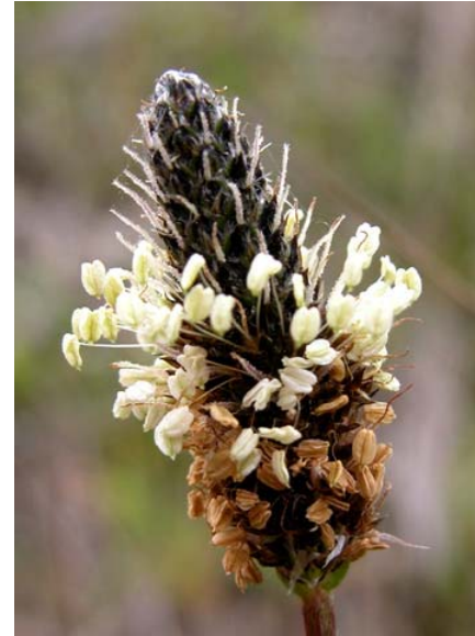
English Plantain Plantago lanceolata Introduced Annual Plantain Family