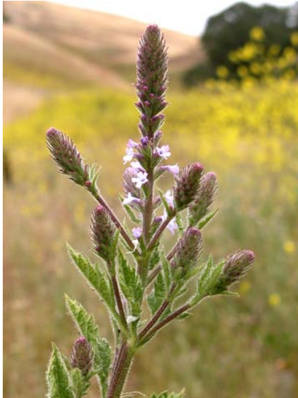
Robust Vervain Verbena lasiostachys var. scabrida Native Perennial Vervain Family