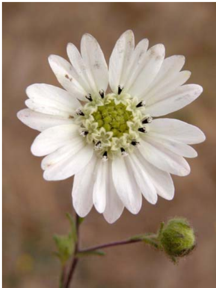
Hayfield Tarweed Hemizonia congesta ssp. luzulaefolia Native Perennial Sunflower Family