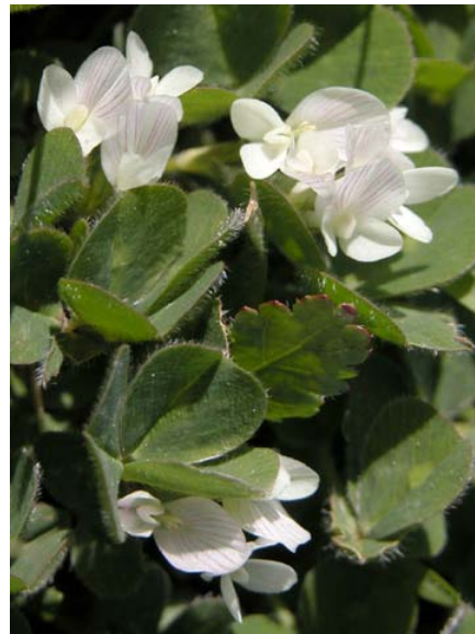
Subterranean Clover Trifolium subterraneum Introduced Annual Pea Family