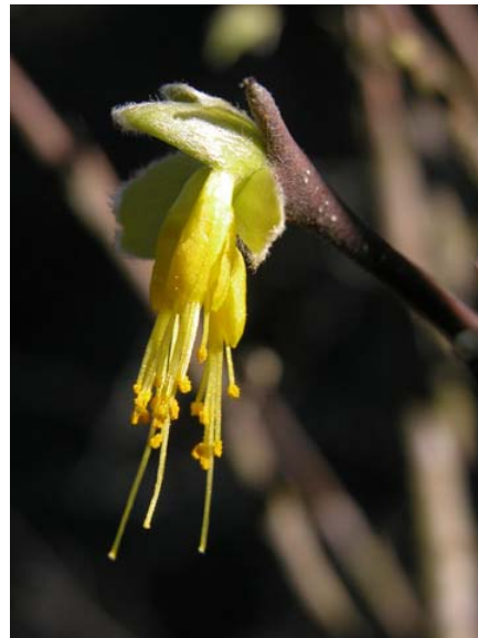
Western Leatherwood Dirca occidentalis Native Perennial Daphne Family