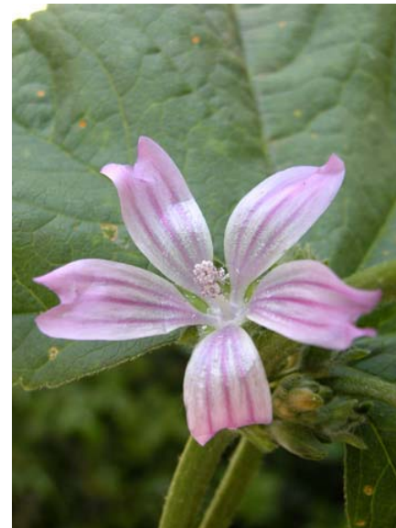
Bull Mallow Malva nicaensis Introduced Annual Mallow Family