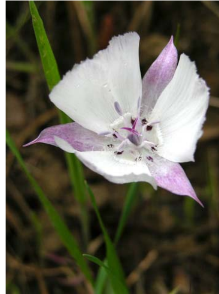
Oakland Star Tulip Calochortus umbellatus Native Perennial Lily Family