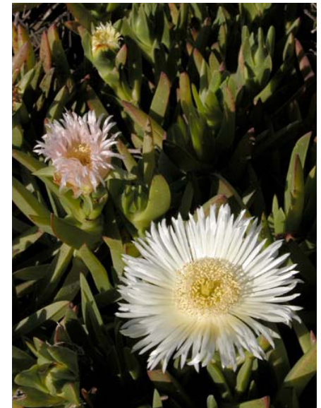
Yellow Hottentot Fig Carpobrotus edulis Introduced Perennial Fig-Marigold Family