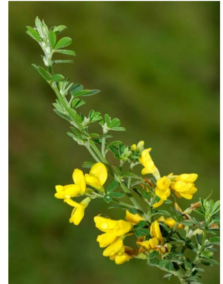
Scotch Broom Cytisus scoparius Introduced Perennial Pea Family