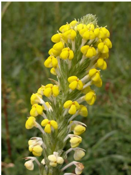
Yellow Johnny-tuck Triphysaria eriantha ssp. eriantha Native Annual Snapdragon Family