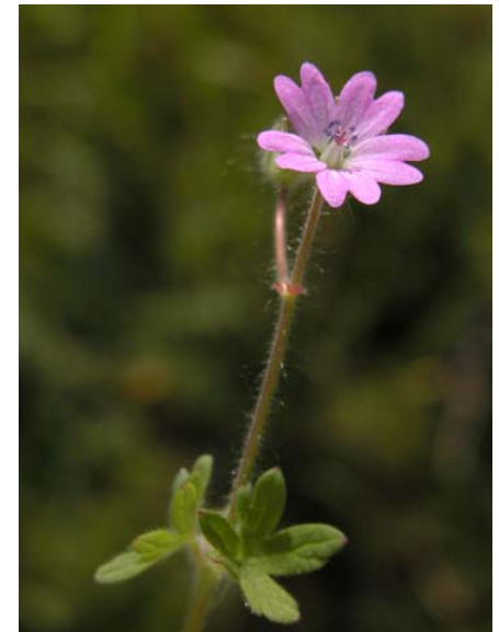
Hairy Dove's Foot Geranium Geranium molle Introduced Annual Geranium Family