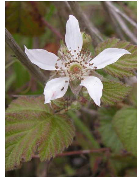
Native California Blackberry Rubus ursinus Native Perennial Rose Family