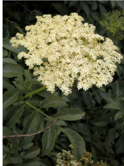
Blue Elderberry Sambucus mexicana Native Perennial Honeysuckle Family