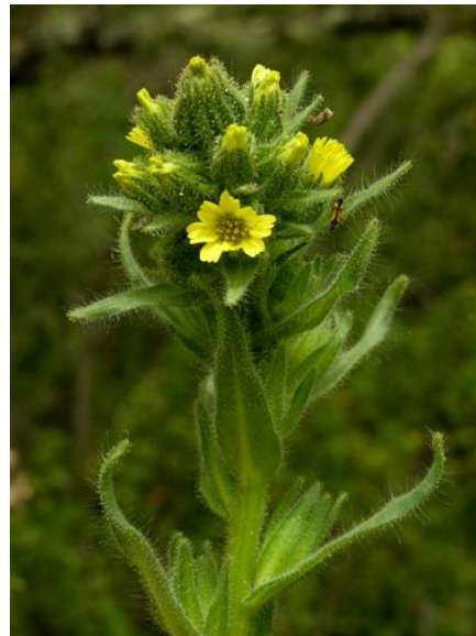
Common / Coast Tarweed Madia sativa Native Annual Sunflower Family