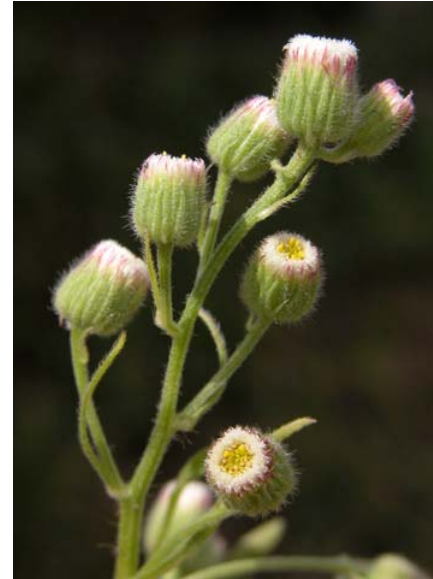
South American Horseweed Conyza bonariensis Introduced Annual Sunflower Family