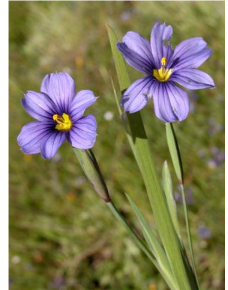
Blue-eyed Grass Sisyrinchium bellum Native Perennial Iris Family