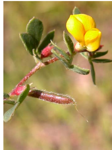
California Lotus Lotus wrangelianus Native Annual Pea Family