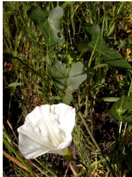
Climbing Morning Glory Calystegia purpurata ssp. purpurata Native Perennial Morning-Glory Family