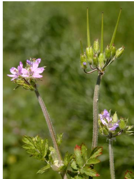
White-stem Filaree Erodium moschatum Introduced Annual Geranium Family