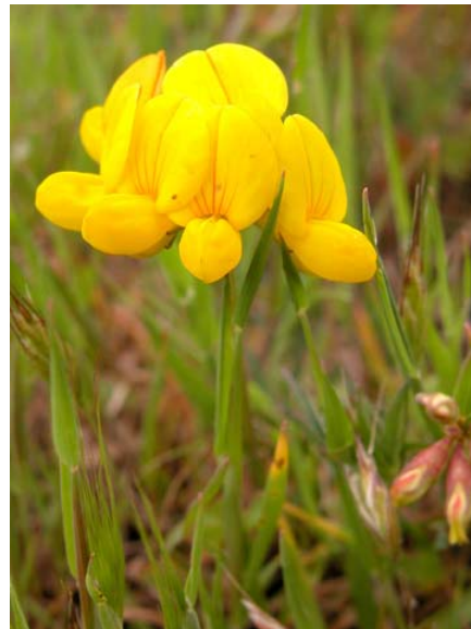
Bird's-foot Deerweed Lotus corniculatus Introduced Perennial Pea Family