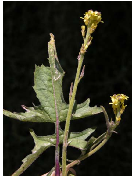
Black Mustard Brassica nigra Introduced Annual Mustard Family