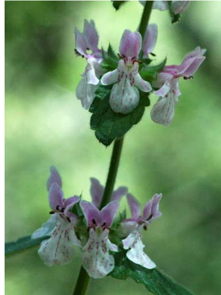
Common Rigid Hedge Nettle Stachys ajugoides var. rigida Native Perennial Mint Family