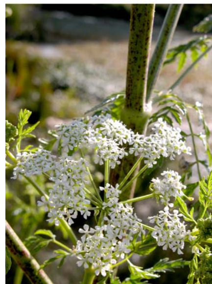
Poison Hemlock Conium maculatum Introduced Biennial Carrot Family