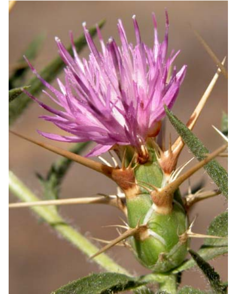
Purple Star Thistle Centaurea calcitrapa Introduced Annual-Biennial Sunflower Family