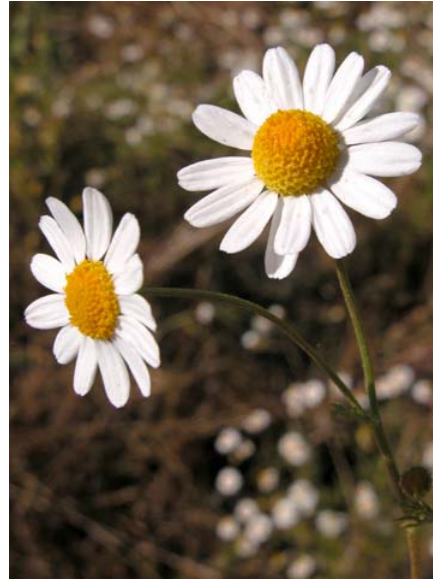
Mayweed Anthemis cotula Introduced Annual Sunflower Family