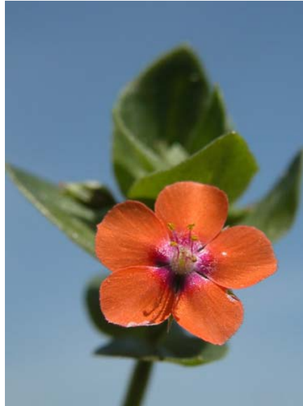
Scarlet Pimpernel Anagallis arvensis Introduced Annual Primrose Family