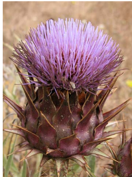
Cardoon / Artichoke Thistle Cynara cardunculus Introduced Perennial Sunflower Family