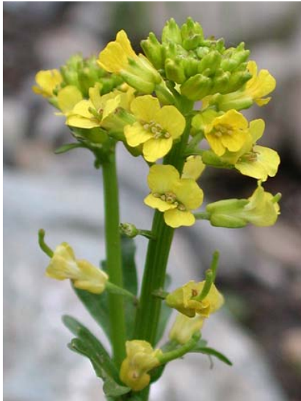
Erect-pod Winter Cress Barbarea orthoceras Native Perennial Mustard Family