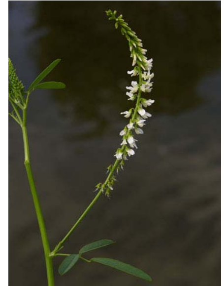
White Sweet Clover Melilotus alba Introduced Annual-Biennial Pea Family