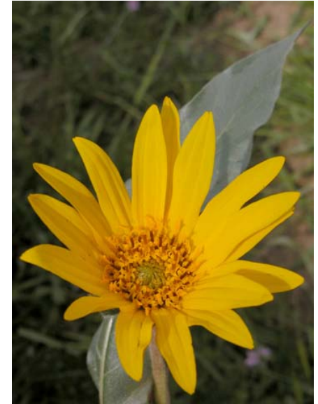
Narrow-leaf Mule's Ear Wyethia angustifolia Native Perennial Sunflower Family