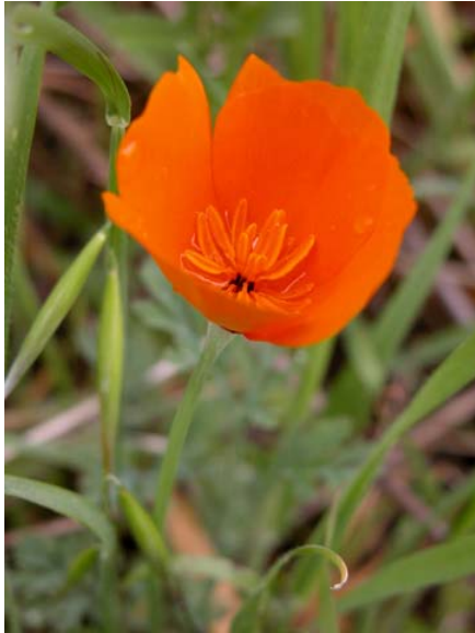
California Poppy Eschscholzia californica Native Perennial Poppy Family