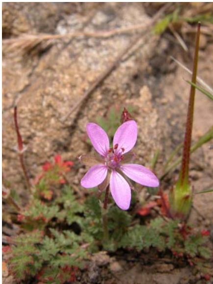
Red-stem Filaree Erodium cicutarium Introduced Annual Geranium Family