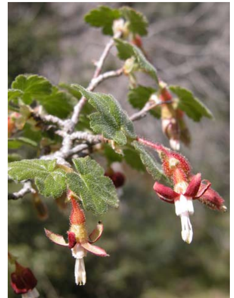
Canyon Gooseberry Ribes menziesii Native Perennial Gooseberry Family