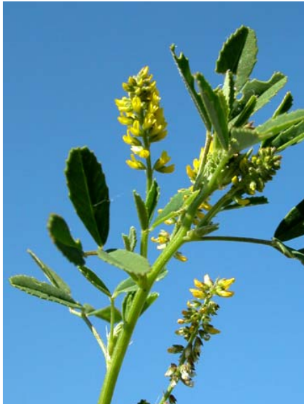
Sour Clover Melilotus indica Introduced Annual-Biennial Pea Family