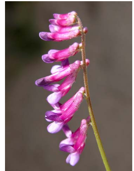
Winter Vetch Vicia villosa ssp. varia Introduced Annual-Biennial Pea Family