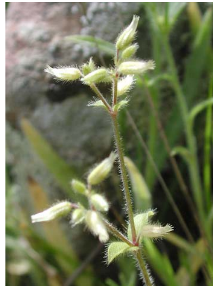
Mouse-ear Chickweed Cerastium glomeratum Introduced Annual Pink Family