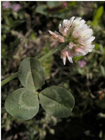
White Clover Trifolium repens Introduced Perennial Pea Family