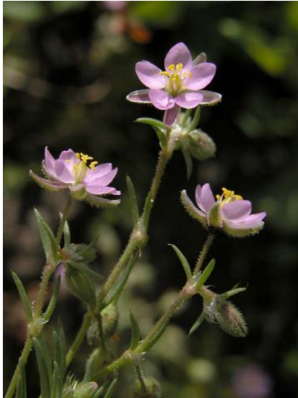
Ruby Sand Spurry Spergularia rubra Introduced Annual-Perennial Pink Family