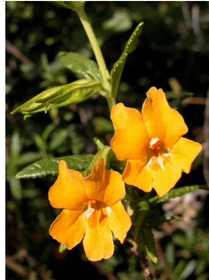
Bush Monkey Flower Mimulus aurantiacus Native Perennial Snapdragon Family