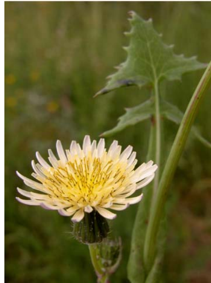
Common Sow Thistle Sonchus oleraceus Introduced Annual Sunflower Family