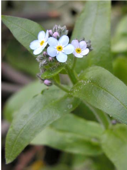
Forget-me-not Myosotis latifolia Introduced Perennial Borage Family