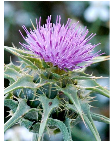
Milk Thistle Silybum marianum Introduced Annual-Biennial Sunflower Family