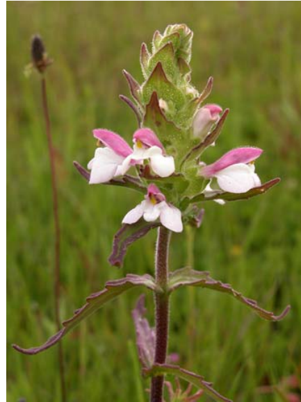
Bellardia Bellardia trixago Introduced Annual Snapdragon Family