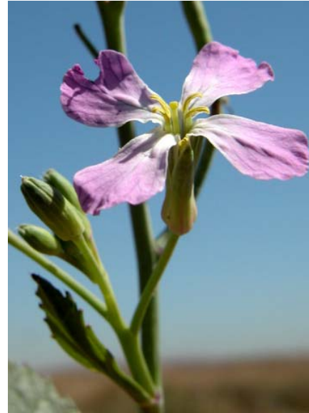
Wild Radish Raphanus sativus Introduced Annual Mustard Family