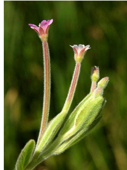
Common Willowherb Epilobium ciliatum ssp. ciliatum Native Perennial Evening Primrose Family