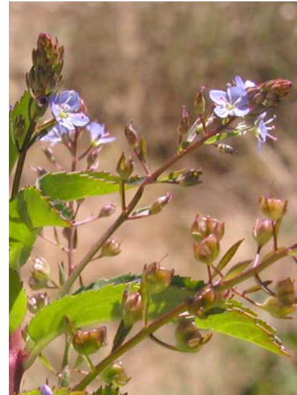
American Brooklime Speedwell Veronica americana Native Perennial Snapdragon Family