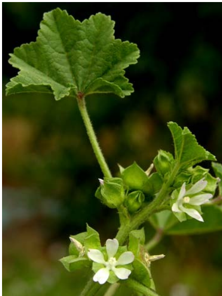
Hidden-flower Cheeseweed Malva parviflora Introduced Annual Mallow Family