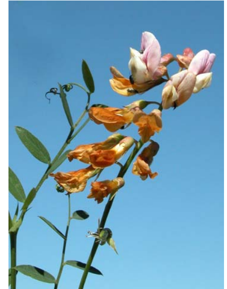
Pale Purple Pacific Pea Lathyrus vestitus var. vestitus Native Perennial Pea Family