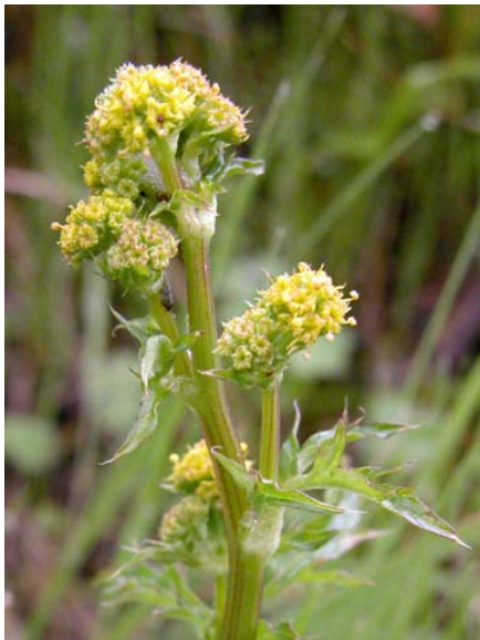
Pacific Woodland Sanicle Sanicula crassicaulis Native Perennial Carrot Family