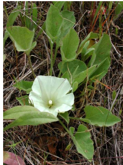
Shortstem Morning Glory Calystegia subacaulis ssp. subacaulis Native Perennial Morning-Glory Family