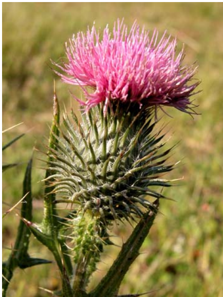
Bull Thistle Cirsium vulgare Introduced Biennial Sunflower Family