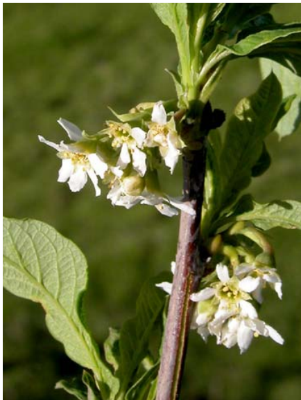
Oso Berry Oemleria cerasiformis Native Perennial Rose Family