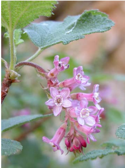
Chaparral Currant Ribes malvaceum var. malvaceum Native Perennial Gooseberry Family