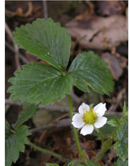
Woodland Strawberry Fragaria vesca Native Perennial Rose Family