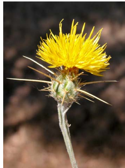
Yellow Star Thistle Centaurea solstitialis Introduced Annual Sunflower Family