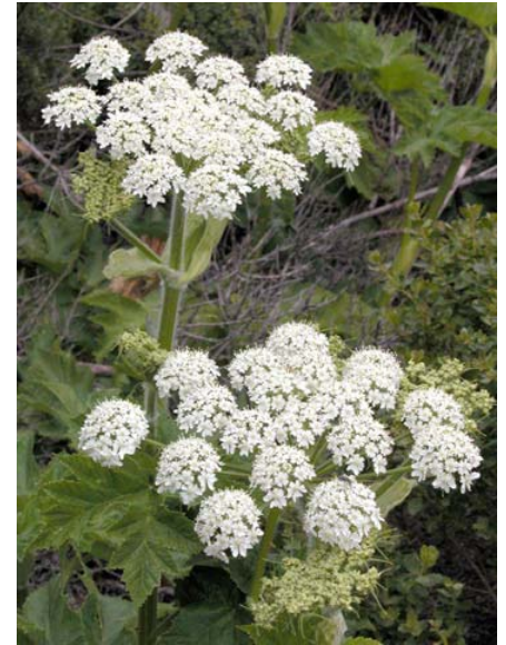
Cow Parsnip Heracleum lanatum Native Perennial Carrot Family