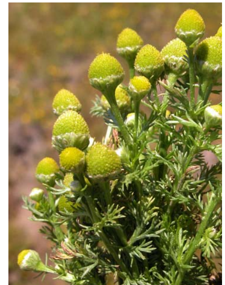
Pineapple Weed Chamomilla suaveolens Introduced Annual Sunflower Family