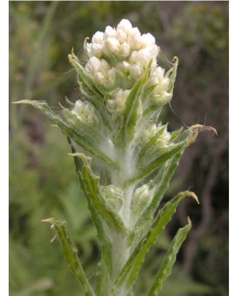
California Everlasting Gnaphalium californicum Native Biennial Sunflower Family