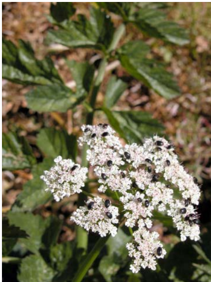
Pacific Water Parsley Oenanthe sarmentosa Native Perennial Carrot Family