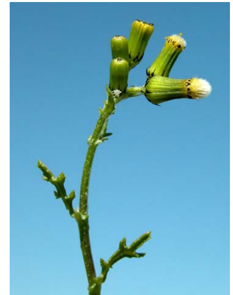
Common Groundsel Senecio vulgaris Introduced Annual Sunflower Family