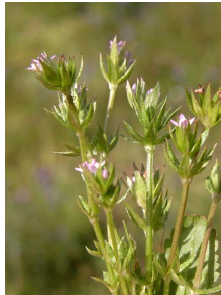
Blue Field Madder Sherardia arvensis Introduced Annual Madder Family