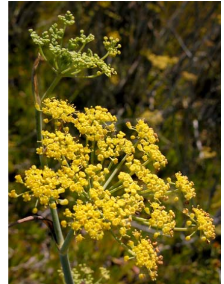
Sweet Fennel Foeniculum vulgare Introduced Perennial Carrot Family