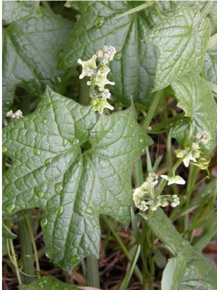
Common / California Manroot Marah fabaceus Native Perennial Gourd Family