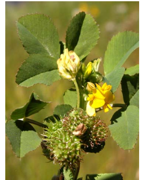
California Bur Clover Medicago polymorpha Introduced Annual Pea Family