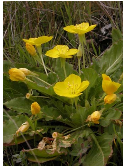
Golden Eggs Suncup Camissonia ovata Native Perennial Evening Primrose Family