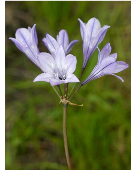
Ithuriel's Spear Triteleia laxa Native Perennial Lily Family