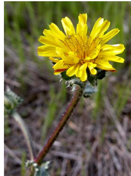
Bristly Ox-tongue Picris echioides Introduced Annual-Biennial Sunflower Family