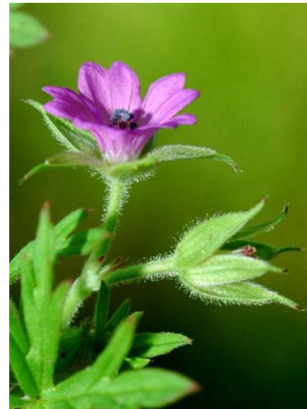
Purpletip Cut-leaf Geranium Geranium dissectum Introduced Annual Geranium Family