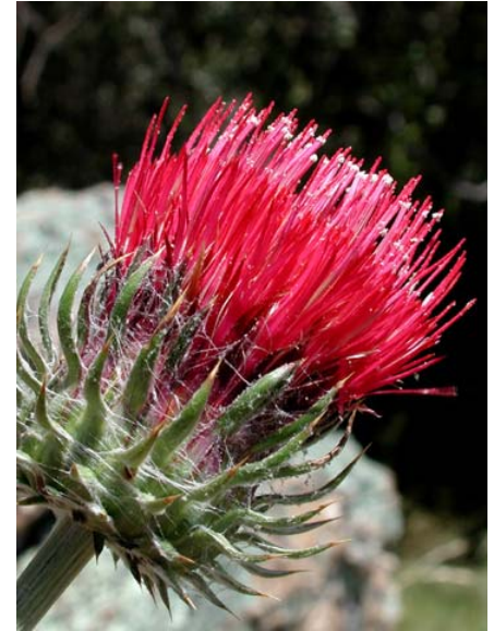
Venus / Cobweb Thistle Cirsium occidentale var. venustum Native Biennial Sunflower Family