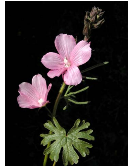
Common Checkerbloom Sidalcea malvaeflora ssp. malvaeflora Native Perennial Mallow Family