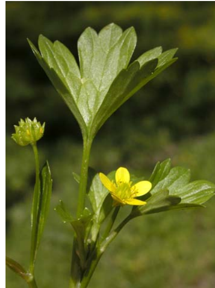
Prickleseed Buttercup Ranunculus muricatus Introduced Annual Buttercup Family