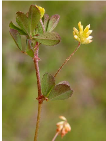
Shamrock Clover Trifolium dubium Introduced Annual Pea Family