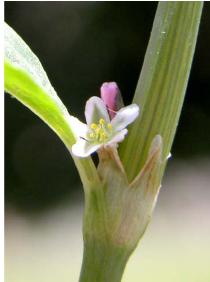
Common Yard Knotweed Polygonum arenastrum Introduced Annual Buckwheat Family