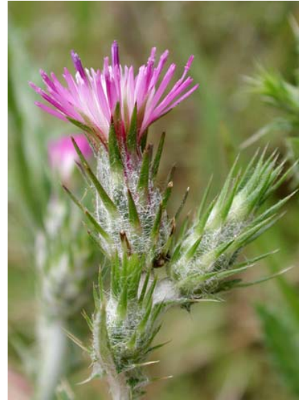
Italian Thistle Carduus pycnocephalus Introduced Annual Sunflower Family