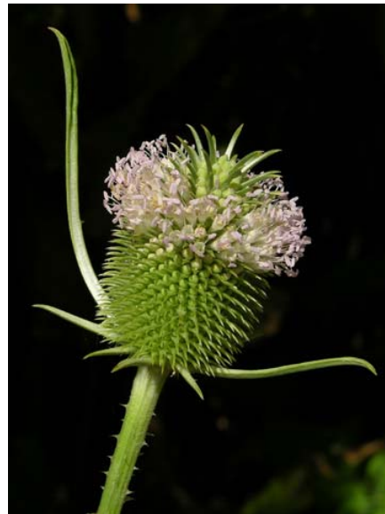
Wild Teasel Dipsacus sativus Introduced Biennial Teasel Family