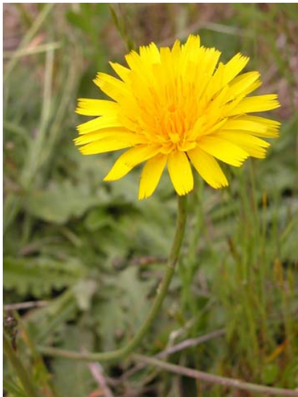
Rough Cat's-ear Hypochaeris radicata Introduced Perennial Sunflower Family