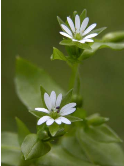
Common Chickweed Stellaria media Introduced Annual Pink Family