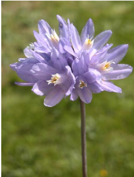
Blue Dicks Dichelostemma capitatum ssp. capitatum Native Perennial Lily Family