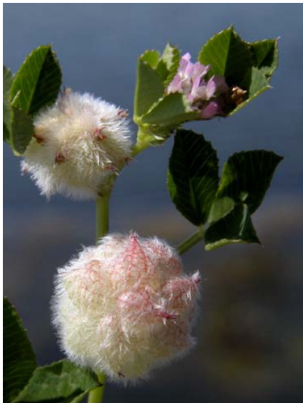
Strawberry Clover Trifolium fragiferum Introduced Perennial Pea Family