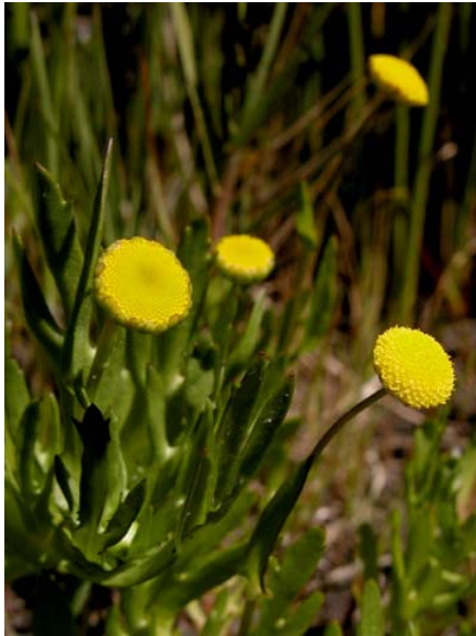
Brass Buttons Cotula coronopifolia Introduced Perennial Sunflower Family