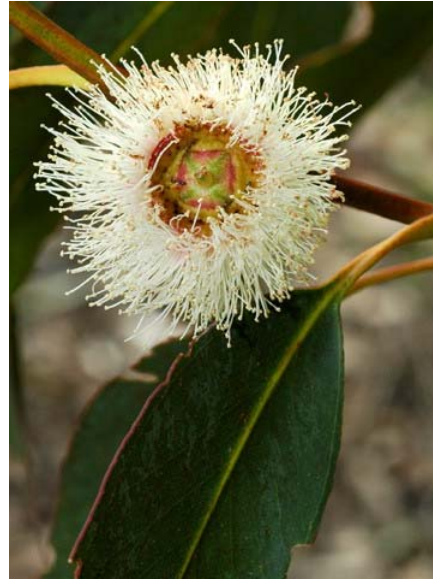
Blue Gum Eucalyptus globulus Introduced Perennial Myrtle Family