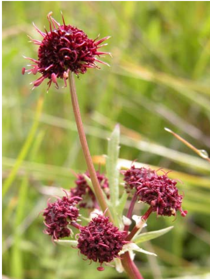
Purple Sanicle Sanicula bipinnatifida Native Perennial Carrot Family