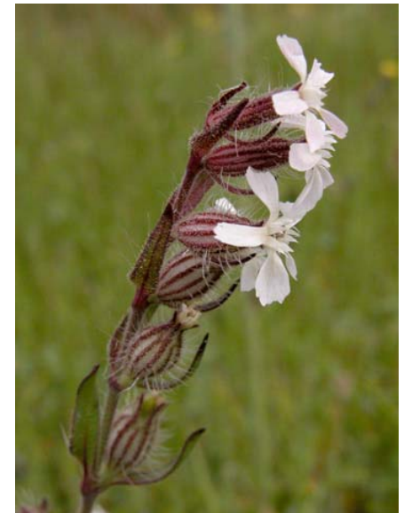
Windmill Pink Silene gallica Introduced Annual Pink Family