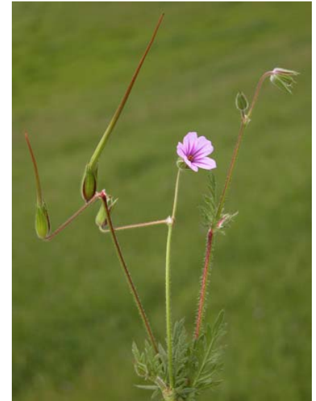
Long-beaked Filaree Erodium botrys Introduced Annual Geranium Family