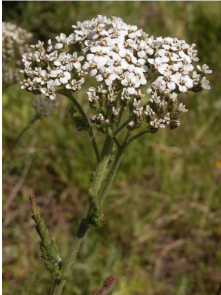
Yarrow Achillea millefolium Native Perennial Sunflower Family