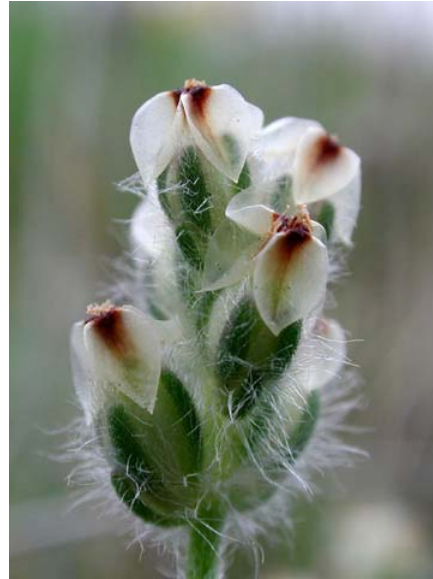
California Dwarf Plantain Plantago erecta Native Annual Plantain Family