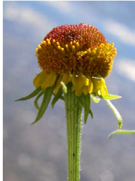
Rosilla Helenium puberulum Native Biennial Sunflower Family