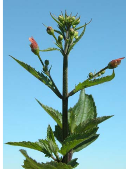
California Figwort Scrophularia californica ssp. californica Native Perennial Snapdragon Family