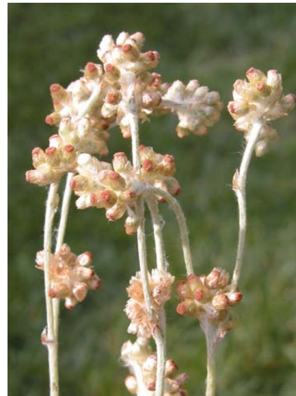
Weedy Cudweed Gnaphalium luteo-album Introduced Annual Sunflower Family