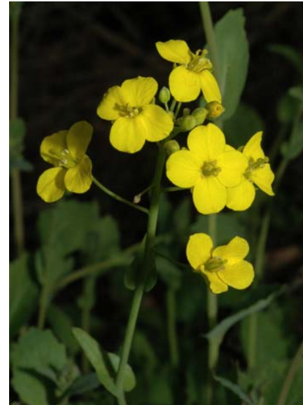
Yellow Field Mustard Brassica rapa Introduced Annual Mustard Family