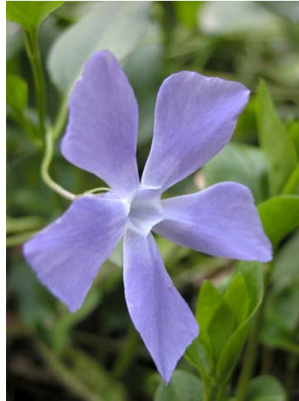
Greater Periwinkle Vinca major Introduced Perennial Dogbane Family