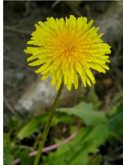
Common Dandelion Taraxacum officinale Introduced Biennial-Perennial Sunflower Family