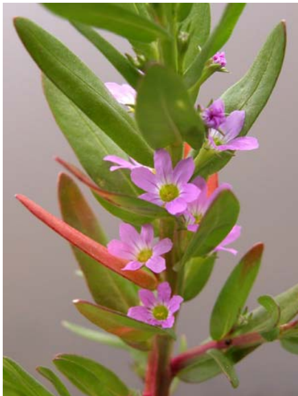
Grass Poly Loosetrife Lythrum hyssopifolium Introduced Annual-Perennial Loosetrife Family