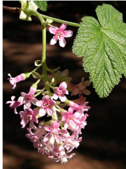
Flowering/Pinkflower Currant Ribes sanguineum var. glutinosum Native Perennial Gooseberry Family