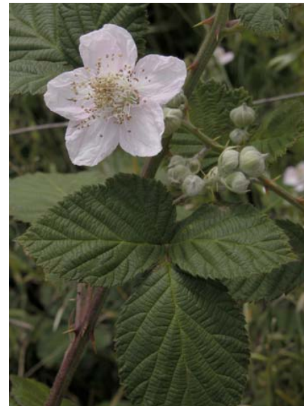
Himalayan Blackberry Rubus discolor Introduced Perennial Rose Family