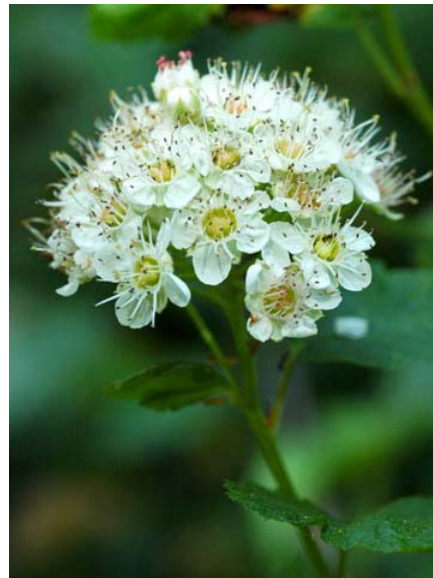
Pacific Ninebark Physocarpus capitatus Native Perennial Rose Family