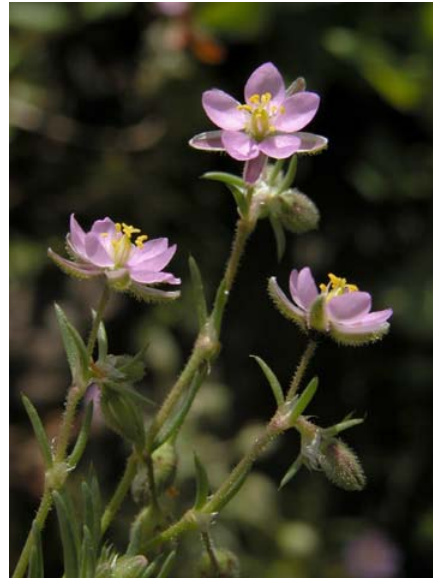
Ruby Sand Spurry Spergularia rubra Introduced Annual-Perennial Pink Family