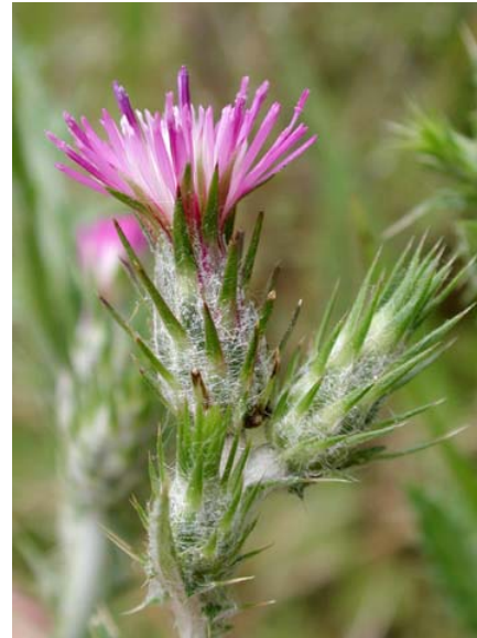
Italian Thistle Carduus pycnocephalus Introduced Annual Sunflower Family