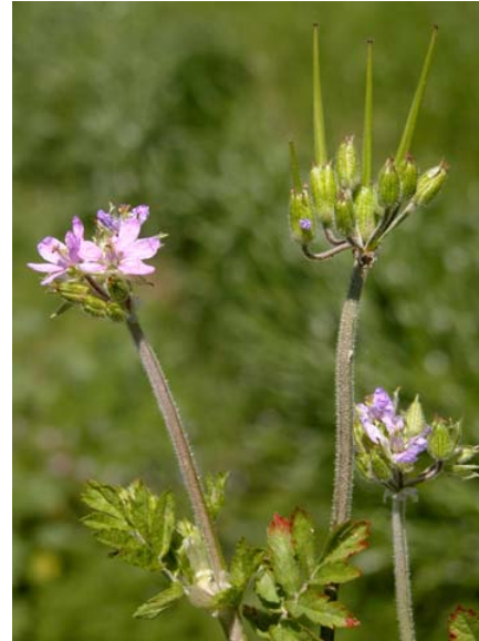
White-stem Filaree Erodium moschatum Introduced Annual Geranium Family