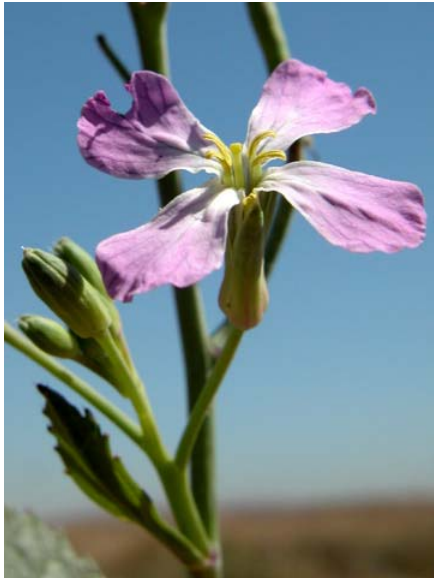
Wild Radish Raphanus sativus Introduced Annual Mustard Family