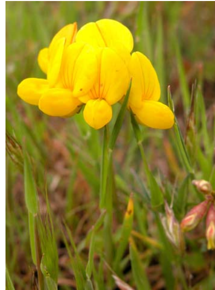
Bird's-foot Deerweed Lotus corniculatus Introduced Perennial Pea Family