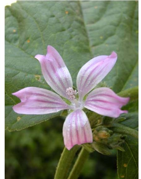
Bull Mallow Malva nicaeensis Introduced Annual Mallow Family