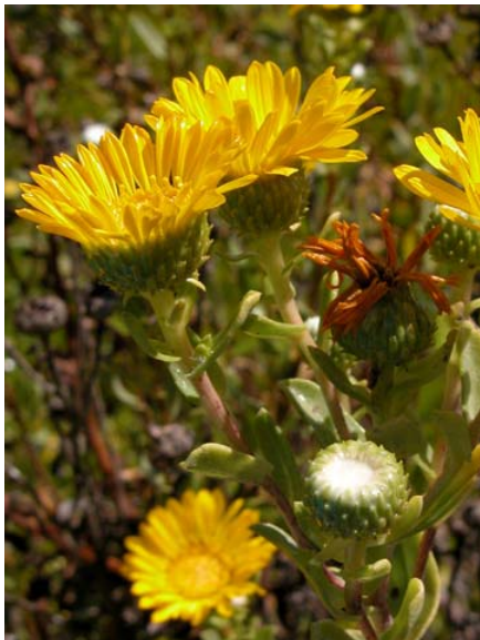
Narrowleaf Pacific Gumplant Grindelia stricta var. angustifolia Native Perennial Sunflower Family