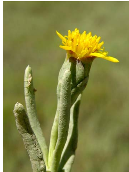
Fleshy Jaumea Jaumea carnosa Native Perennial Sunflower Family