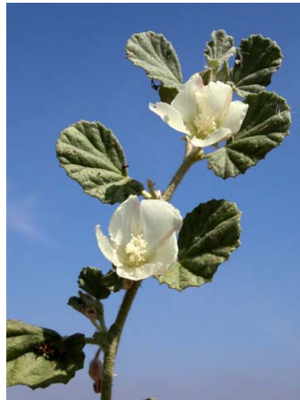
Alkali Mallow Malvella leprosa Native Perennial Mallow Family