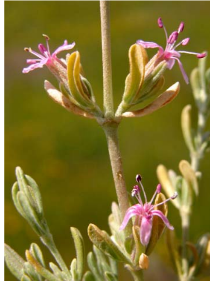
Alkali Heath Frankenia salina Native Perennial Frankenia Family