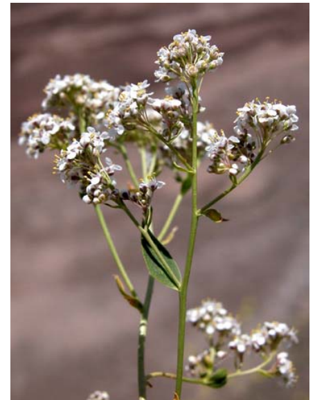
Slender Peren. Peppergrass Lepidium latifolium Introduced Perennial Mustard Family