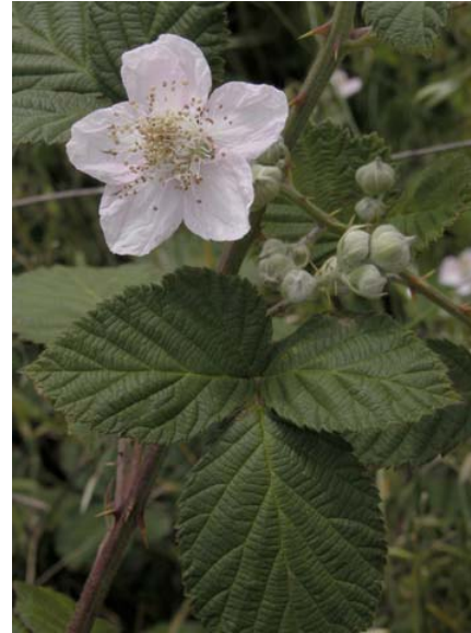
Himalayan Blackberry Rubus discolor Introduced Perennial Rose Family