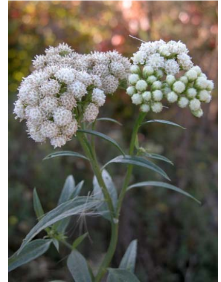
Douglas/Salt Marsh Baccharis Baccharis douglasii Native Perennial Sunflower Family