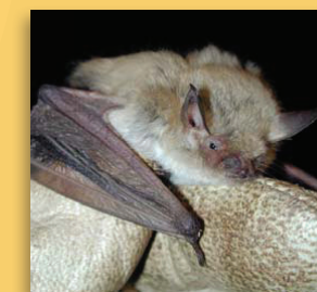
Figure 5. Yuma Myotis, Myotis yumanensis . The Mouse-Eared Bats, Myotis spp., are the most abundant genus of bats in EBRPD. Myotis species are difficult to distinguish; the Yuma Myotis and the California Myotis, M. californicus , are the two species identified in the study.