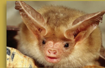
Figure 3. Pallid Bat, Antrozous pallidus , one of the two California Species of Special Concern present in the East Bay Regional Park District.

Because of their longevity and sensitivity to disturbances, bats are important indicators of ecological health (Loeb et al. 2015). District staff and volunteers will continue monitoring bat distribution and abundance within its land holdings.