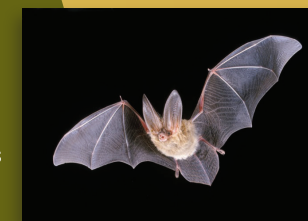
Figure 4. Townsend's Big-Eared Bat, Corynorhinus townsendii , a California Species of Special Concern found at one location in the study.