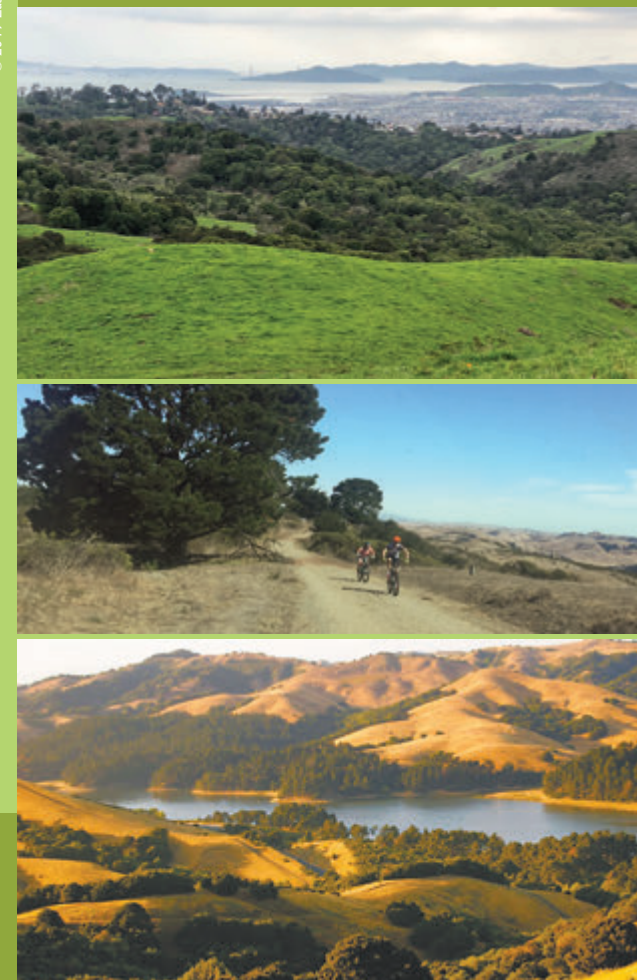
© 2019 East Bay Regional Park District