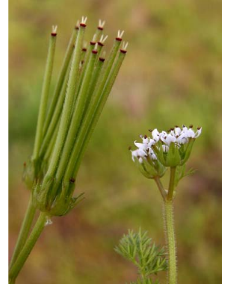
Shepherd's Needle Scandix pecten-veneris Introduced Annual Carrot Family