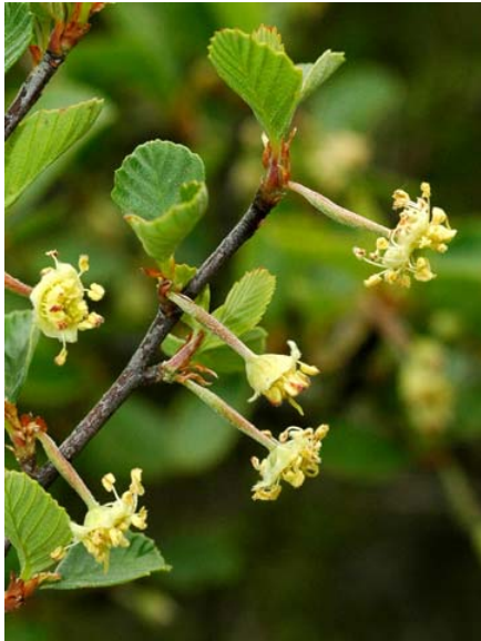
Birch-leaf Mt. Mahogany Cercocarpus betuloides var. betuloides Native Perennial Rose Family