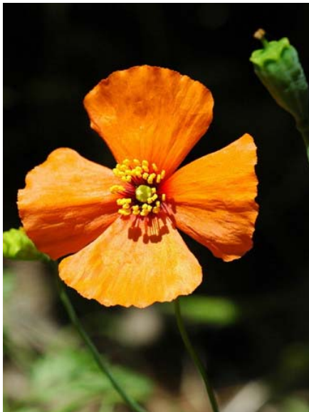
Wind Poppy Stylomecon heterophylla Native Annual Poppy Family