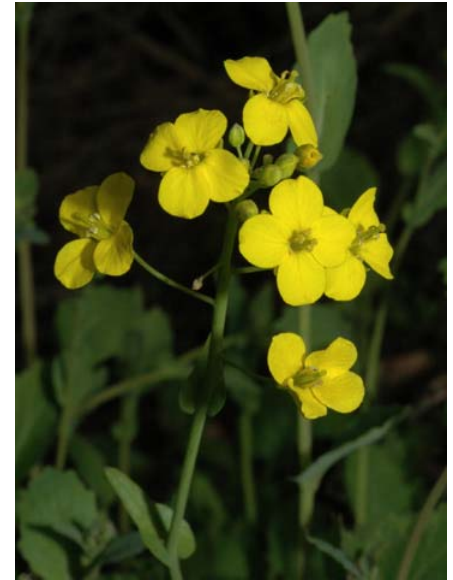
Yellow Field Mustard Brassica rapa Introduced Annual Mustard Family