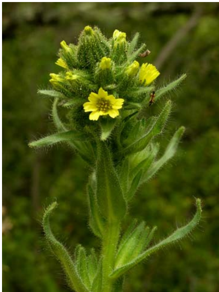
Common / Coast Tarweed Madia sativa Native Annual Sunflower Family