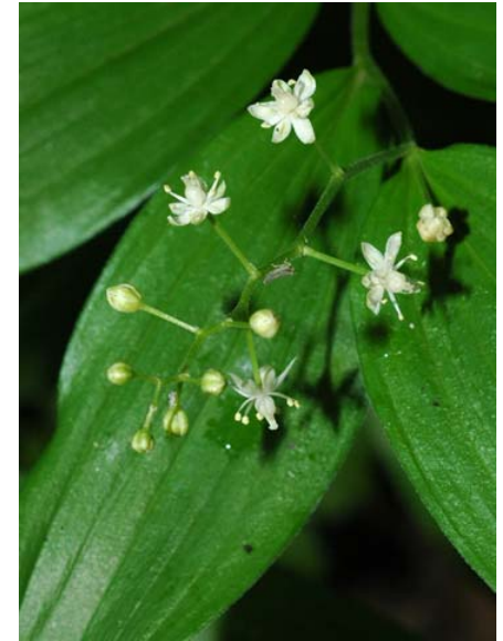
Starry False Solomon's Seal Smilacina stellata Native Perennial Lily Family