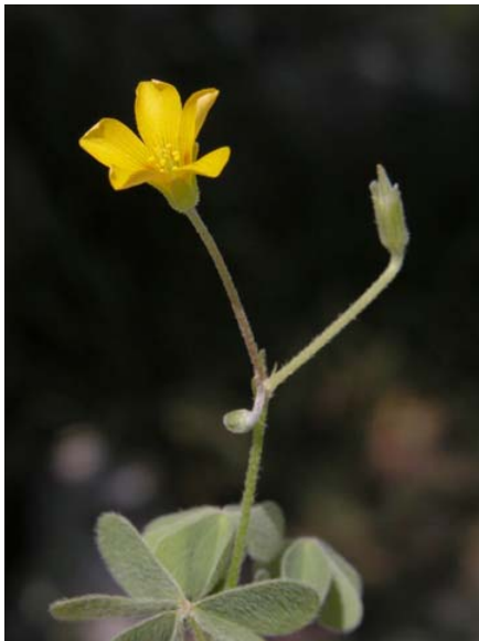
Creeping Wood Sorrel Oxalis corniculata Introduced Perennial Oxalis Family