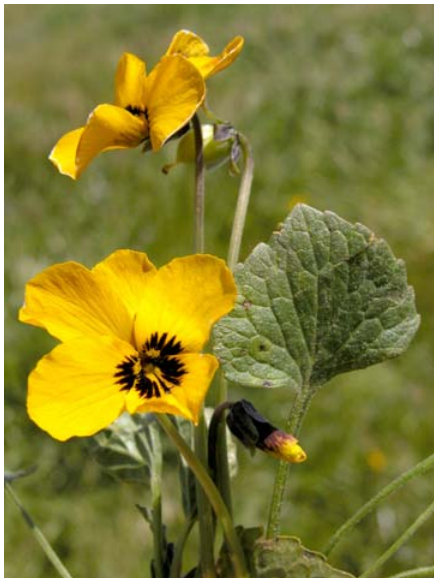
Johnny-Jump-Up / Wild Pansy Viola pedunculata Native Perennial Violet Family