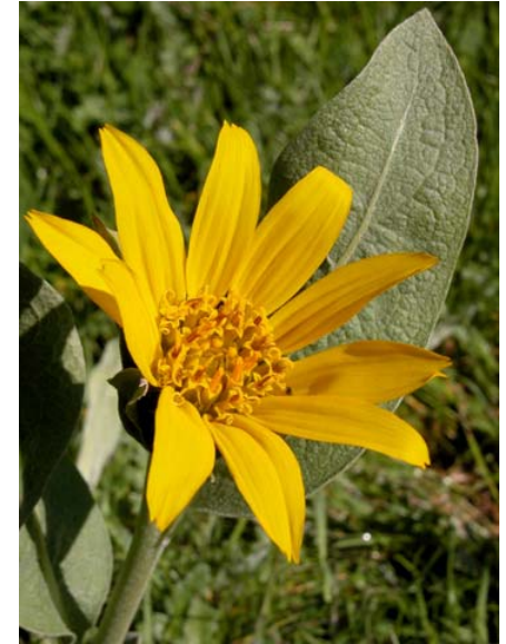
Gray Mule's Ear Wyethia helenioides Native Perennial Sunflower Family