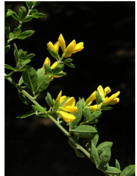
French Broom Genista monspessulana Introduced Perennial Pea Family