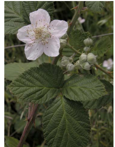
Himalayan Blackberry Rubus discolor Introduced Perennial Rose Family