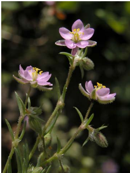
Ruby Sand Spurry Spergularia rubra Introduced Annual-Perennial Pink Family