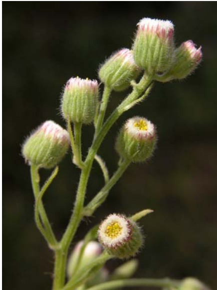
South American Horseweed Conyza bonariensis Introduced Annual Sunflower Family