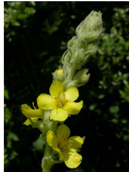
Common Woolly Mullein Verbascum thapsus Introduced Biennial Snapdragon Family