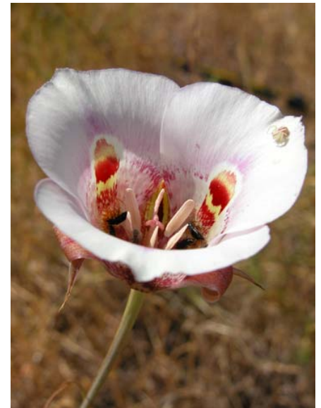
White Butterfly Mariposa Lily Calochortus venustus Native Perennial Lily Family