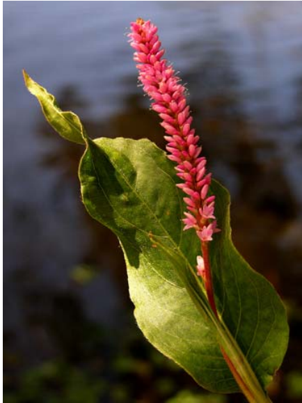
Swamp / Water Knotweed Polygonum amphibium var. emersum Native Perennial Buckwheat Family