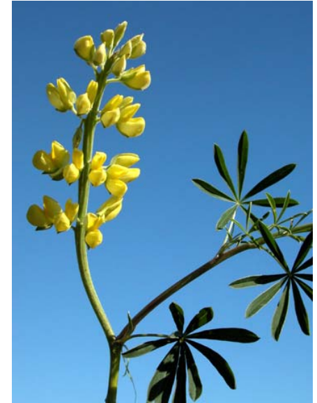
Yellow Bush Lupine Lupinus arboreus Native Perennial Pea Family