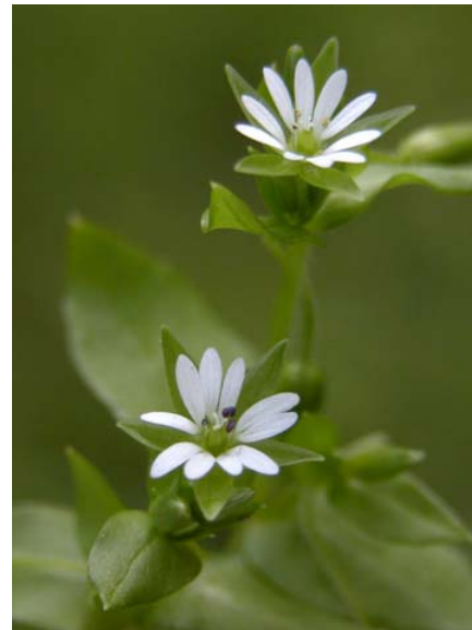
Common Chickweed Stellaria media Introduced Annual Pink Family