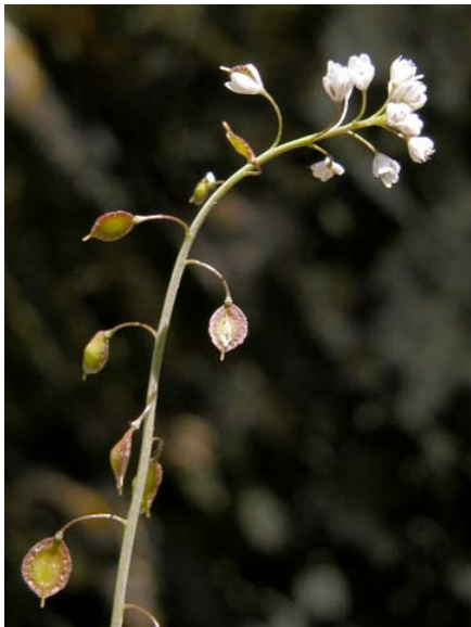
Hairy Fringepod Thysanocarpus curvipes Native Annual Mustard Family