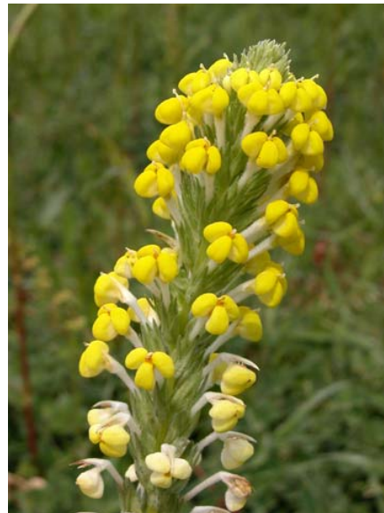
Yellow Johnny-tuck Triphysaria eriantha ssp. eriantha Native Annual Snapdragon Family