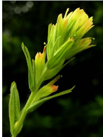
Seaside / Coastal Paintbrush Castilleja wightii Native Perennial Snapdragon Family