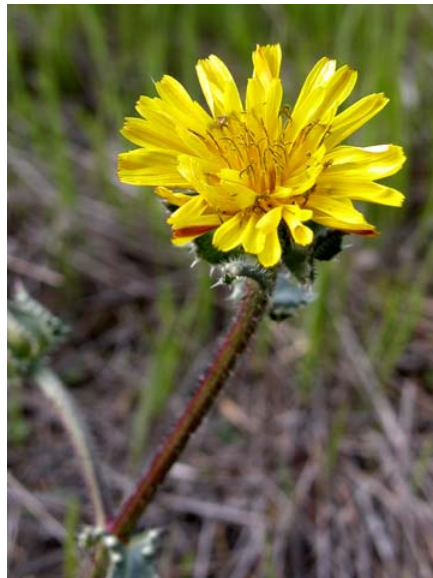
Bristly Ox-tongue Picris echioides Introduced Annual-Biennial Sunflower Family