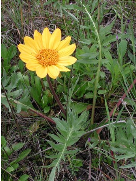
Bigscale Balsamroot Balsamorhiza macrolepis var. macrolepis Native Perennial Sunflower Family