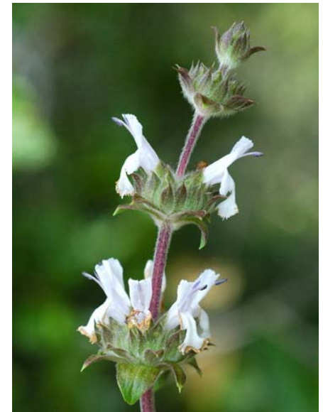
Black Sage Salvia mellifera Native Perennial Mint Family