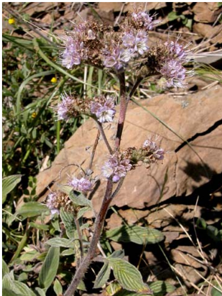
California / Rock Phacelia Phacelia californica Native Perennial Waterleaf Family