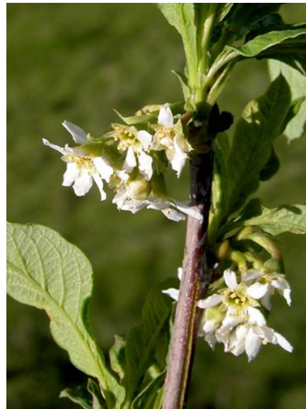
Oso Berry Oemleria cerasiformis Native Perennial Rose Family