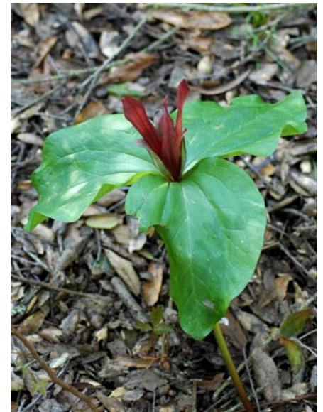
Giant Trillium Trillium chloropetalum Native Perennial Lily Family