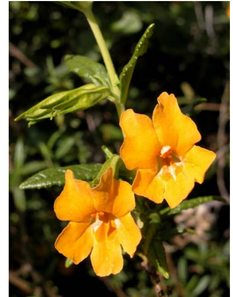
Bush Monkey Flower Mimulus aurantiacus Native Perennial Snapdragon Family