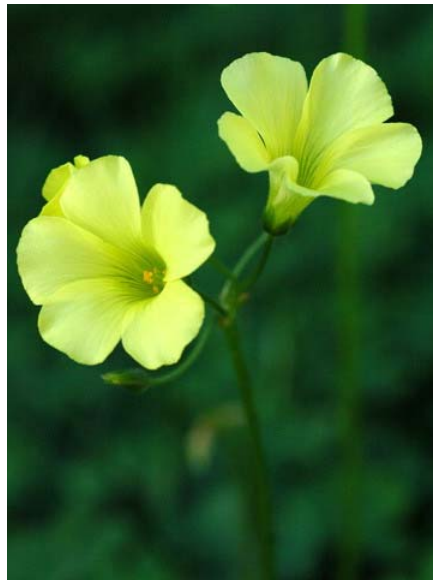
Bermuda Buttercup Oxalis pes-caprae Introduced Perennial Oxalis Family