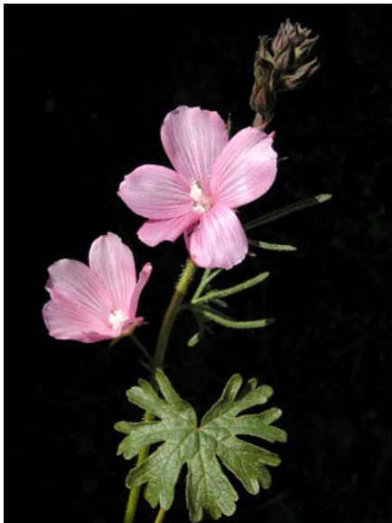
Common Checkerbloom Sidalcea malvaeflora ssp. malvaeflora Native Perennial Mallow Family