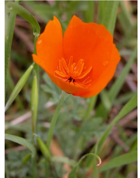
California Poppy Eschscholzia californica Native Perennial Poppy Family