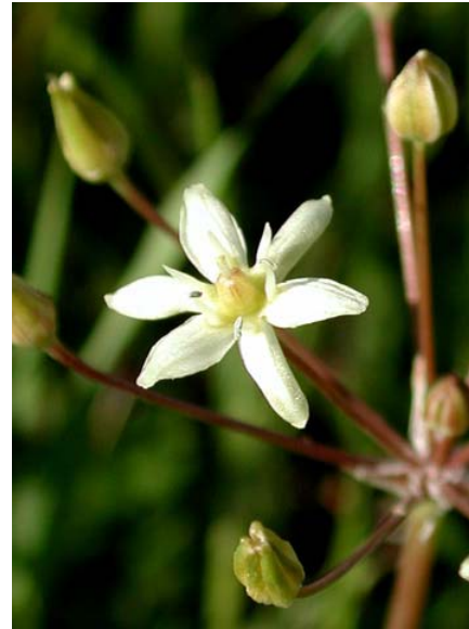
Common Muilla Muilla maritima Native Perennial Lily Family