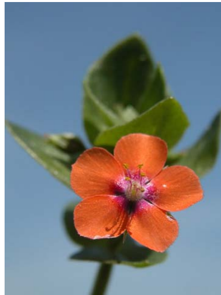
Scarlet Pimpernel Anagallis arvensis Introduced Annual Primrose Family