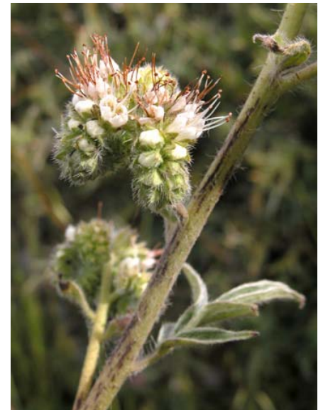
Rock Phacelia Phacelia imbricata ssp. imbricata Native Perennial Waterleaf Family