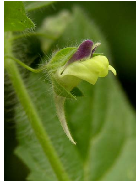
Sharp Point Fluellin Kickxia elatine Introduced Annual Snapdragon Family