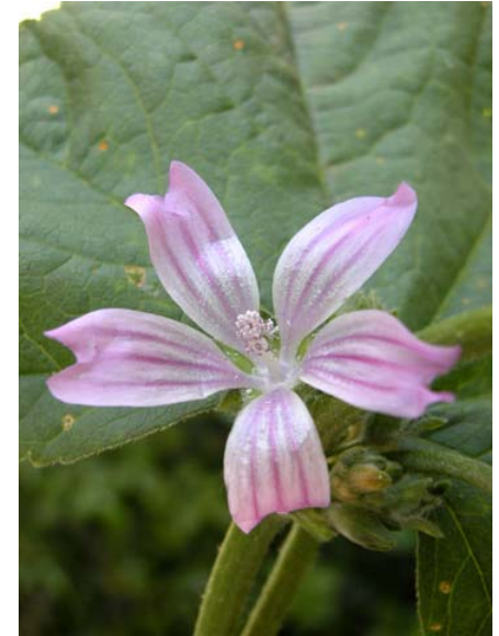
Bull Mallow Malva nicaeensis Introduced Annual Mallow Family