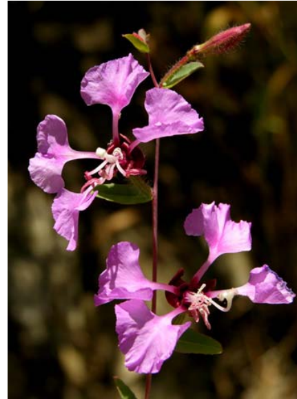
Elegant Clarkia Clarkia unguiculata Native Annual Evening Primrose Family