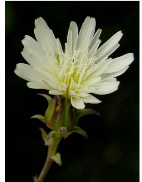
California White Chicory Rafinesquia californica Native Annual Sunflower Family