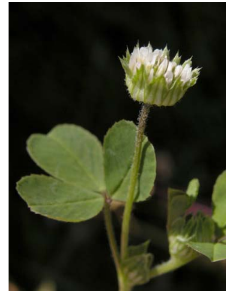
Thimble Clover Trifolium microdon Native Annual Pea Family