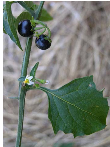
Small-flower Nightshade Solanum americanum Native Annual-Perennial Nightshade Family