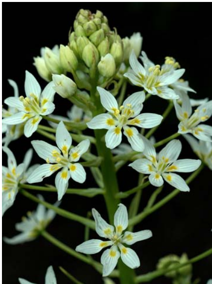
Common Star Lily Zigadenus fremontii Native Perennial Lily Family