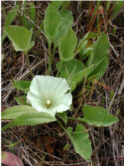
Shortstem Morning Glory Calystegia subacaulis ssp. subacaulis Native Perennial Morning-Glory Family