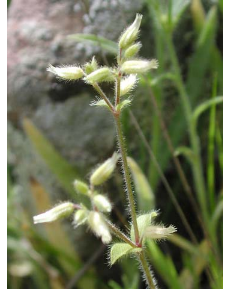
Mouse-ear Chickweed Cerastium glomeratum Introduced Annual Pink Family