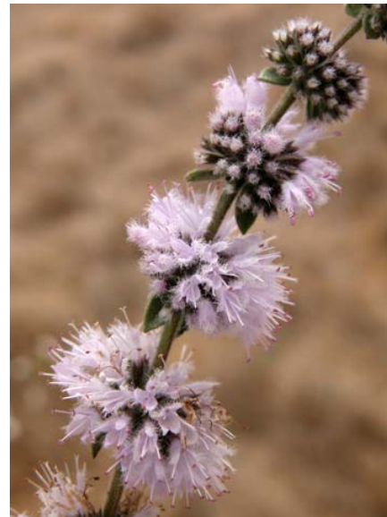
Pennyroyal Mentha pulegium Introduced Perennial Mint Family