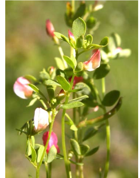
Spanish Clover Lotus purshianus var. purshianus Native Annual Pea Family