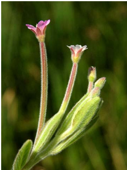
Common Willowherb Epilobium ciliatum ssp. ciliatum Native Perennial Evening Primrose Family