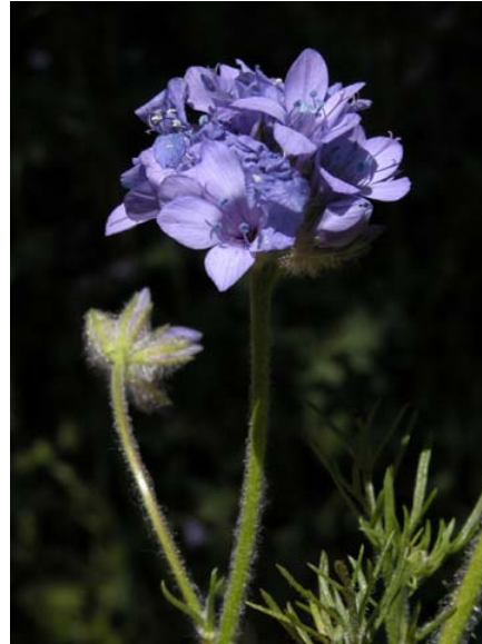
California Blue Gilia Gilia achilleifolia ssp. achilleifolia Native Annual Phlox Family