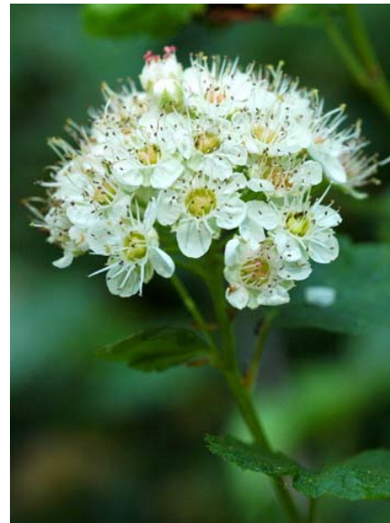
Pacific Ninebark Physocarpus capitatus Native Perennial Rose Family