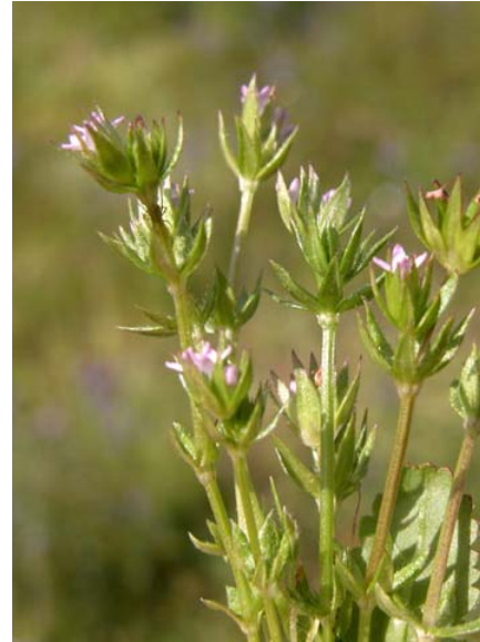
Blue Field Madder Sherardia arvensis Introduced Annual Madder Family