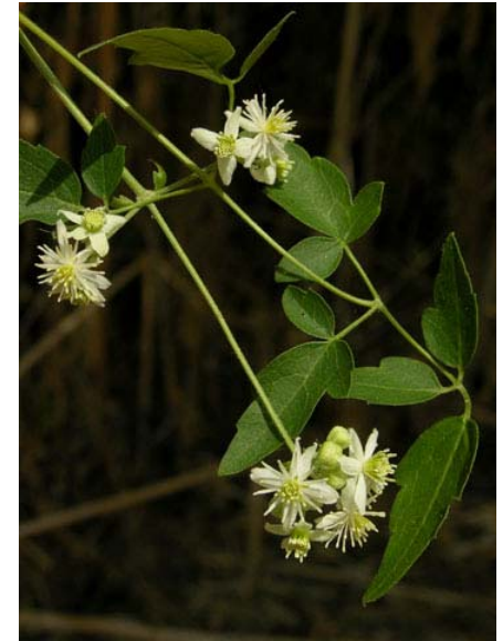
Western Virgin's Bower Clematis ligusticifolia Native Perennial Buttercup Family