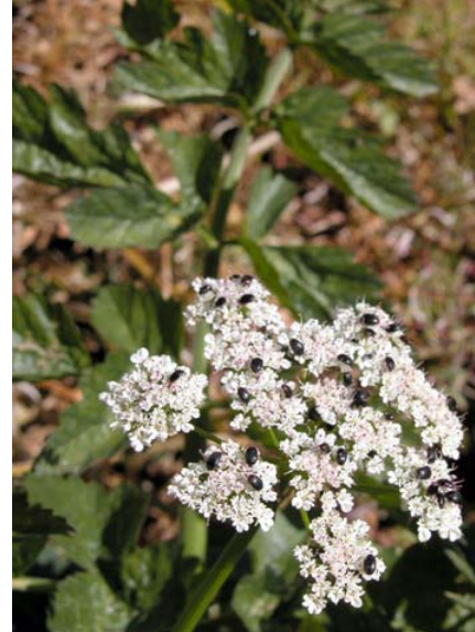
Pacific Water Parsley Oenanthe sarmentosa Native Perennial Carrot Family