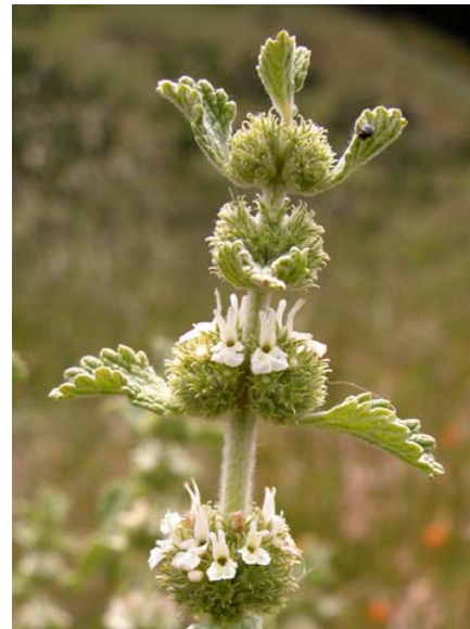
Common Horehound Marrubium vulgare Introduced Perennial Mint Family