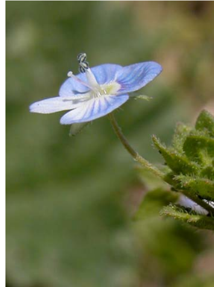
Persian Speedwell Veronica persica Introduced Annual Snapdragon Family