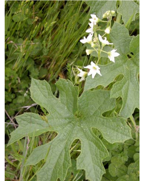
Oregon / Coast Manroot Marah oregonus Native Perennial Gourd Family