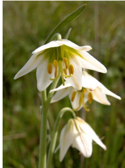
Fragrant White Fritillary Fritillaria liliacea Native Perennial Lily Family