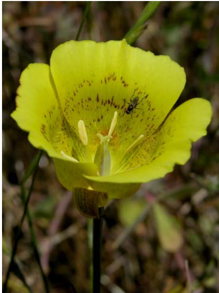
Yellow Mariposa Lily Calochortus luteus Native Perennial Lily Family