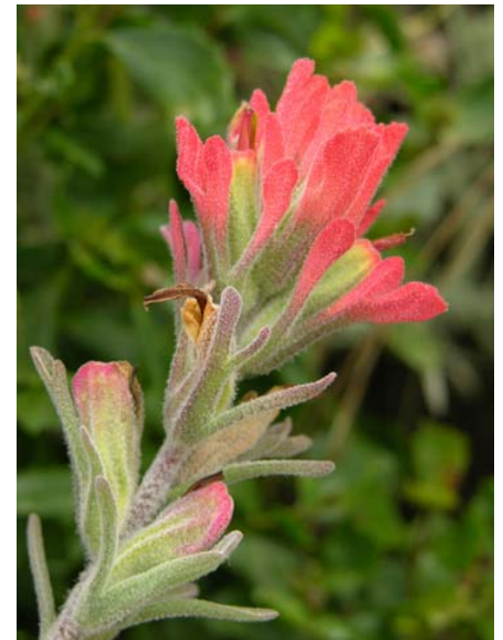
Woolly Paintbrush Castilleja foliolosa Native Perennial Snapdragon Family