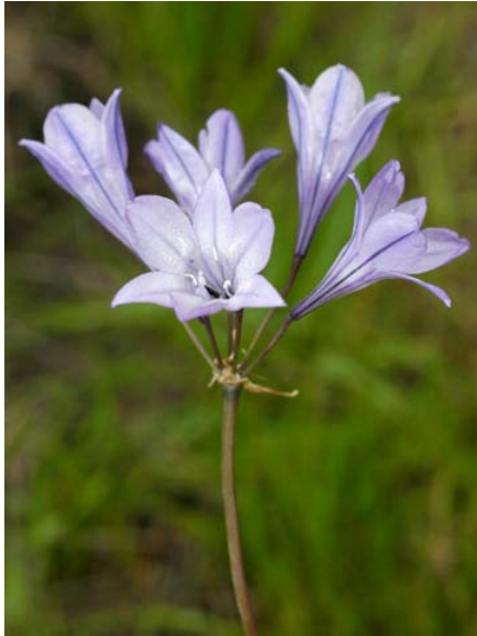
Ithuriel's Spear Triteleia laxa Native Perennial Lily Family