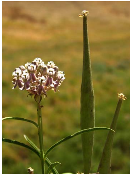
Whorled/Narrow-leaf Milkweed Asclepias fascicularis Native Perennial Milkweed Family