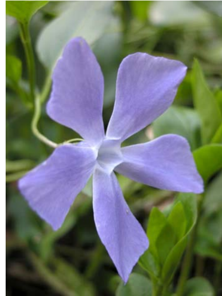
Greater Periwinkle Vinca major Introduced Perennial Dogbane Family