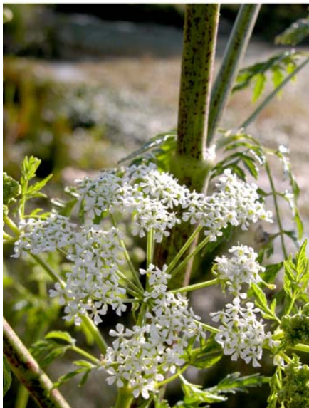
Poison Hemlock Conium maculatum Introduced Biennial Carrot Family