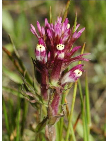
Common Owl's Clover Castilleja densiflora ssp. densiflora Native Annual Snapdragon Family