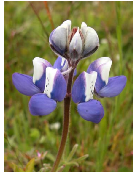
Douglas Sky Lupine Lupinus nanus Native Annual Pea Family