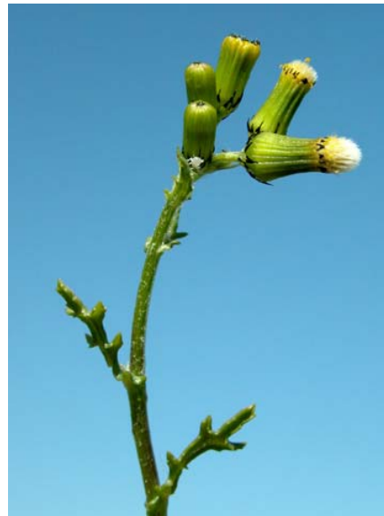
Common Groundsel Senecio vulgaris Introduced Annual Sunflower Family