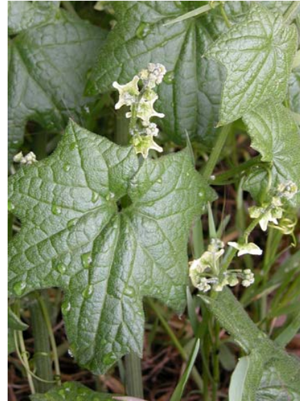
Common / California Manroot Marah fabaceus Native Perennial Gourd Family