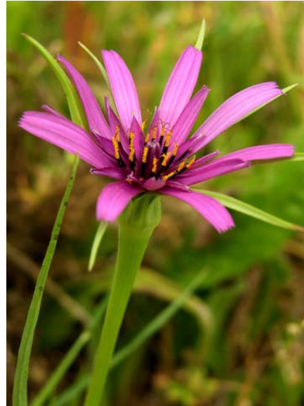
Purple Salsify Tragopogon porrifolius Introduced Biennial-Perennial Sunflower Family