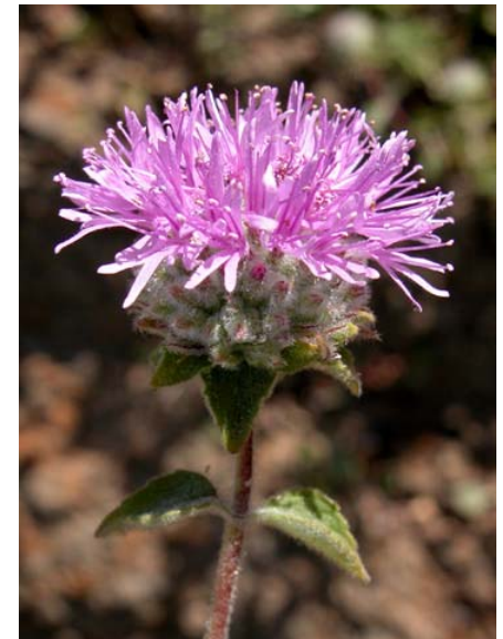
Common Coyotemint Monardella villosa ssp. villosa Native Perennial Mint Family