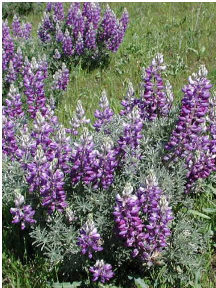
Blue Bush / Silver Lupine Lupinus albus var. albus Native Perennial Pea Family