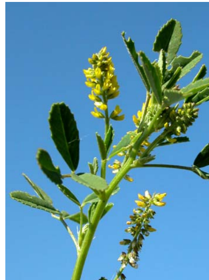
Sour Clover Melilotus indica Introduced Annual-Biennial Pea Family