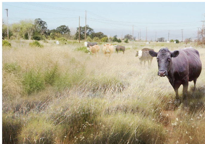
Grazing will continue as a land management practice at the park. Many miles of existing roadway and development will be restored to grassland.

Land Use Plan subject to change based on site conditions and natural and cultural resource constraints.