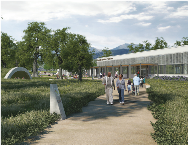
A former shop and warehouse building will be reused as a visitor center for the East Bay Regional Park and Port Chicago Naval Magazine National Memorial.

The CNWS emerged as a prominent part of the East Bay landscape, offering striking grassland and hillside views while contributing to a substantial network of undeveloped open space. CNWS was approved for closure by the Base Realignment and Closure Commission (BRAC) in 2005. In 2012, the Concord City Council adopted the Concord Reuse Project Area Plan, and designated the western slopes of the Los Medanos Hills and the adjacent area as the future regional park site. In October 2019, the East Bay Regional Park District released a Land Use Plan and an Environmental Impact Report to begin the adoption process and to start building a future regional park on over 2,500 acres, in partnership with the National Park Service, through a Public Benefit Conveyance.