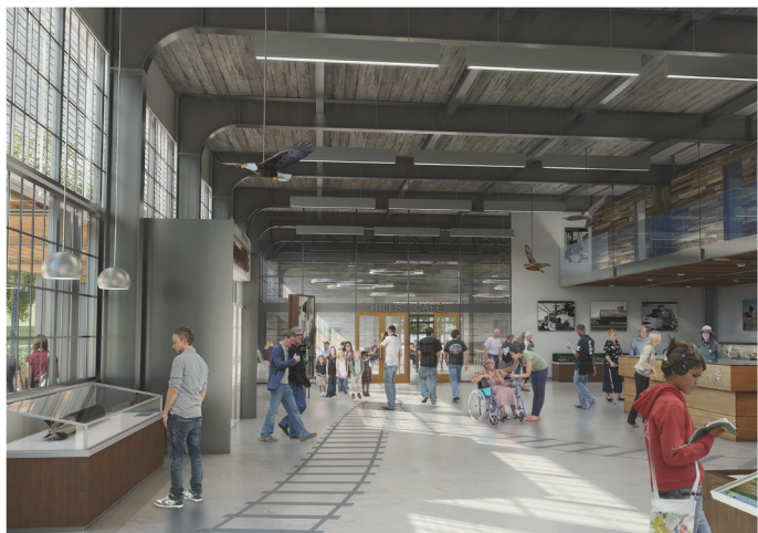
A visitor center located at the heart of the park and interpretive features throughout the park will tell the history of the site and the people who lived, worked, and impacted by actions there.