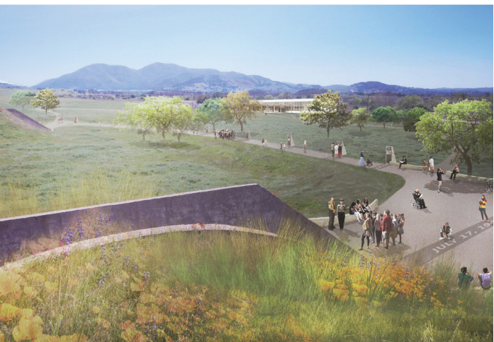
Some existing weapons magazines will be retained at the park for interpretive and recreational uses.