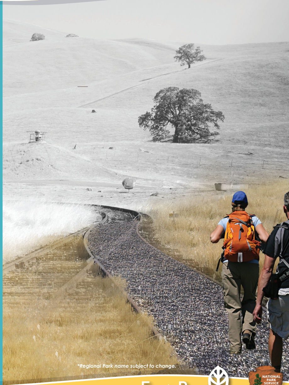
*Regional Park name subject to change.

more information at : http://www.ebparks.org/cnws