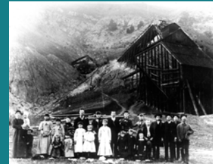
Miners and families at the Central Mine, Stewartville, date unknown.