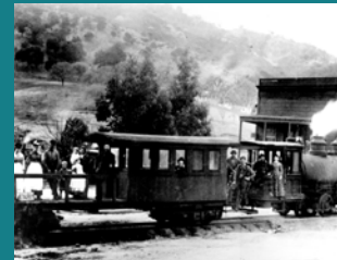
Empire Railroad at General Store, Stewartville (date unknown)