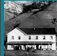
Stewartville Hotel, June 9, 1889