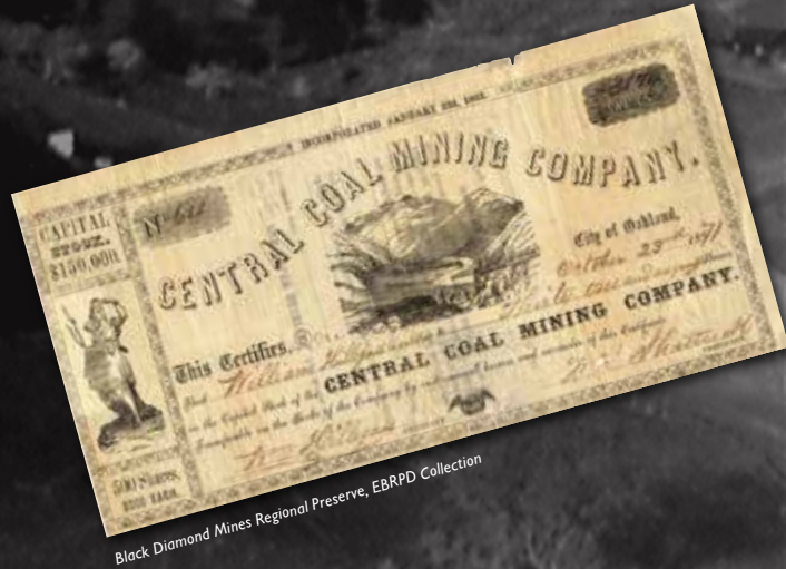
Black Diamond Mines Regional Preserve

The main entry to the mine was at the top of this waste pile. The entry tunnel was driven approximately 2,000 feet through the ridge, to save more than two miles of horse and wagon haulage to Antioch. Later, a branch of the Empire Mine Railroad was run to Stewartville and cartage became unnecessary.