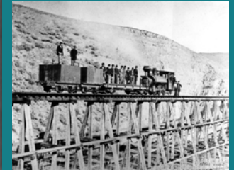
Empire Railroad on trestle, circa 1875.